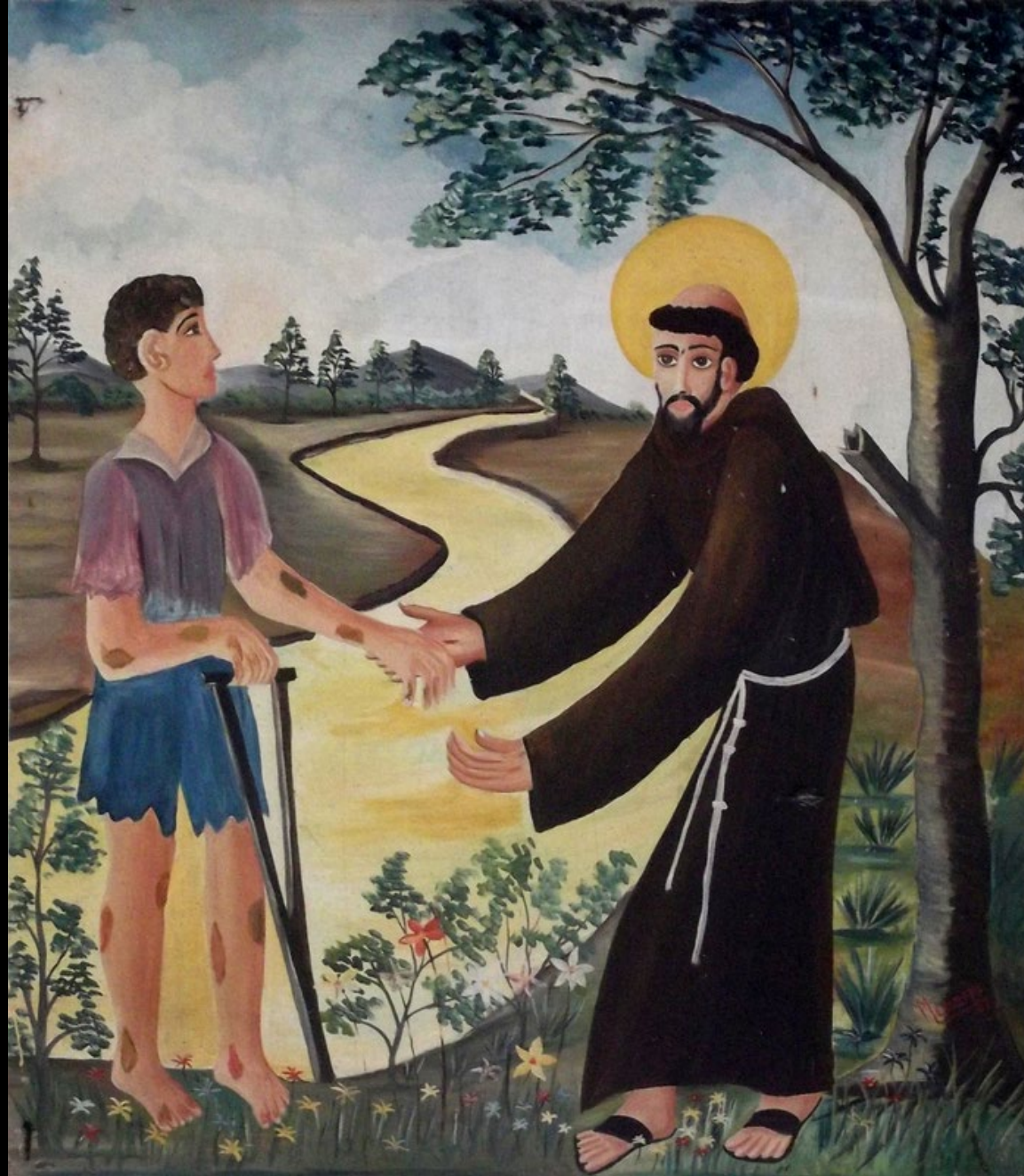
Priest reaching out to help a man with leprosy, Basílica de São Francisco das Chagas, 20 th century