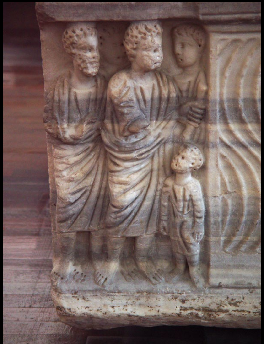
Christ in the Act of Healing Vatican City, 3 rd -4 th centuries