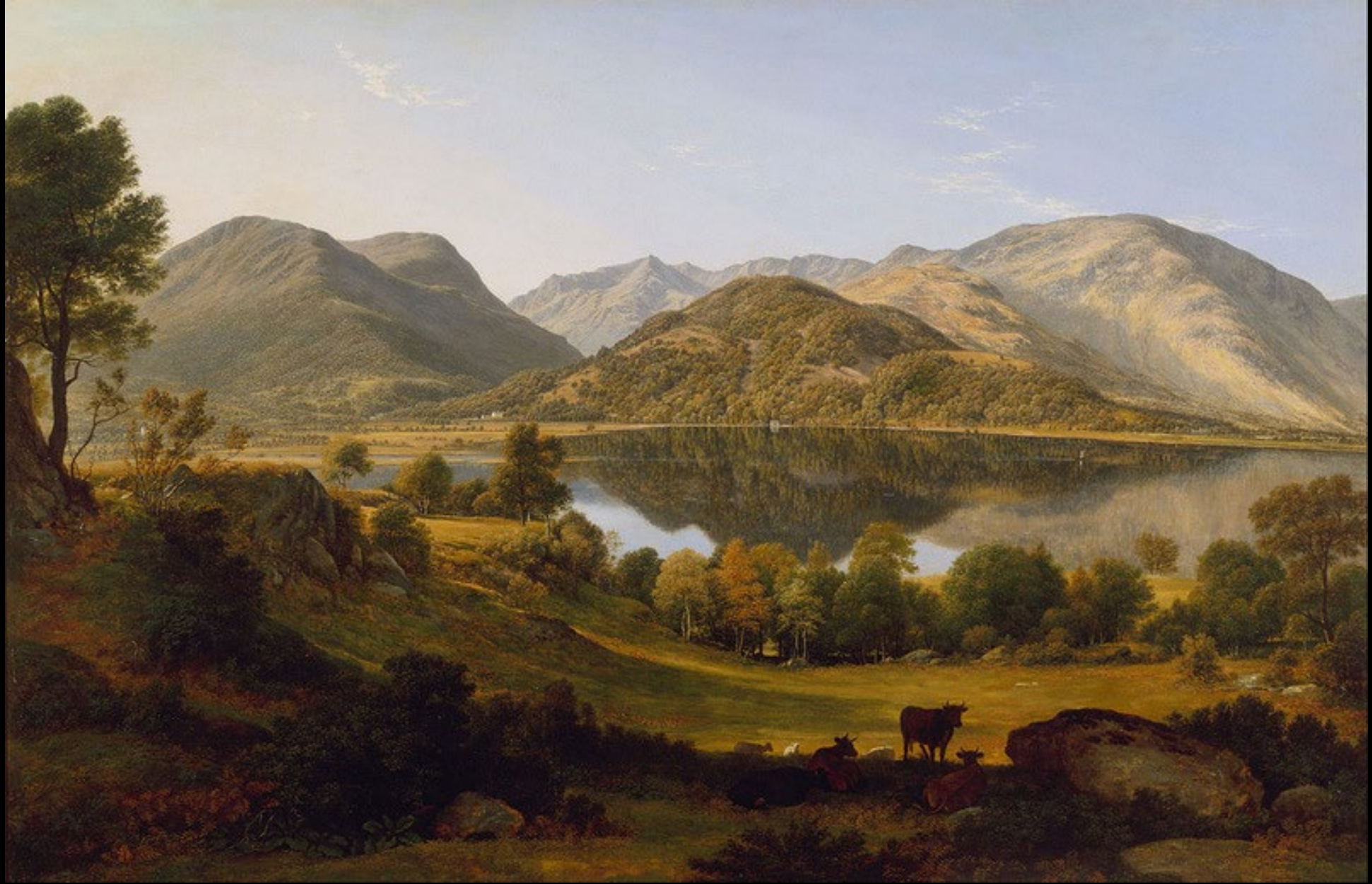
Ullswater, early morning, John Glover, ca. 1824