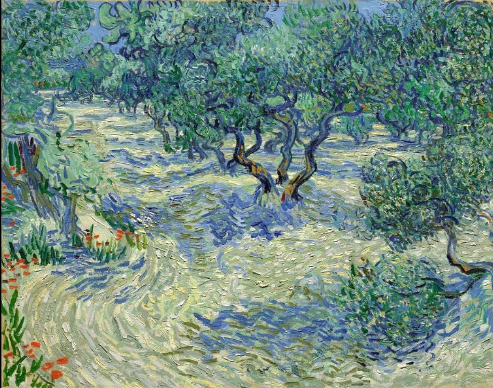
Olive Orchard -- Vincent van Gogh, Nelson-Atkins Museum of Art, Kansas City, MO