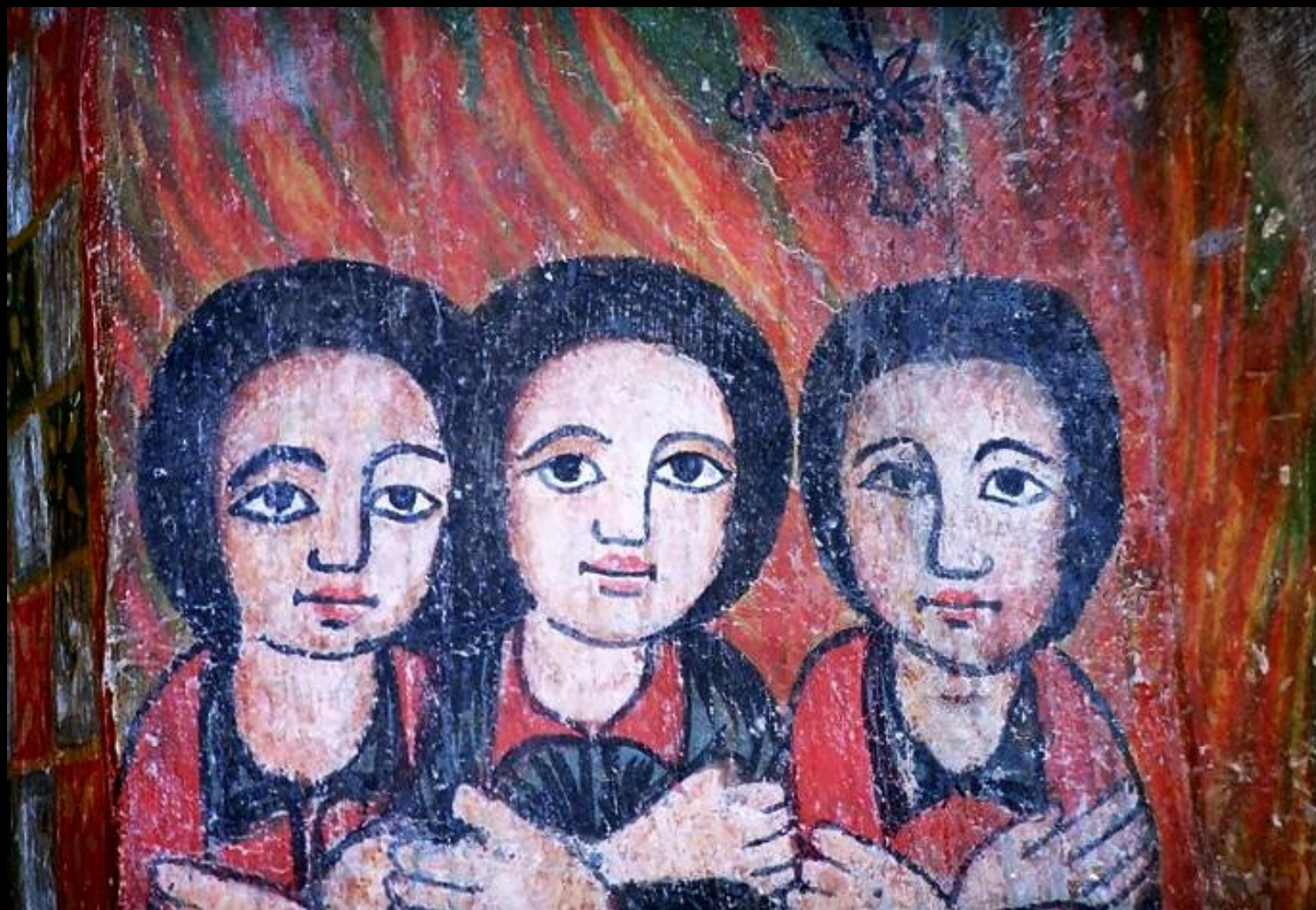
Three Women Praying -- Church of Gondar, Ethiopia