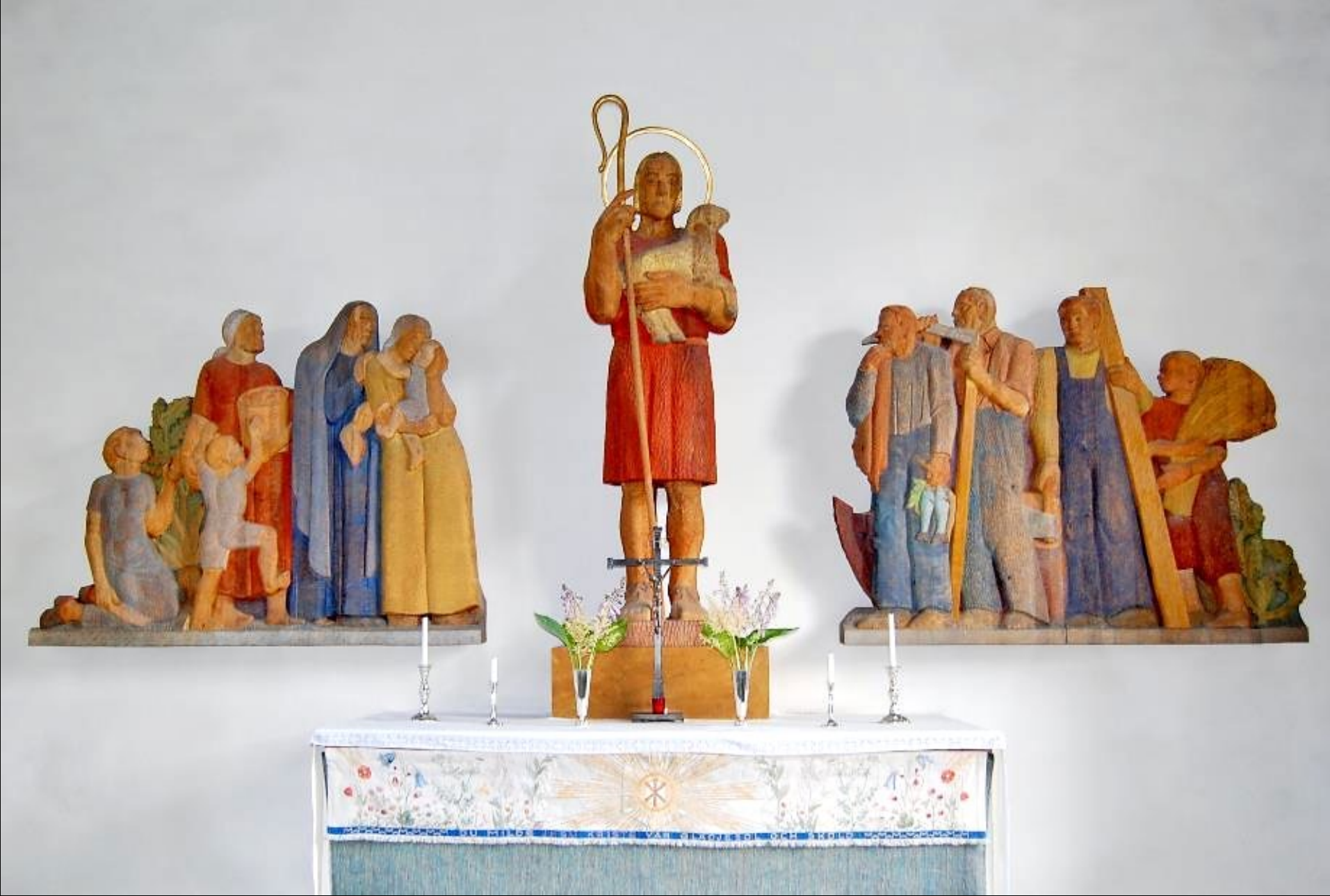
The Good Shepherd -- Gunnar Torhamn, Soderakra Church, Sweden