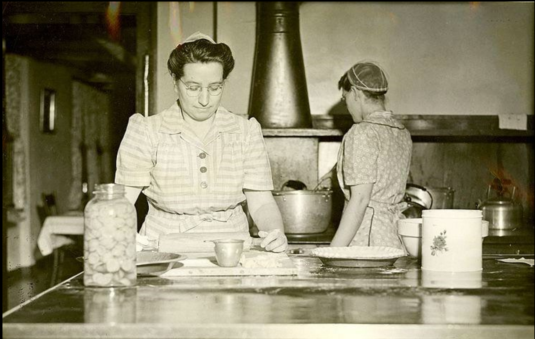
Mennonite Voluntary Service members helping in the Home for the Aged -- Eureka, IL