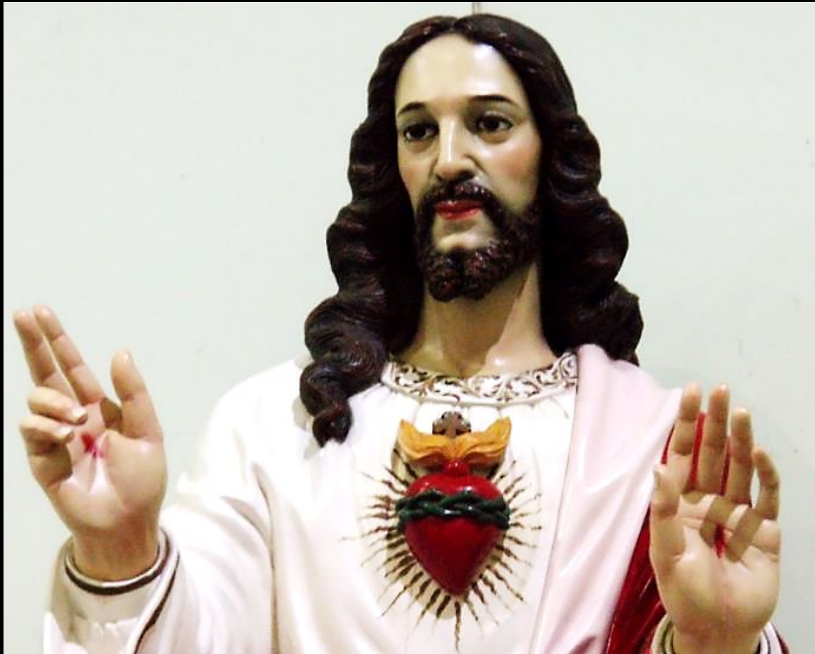
Jesus Christ of the Sacred Heart -- Philippines