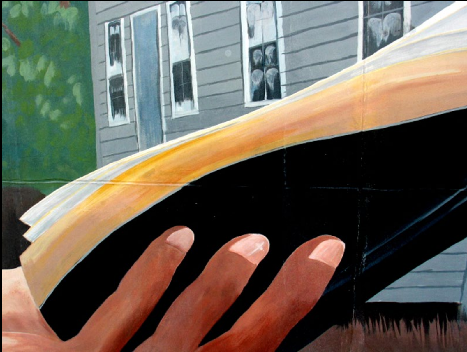
Detail, Billy Graham Preaching from the Bible -- Florida Bible Institute, Palatka, FL