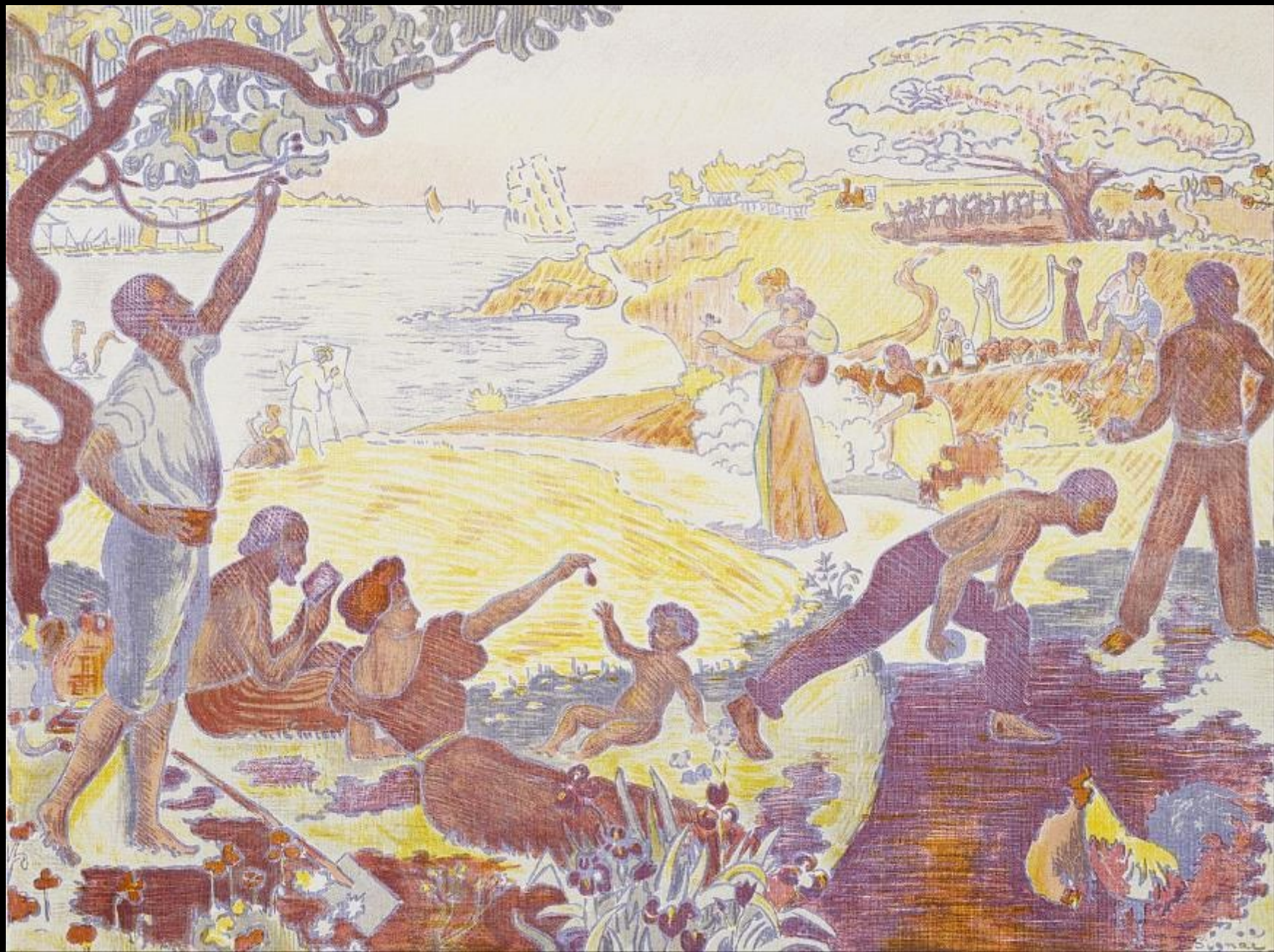
The Joy of Life -- Paul Signac, Museum of Fine Arts, Houston, TX