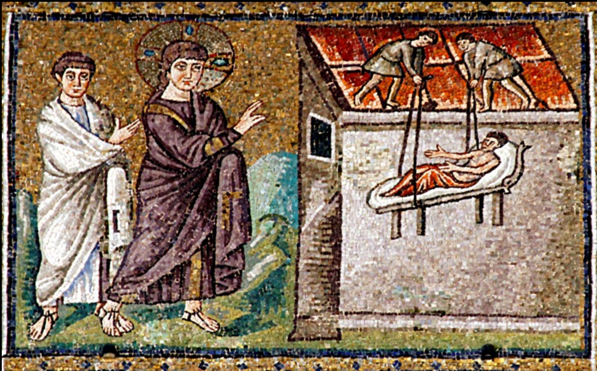
Jesus Healing the Paralytic, Sant'Apollinare Nuovo, 504