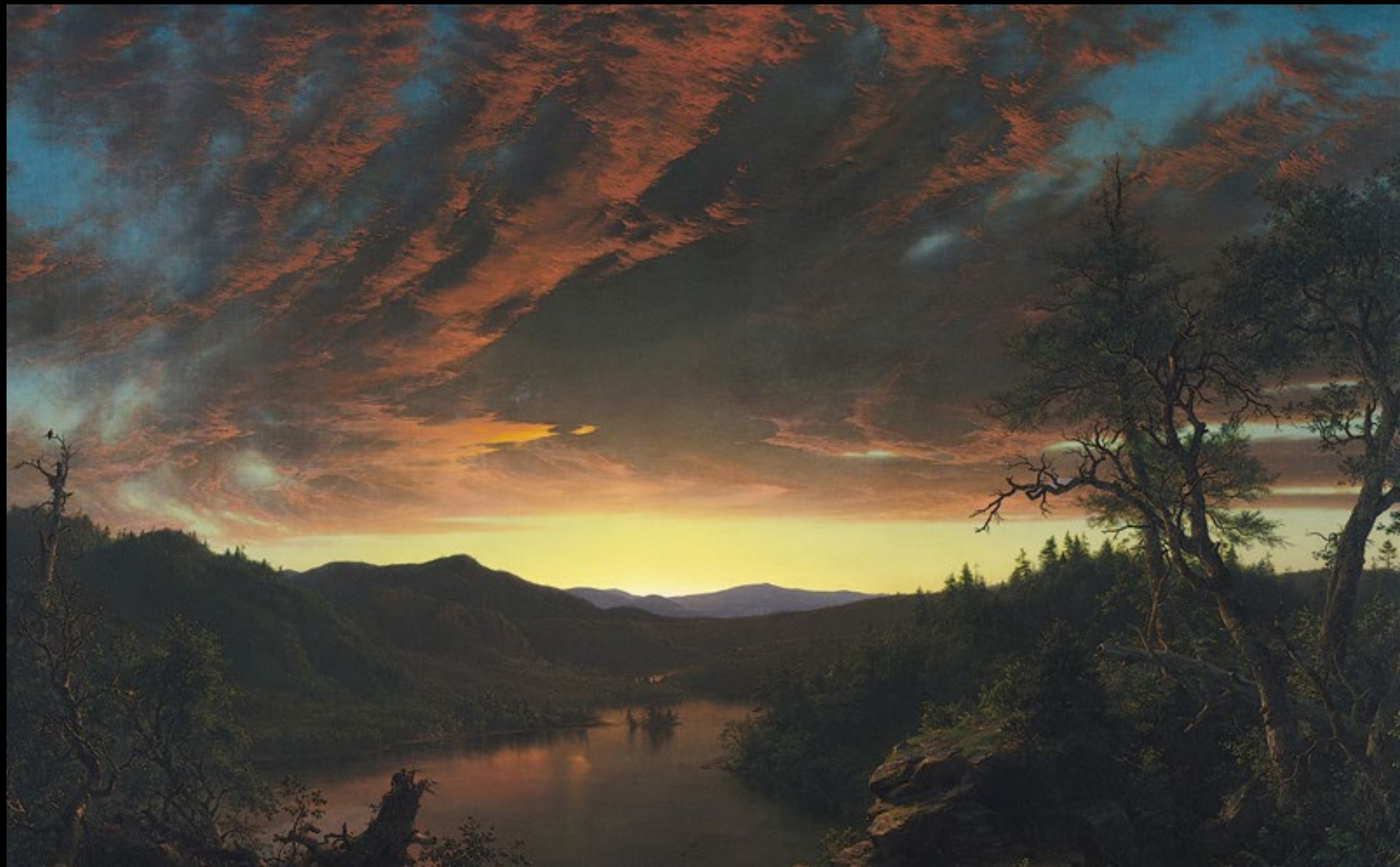
Twilight in the Wilderness, Frederic Edwin Church, 1860