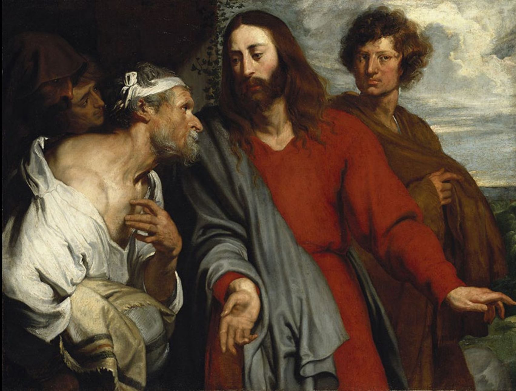
Healing of the Paralytic, Anthony Van Dyck, 1599-1641