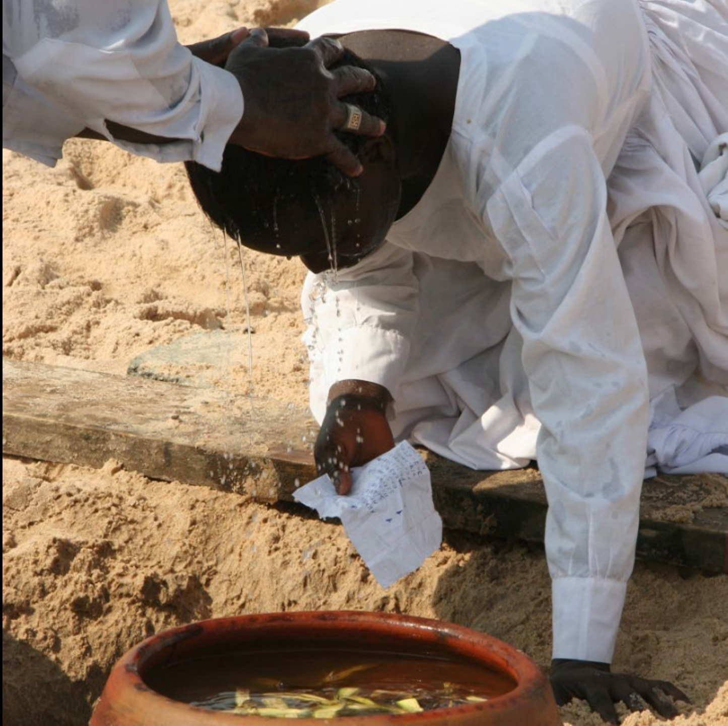
Pentecostal Baptism Cotonou, Benin