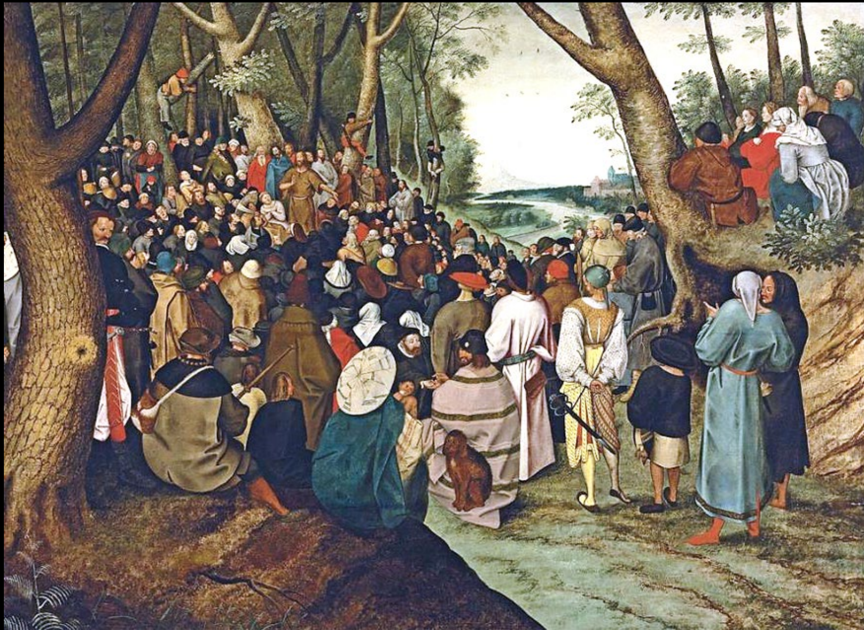
John the Baptist Preaching -- Pieter Bruegel the Younger