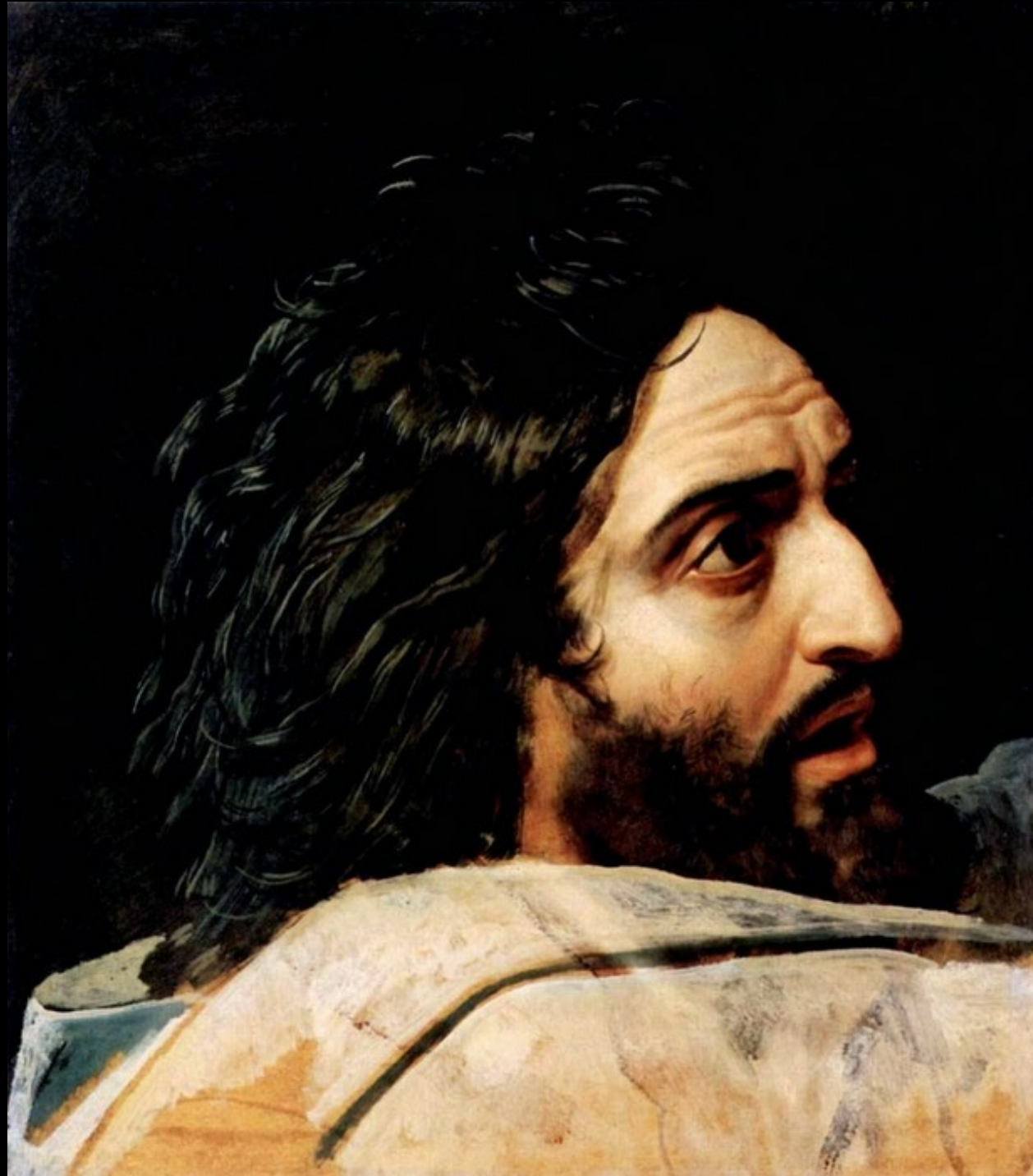
Preparatory sketch of John the Baptist

Aleksandr Ivanov Tretyakov Gallery, Moscow, Russia