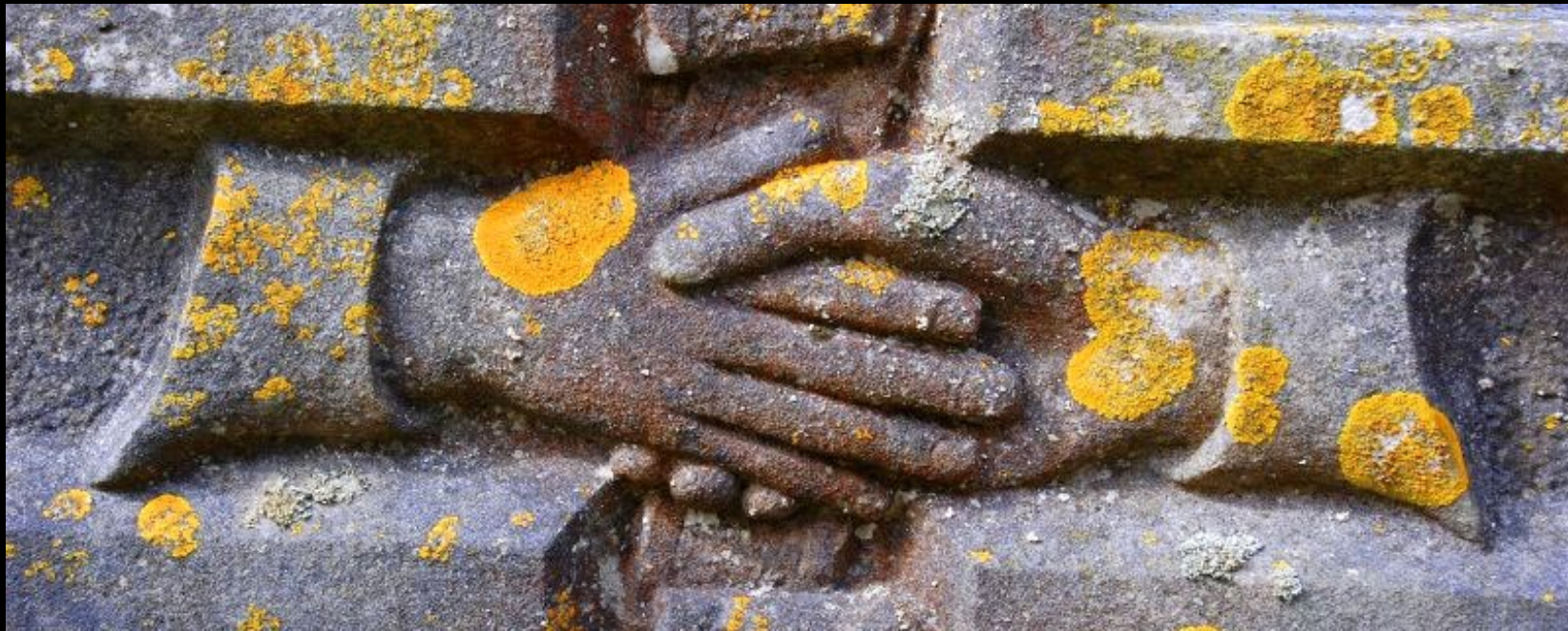
Love and Faithfulness Meet -- St. Michaels Church, Golden Grove, Wales