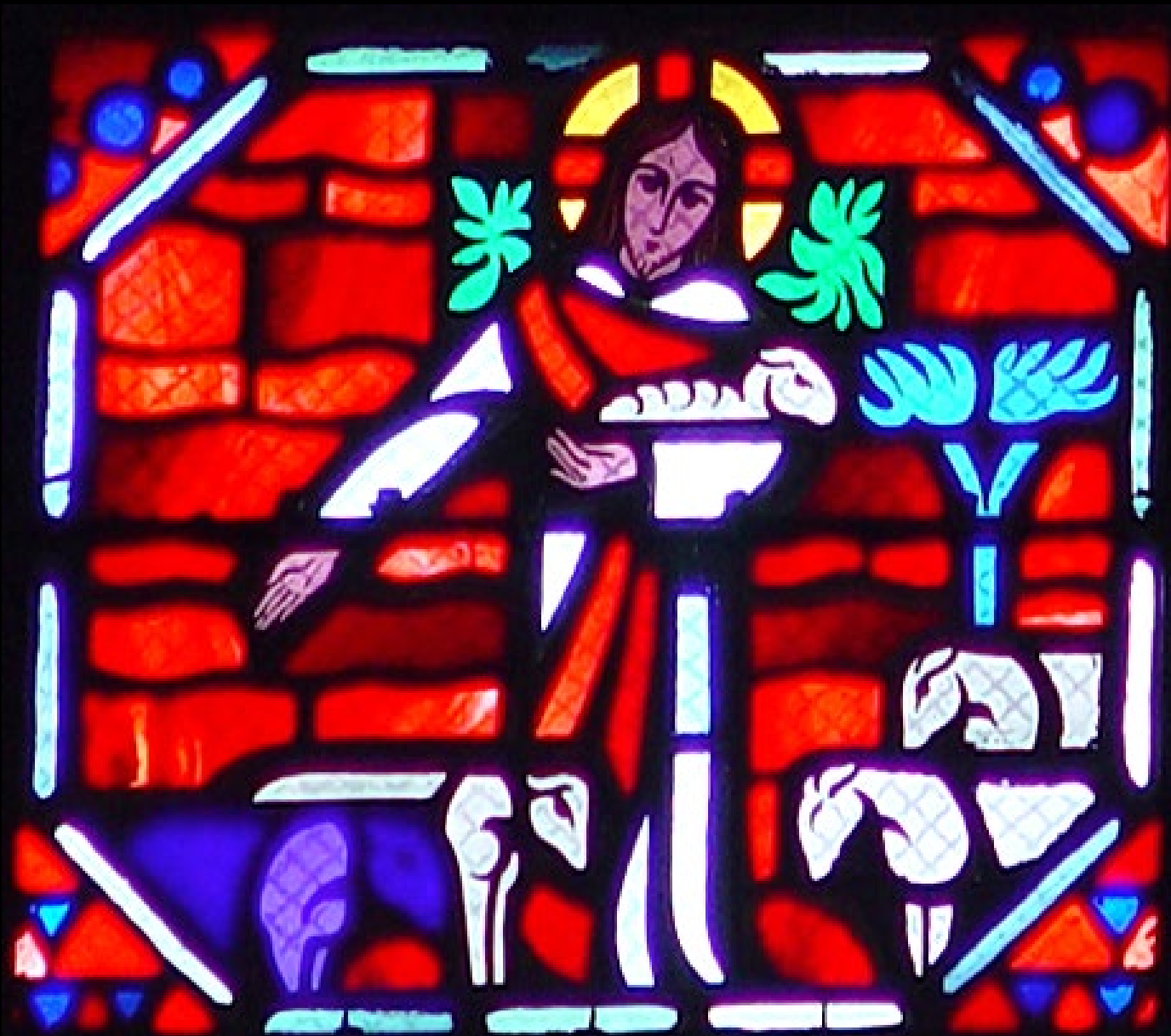
Christ the Good Shepherd --, Amiens Cathedral, Amiens, France