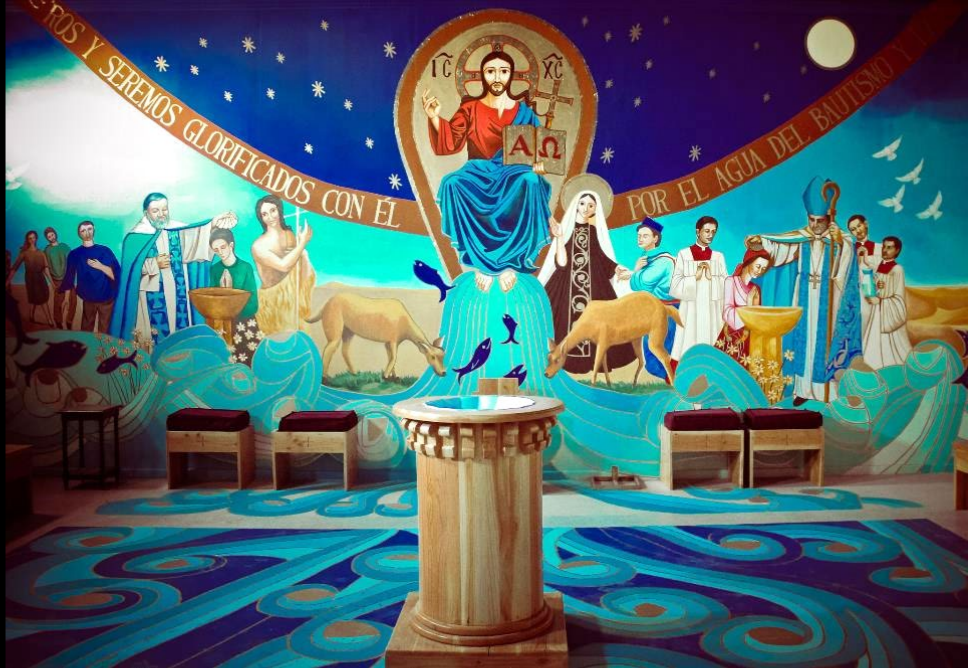
Christ of Baptism -- Church of La Tirana, La Tirana, Chile