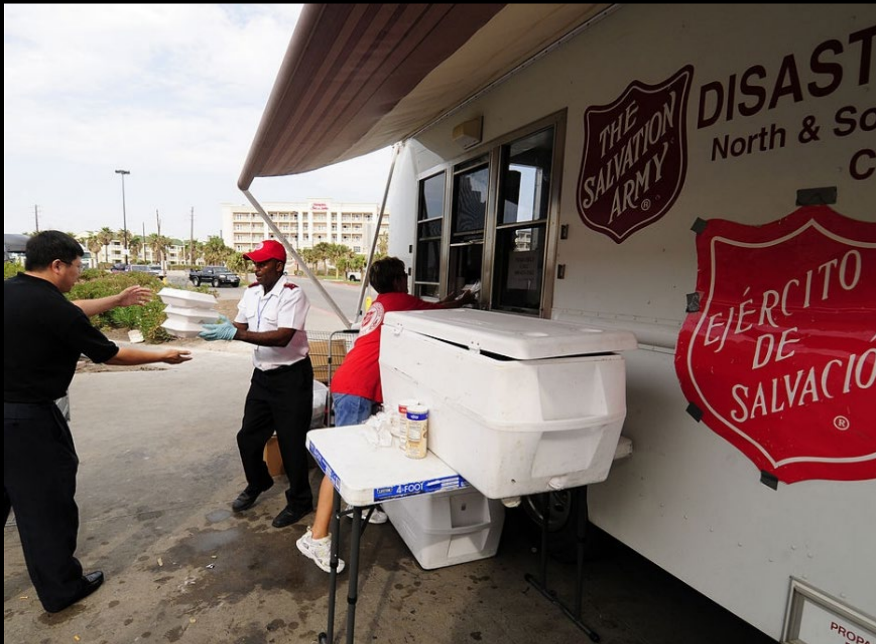
Salvation Army Disaster Relief, Galveston, TX, 2008