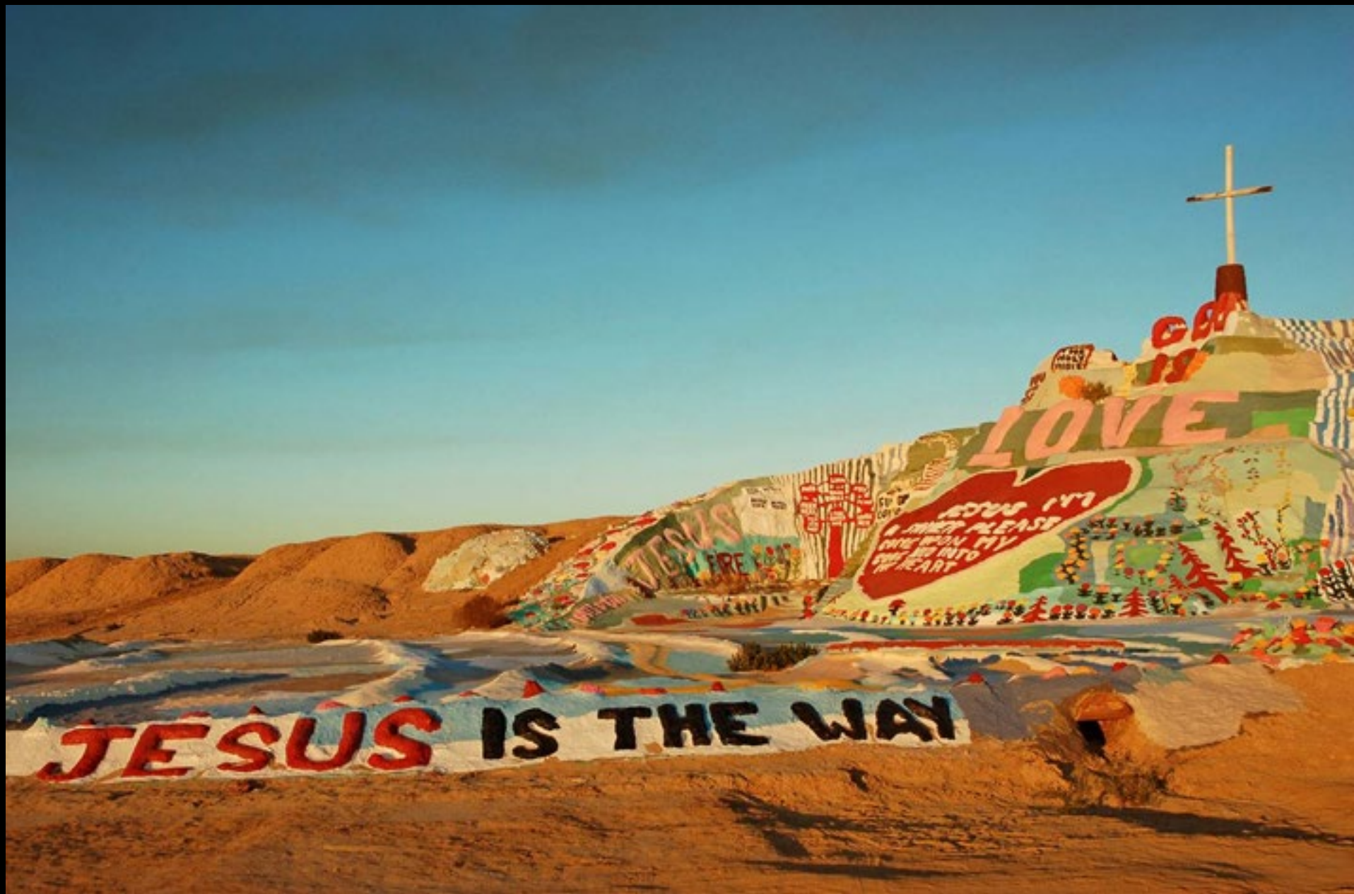
Salvation Mountain -- Leonard Knight, Niland, CA