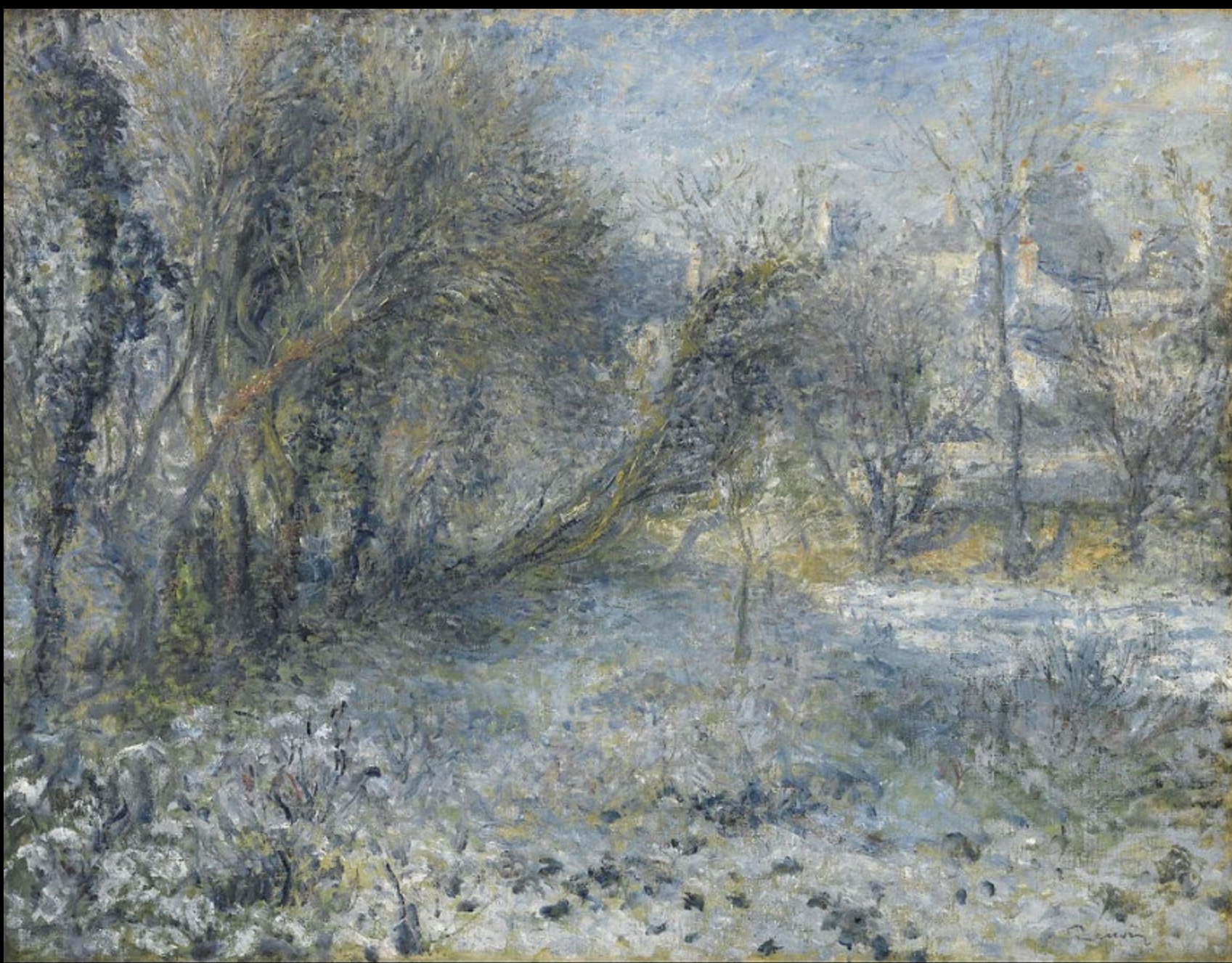
Snow-covered Landscape -- Pierre-Auguste Renoir, Musee de l'Orangerie, Paris, France