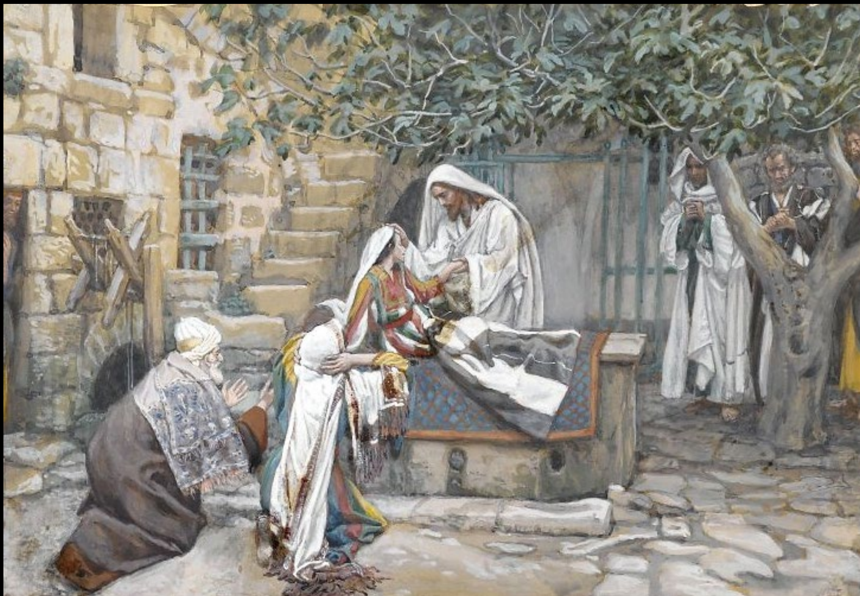
The Daughter of Jairus -- James Tissot, Brooklyn Museum, New York, NY