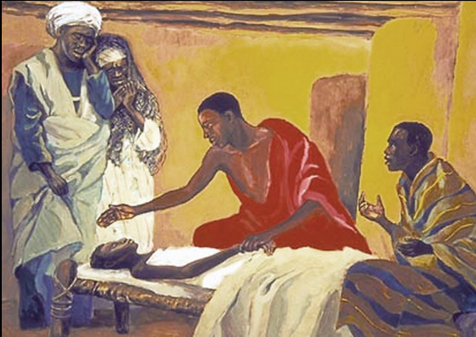
Healing of the Daughter of Jairus -- JESUS MAFA