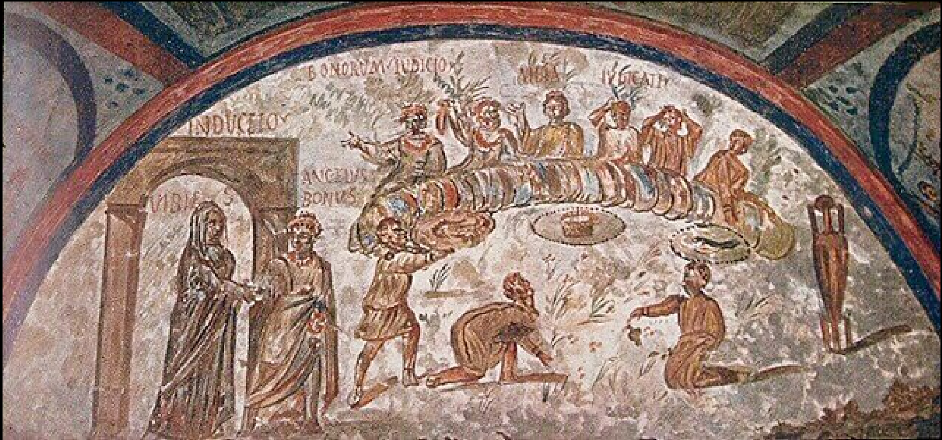
Agape Meal -- 3 rd century, Catacomb of Domitilla, Rome, Italy