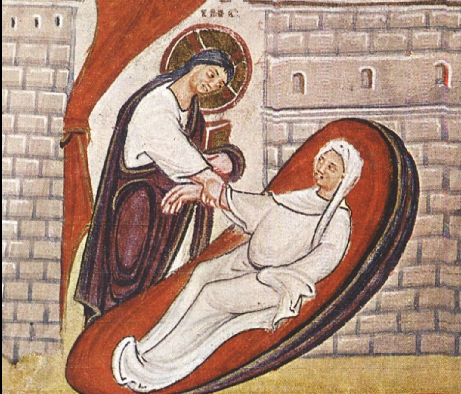
Christ Raising the Daughter of Jairus -- Codex Egberti, 10 th c., Stadtbibliothek, Trier, Germany