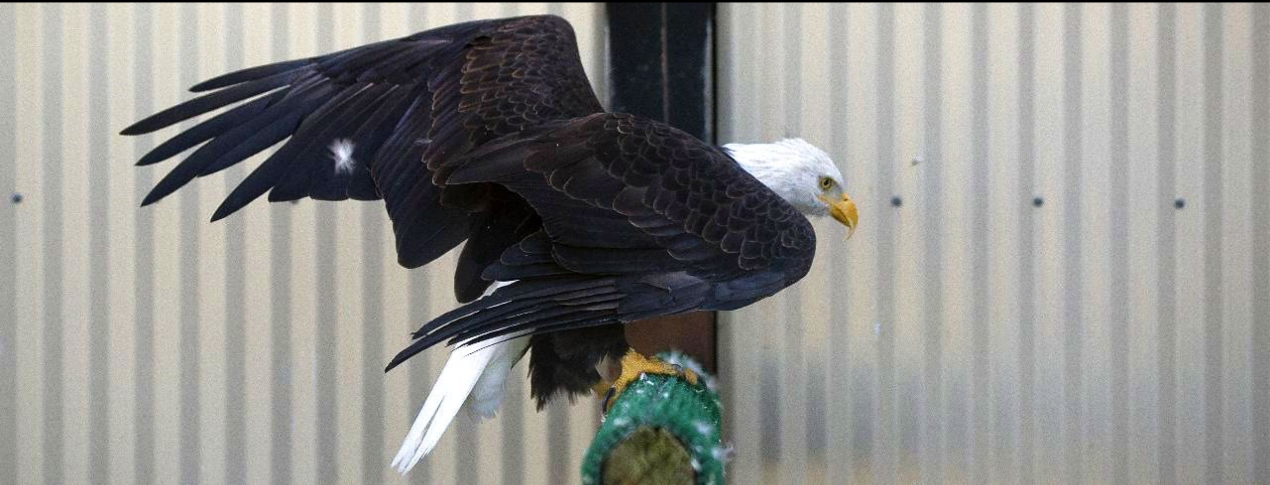
Rescued, Disabled Eagle -- Memorial Park, Joint Base Elmendorf-Richardson, Alaska