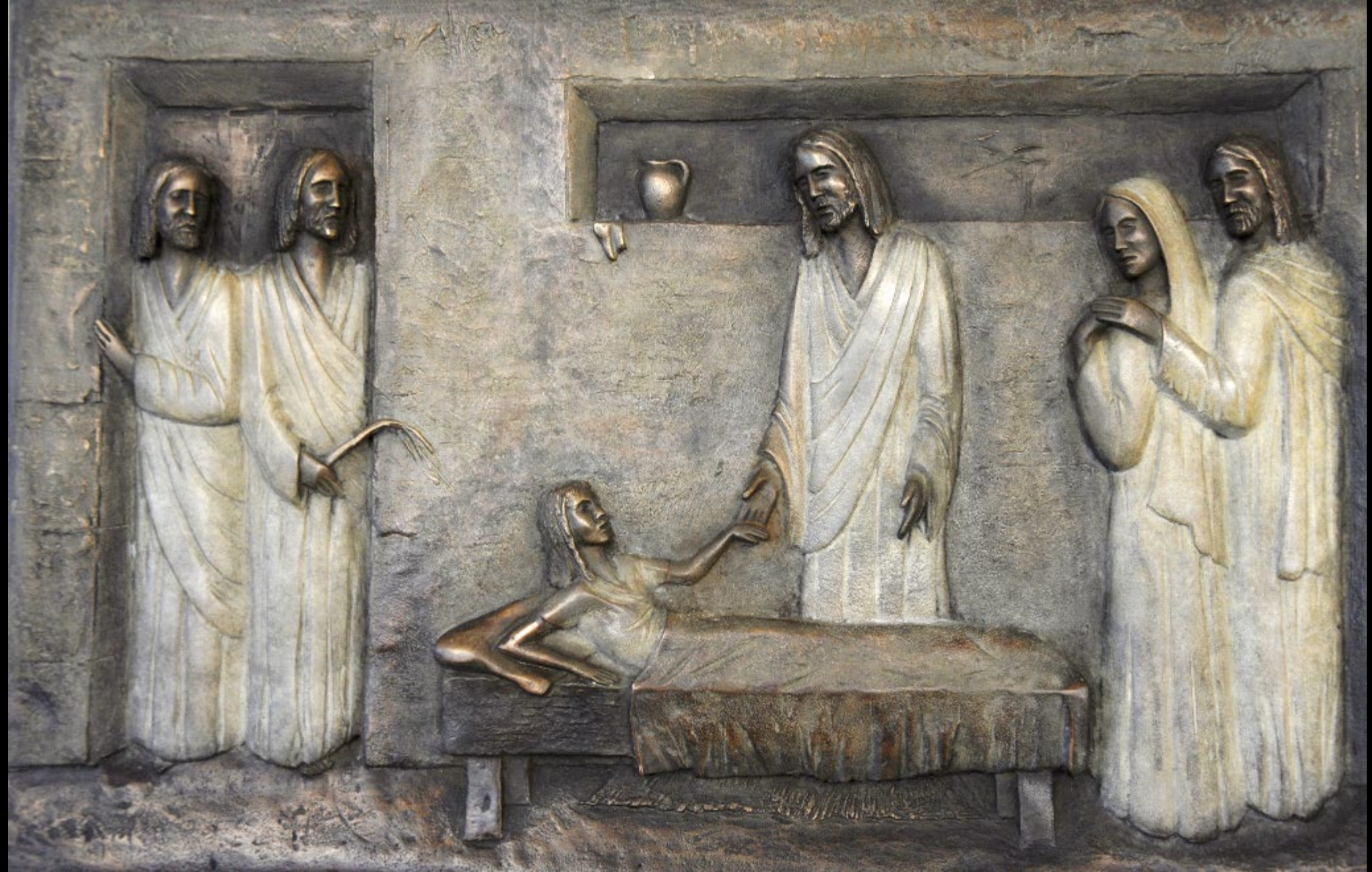
Jairus' Daughter -- National Children's Hospital, Dublin, Ireland