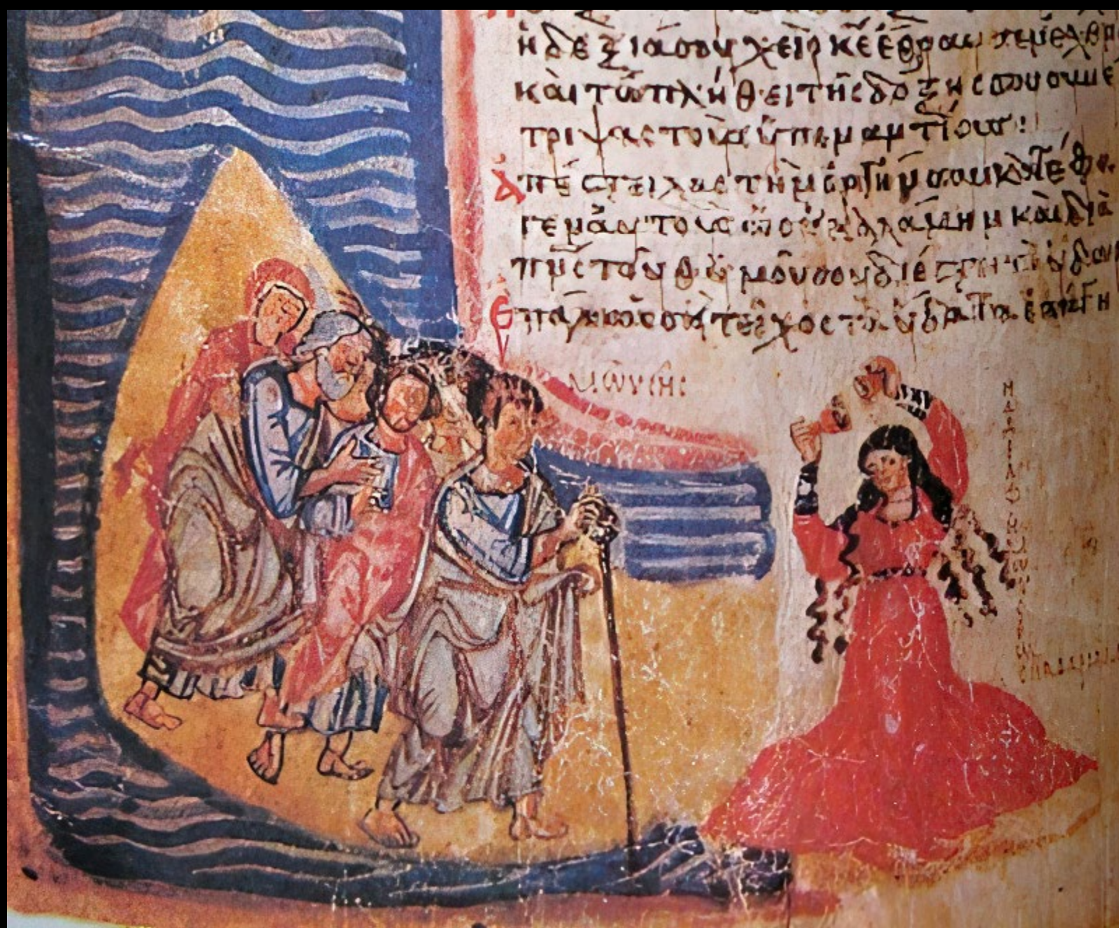
Song of Miriam -- Chludov Psalter, State Historical Museum, Moscow