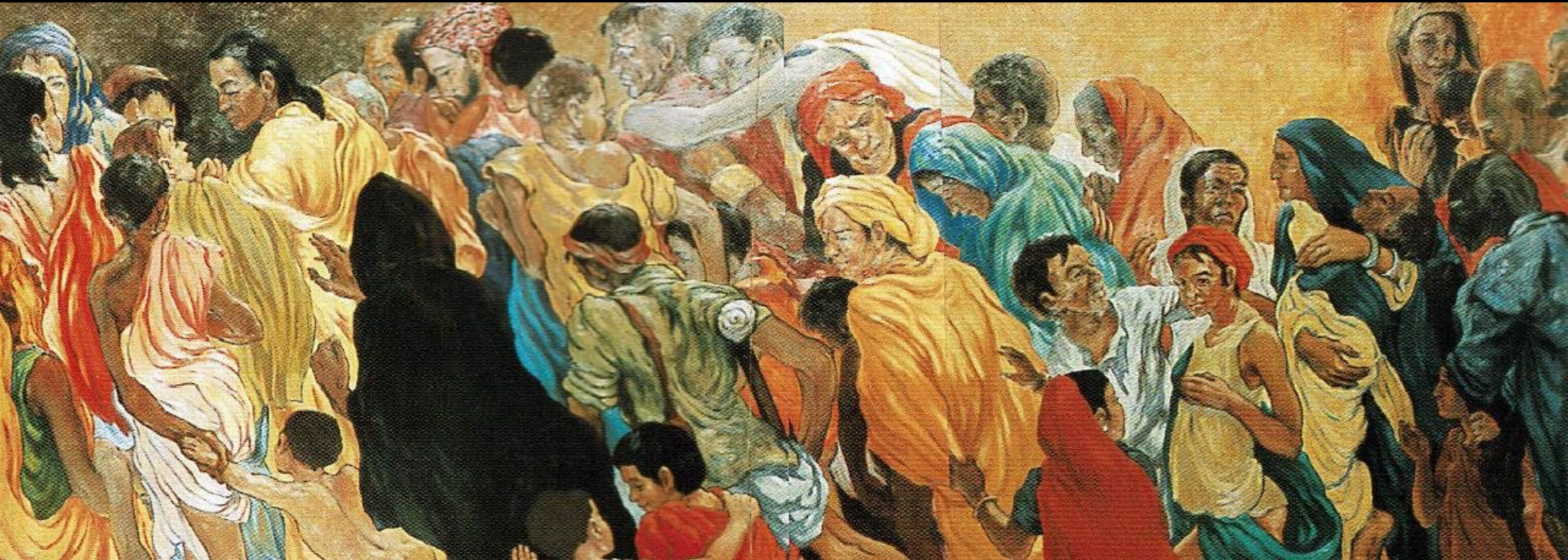
Woman with the Flow of Blood -- Frank Wesley