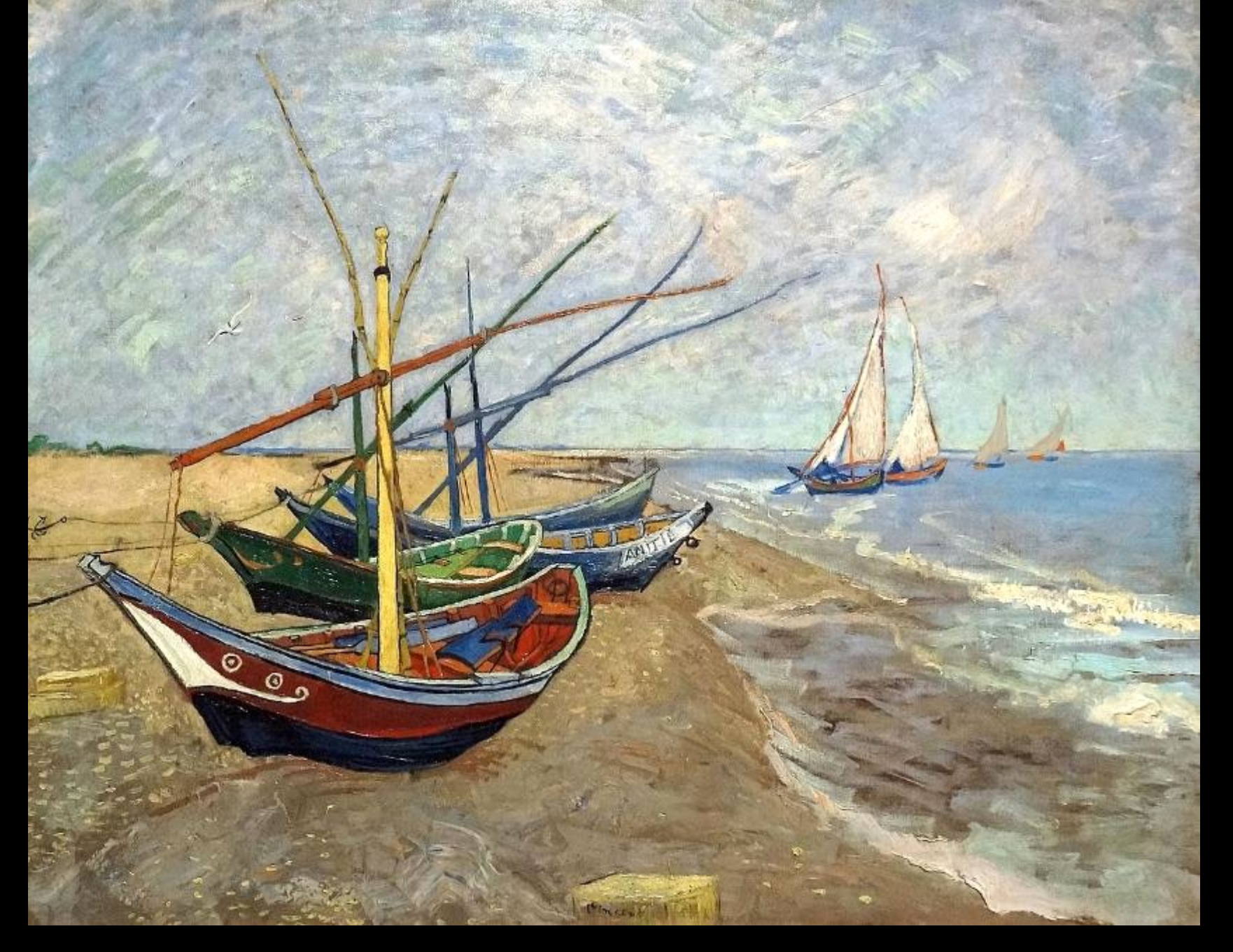
Fishing Boats on the Beach -- Vincent Van Gogh, Van Gogh Museum, Amsterdam