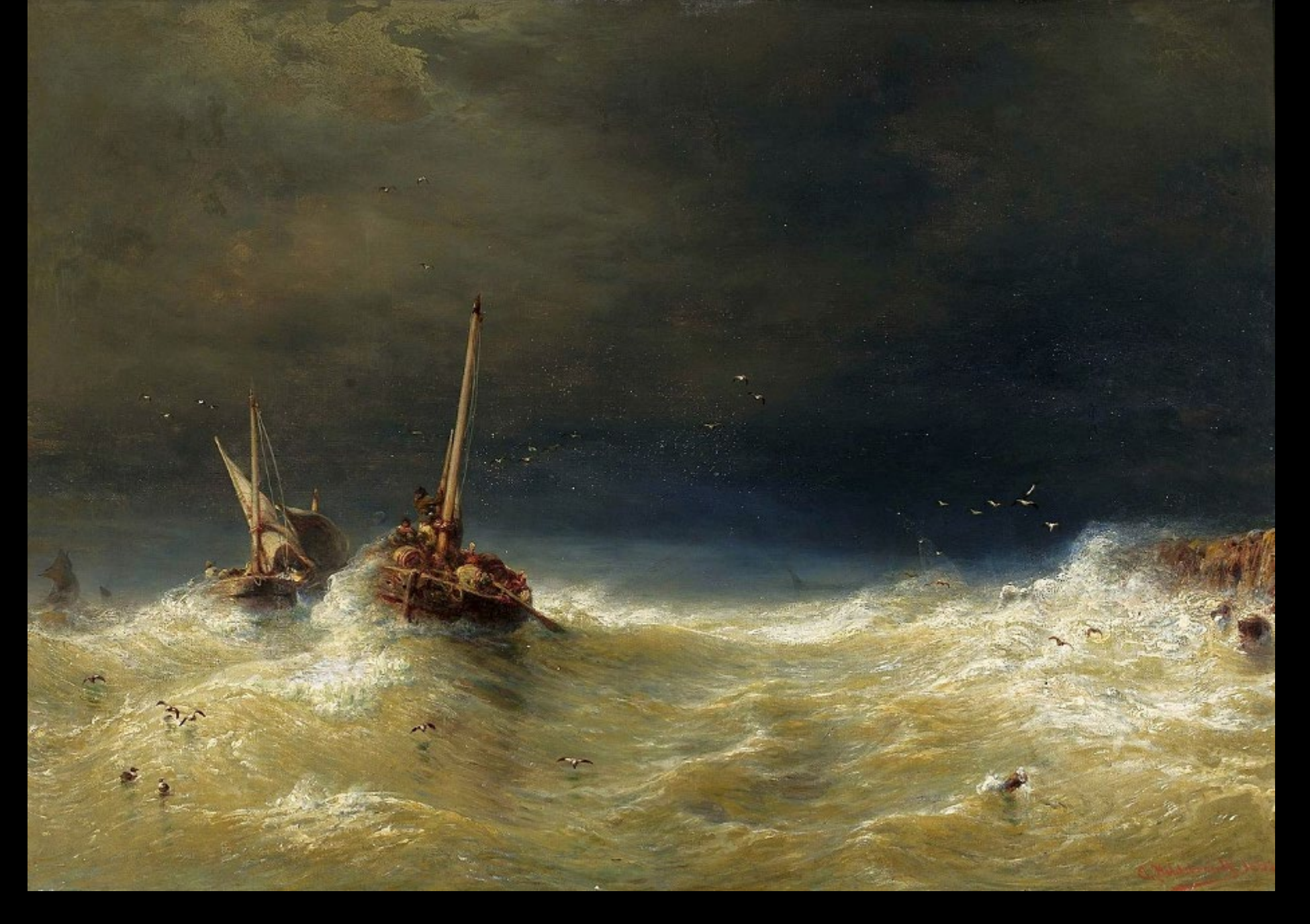
Sea Storm -- Eduard Hildebrandt, National Museum in Warsaw, Warsaw, Poland