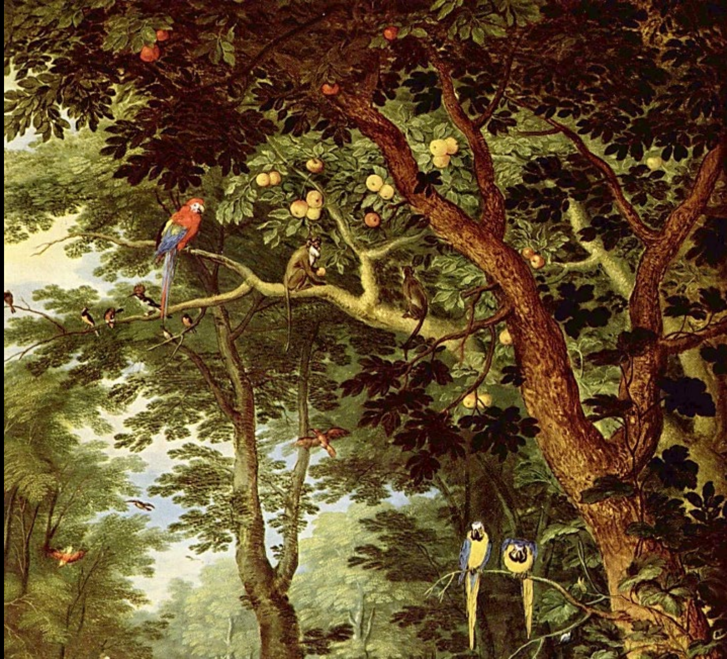
Jan Bruegel -- Paradise, Gemaldegalerie, Berlin, Germany