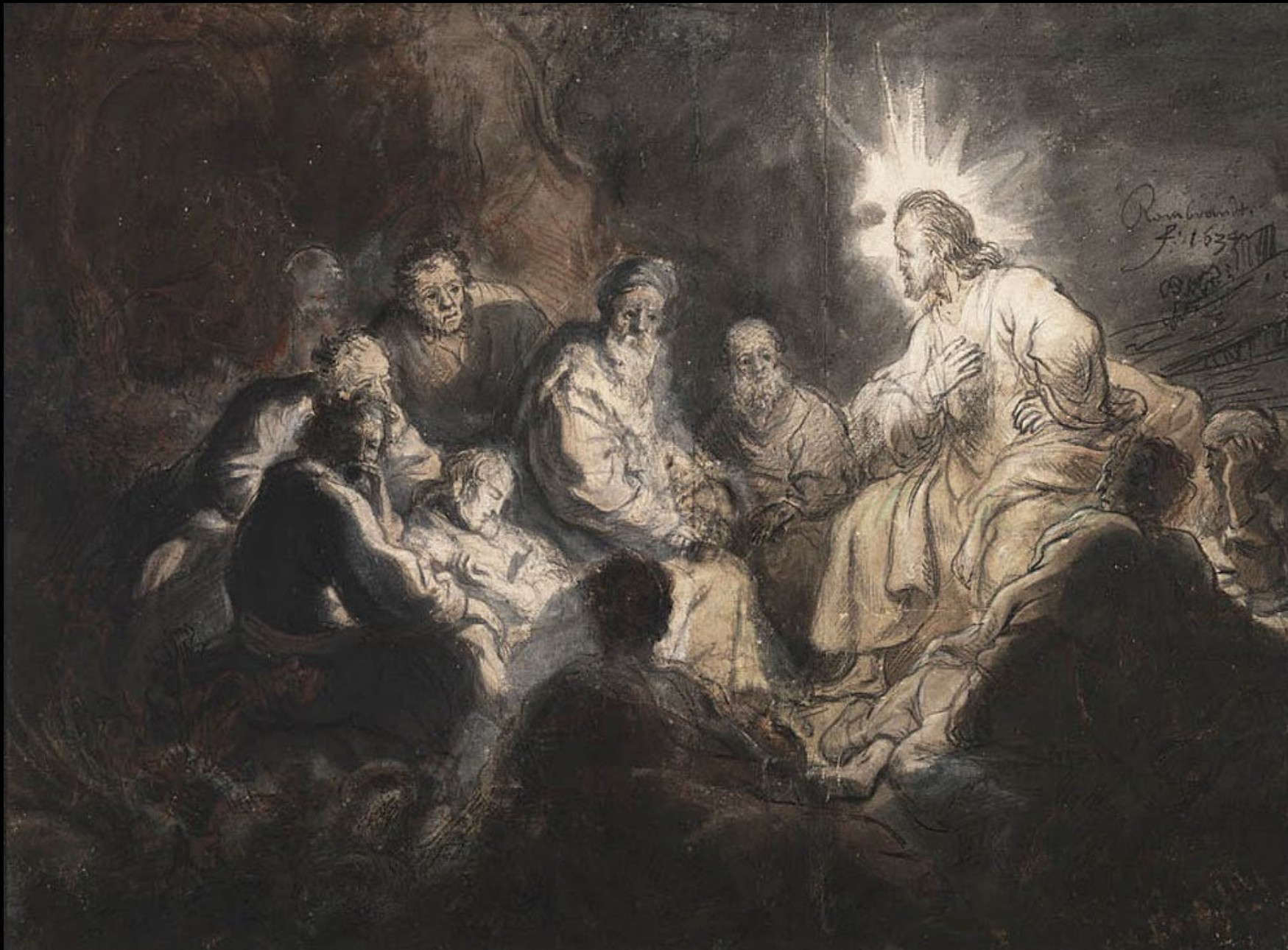
Christ and His Disciples -- Rembrandt, Teylers Museum, Haarlem, Netherlands