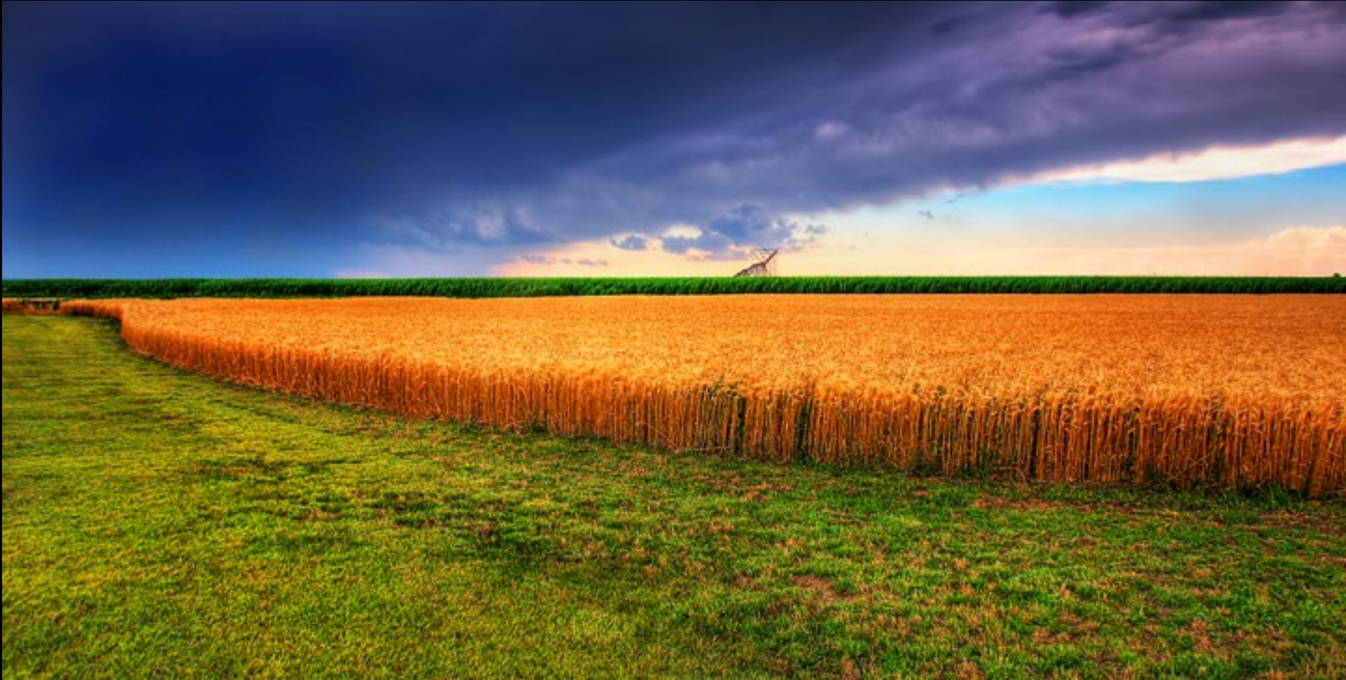
Kansas Summer Wheat