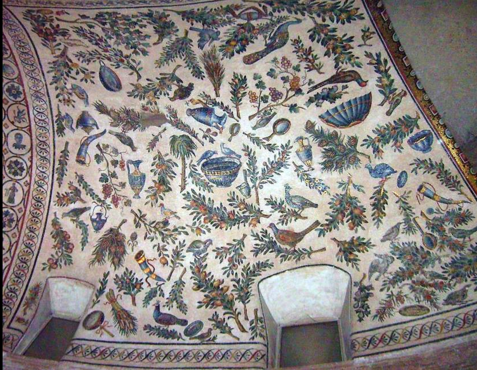
Early Christian Bird Mosaic -- 4 th c. Mausoleum of Santa Costanza, Rome , Italy