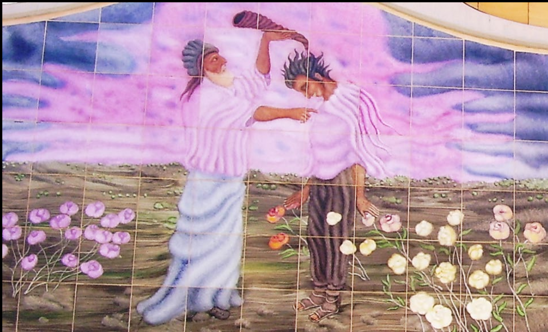
Samuel Anoints David -- Castra center, Haifa, Israel