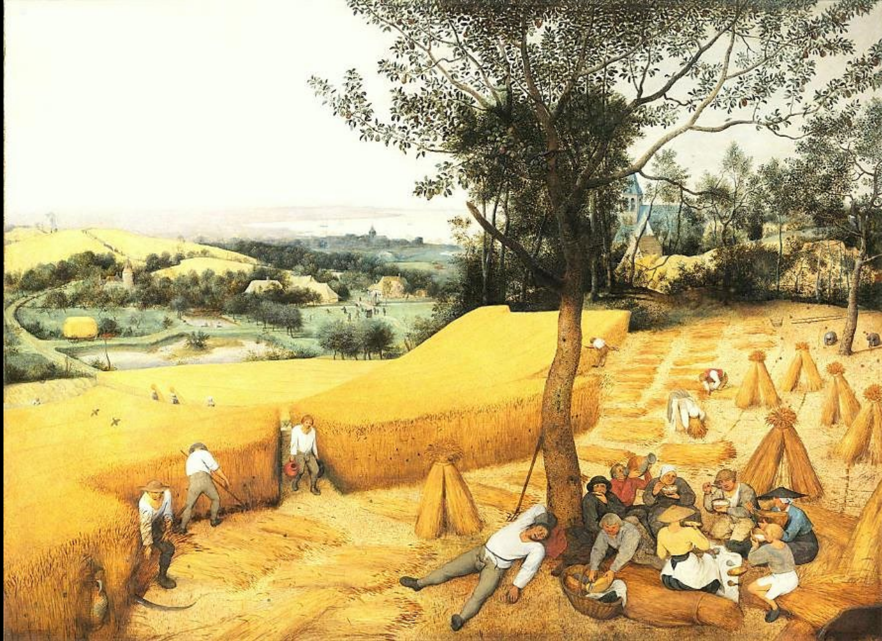
Harvesters -- Pieter Bruegel, Metropolitan Museum of Art, New York, NY