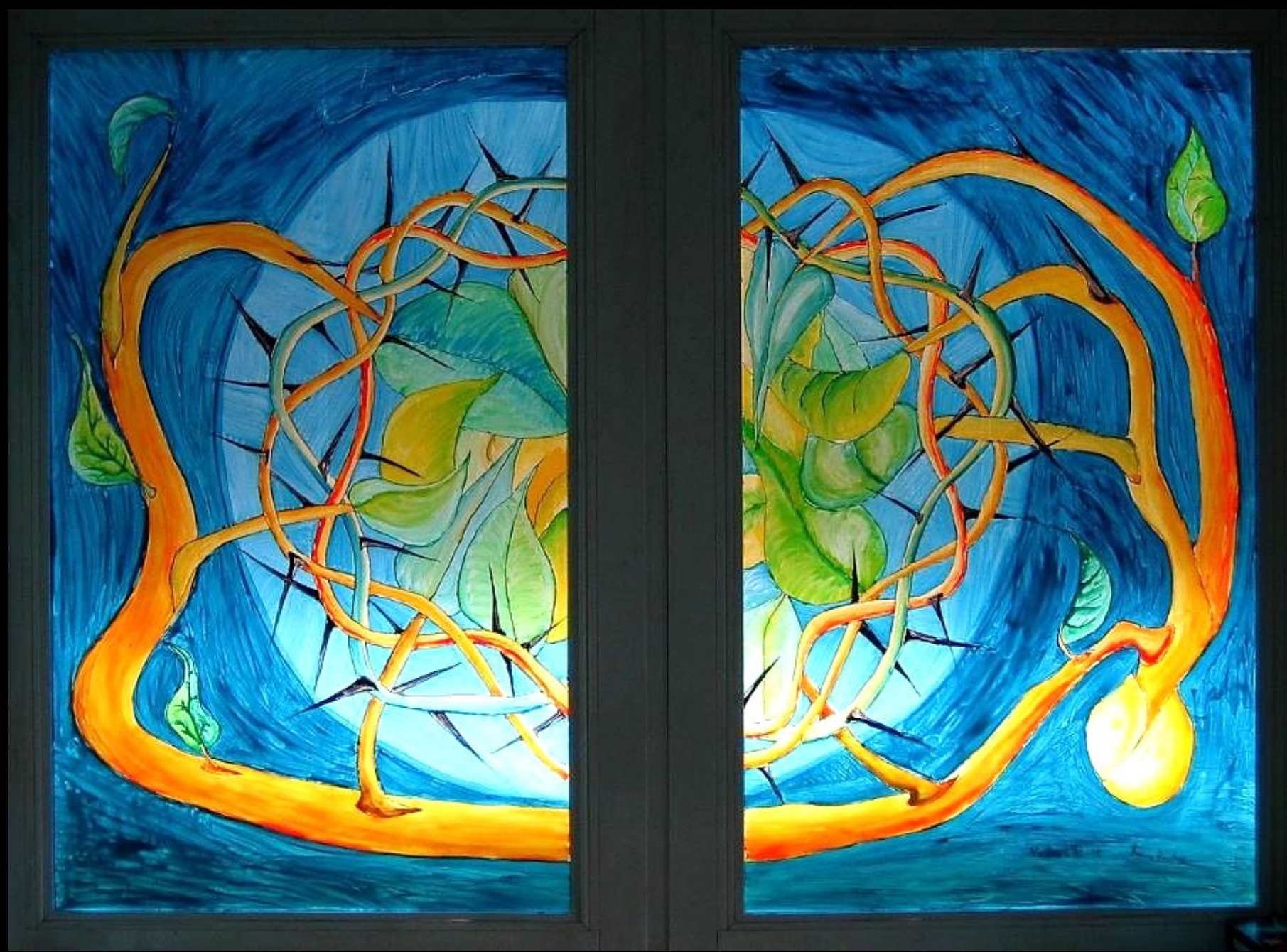
Parable of the Mustard Seed -- Window at the YMCA training center, Kassel, Germany