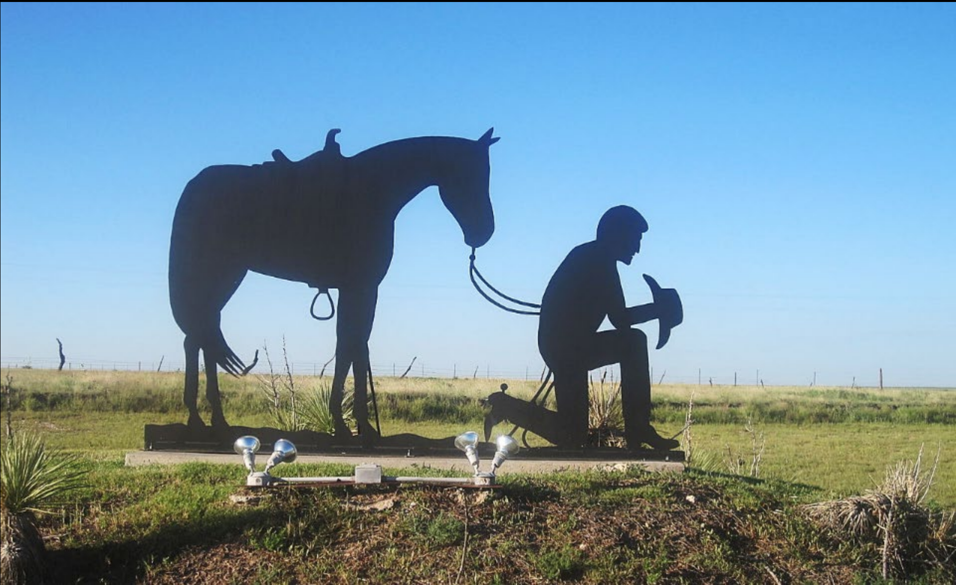
Cowboy at Prayer -- Clayton, NM