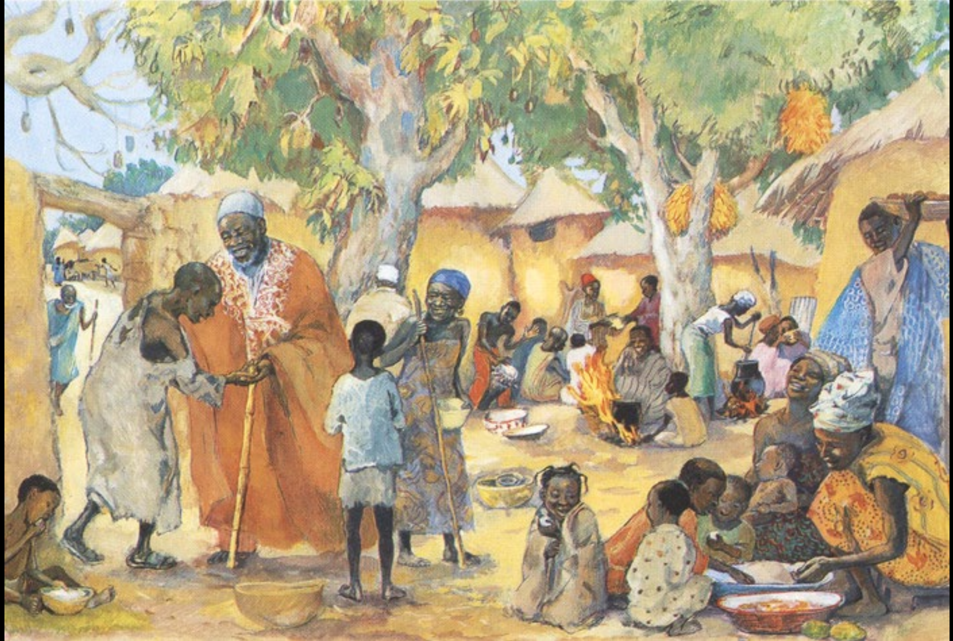
The Poor Invited to the Feast -- JESUS MAFA, Cameroon