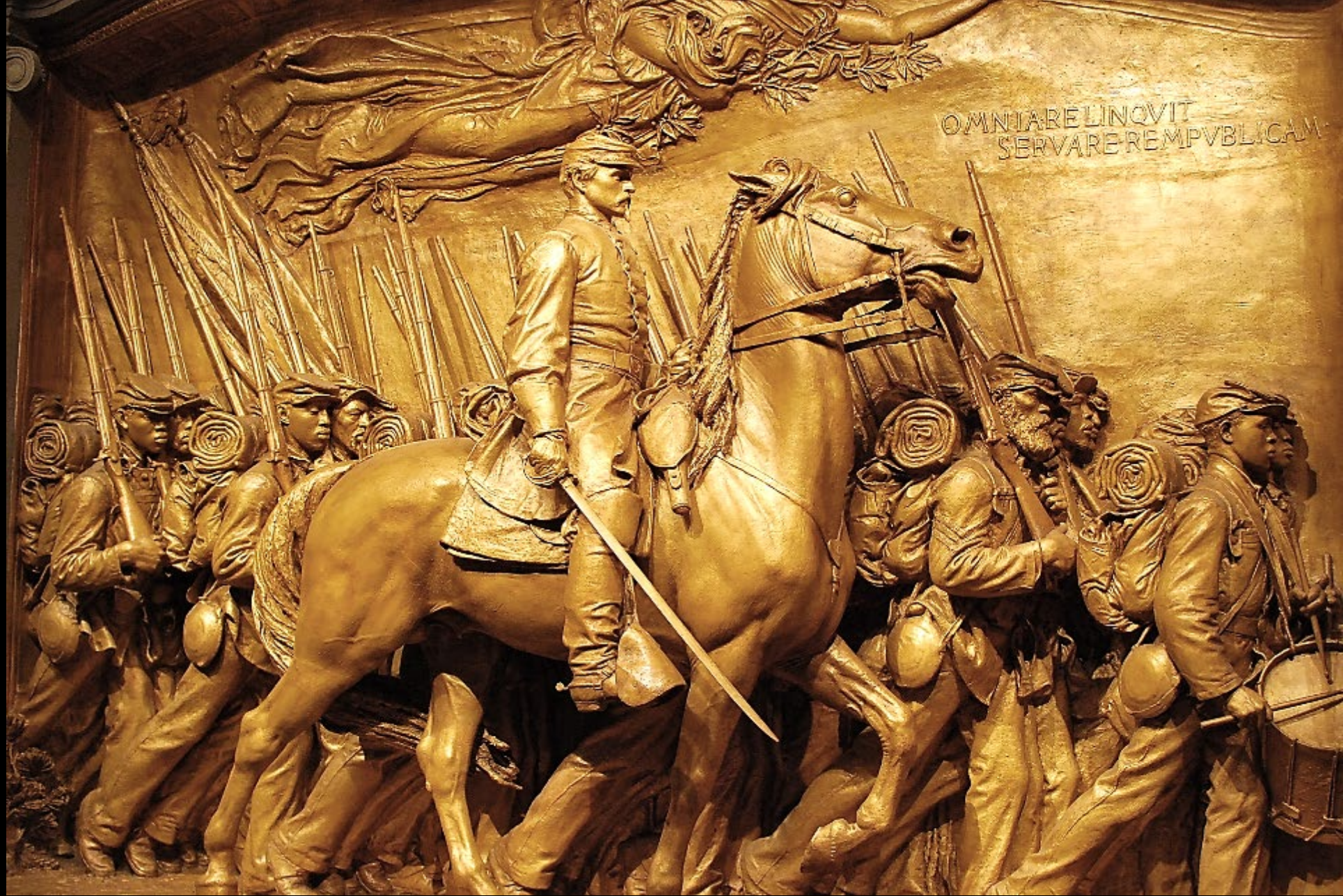
Shaw Civil War Memorial -- Augustus Saint-Gaudens, National Gallery of Art, Washington, DC