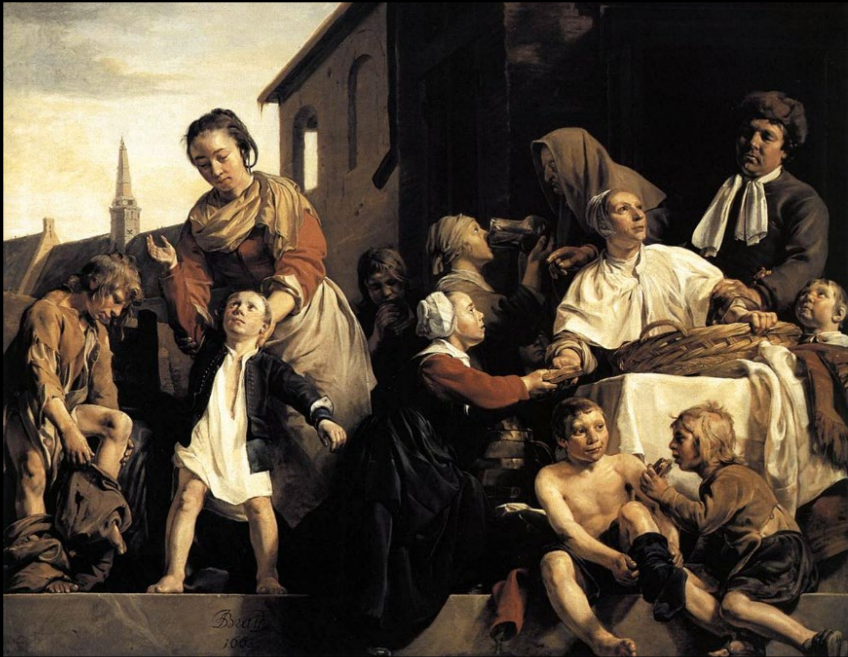
Tending Children at the Orphanage, Jan de Bray, Frans Hal Museum, Haarlem, Netherlands