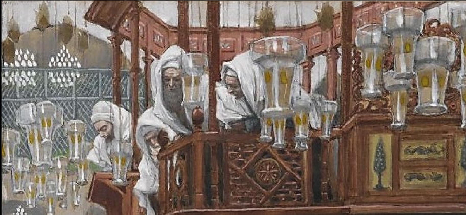
Jesus and the Man with the Withered Hand, detail -- James Tissot, Brooklyn Museum of Art New York, NY