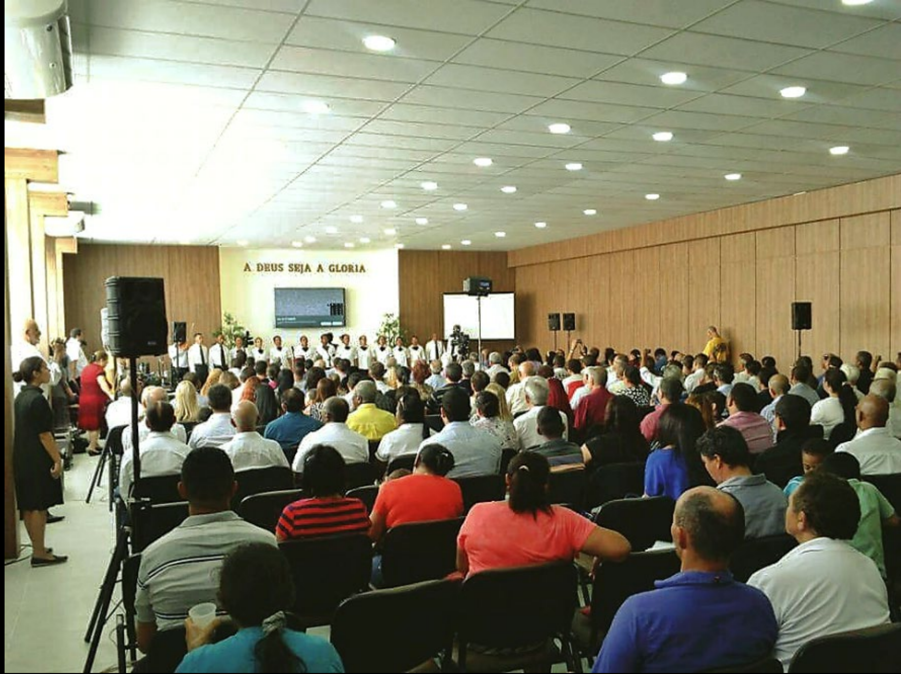
Church of God International Worship service, Sao Paulo, Brazil