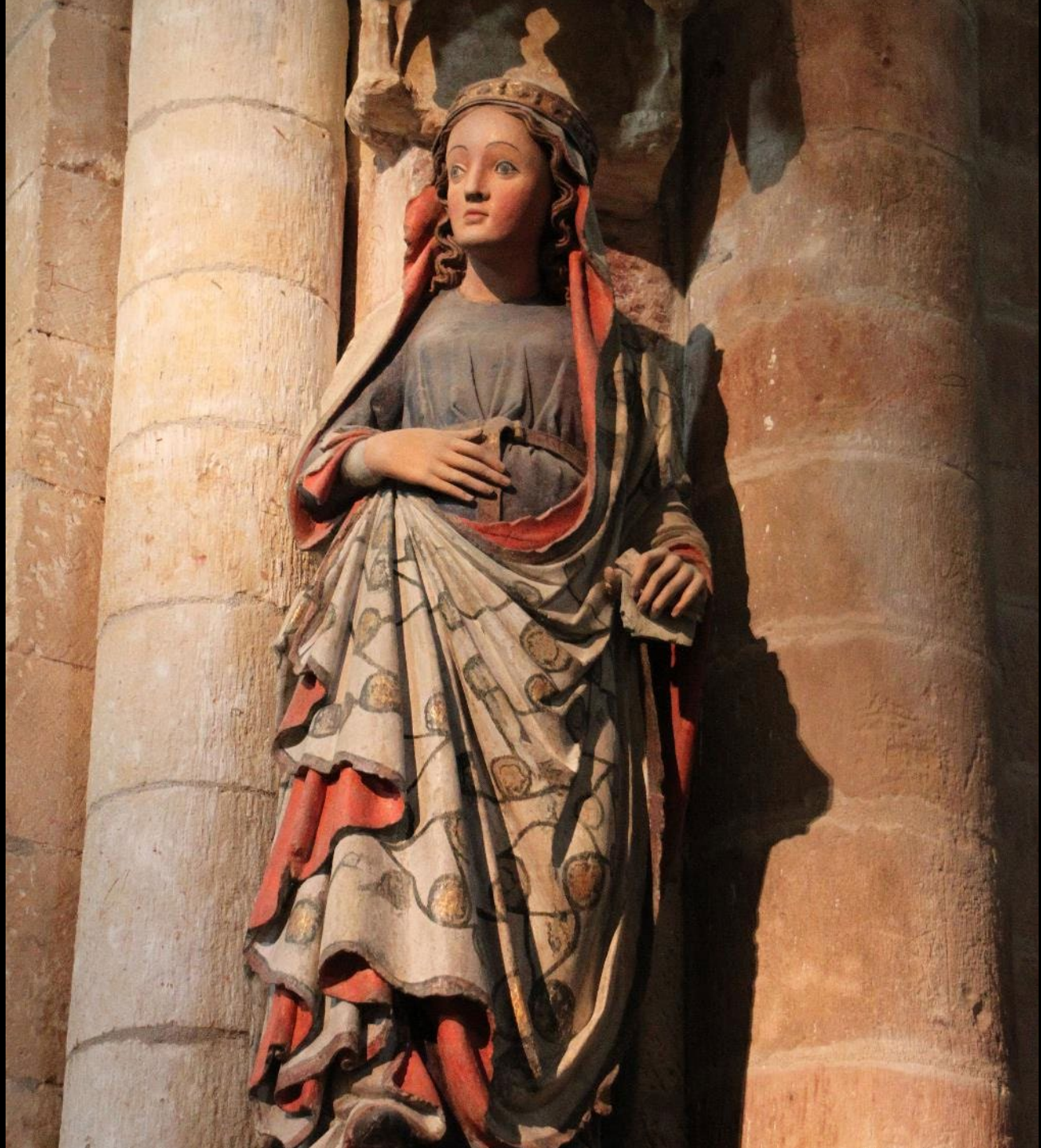
Mary with Child

Collegiate Church Of St Mary Major Toro, Spain