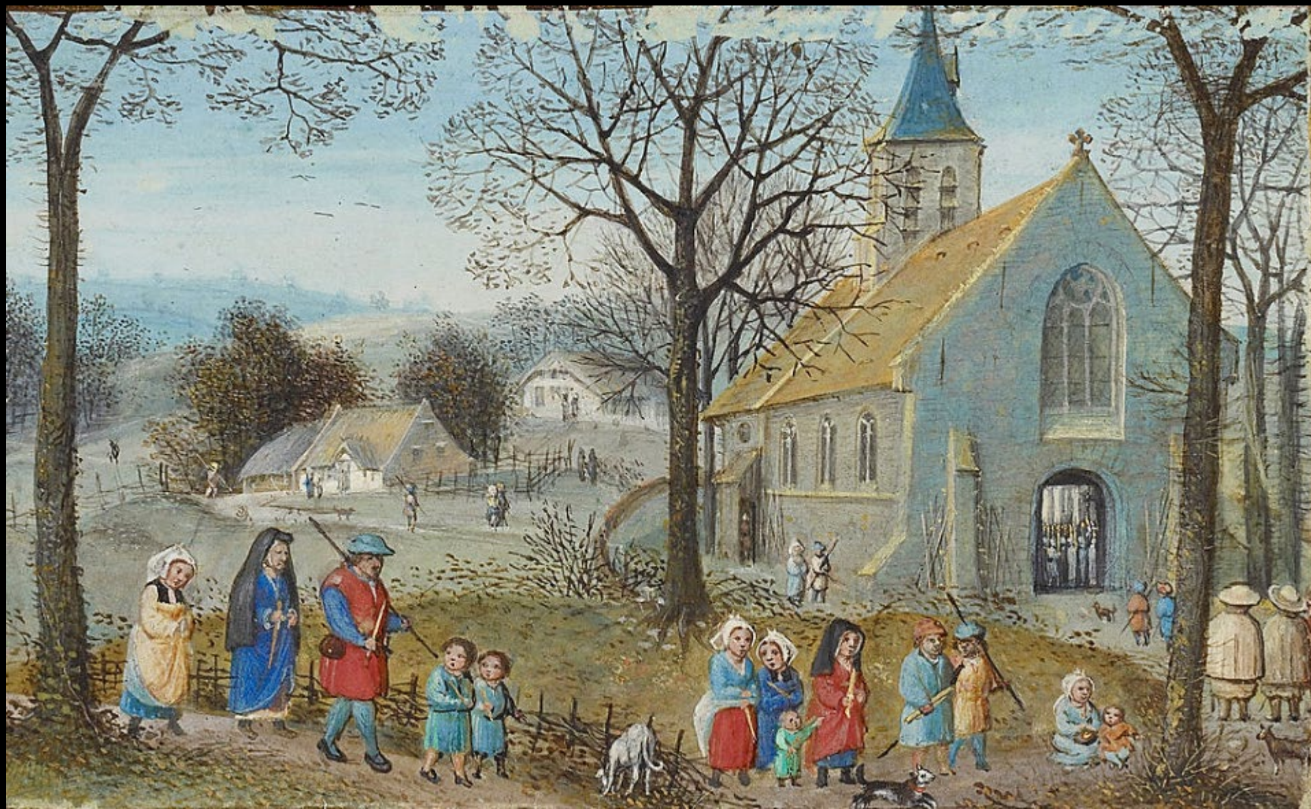
Villagers on Their Way to Church -- Simon Bening, Getty Center, Los Angeles, CA