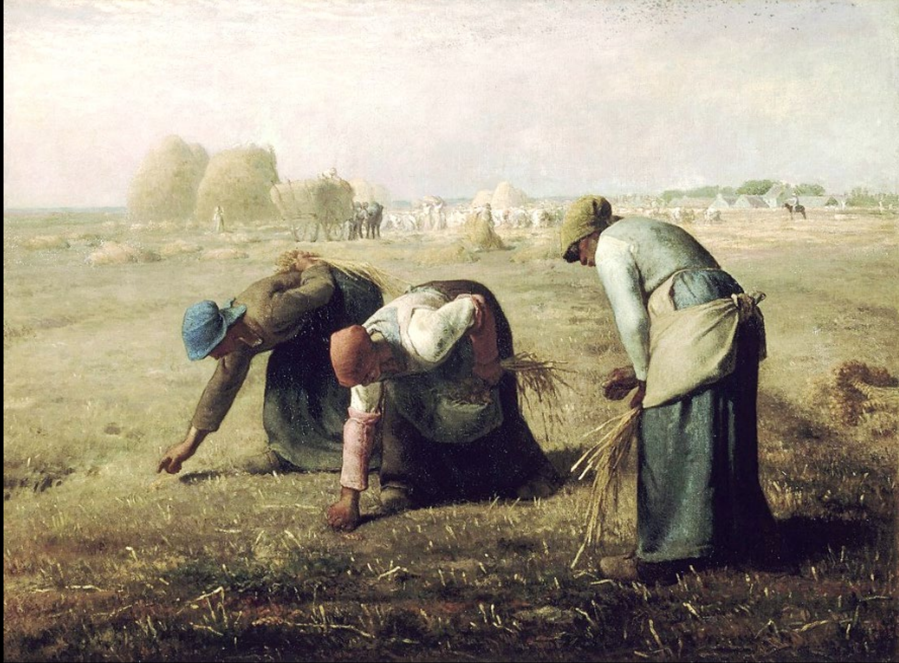
The Gleaners -- Jean Francois Millet, Musée d'Orsay, Paris, France