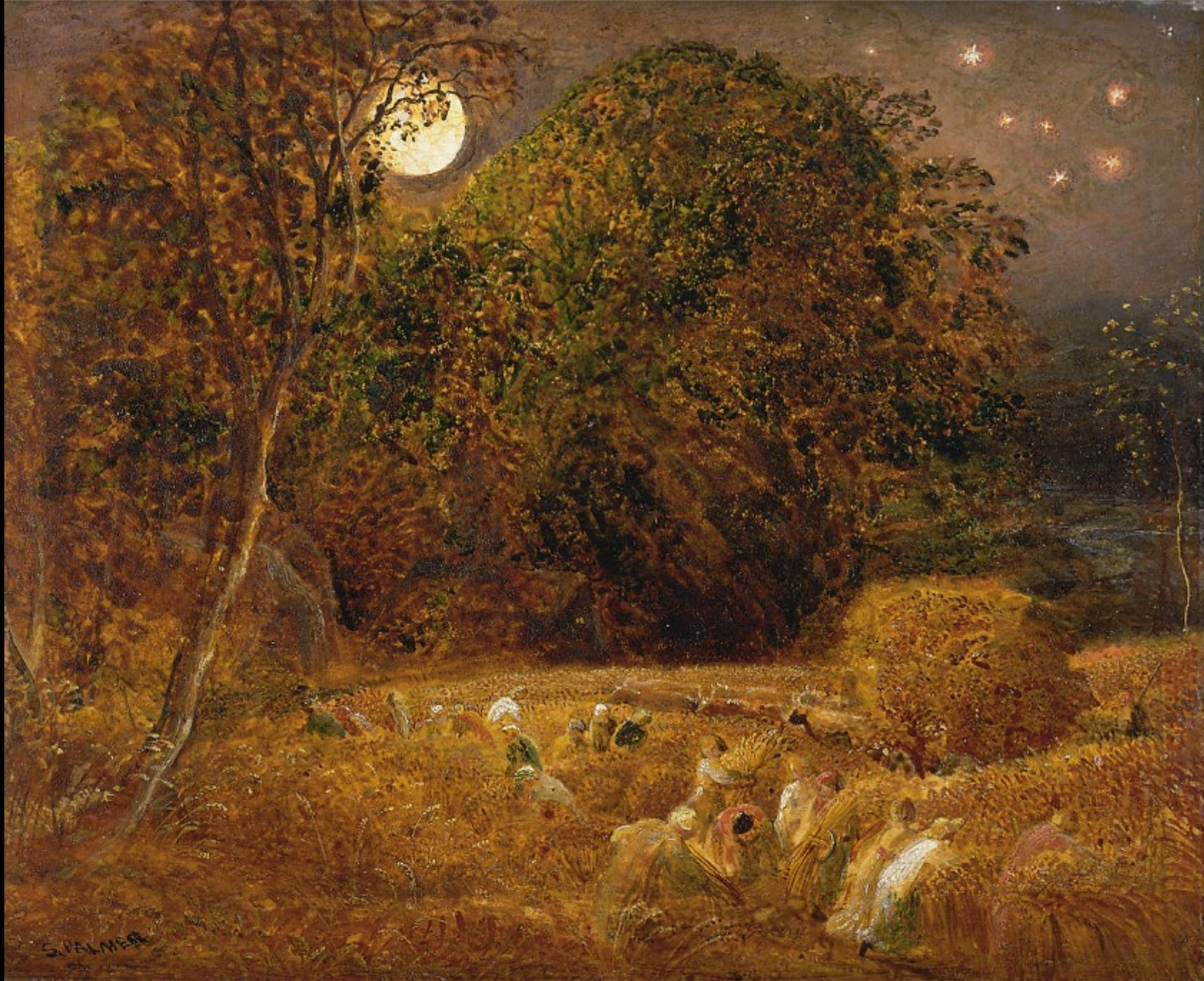
The Harvest Moon -- Samuel Palmer, Yale Center for British Art, New Haven, CT