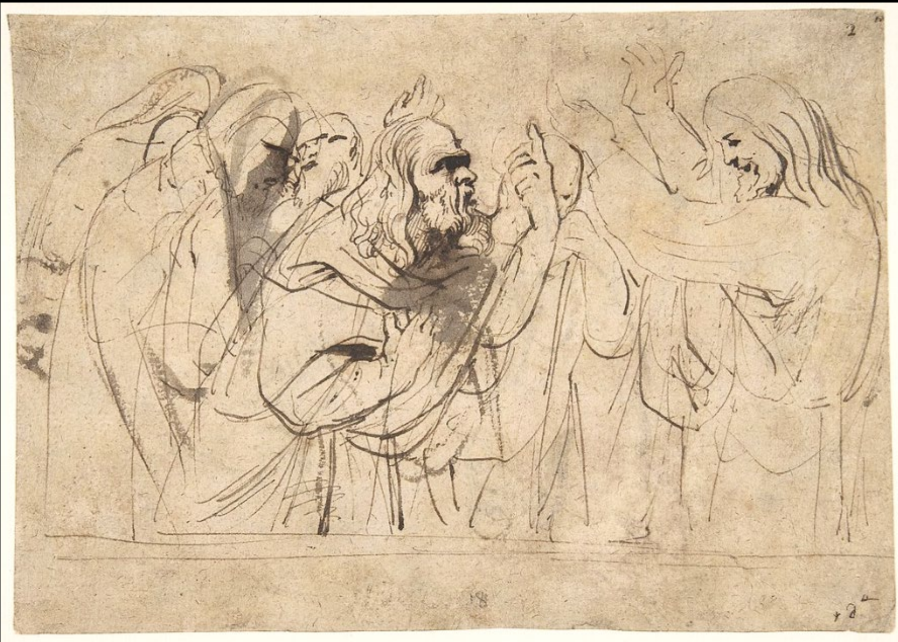
Christ and the Pharisees -- Anthony van Dyck, Metropolitan Museum of Art, NY