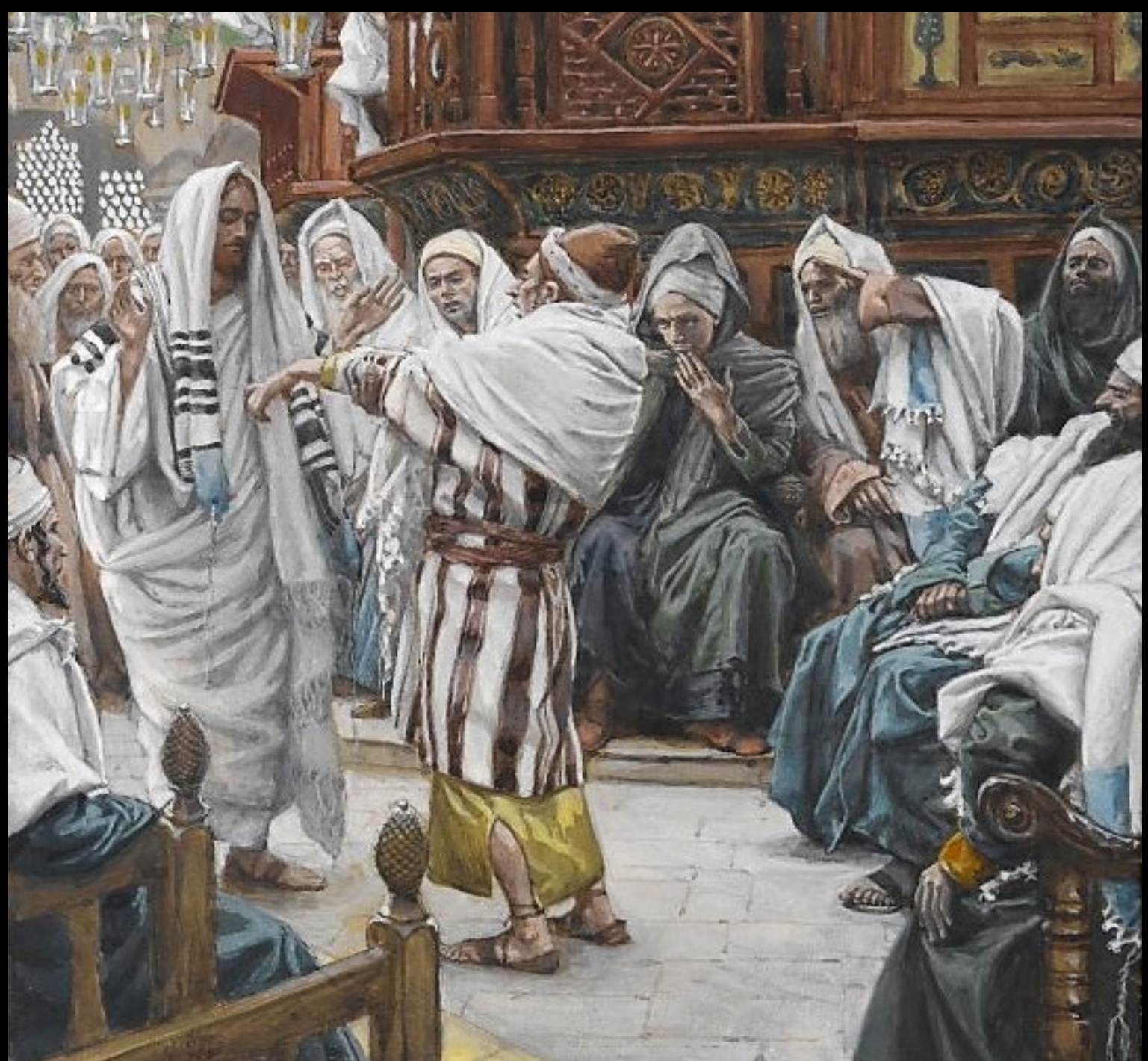
Jesus and the Man with the Withered Hand, detail

James Tissot, Brooklyn Museum of Art New York, NY