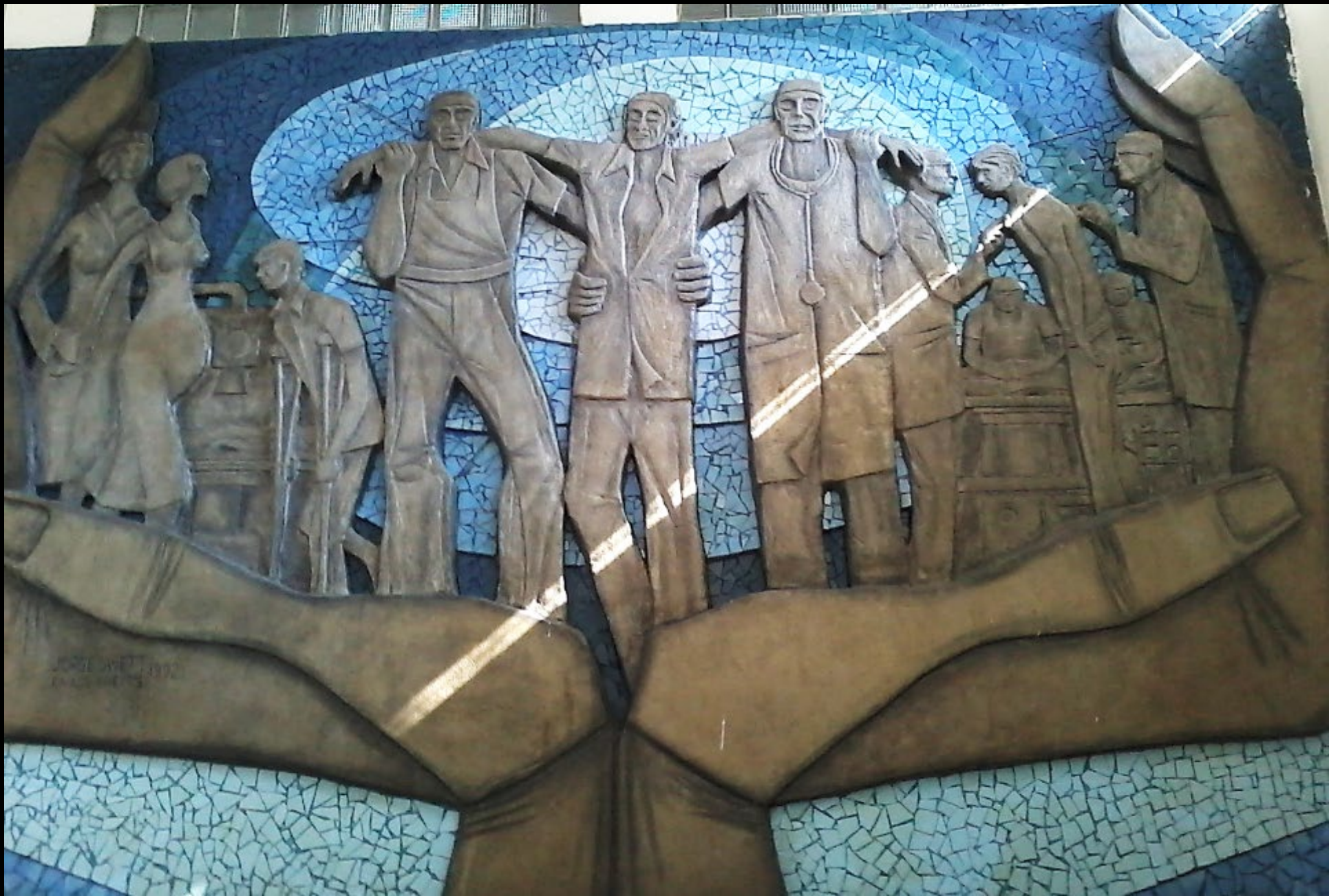
Healing Mural -- Hospital Teodoro Maldonado Carbo, Guayaquil, Ecuador