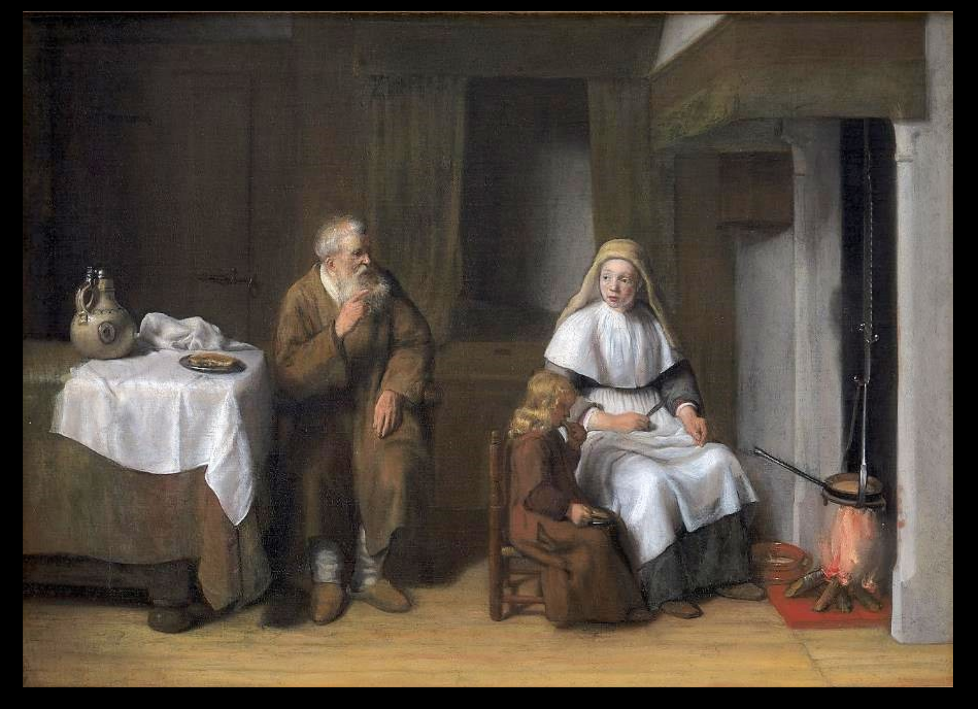
Elijah with the Widow of Zarephath and her Son -- Abraham van Dyck, Statens Museum, Copenhagen