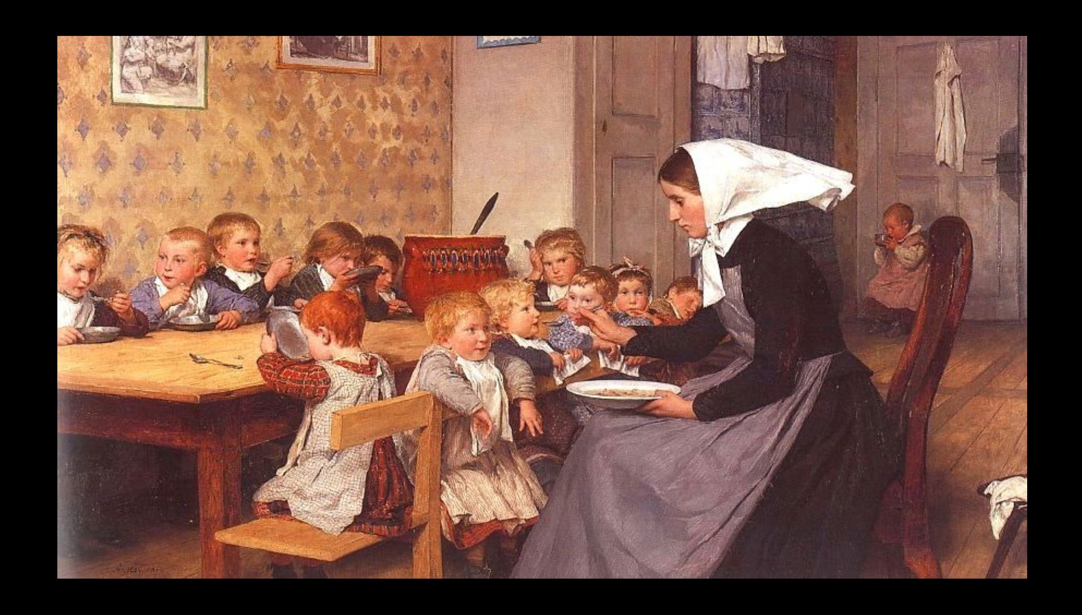
Creche -- Albert Anker