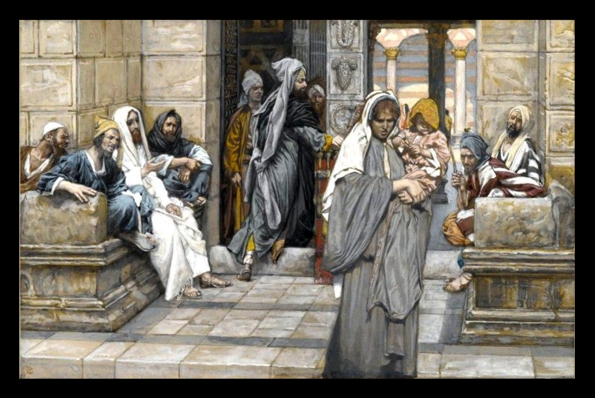
The Widow's Mite -- James Tissot, Brooklyn Museum, Brooklyn, NY