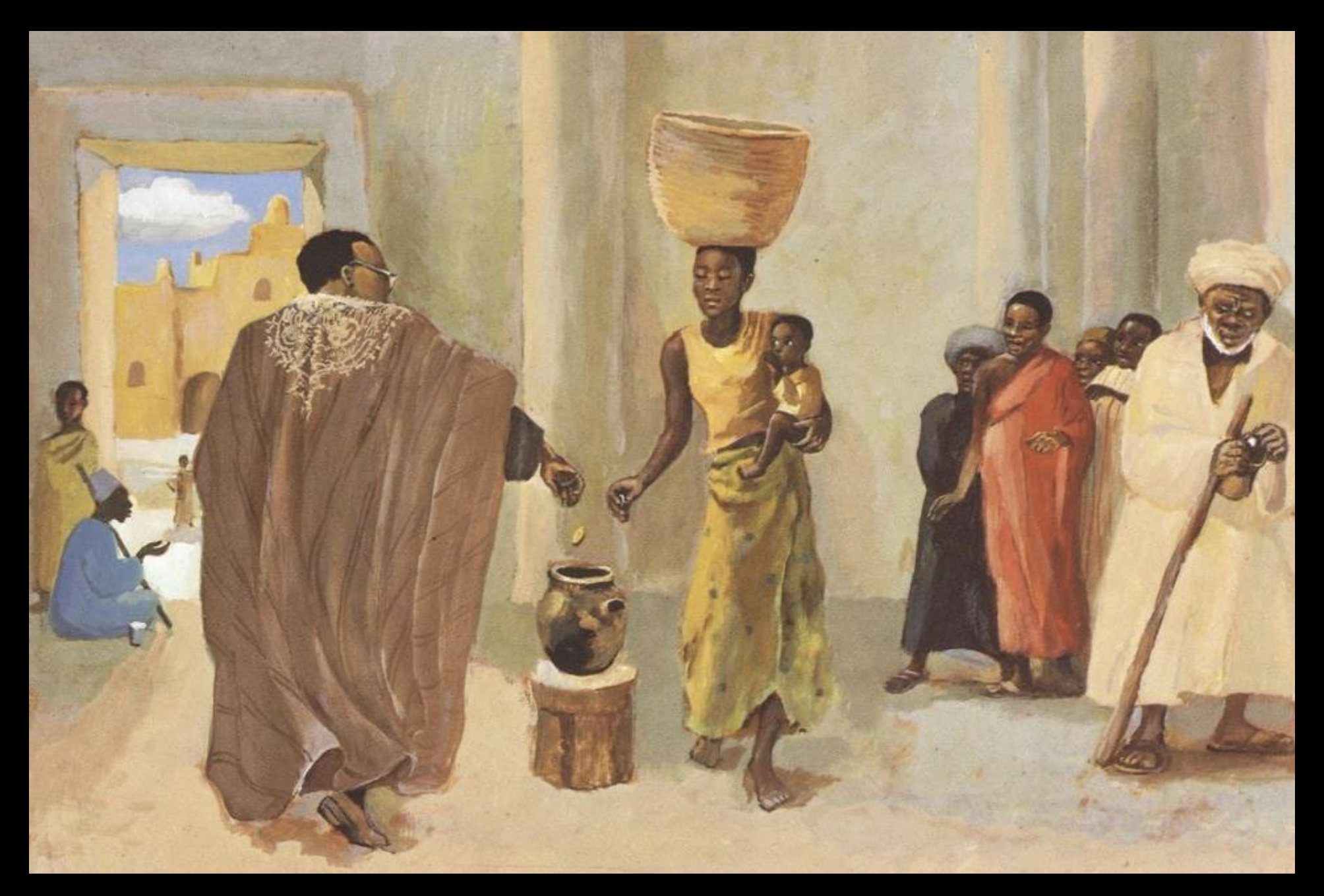
The Widow's Coin -- JESUS MAFA, Cameroon