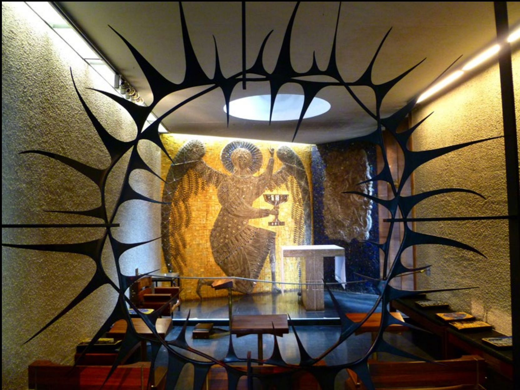
Gethsemane Chapel -- Coventry Cathedral, Coventry, England