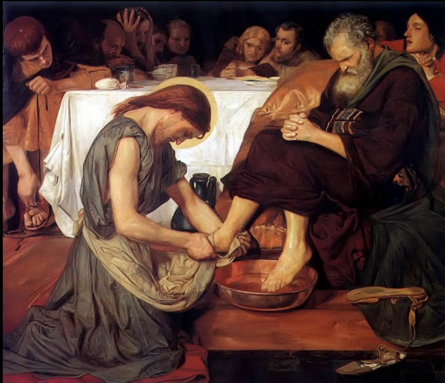
Christ Washes the Disciples' Feet -- Ford Madox Brown, Tate Britain, London, England