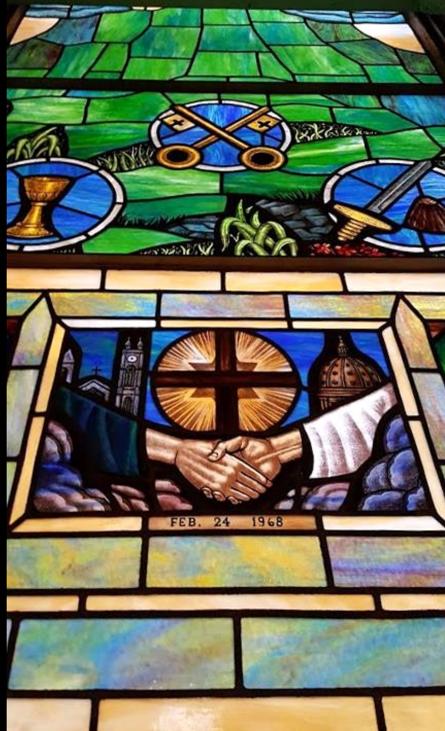
The Ecumenical Window