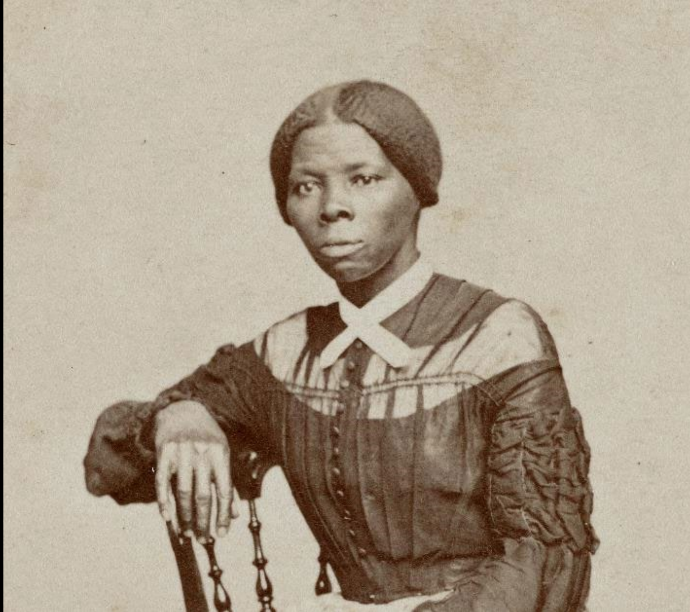
Harriet Tubman, known as the "Black Moses" Smithsonian National Museum of African American History & Culture