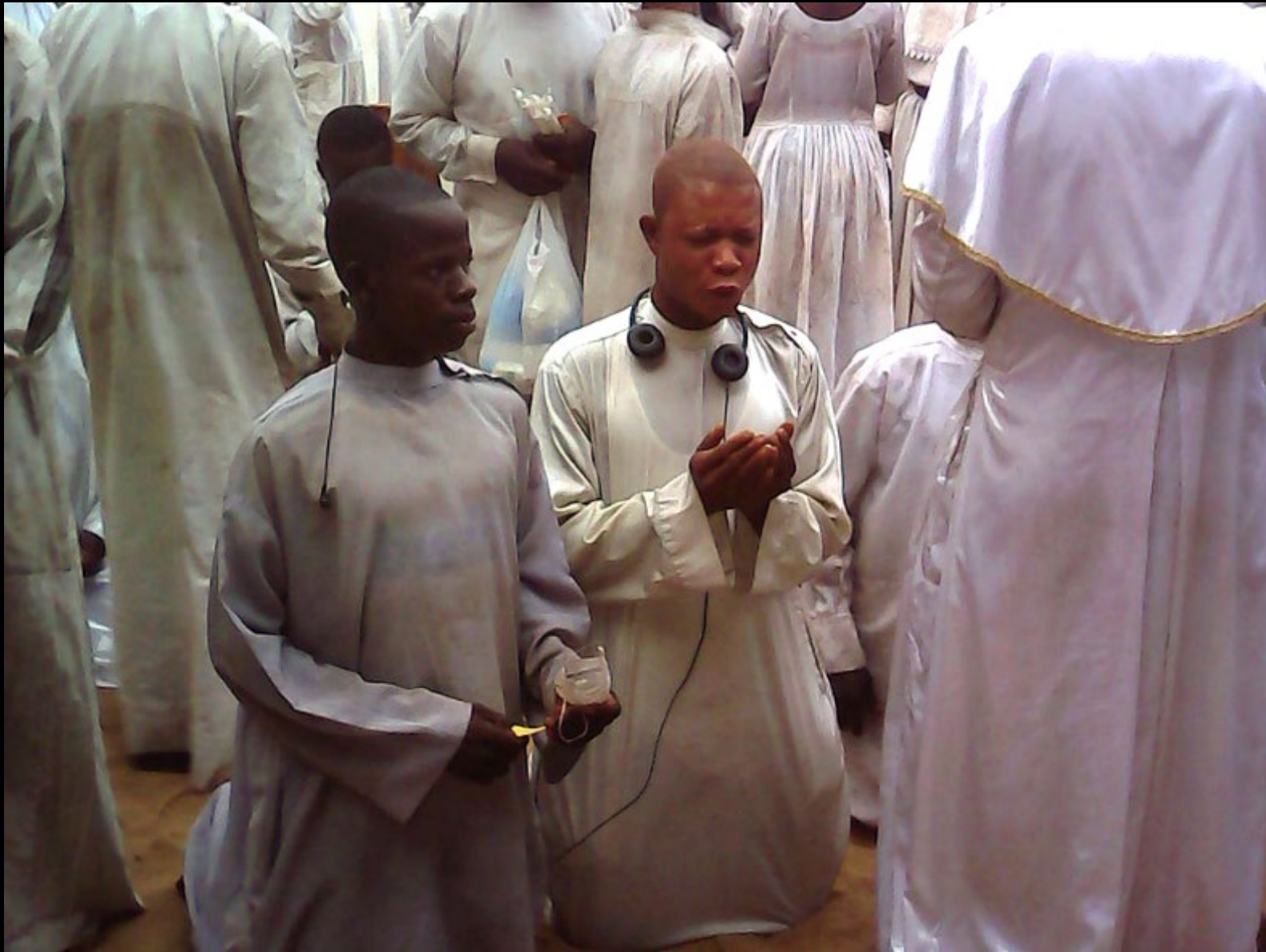
Pilgrimage Prayer -- Seme, Senegal