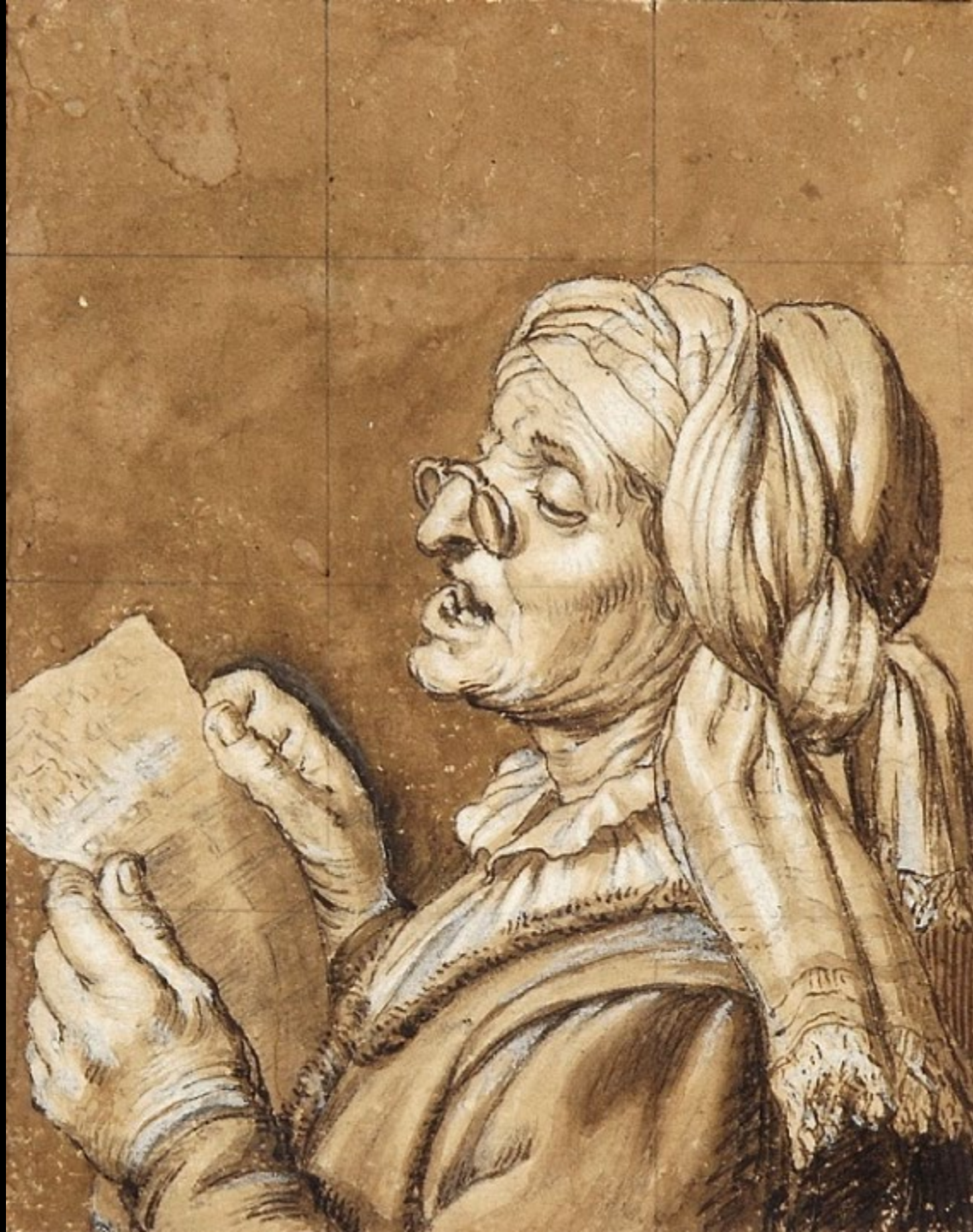
Woman Singing Gerard van Honthorst National Museum Warsaw, Poland