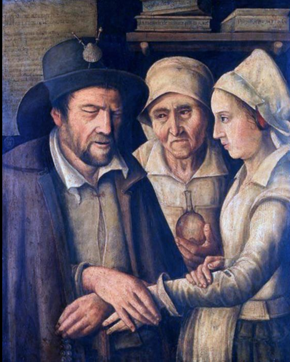
Healing by Laying On of Hands