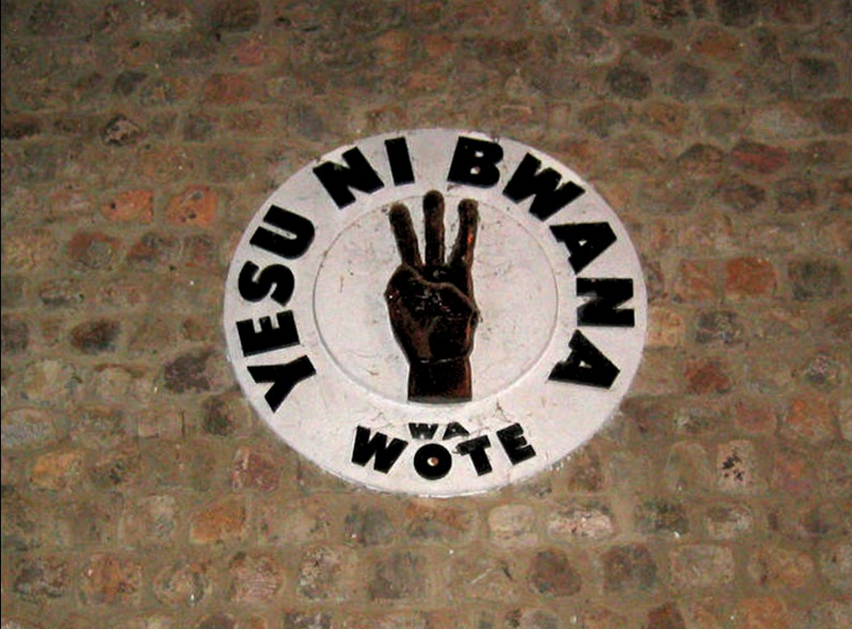
Jesus is Lord -- Mulungwishi Methodist Church, DR Congo