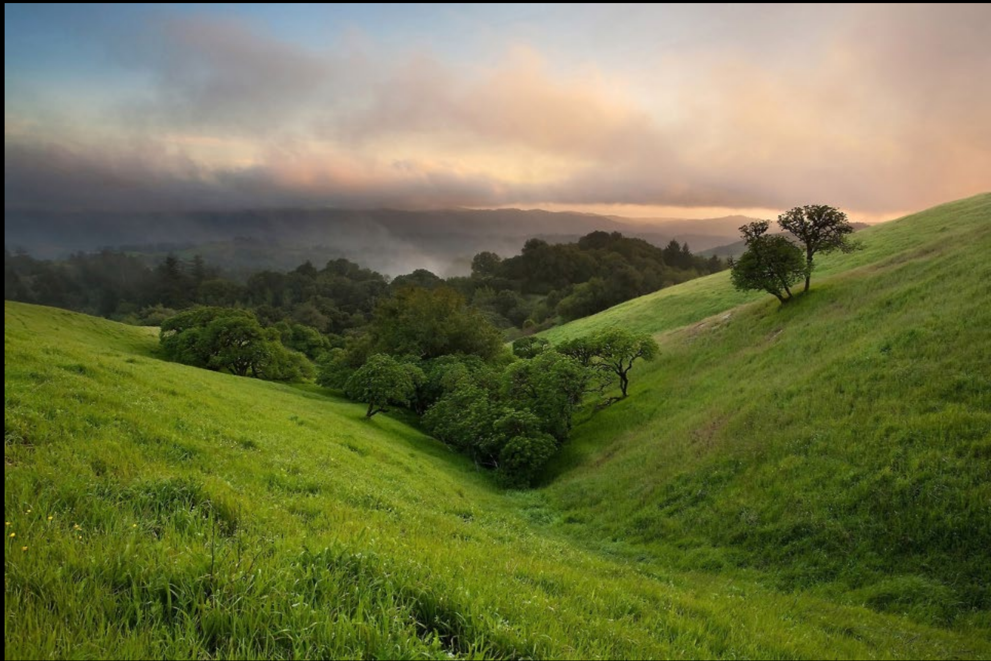
Earth's Beauty-- Russian Ridge Open Space, California