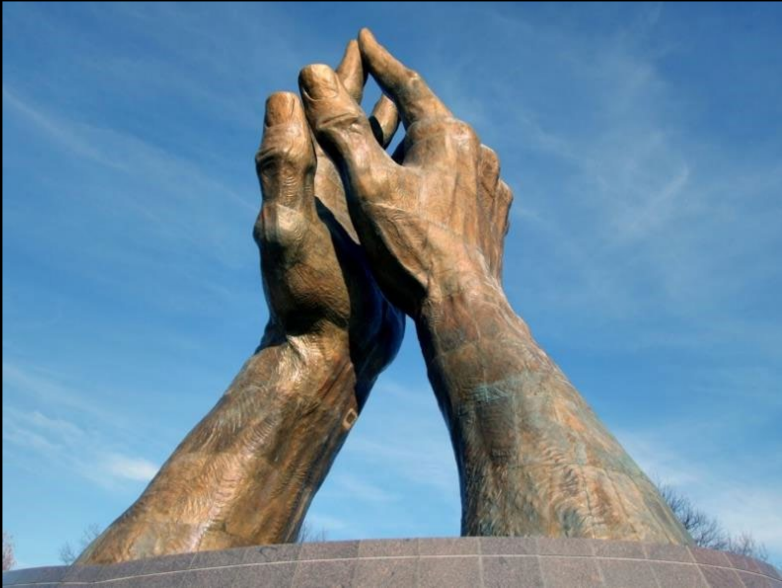
Healing Hands -- Oral Roberts University, Tulsa, Oklahoma