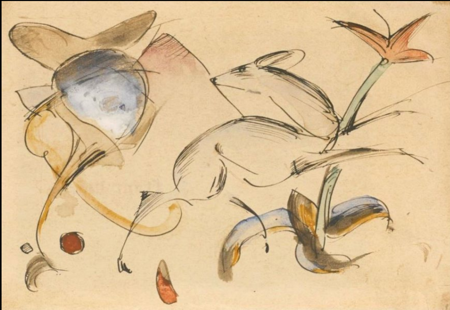
Deer Leaping Among Flowers – Franz Marc, 1912