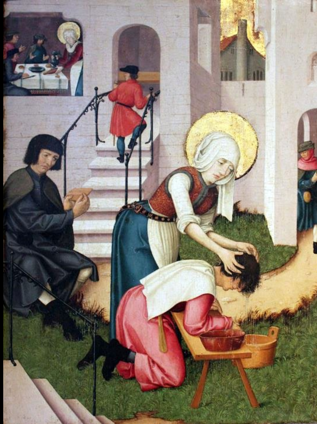
Saint Verena Washes the Hair of a Plague Patient

Landesmuseum Württemberg Württemberg, Germany