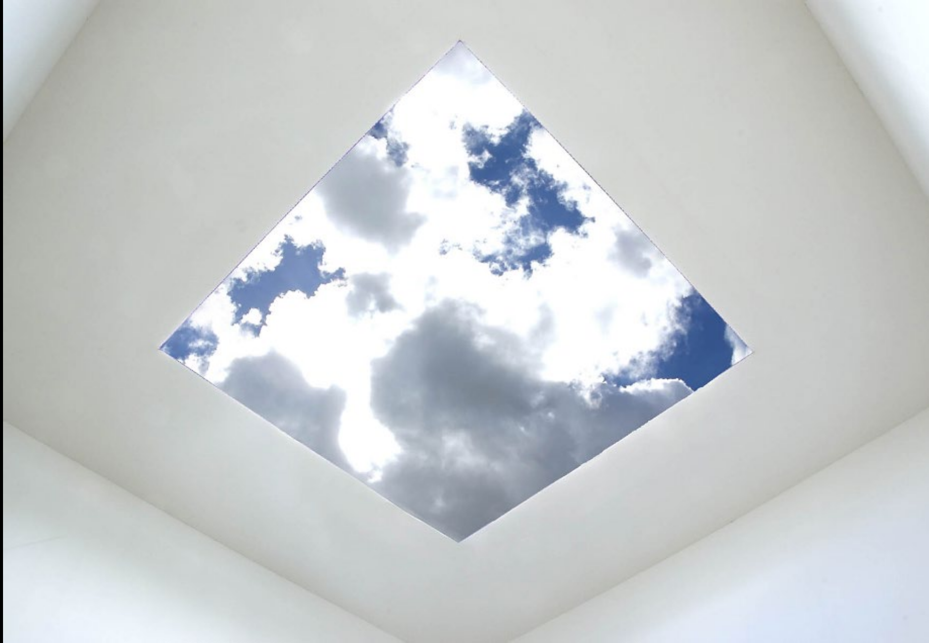
Skyspace -- James Turrell, Live Oak Meeting House, Houston, TX