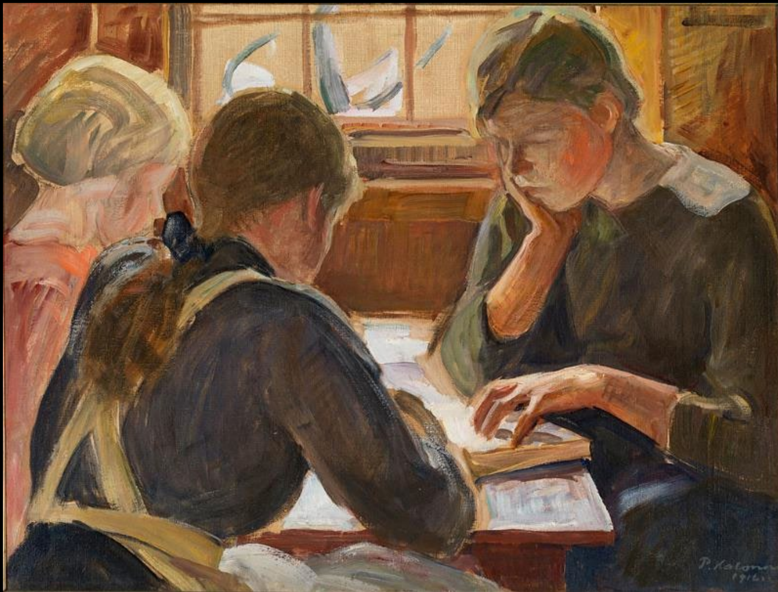
Children Reading -- Pekka Halonen, Espoo Museum of Art, Espoo, Finland