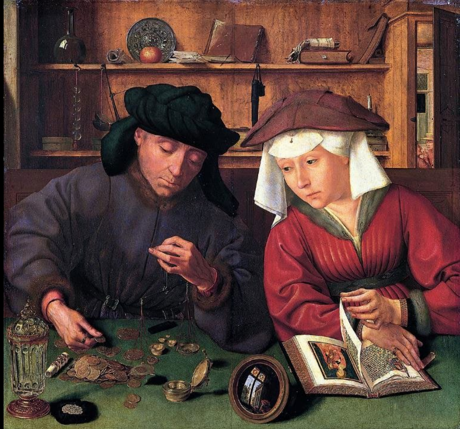
The Moneylender and his Wife

Quentin Matsys Louvre Museum Paris, France