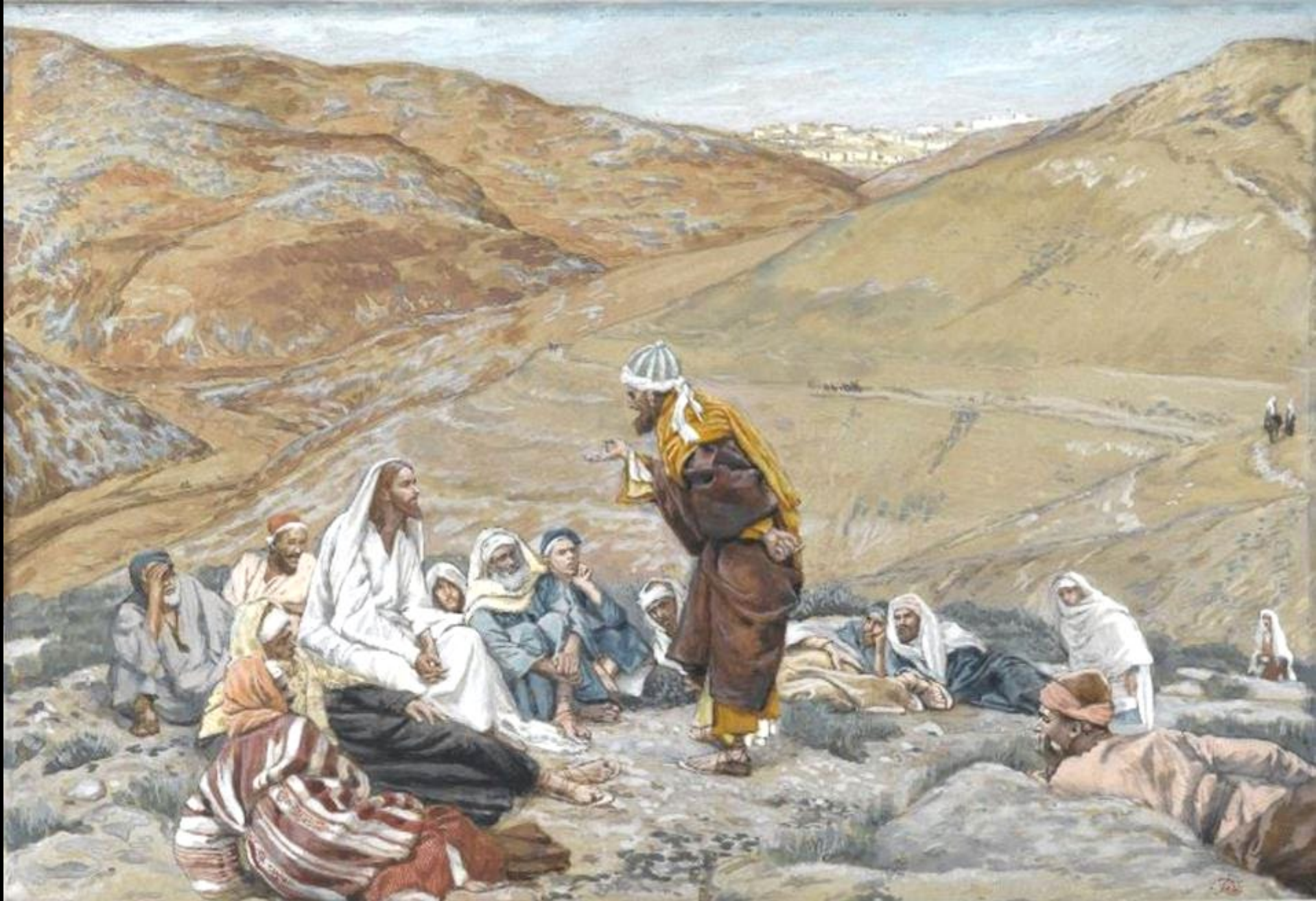
A Scribe Speaks to Jesus -- James Tissot, Brooklyn Museum, Brooklyn, NY