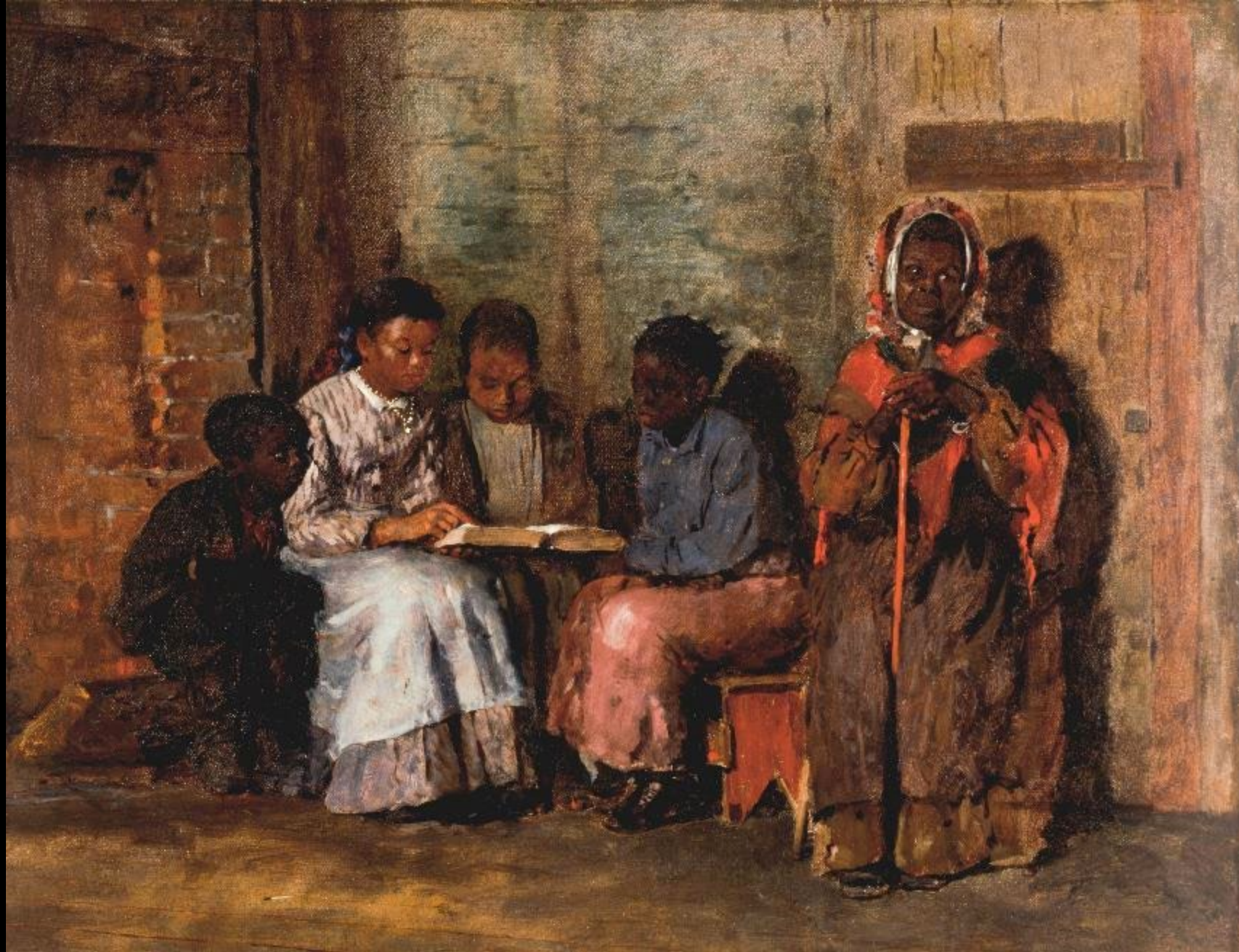
Sunday Morning -- Winslow Homer, Cincinnati Art Museum, Cincinnati, OH