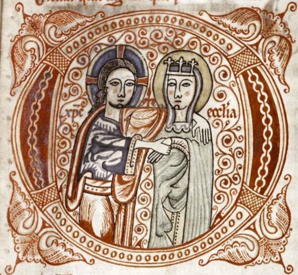
Christ and Ecclesia

Omnia precellit xpi dilectio pl Oscula qua signat que poscunt corda serena