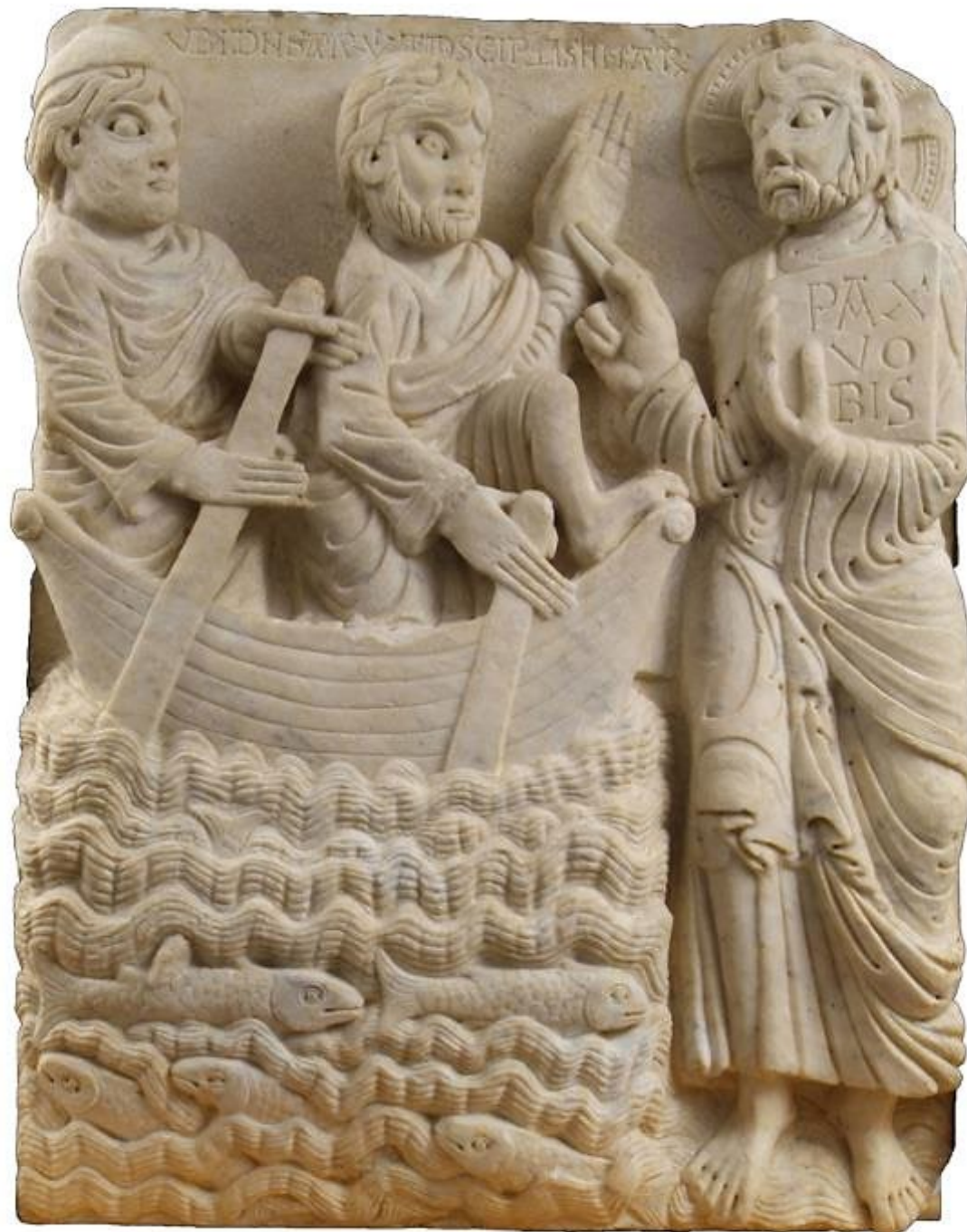
Christ Walking on the Water