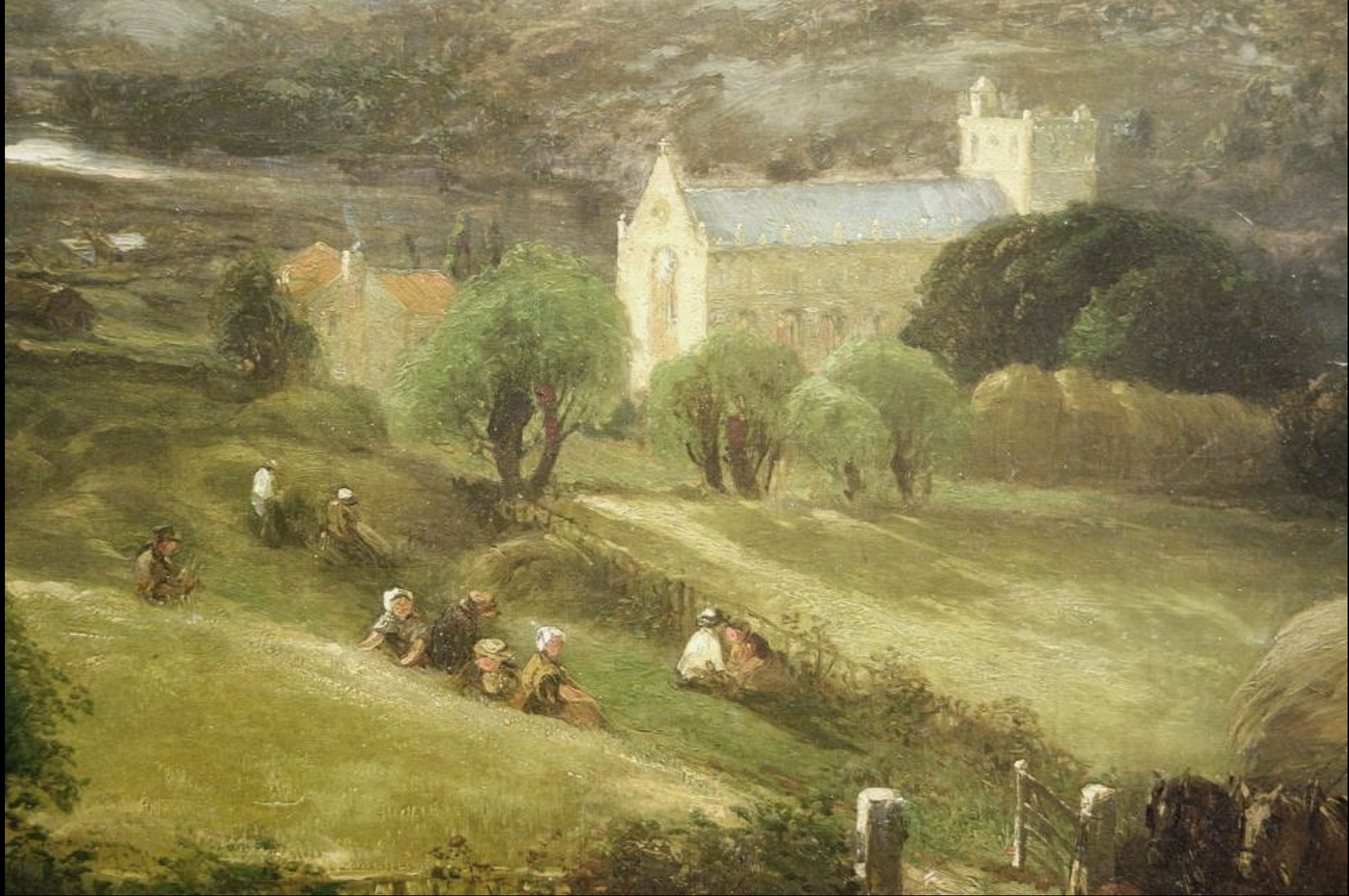
Peace and Plenty -- William Hart, New Britain Museum of American Art, New Britain, CT