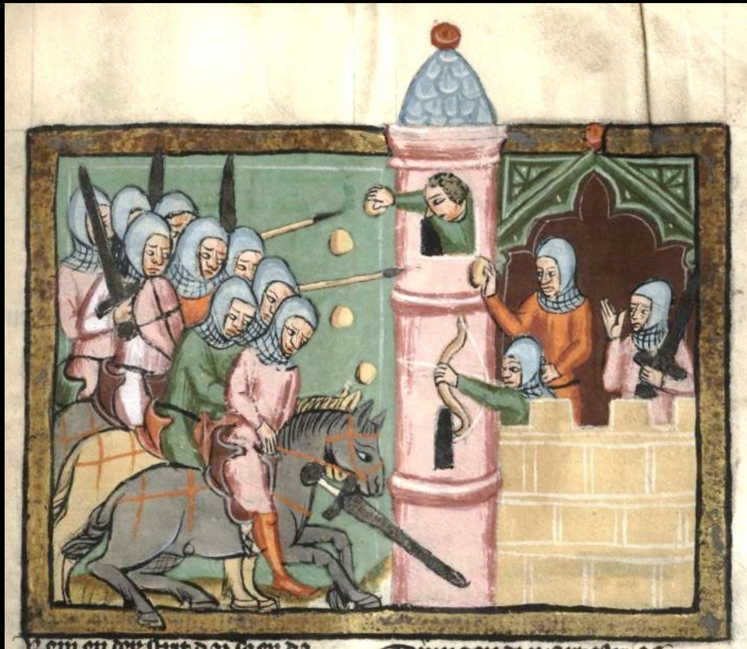
Uriah Falls at the Siege of Rabbas -- Rudolf von Ems, World Chronicle, Fulda University Library, Germany