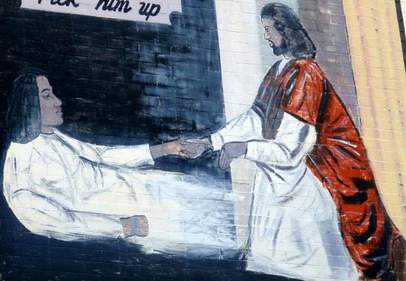
"Don't Look Down..." -- Mural, Washington, DC

Don't Look down on a man... Unless you gonna Pick him up