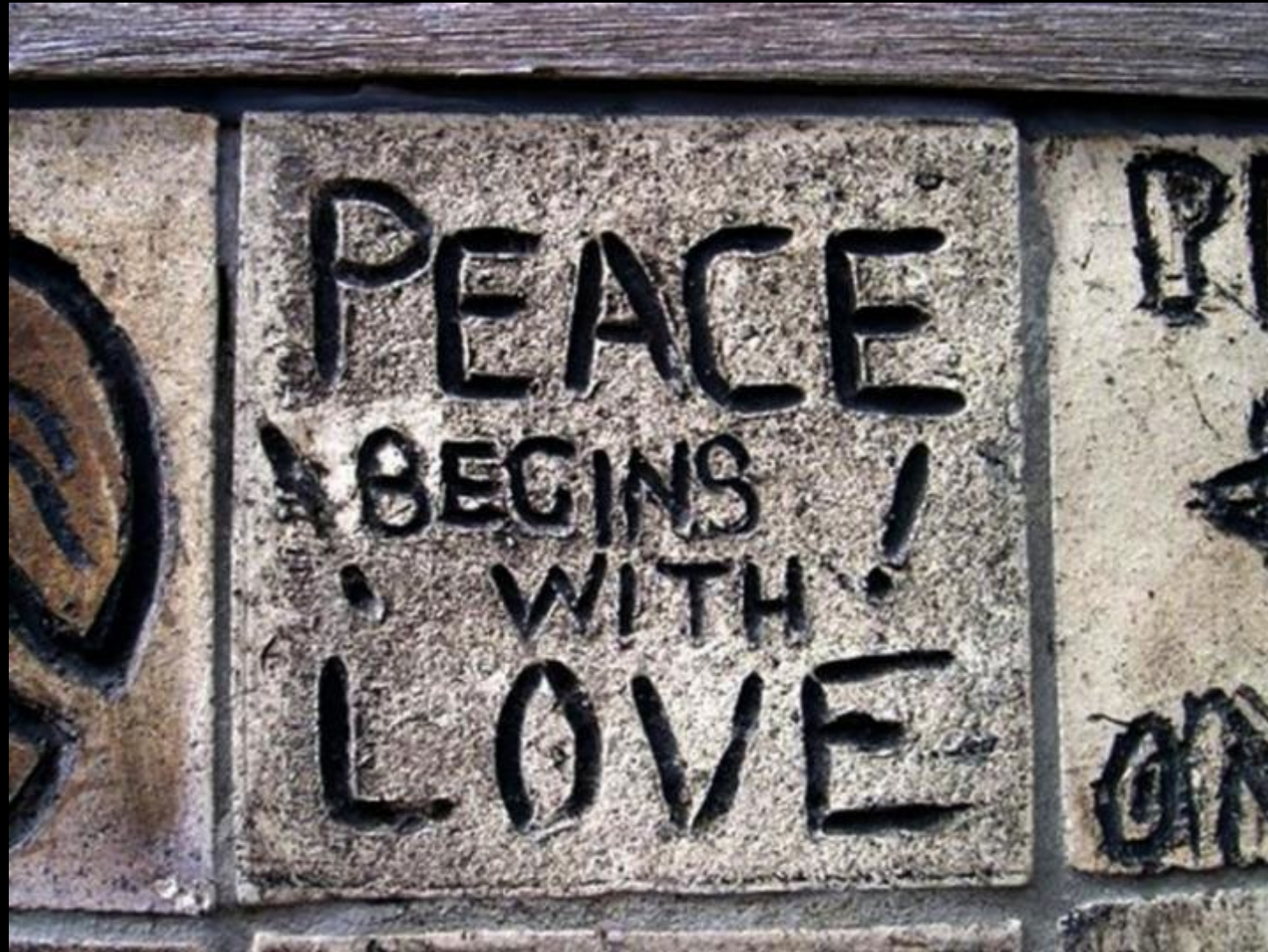
Peace Begins with Love -- Peace Wall, Hamilton, New Zealand