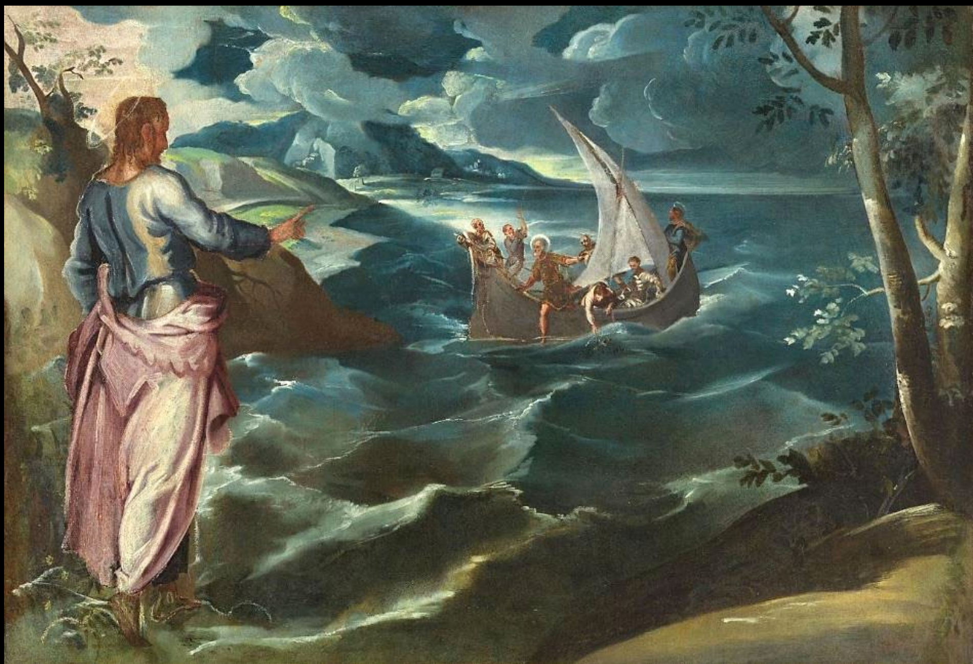
Christ at the Sea of Galilee -- Tintoretto, National Gallery of Art, Washington, DC