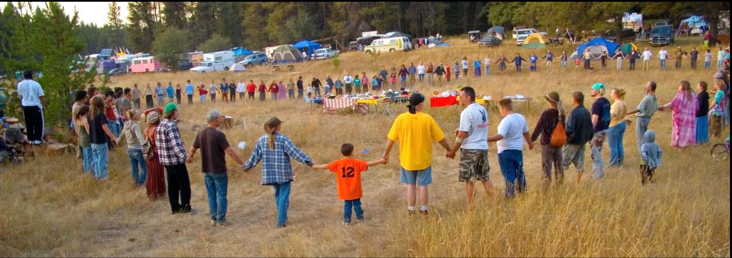
Potluck, First Lutheran Church -- Tyson Creek Station, Idaho