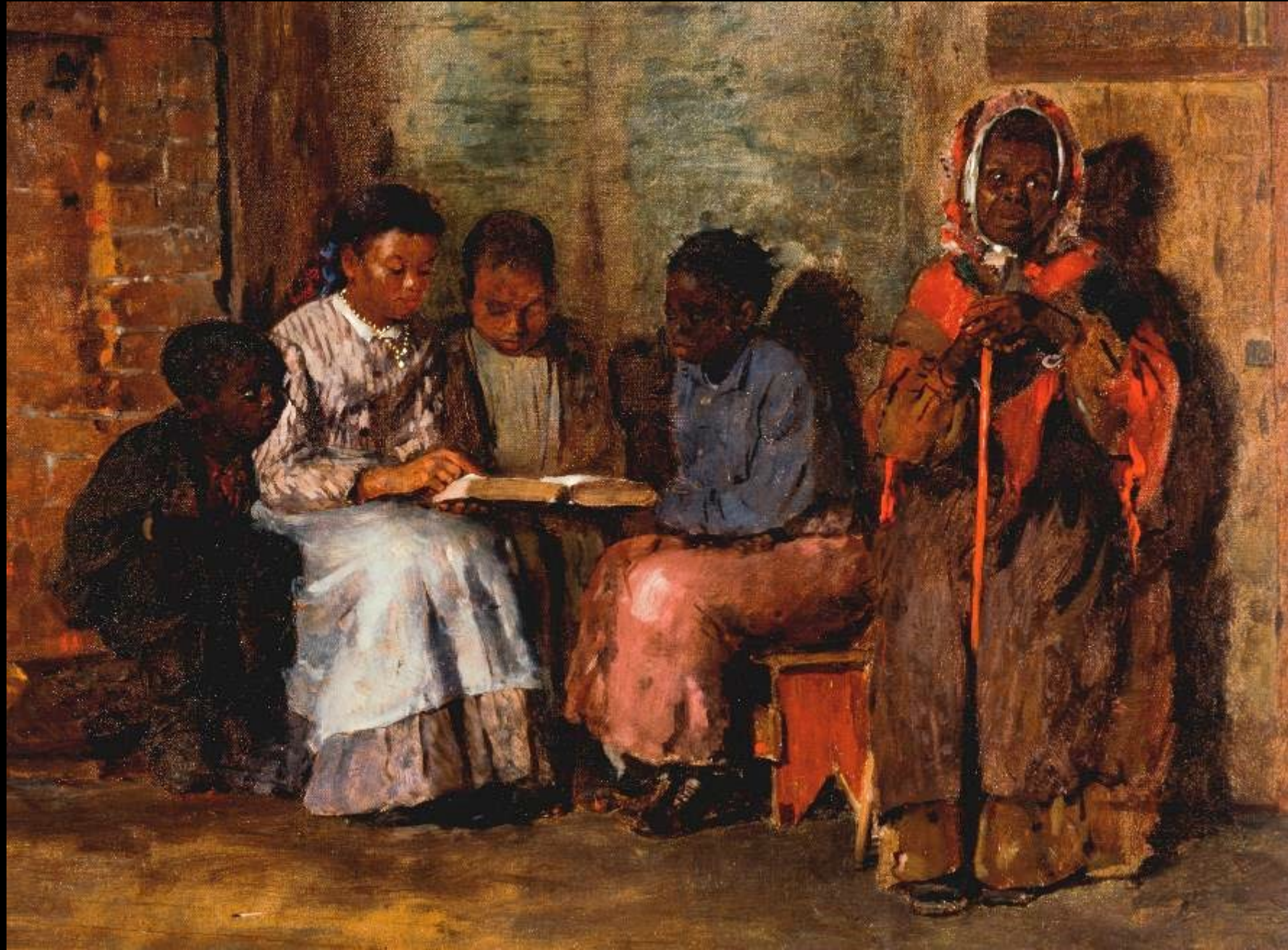
Sunday Morning in Virginia -- Winslow Homer, Cincinnati Art Museum, Cincinnati, OH