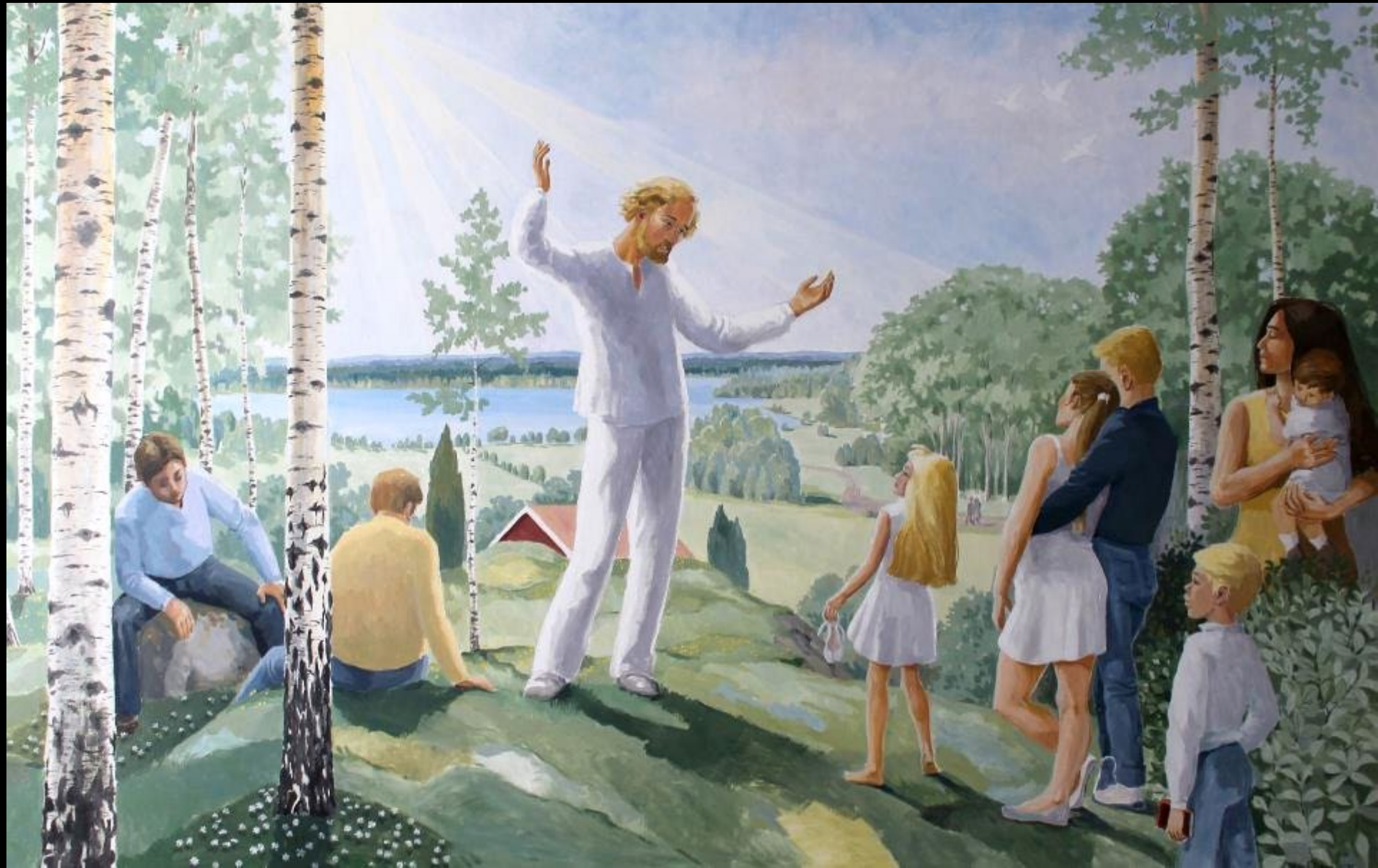
Jesus Preaching in the Present -- Soraby Kyrka, Rottne, Sweden