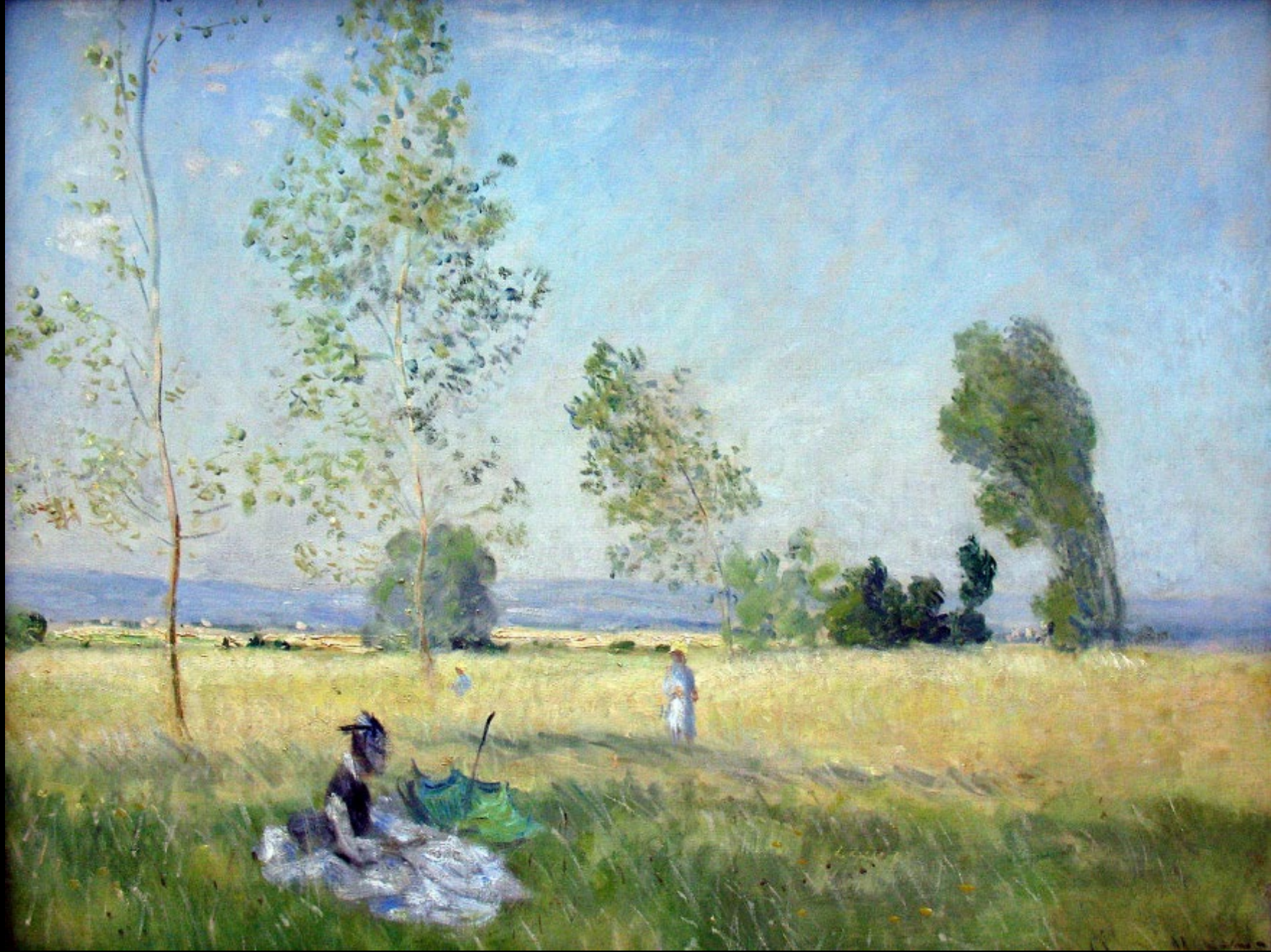
Summer -- Claude Monet, Alte Nationalgalerie, Berlin, Germany