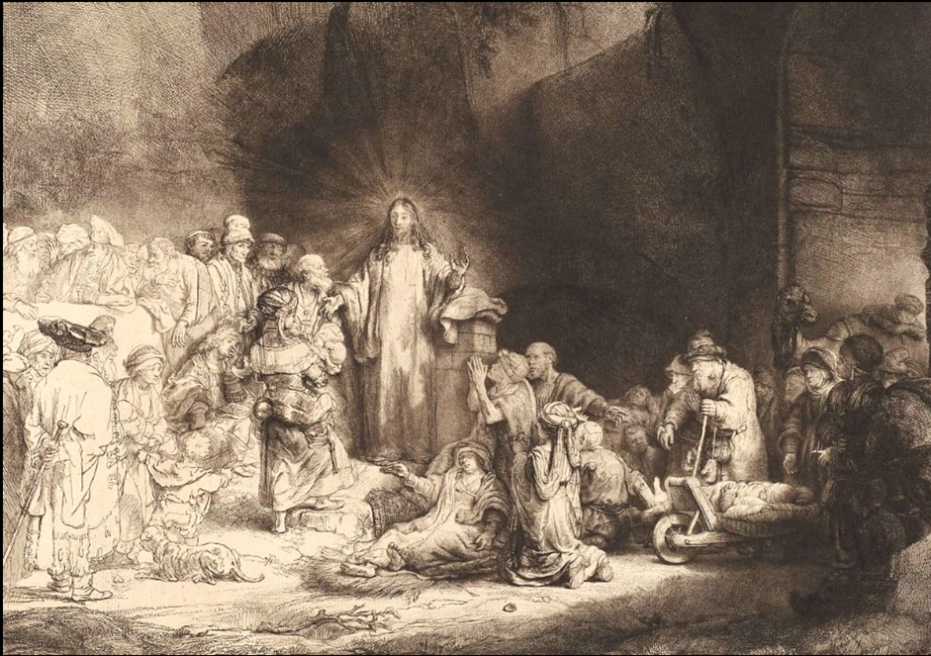
Christ Preaching -- Rembrandt, Rijksmuseum, Amsterdam, Netherlands