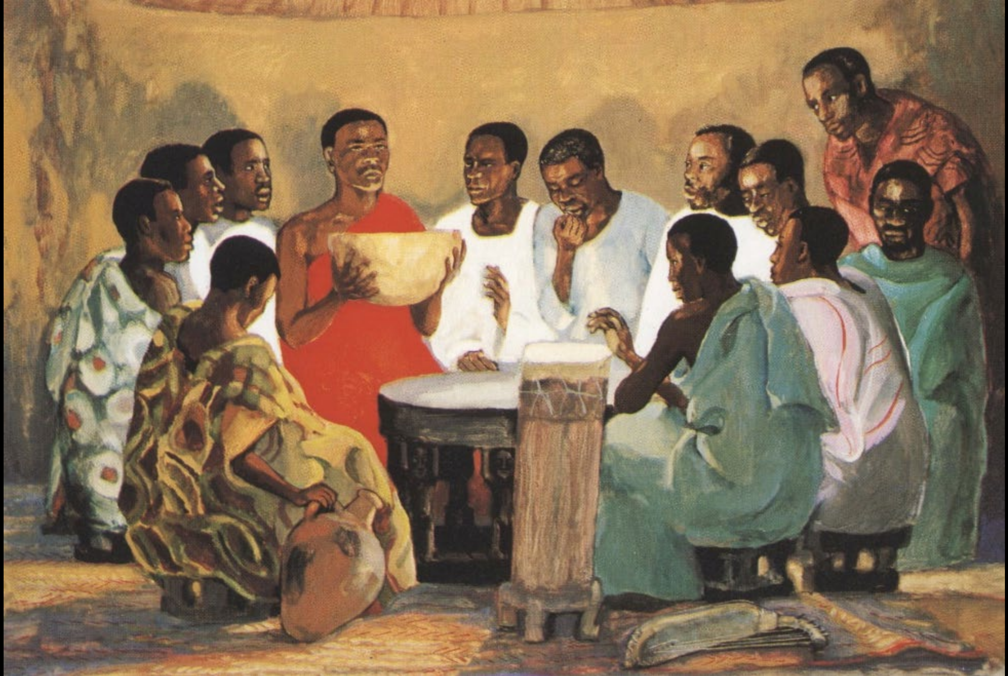
The Lord's Supper -- JESUS MAFA, Cameroon