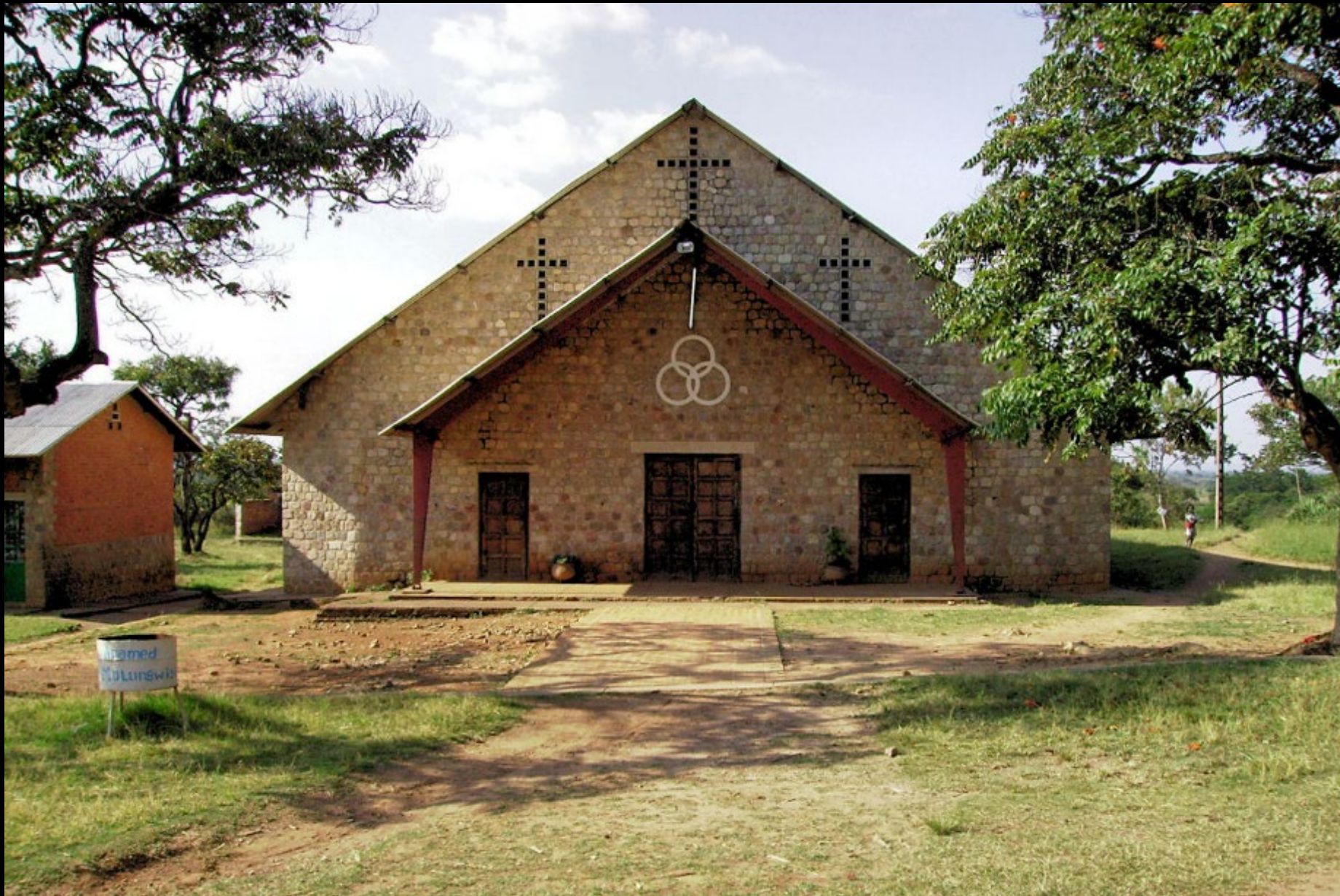
Mulungwishi United Methodist Church, Mulungwishi, Democratic Republic of Congo