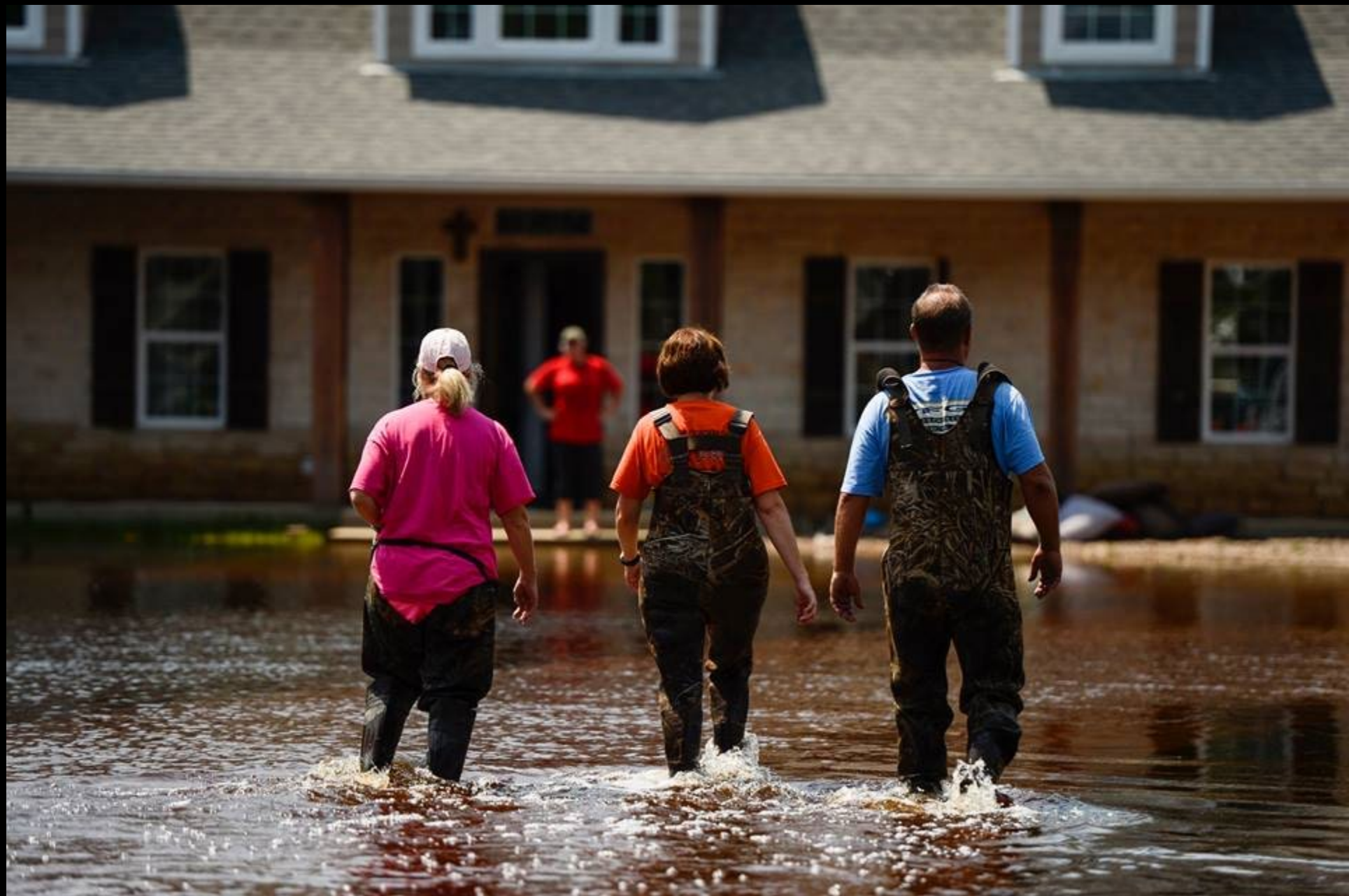
Hurricane Harvey Relief -- Orange, Texas