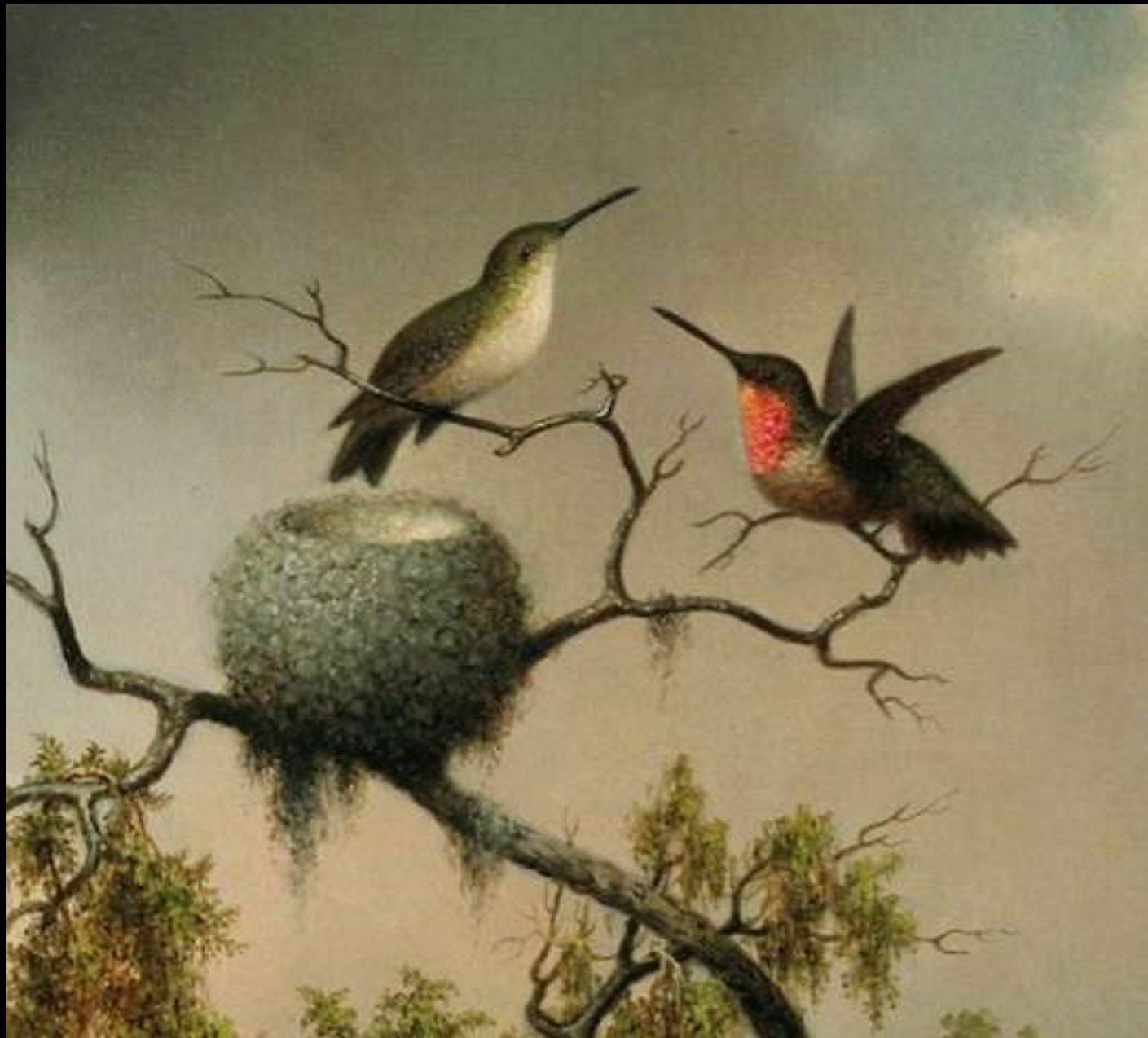
Hummingbirds with Nest -- Martin Heade, Museum of Fine Arts, Boston