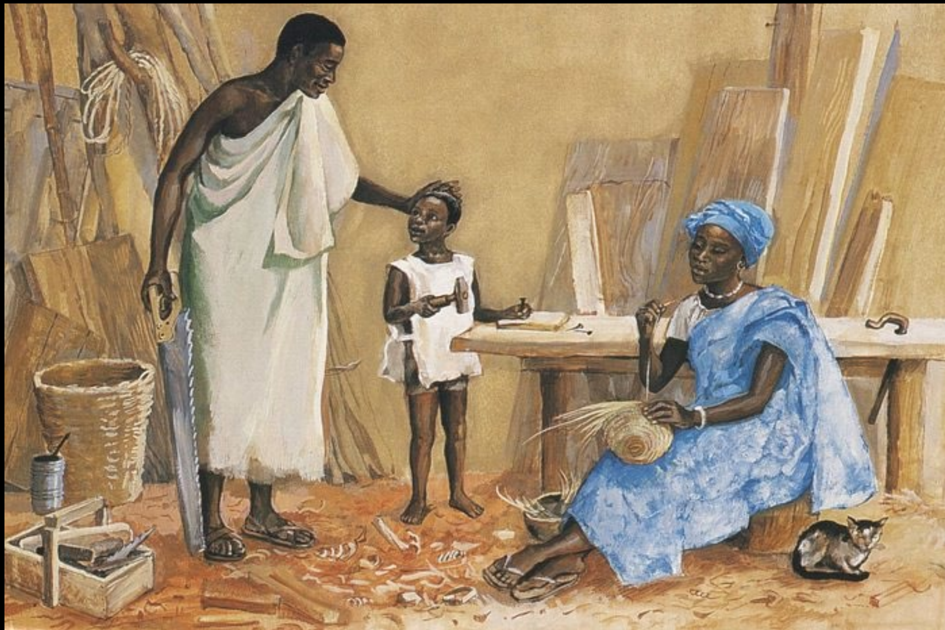
Joseph, Jesus and Mary in Nazareth -- JESUS MAFA