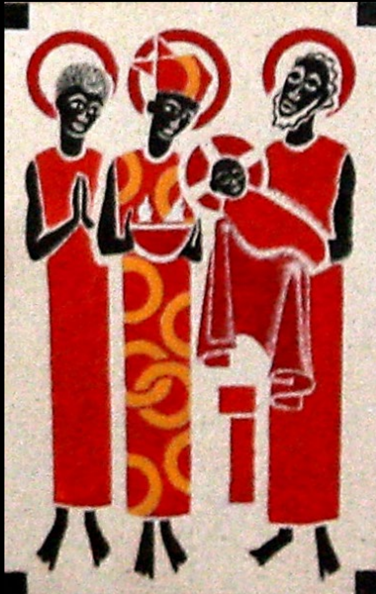
Presentation in the Temple