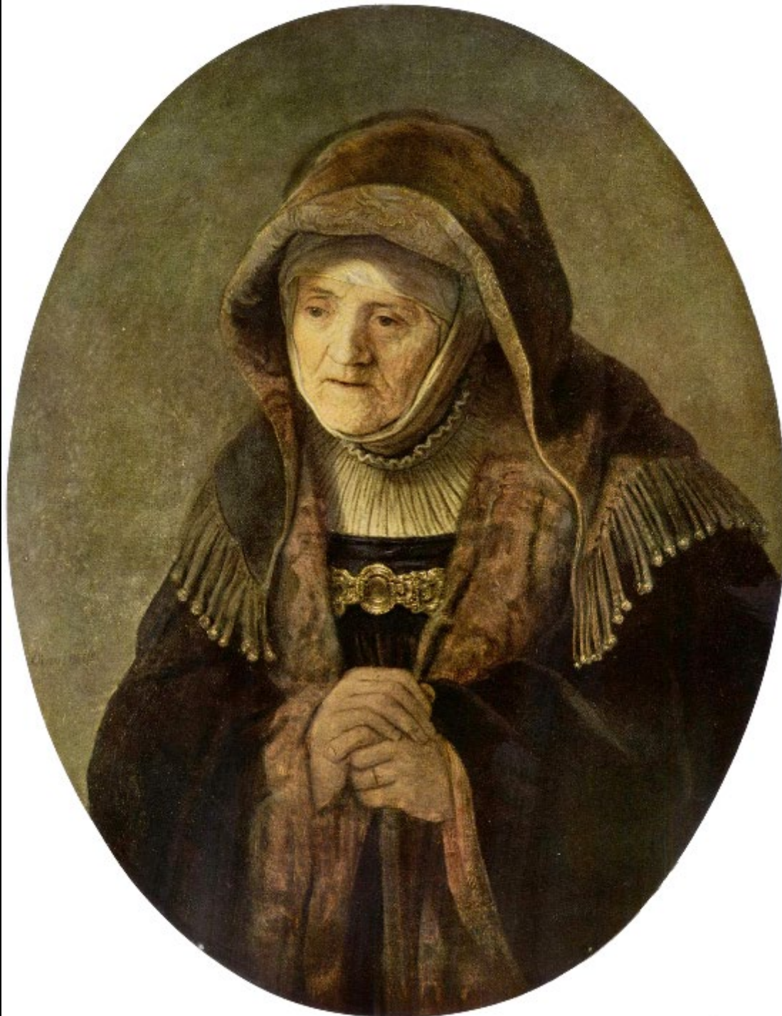
The Prophetess Anna

Rembrandt Kunsthistorisches Museum Vienna, Austria