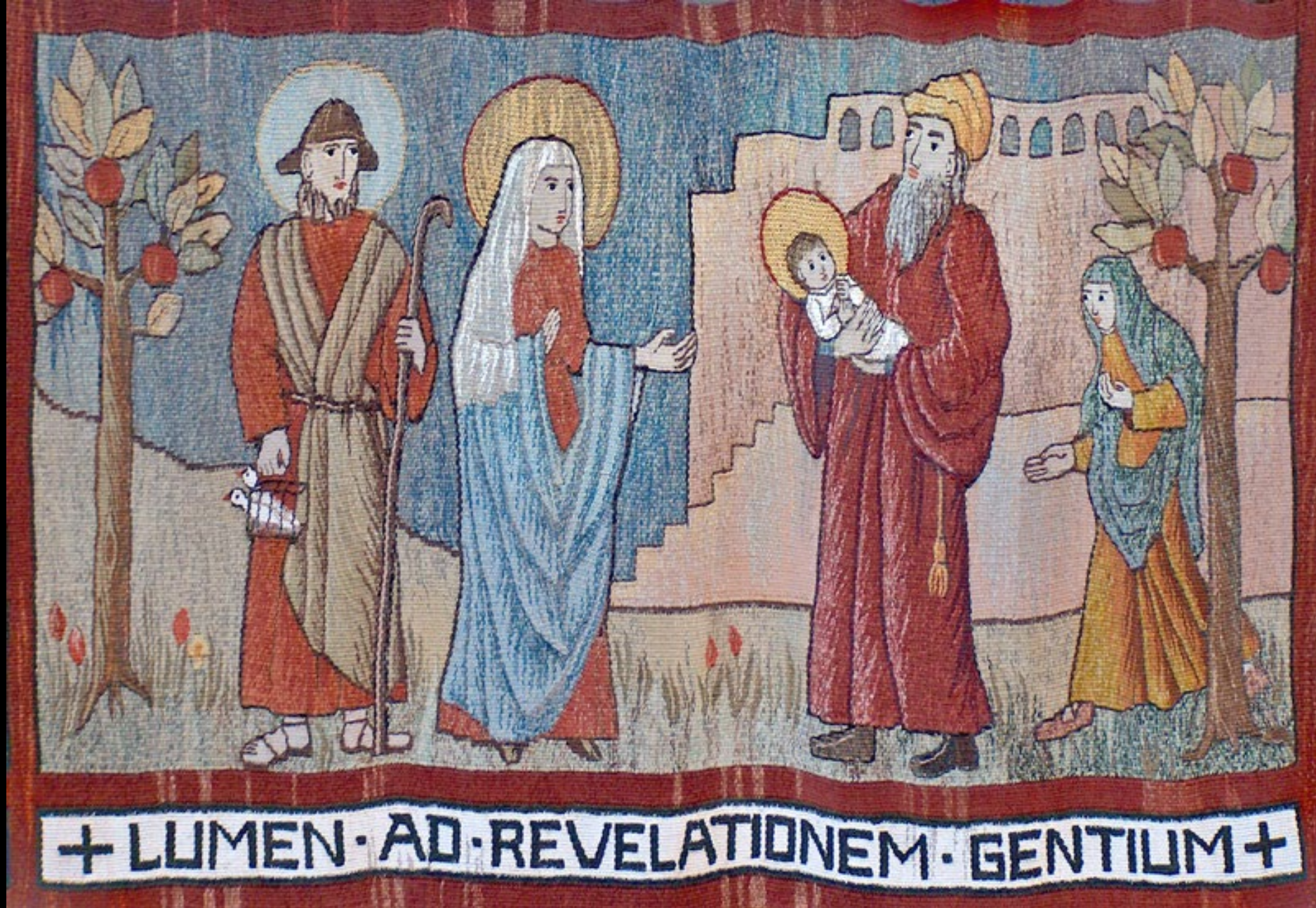
Presentation in the Temple -- Abbey of St. Walburga, Virginia Dale, CO