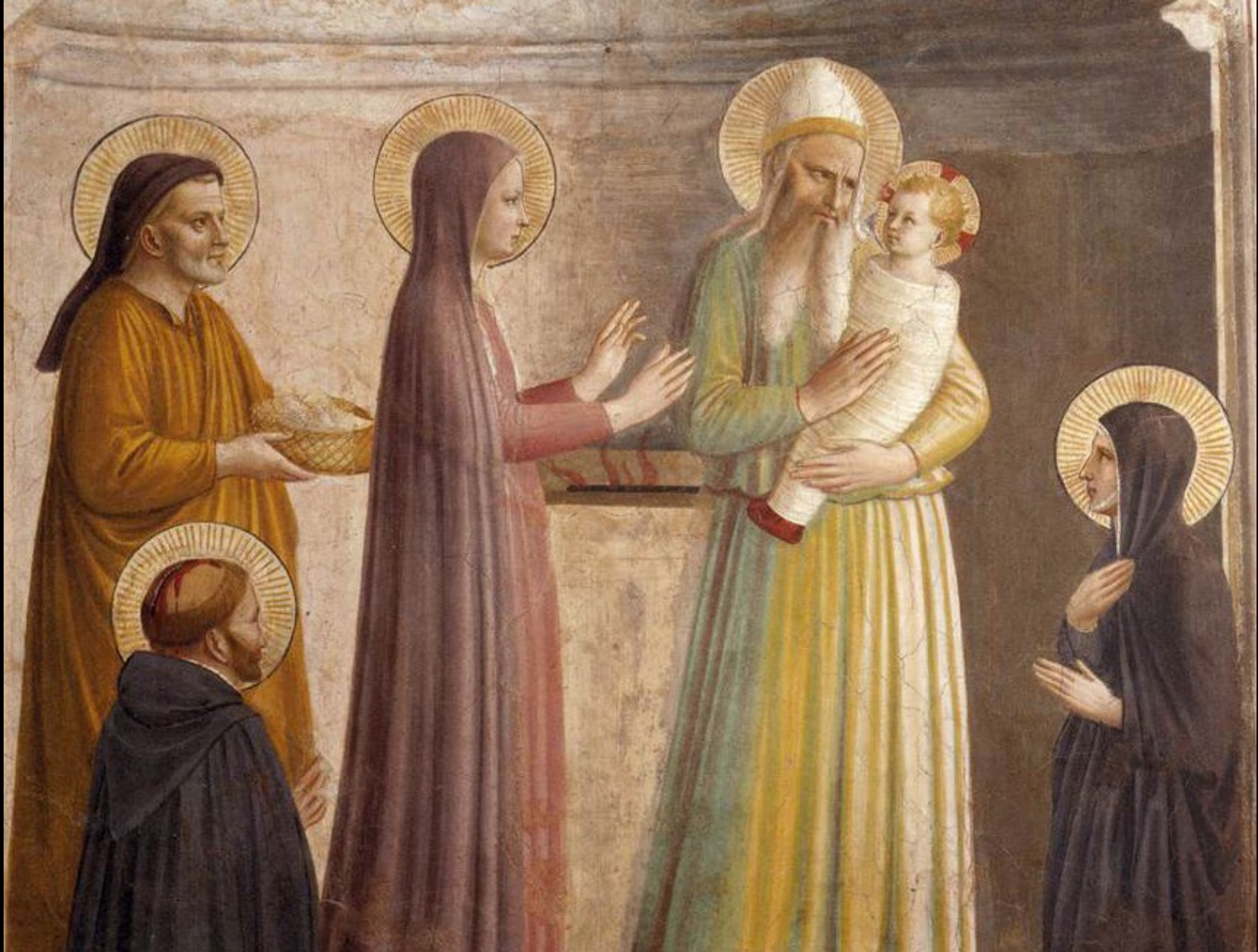
Presentation in the Temple -- Fra Angelico, Museum of San Marco, Florence, Italy