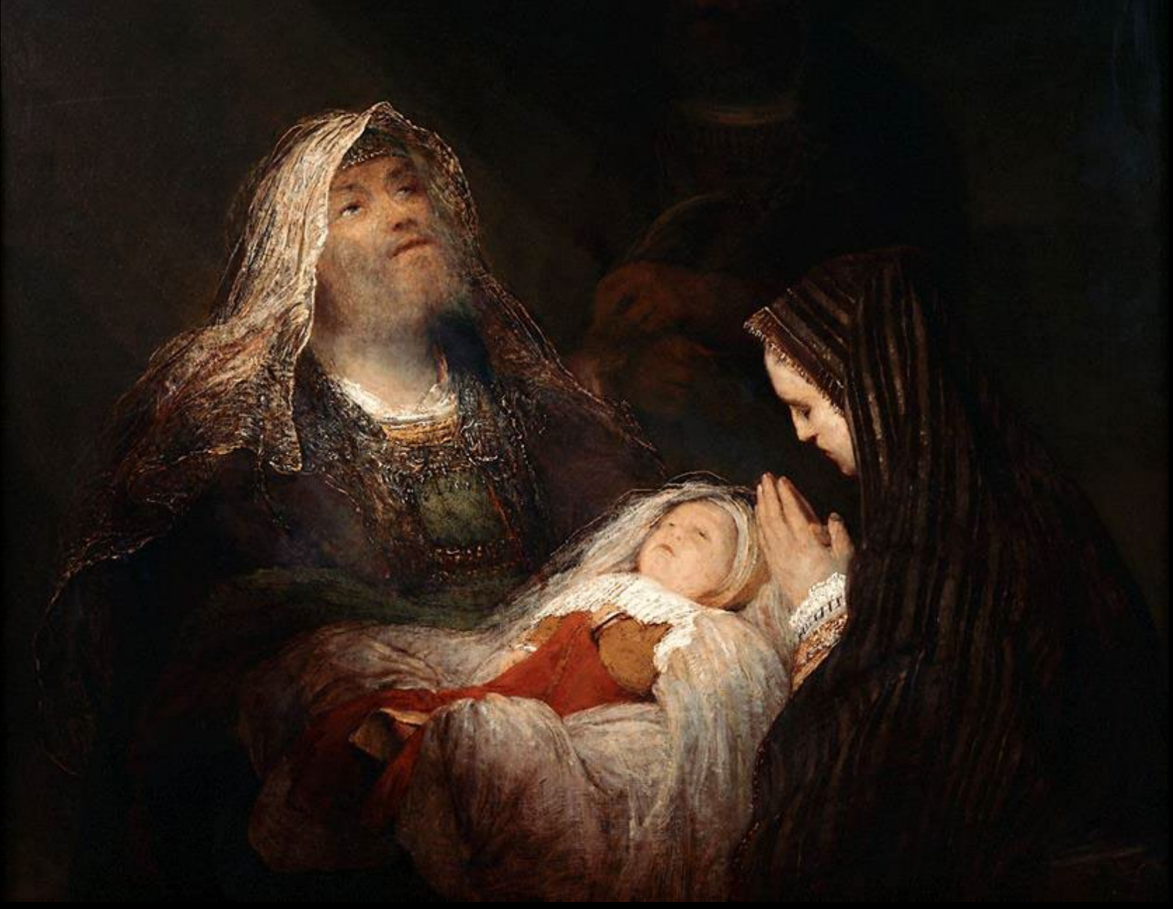
Simeon's Song of Praise (Nunc Dimittis) -- Aert de Gelder, Mauritshuis, Hague, Netherlands