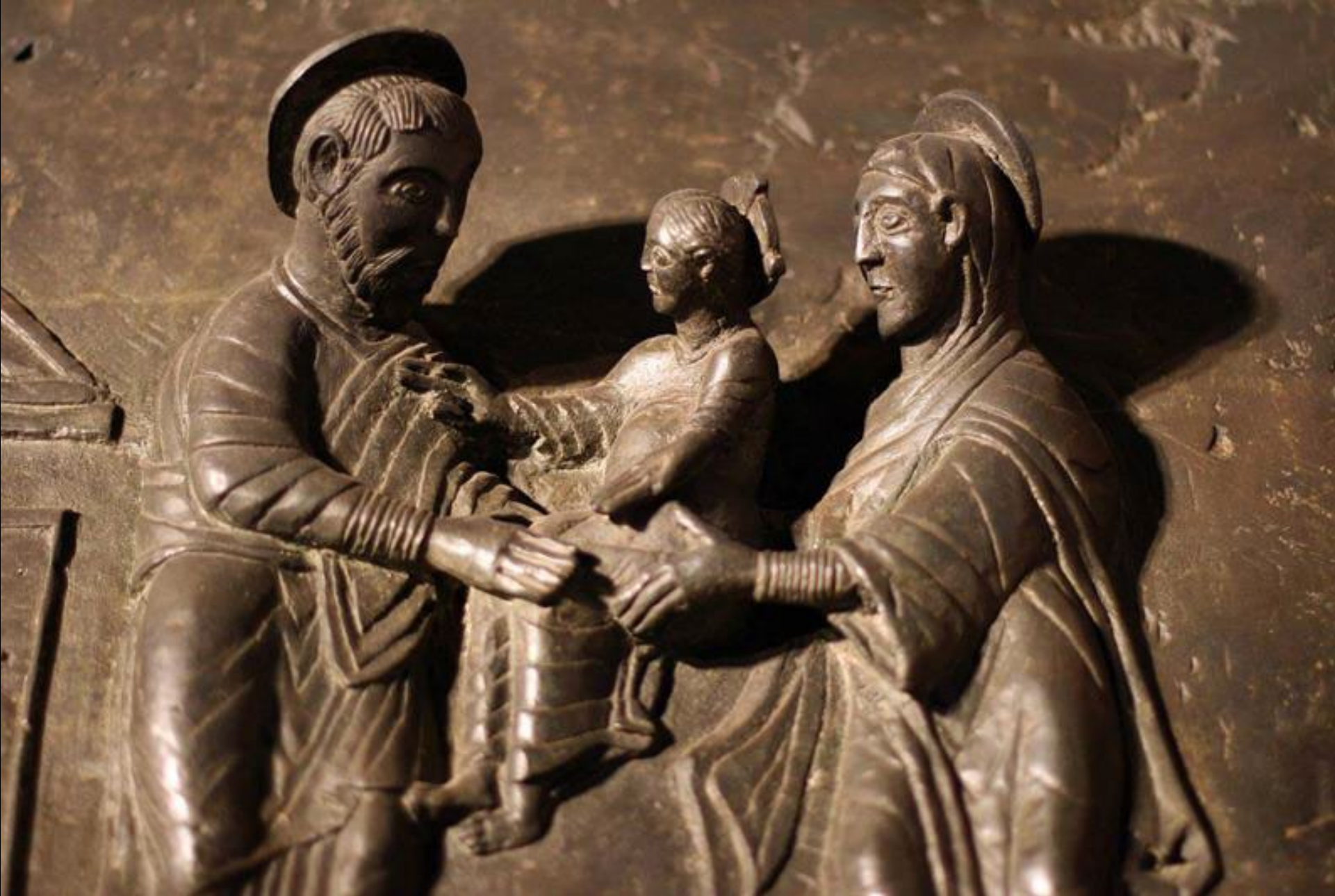
Presentation in the Temple -- Bernward's Doors, Hildesheim Cathedral, Hildesheim, Germany