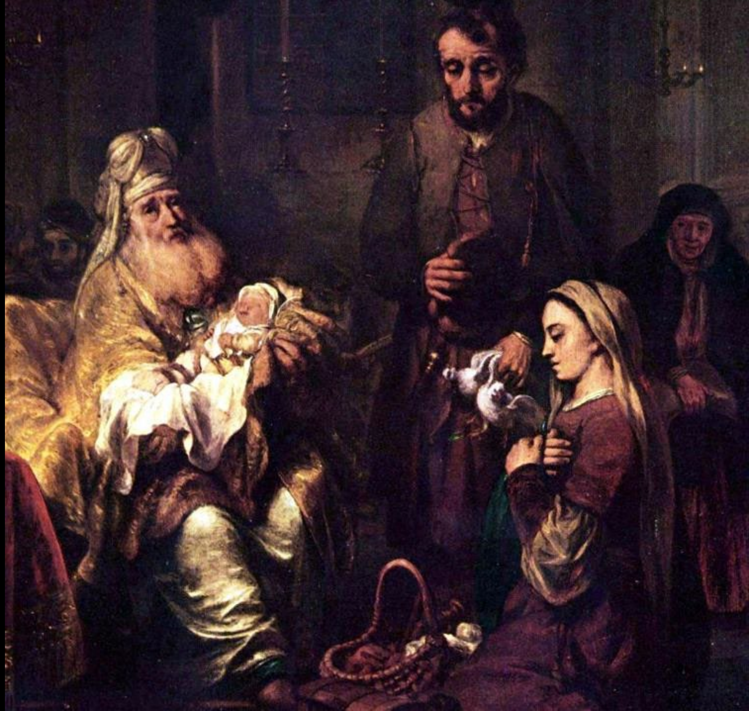
Presentation in the Temple G. Van den Eeckhout Museum of Fine Arts Budapest, Hungary