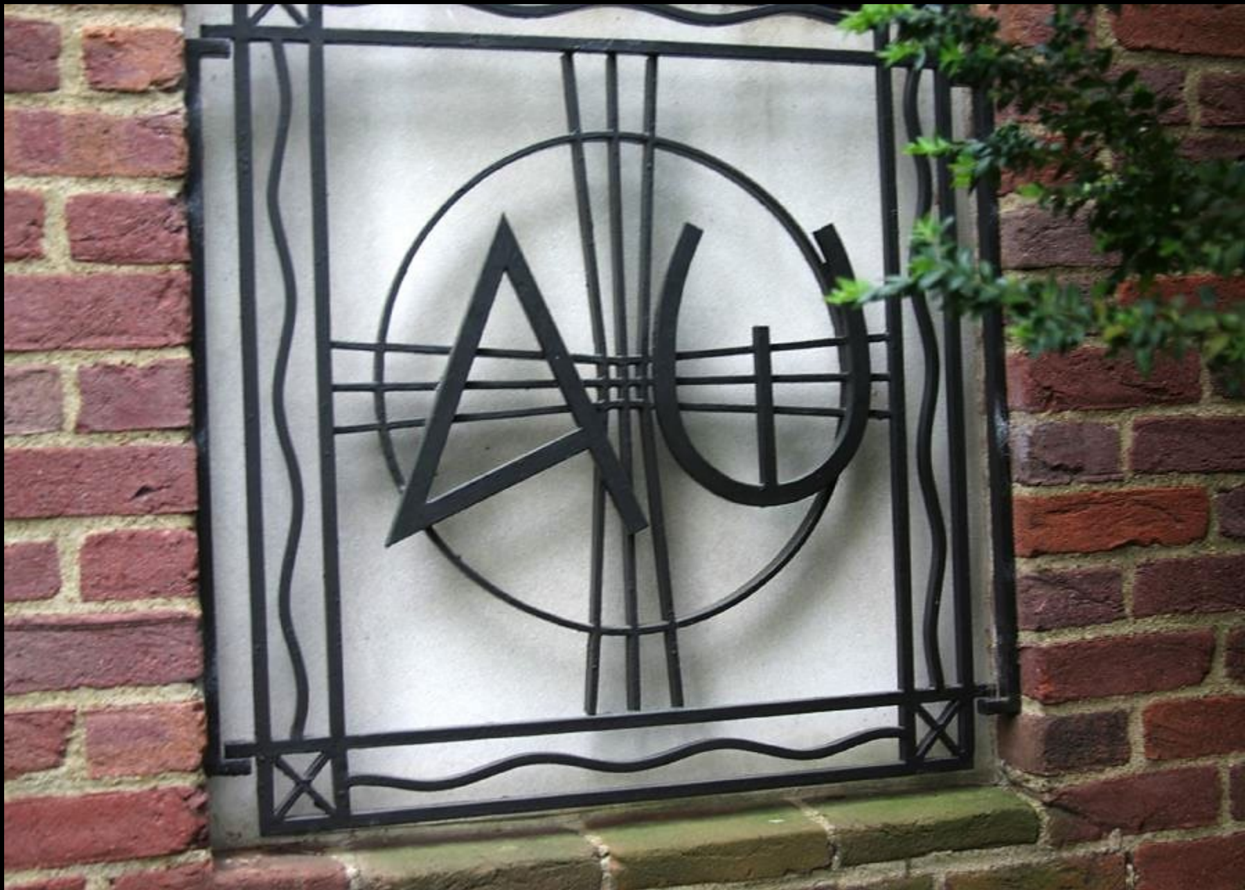
Alpha and Omega -- Metalwork, Benton Chapel, Vanderbilt University, Nashville, TN