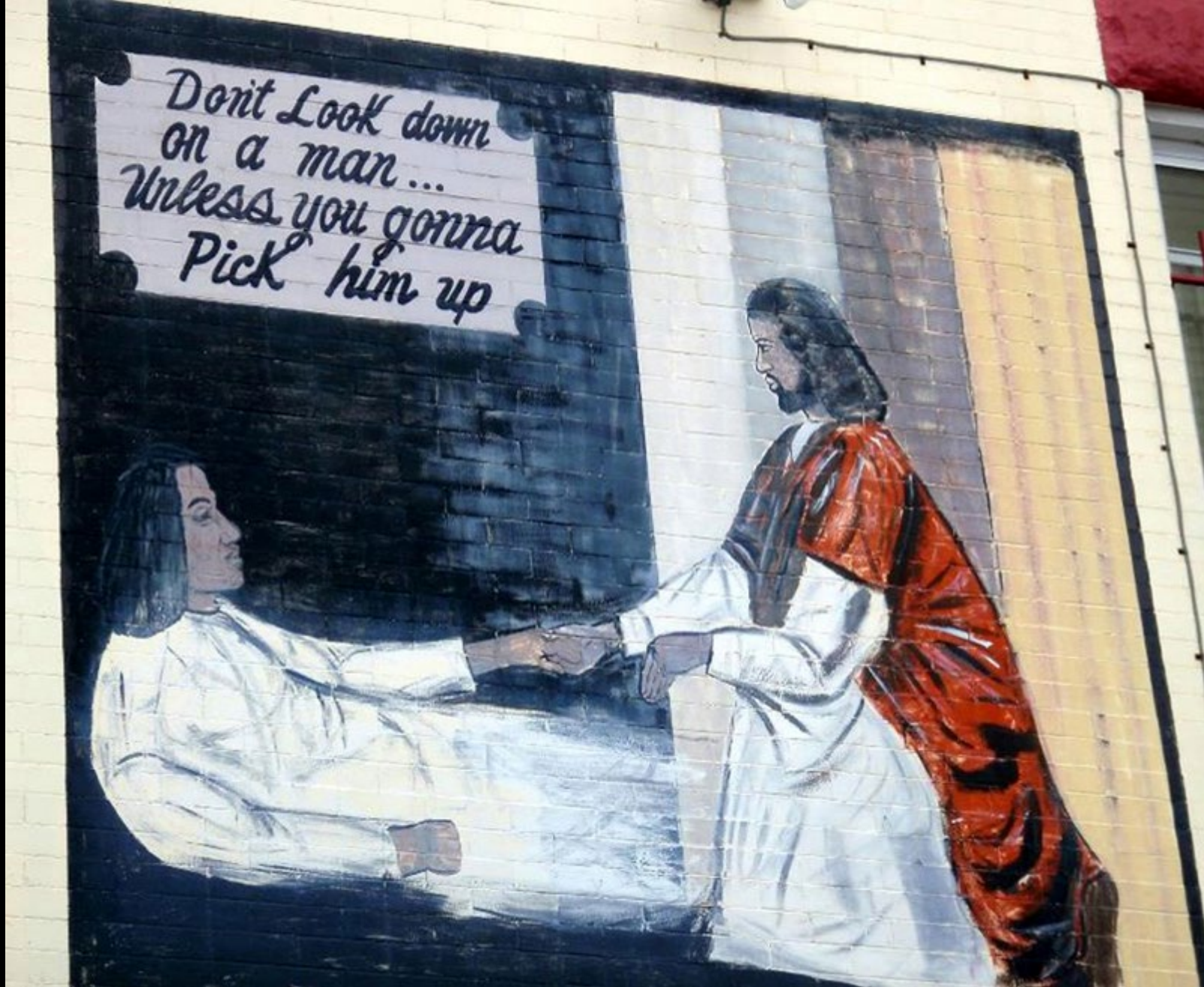
"Don't Look Down on a Man...Unless You Gonna Pick Him Up -- Mural, Washington, DC