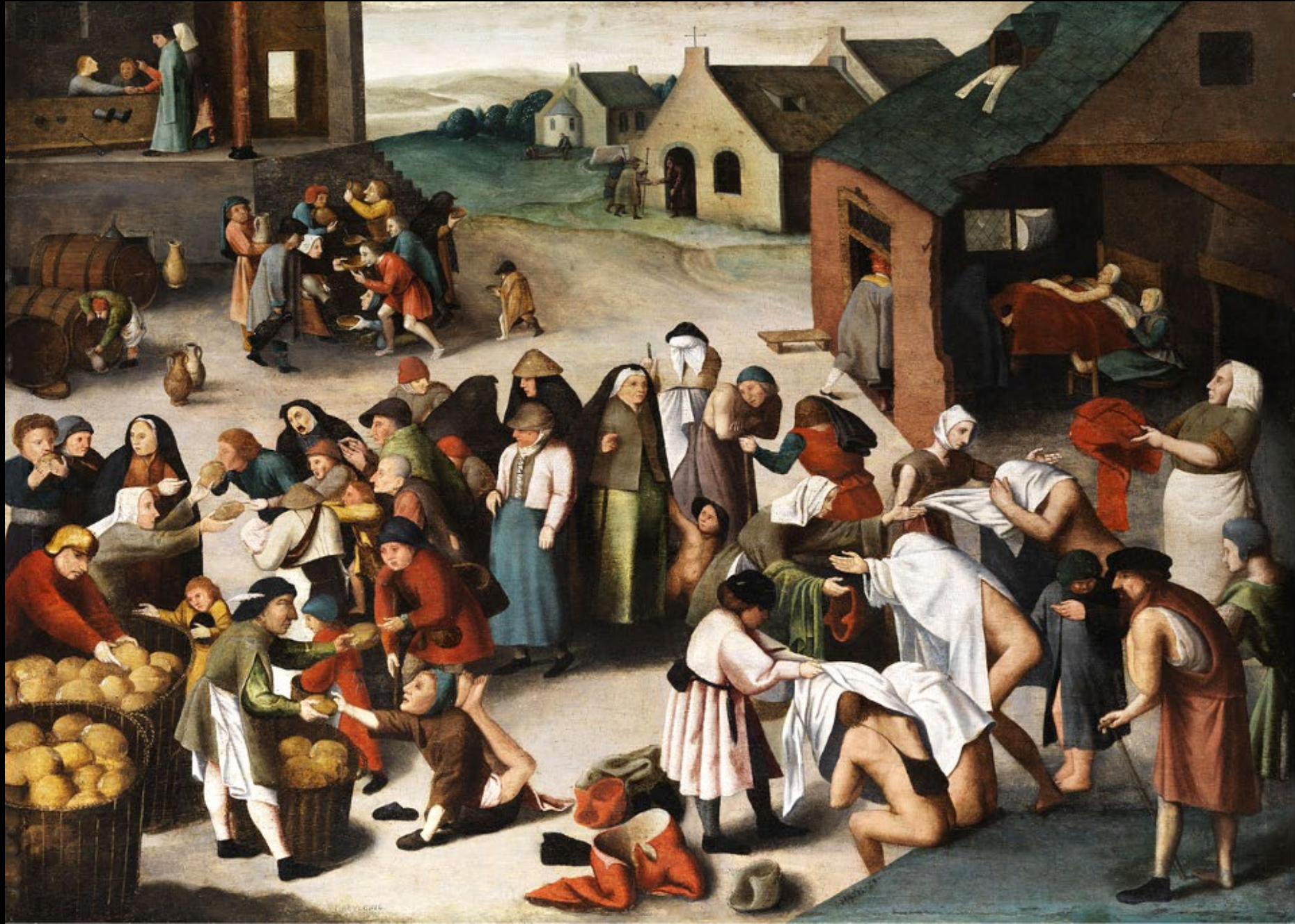
Works of Mercy -- Pieter Bruegel