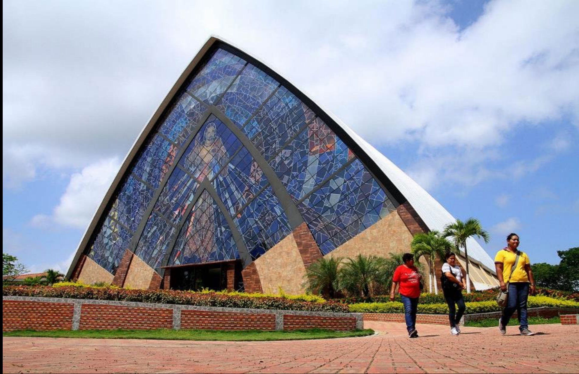
Sanctuary of the Divine Works of Mercy -- Guayaquil, Ecuador