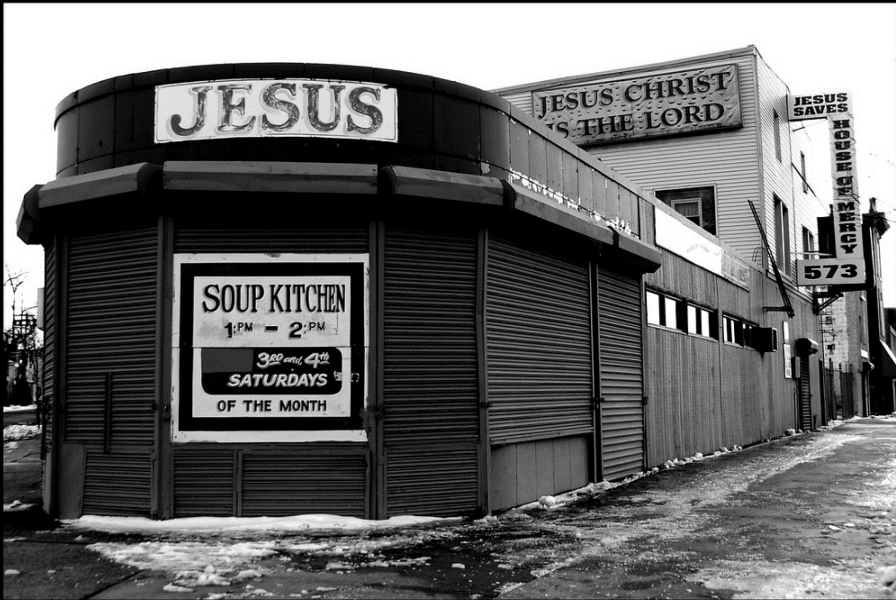
Soup Kitchen at the House of Mercy Church, Winter 2009