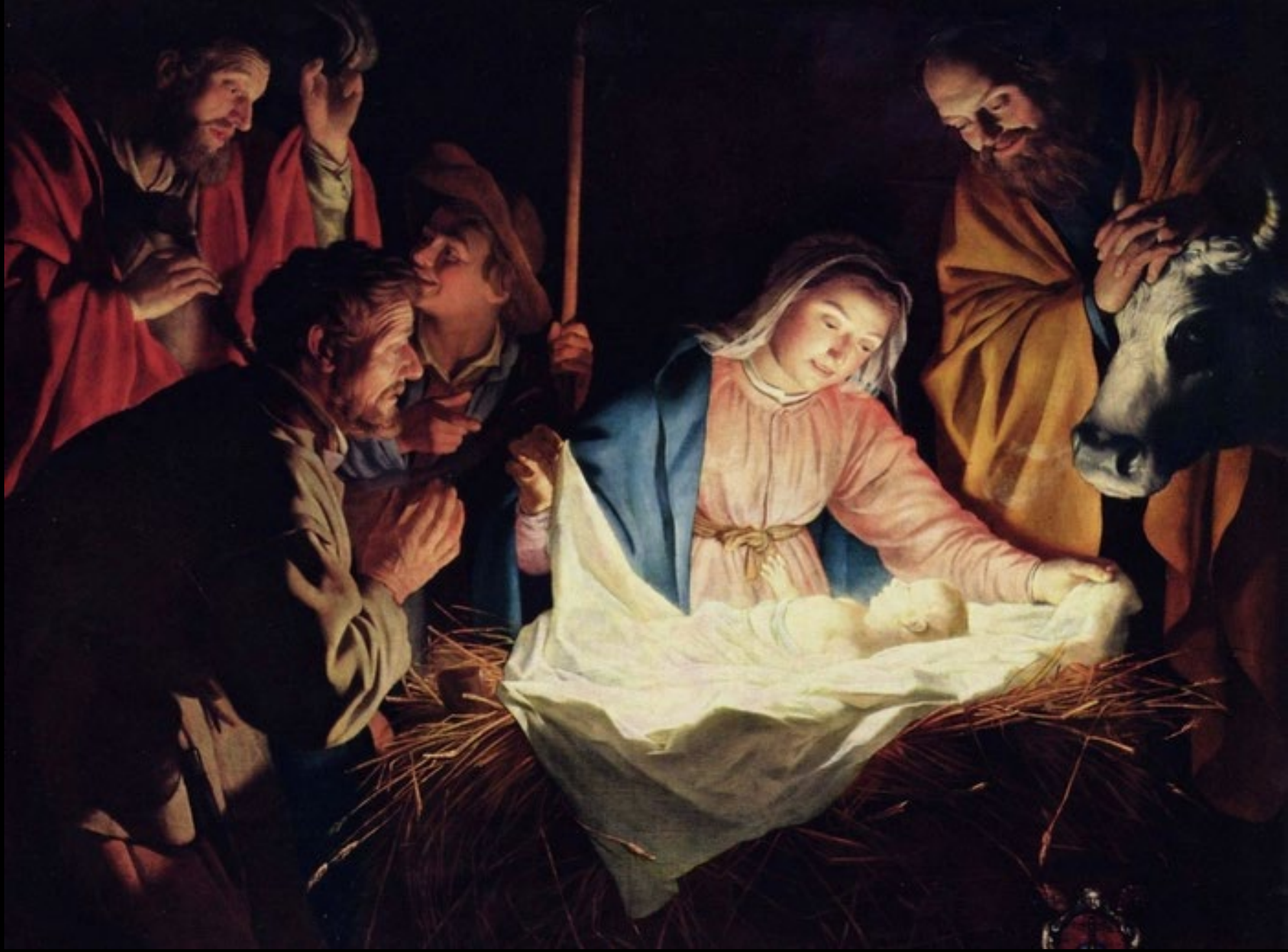
Adoration of the Shepherds -- Gerrit van Honthorst, Wallraf-Richartz Museum, Cologne, GDR