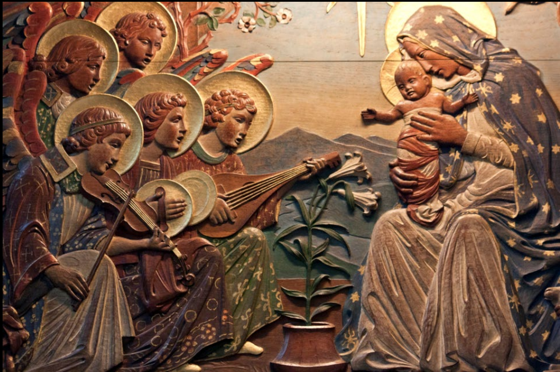
Angels Worship the Christ Child -- St. Giles Cathedral, Edinburgh, Scotland