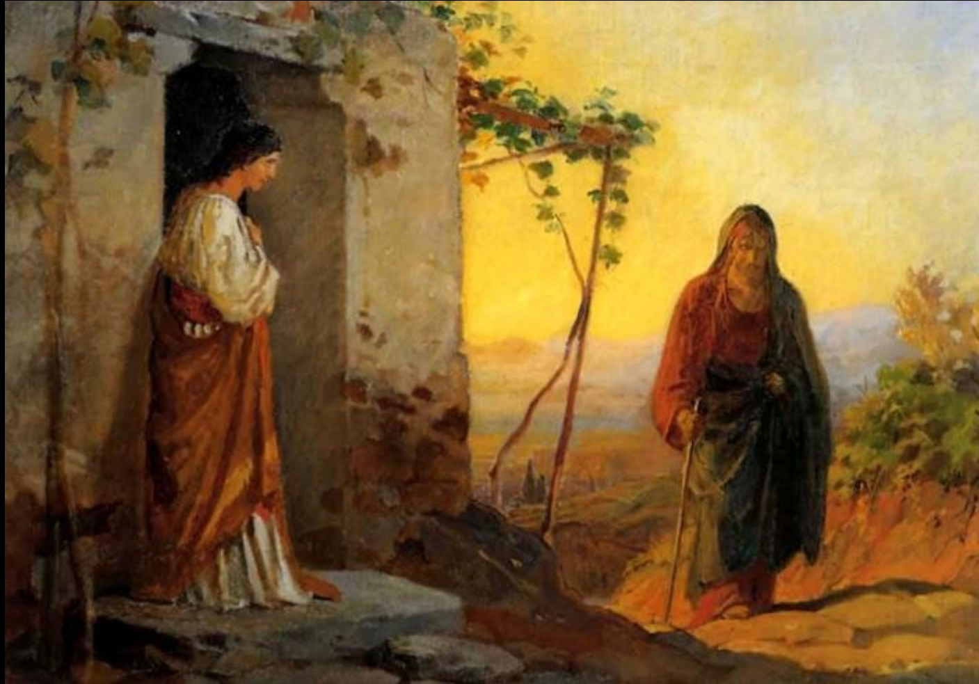
Mary Greets Jesus -- Nikolas Ge