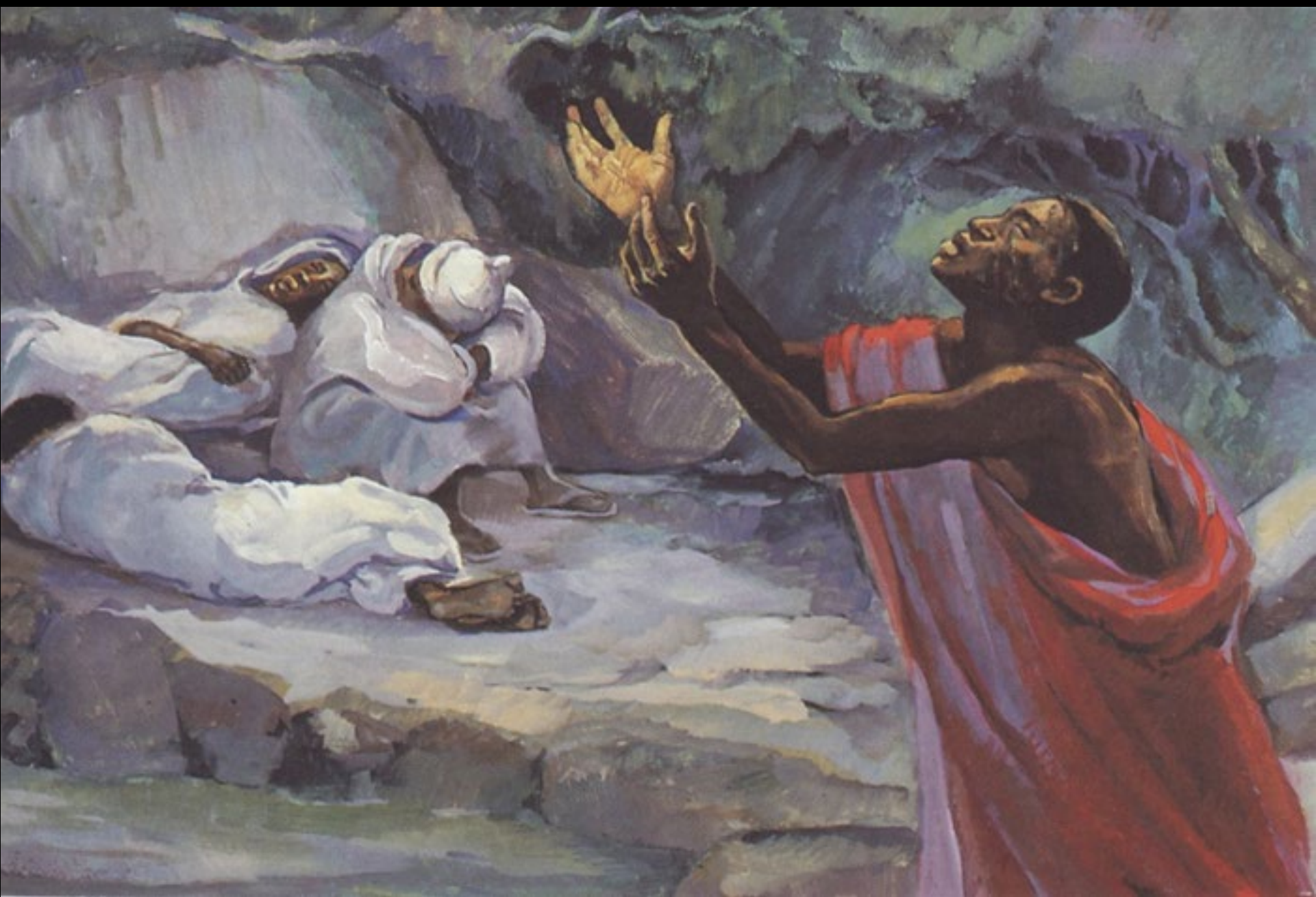
Christ on Gethsemane -- JESUS MAFA, Cameroon