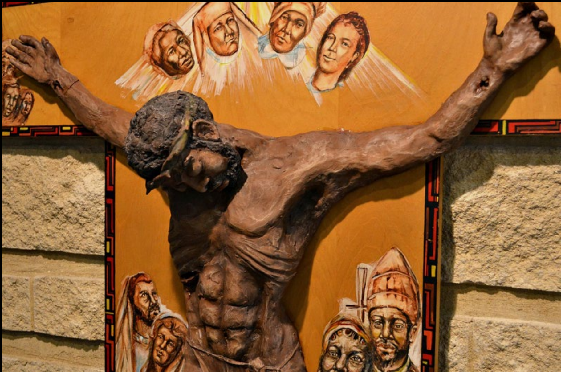
Jesus is Crucified -- St. Benedict the African in Chicago, IL