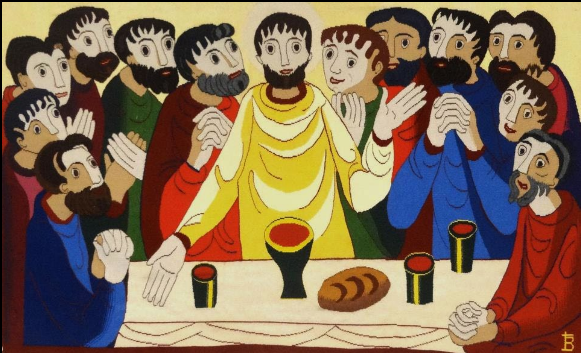
Last Supper -- Bose Monastic Community, Bose, Italy