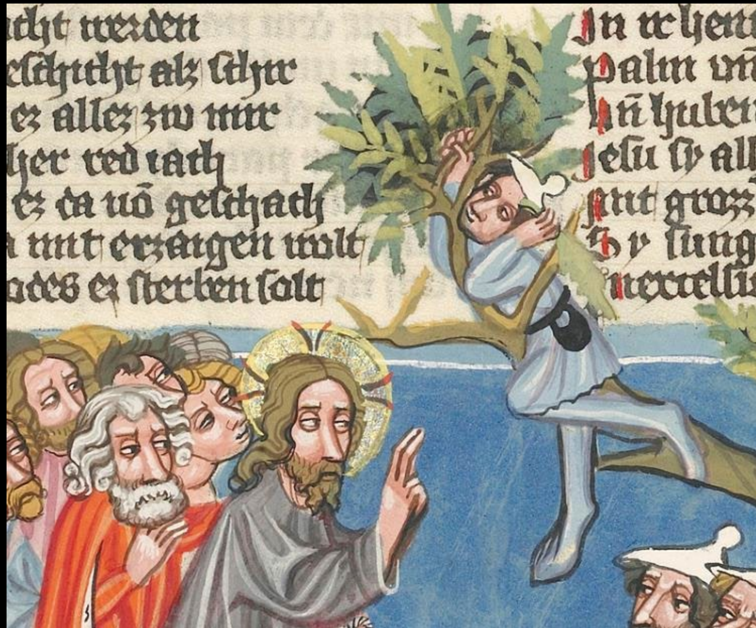
Gathering Leafy Branches -- World Chronicle, Getty Museum, Los Angeles, CA