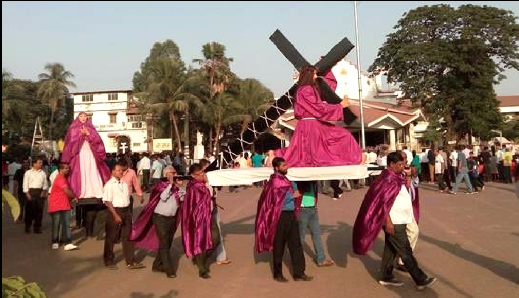
Palm Sunday Procession -- Kurla, India