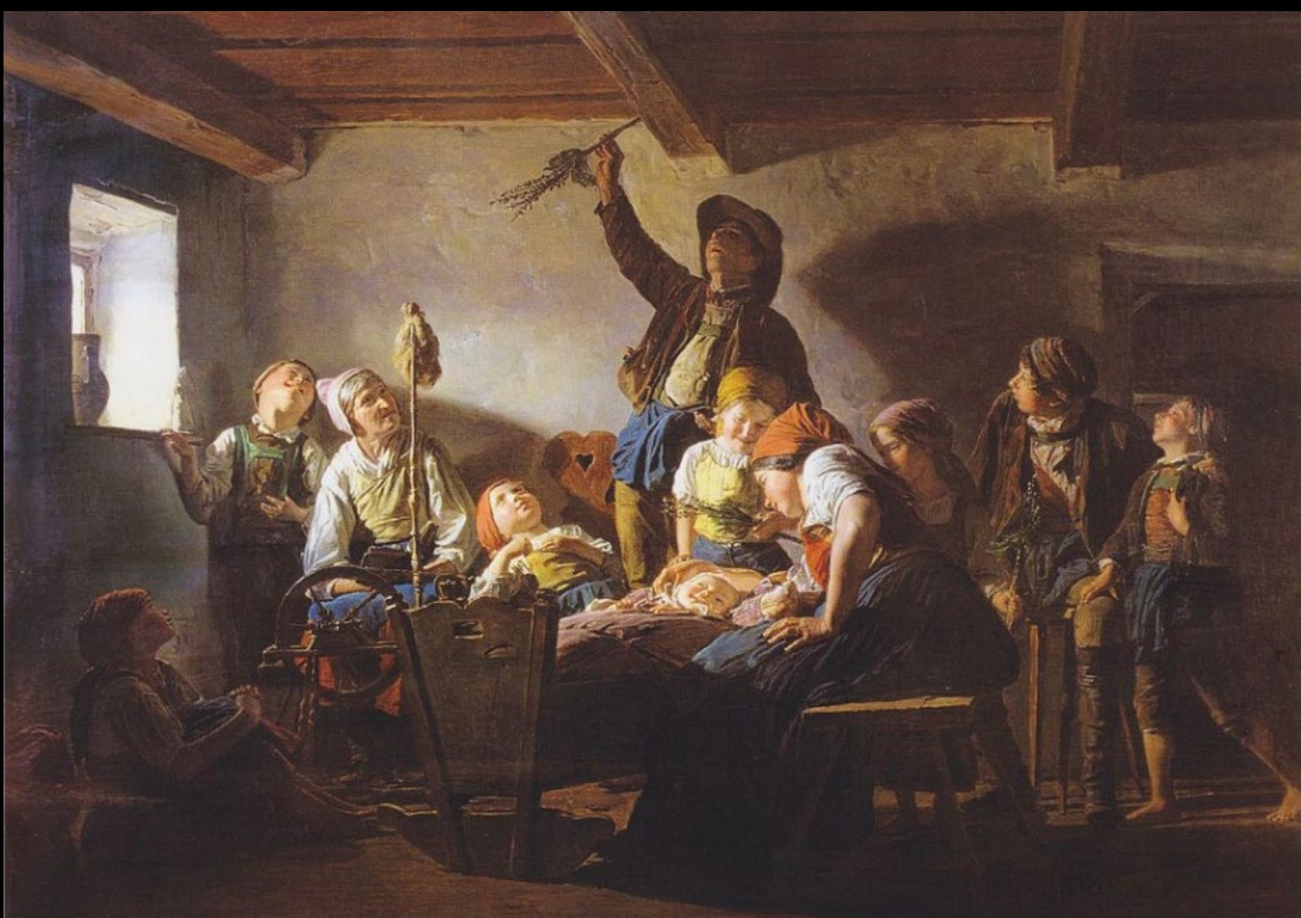
Palm Sunday -- Ferdinand Georg Waldmüller, Moravian Gallery, Brno, Czech Republic