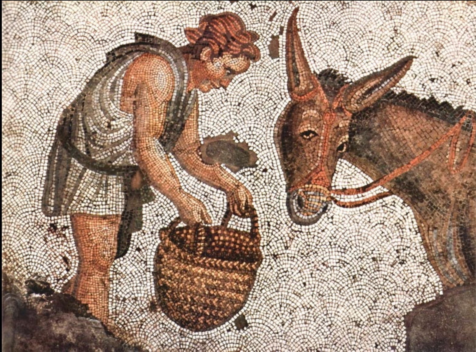
Child and Donkey -- Palace of Constantine the Great, Istanbul, Turkey