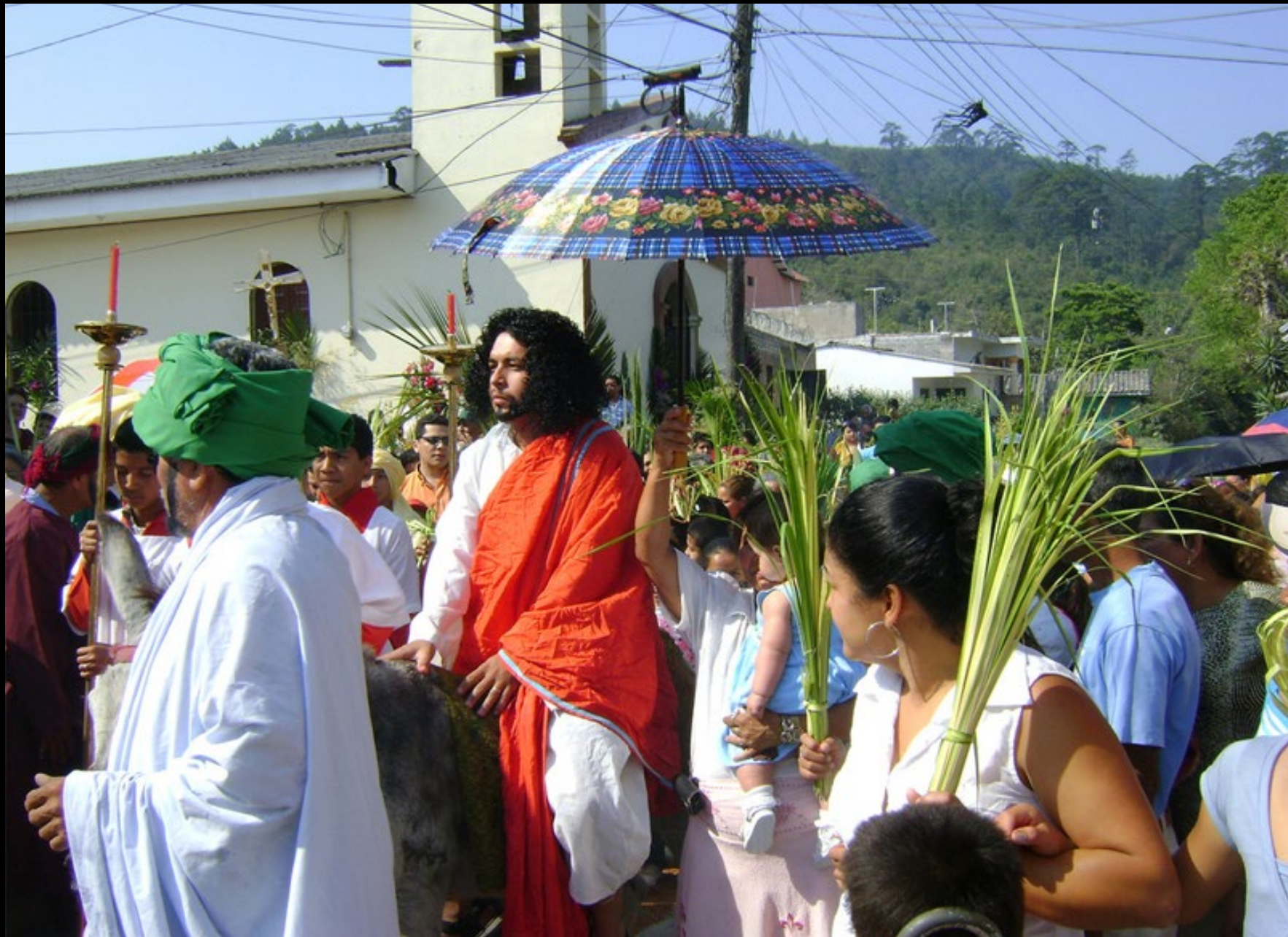
Palm Sunday Procession -- Honduras