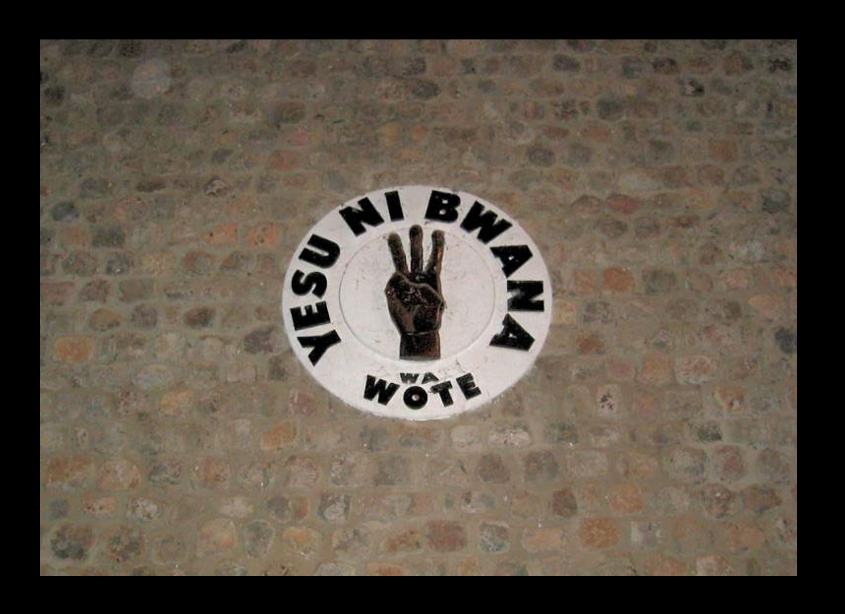
Jesus is Lord of All -- Panel in Chapel, Mulungwishi Mission, D. R. Congo