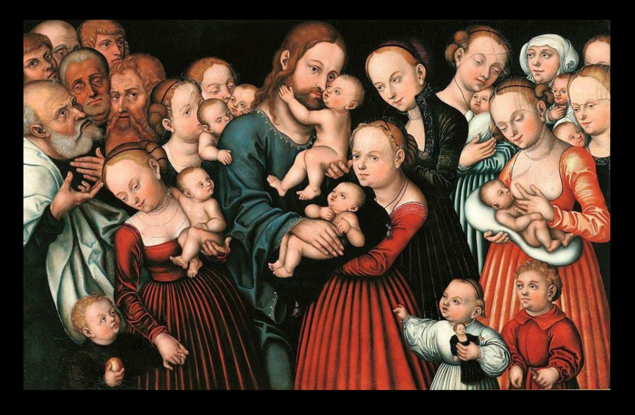
Christ Blessing the Children -- Lucas Cranach, Wawel Castle, Krakow, Poland