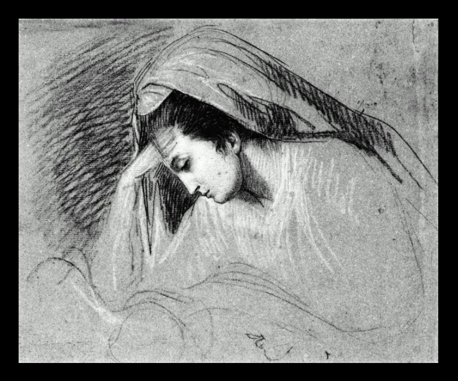
Study for the Head of the Virgin -- John Singleton Copley, Museum of Fine Arts, Boston, MA