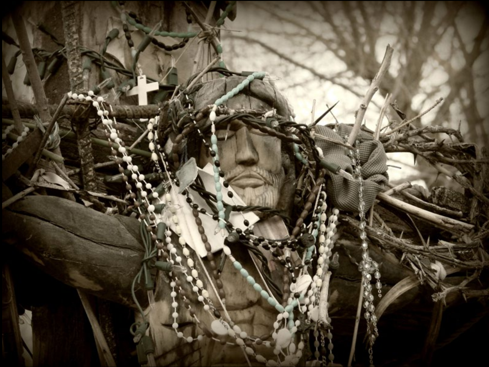
Crucifixion -- Chimayo, New Mexico