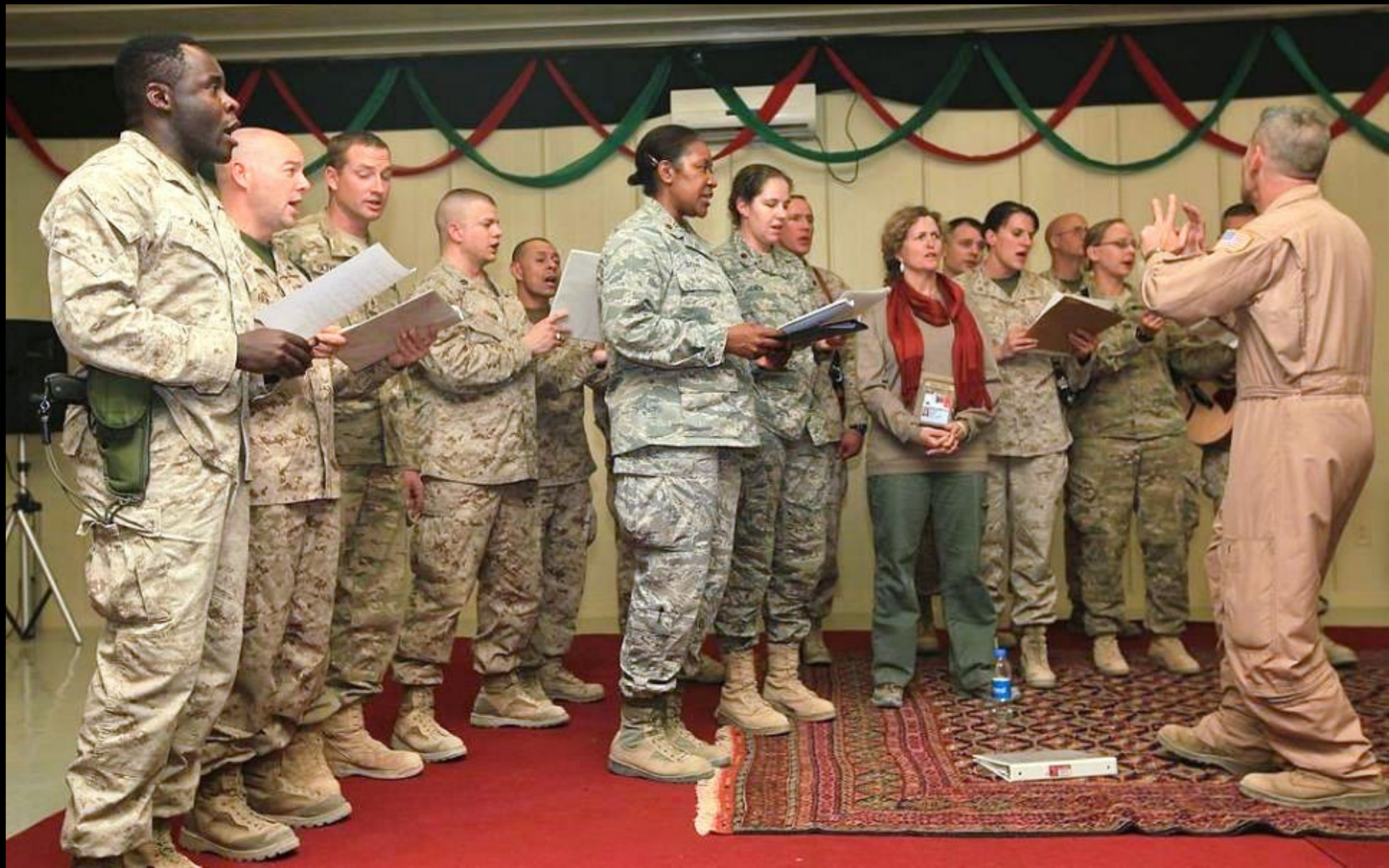
Christmas Choir, US Armed Forces -- Afghan Cultural Center, Helmand, Afghanistan