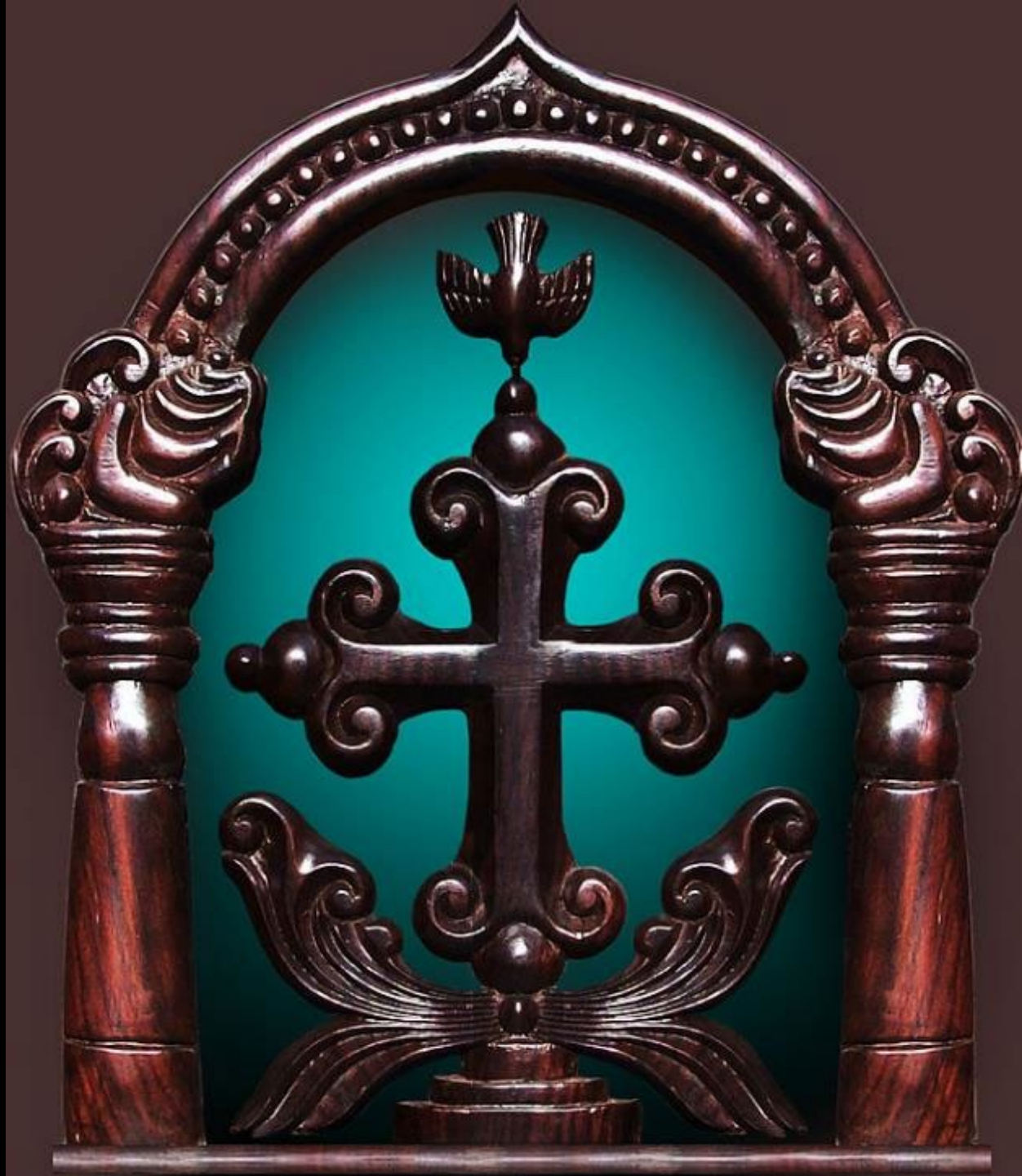
Mar Thoma Sliva Cross (Cross of Thomas )