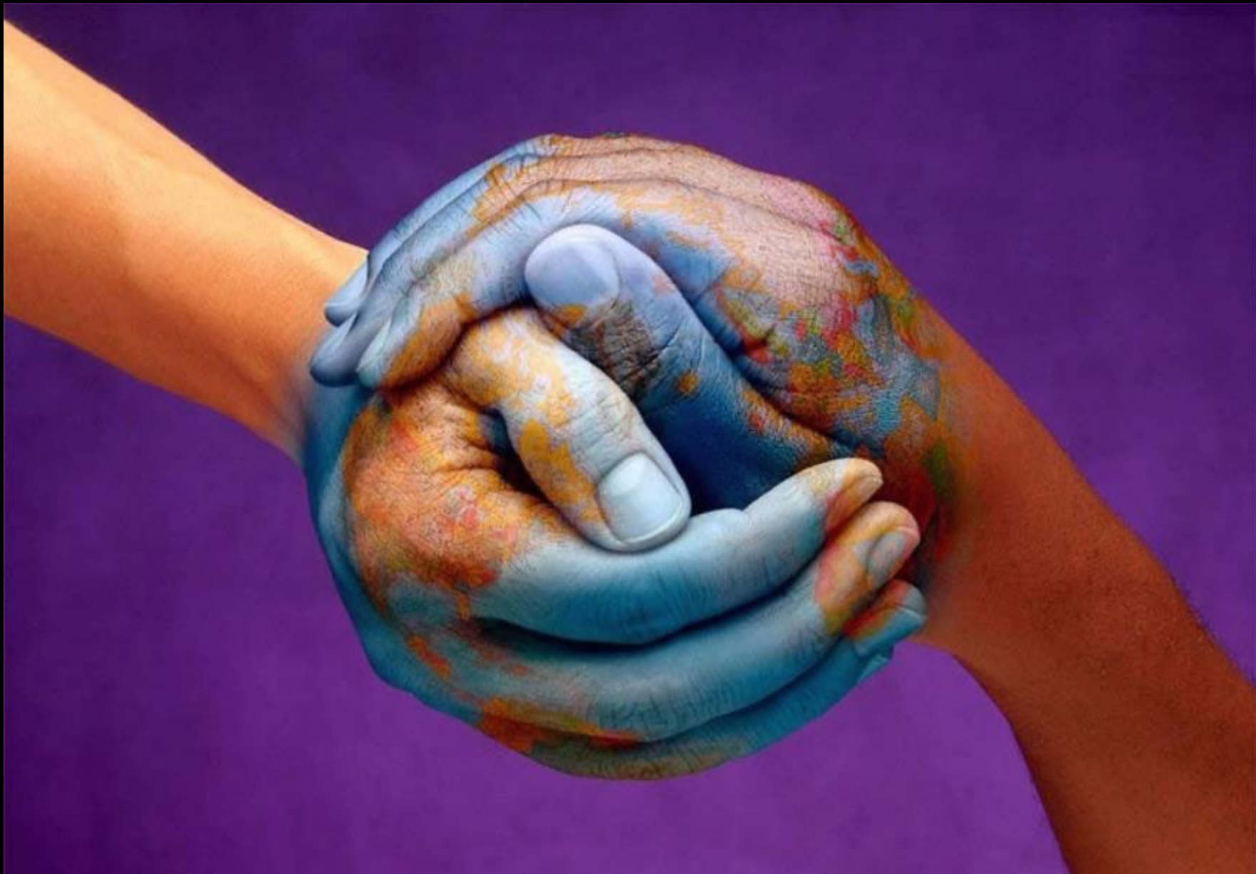
Hands of the World -- Non-profit "Movement for Peace" graphic