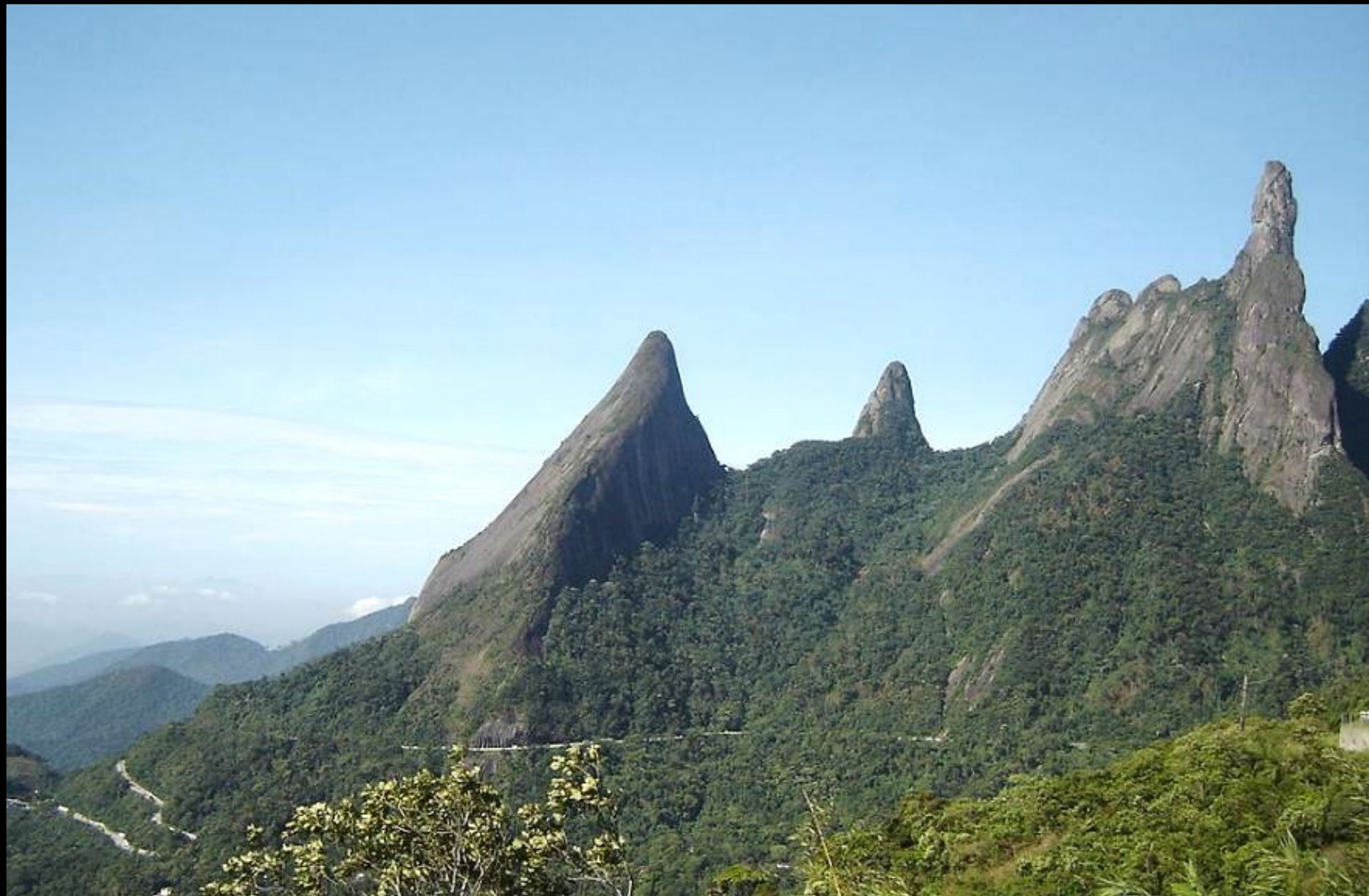
The Finger of God Rock Formation -- Teresopolis, Brazil