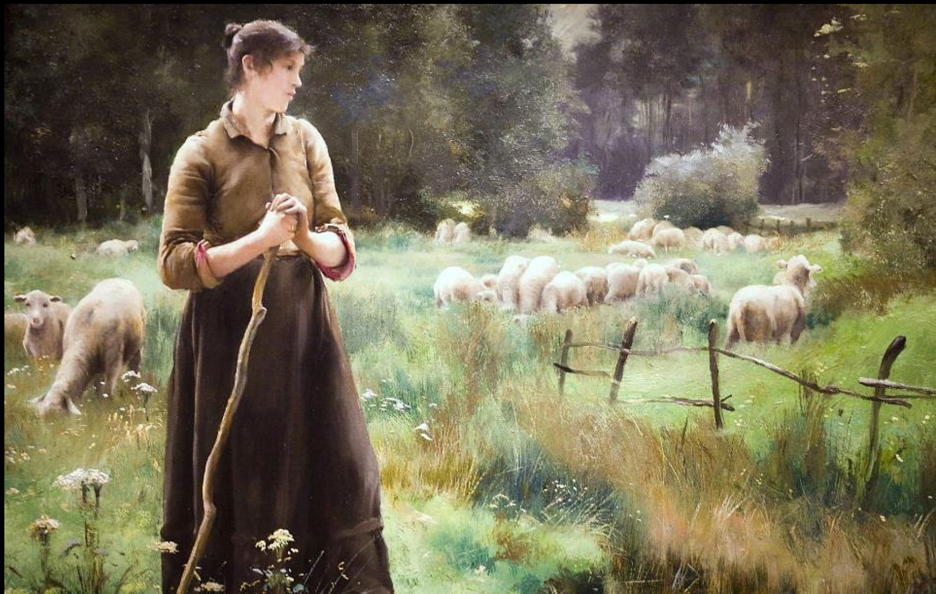
The Good Shepherd -- Julien Dupre, Legion of Honor Museum, San Francisco, CA