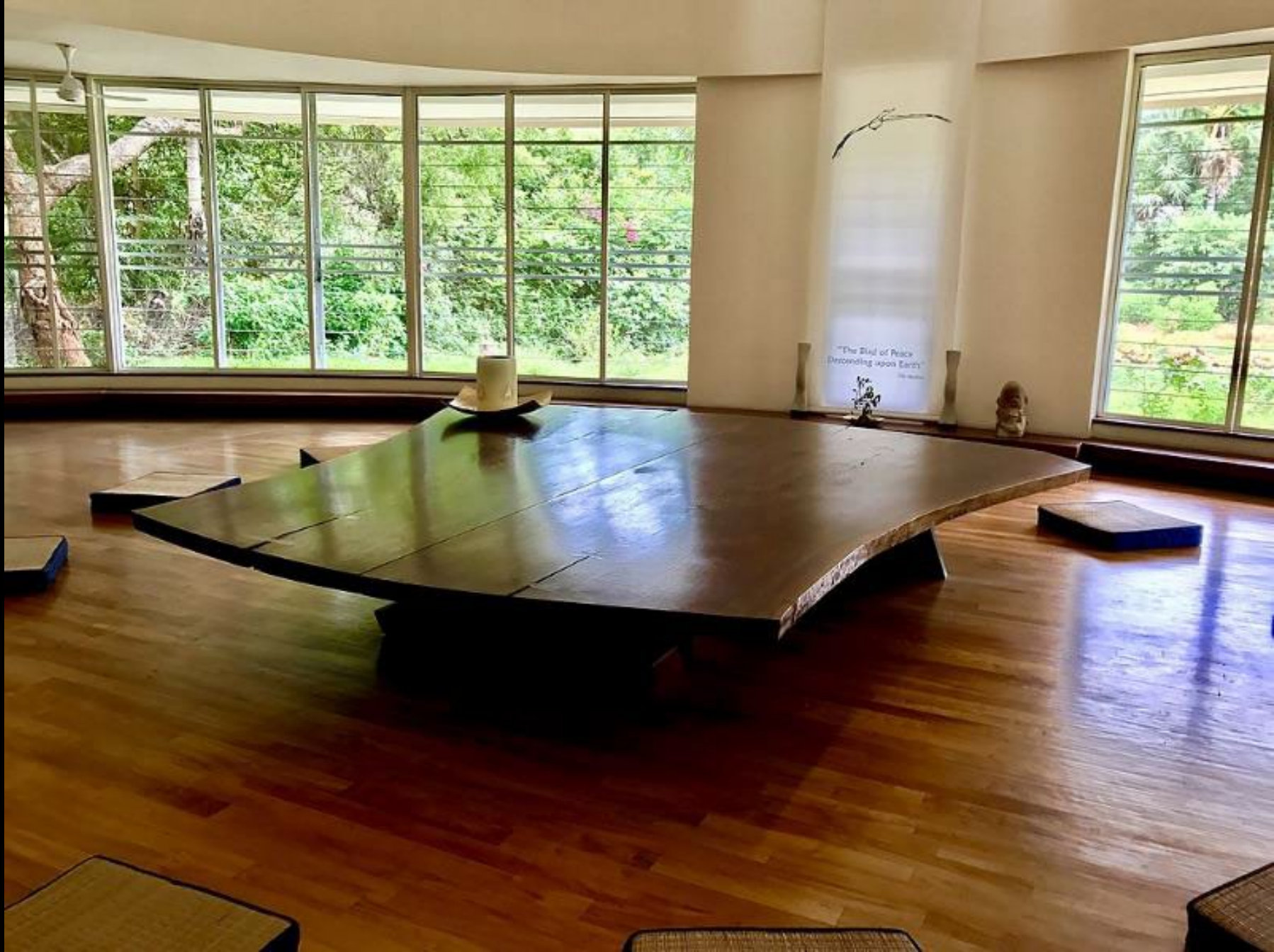
Peace Table for Asia -- George Nakashima, Hall of Peace, Auroville, India