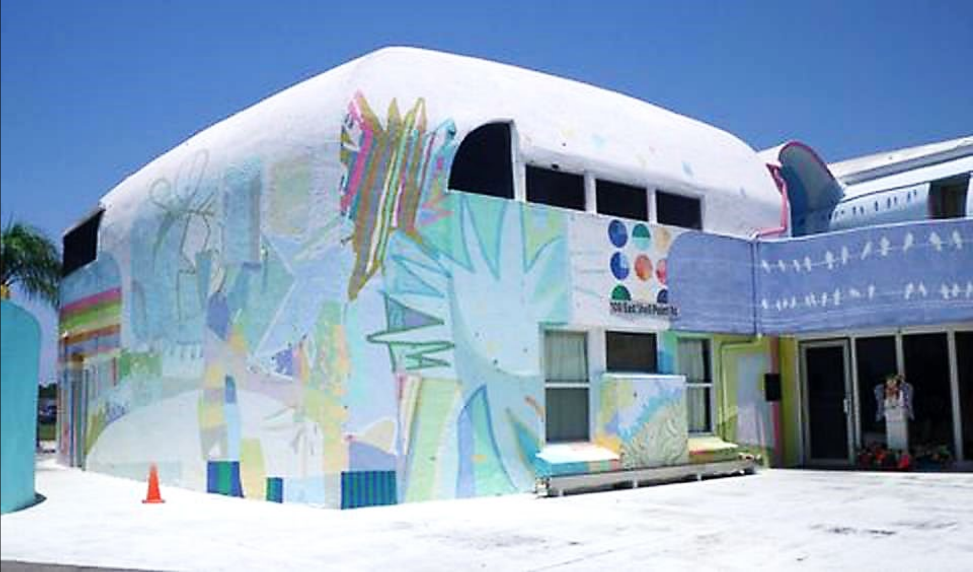
Mary and Martha Shelter for Domestic Violence -- Ruskin, FL