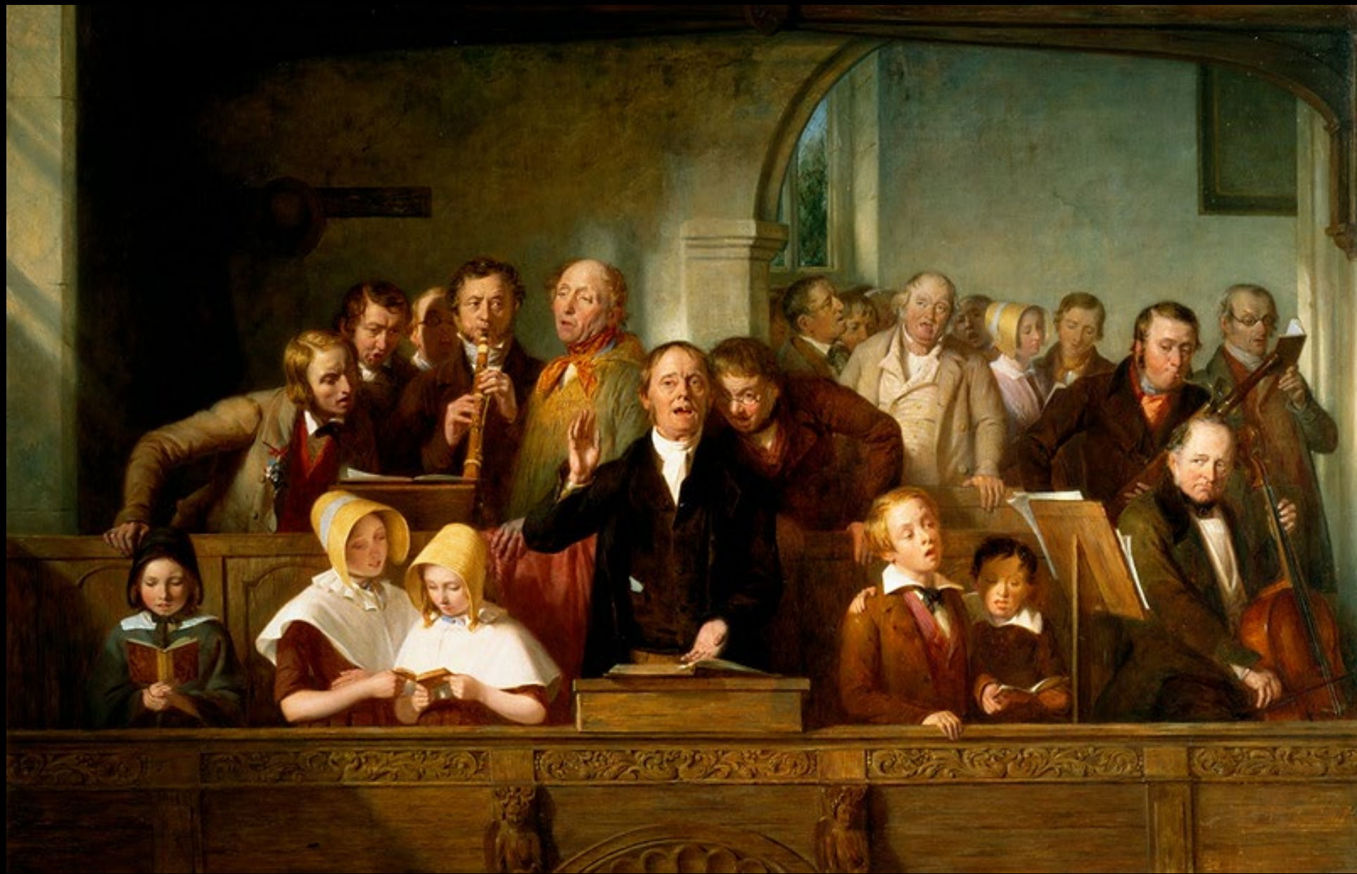
The Village Choir -- Thomas George Webster, Victoria and Albert Museum, London, England