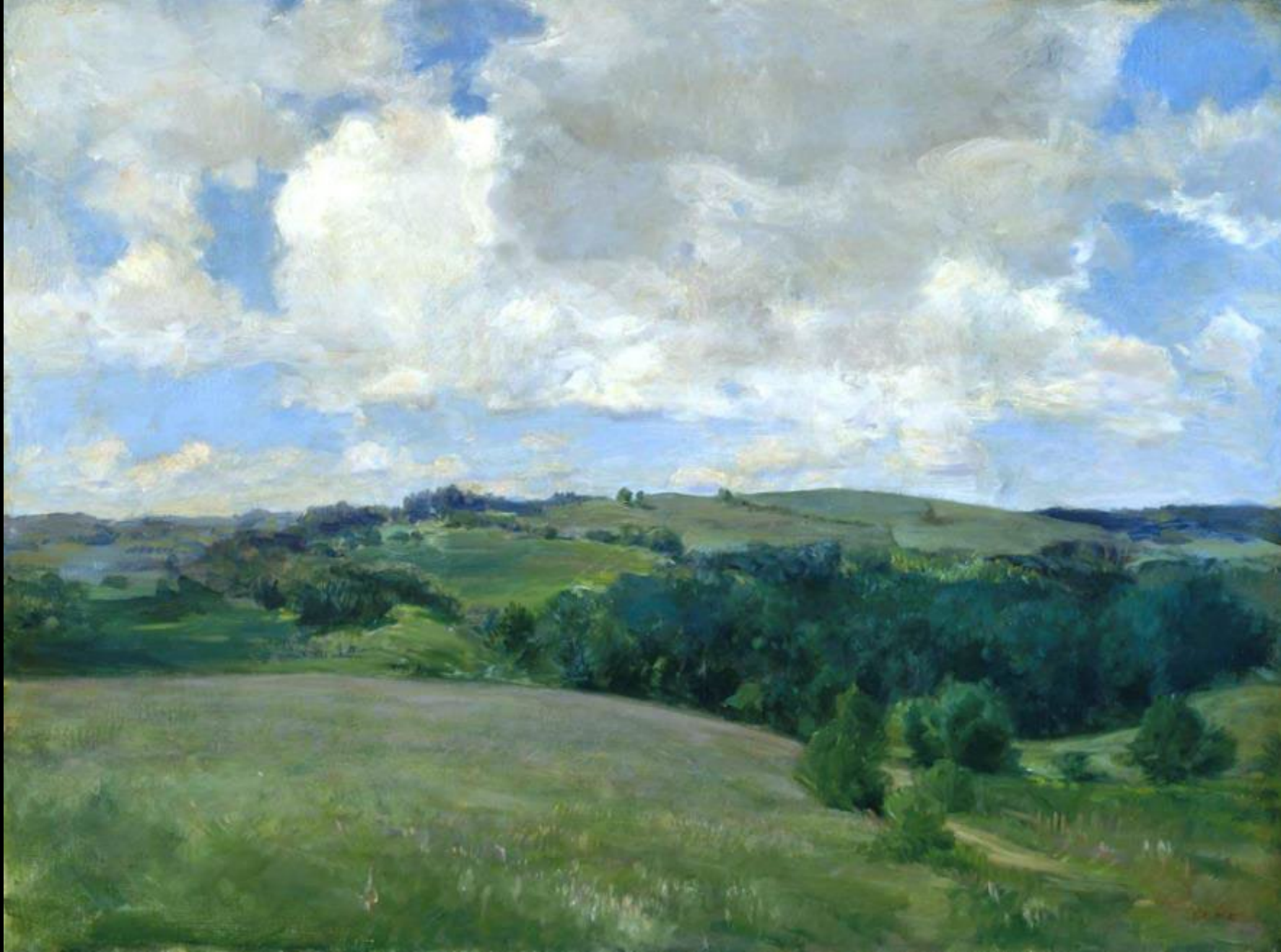
Clouds -- Charles Platt, Museum of Fine Arts, Boston, MA