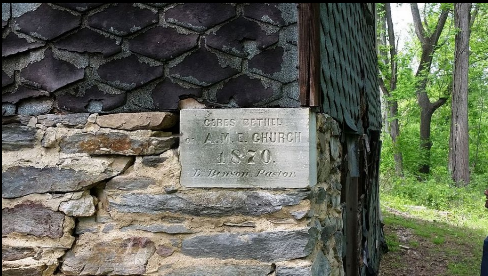
Cornerstone of Ceres Bethel African Methodist Episcopal Church, near Harper's Ferry, MD