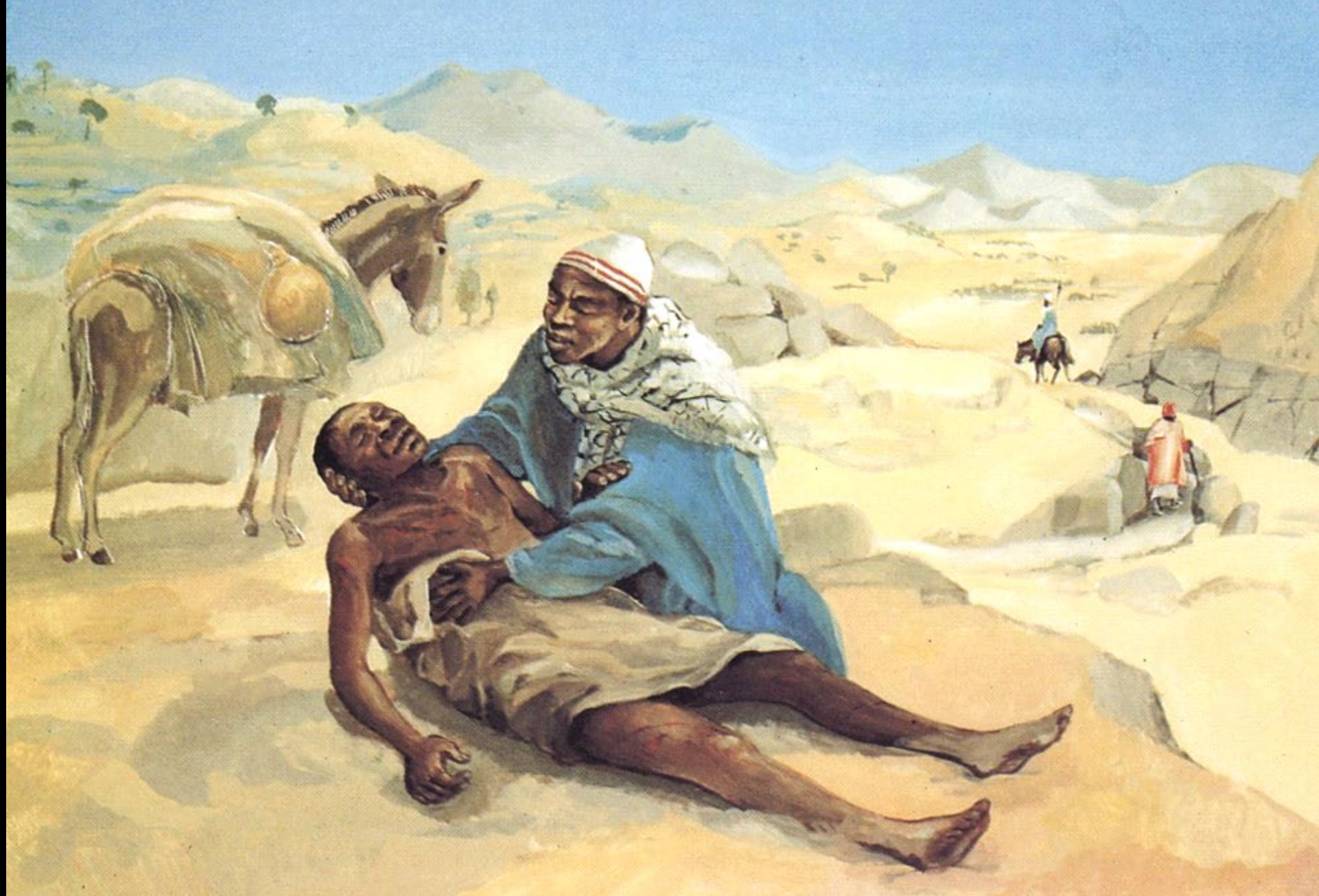
The Good Samaritan -- JESUS MAFA, Cameroon