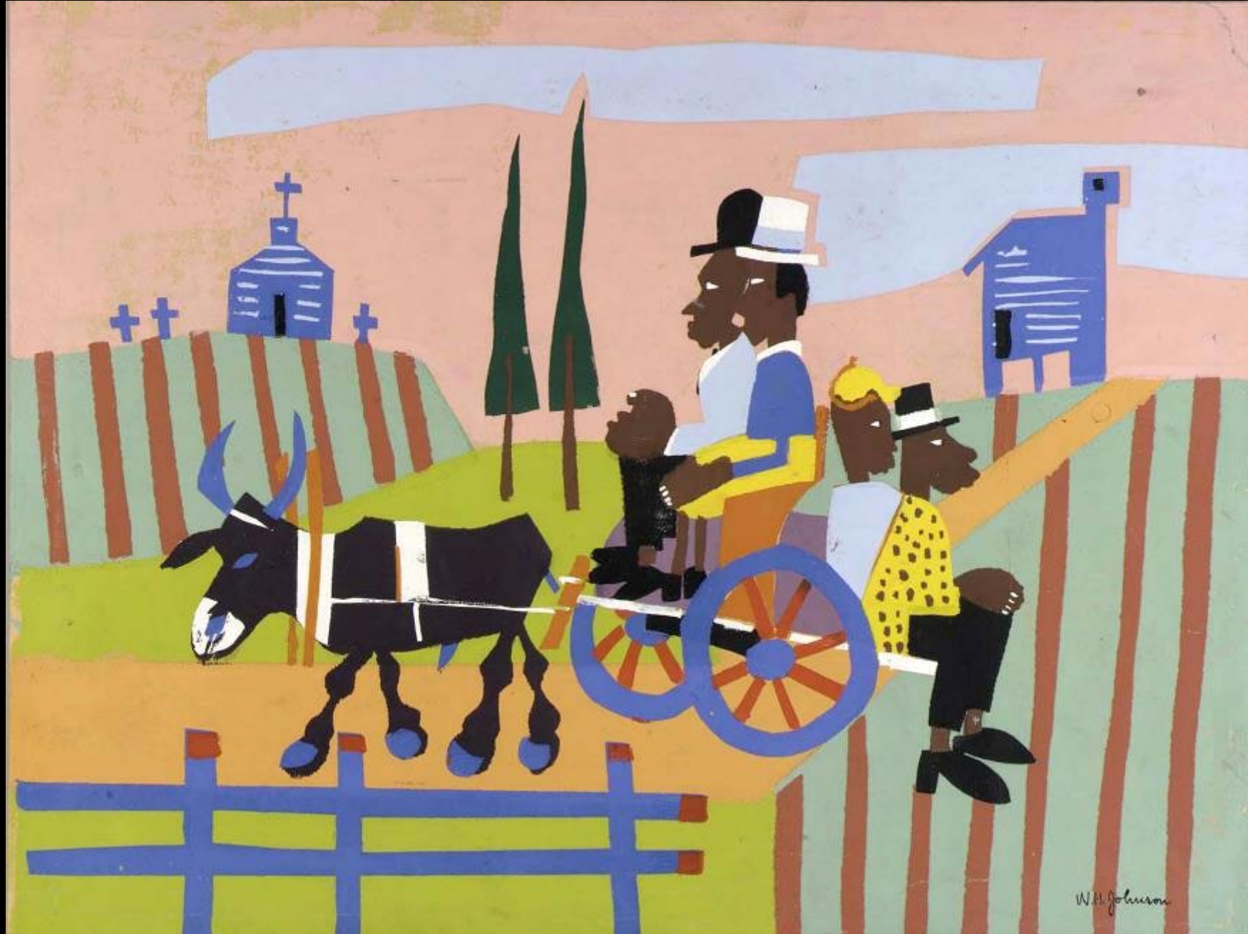
Going to Church -- William H. Johnson, Smithsonian Museum of American Art, Washington, DC