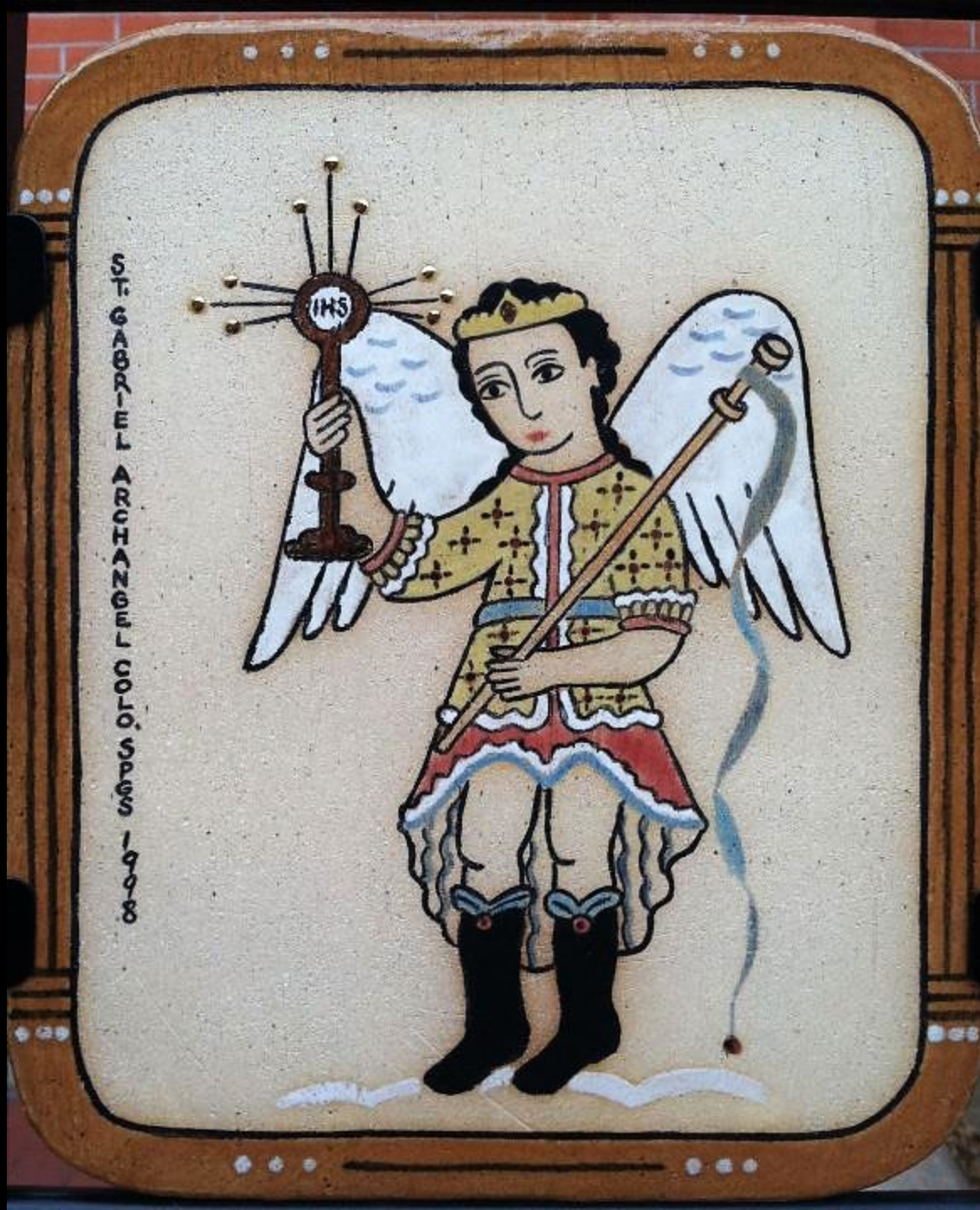
St. Gabriel, Personal icon