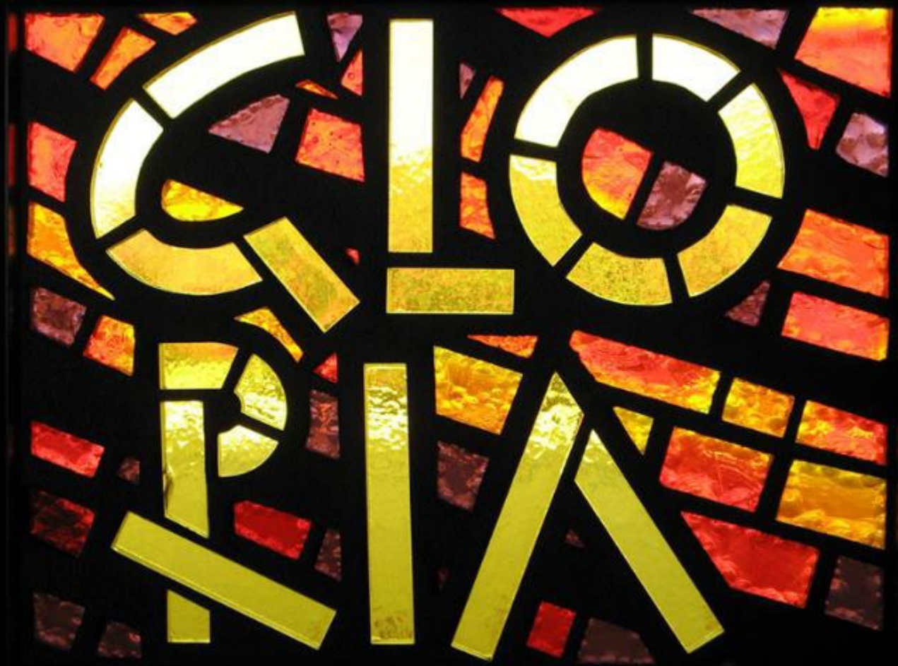
Gloria! -- Prince of Peace Abbey, Oceanside, CA