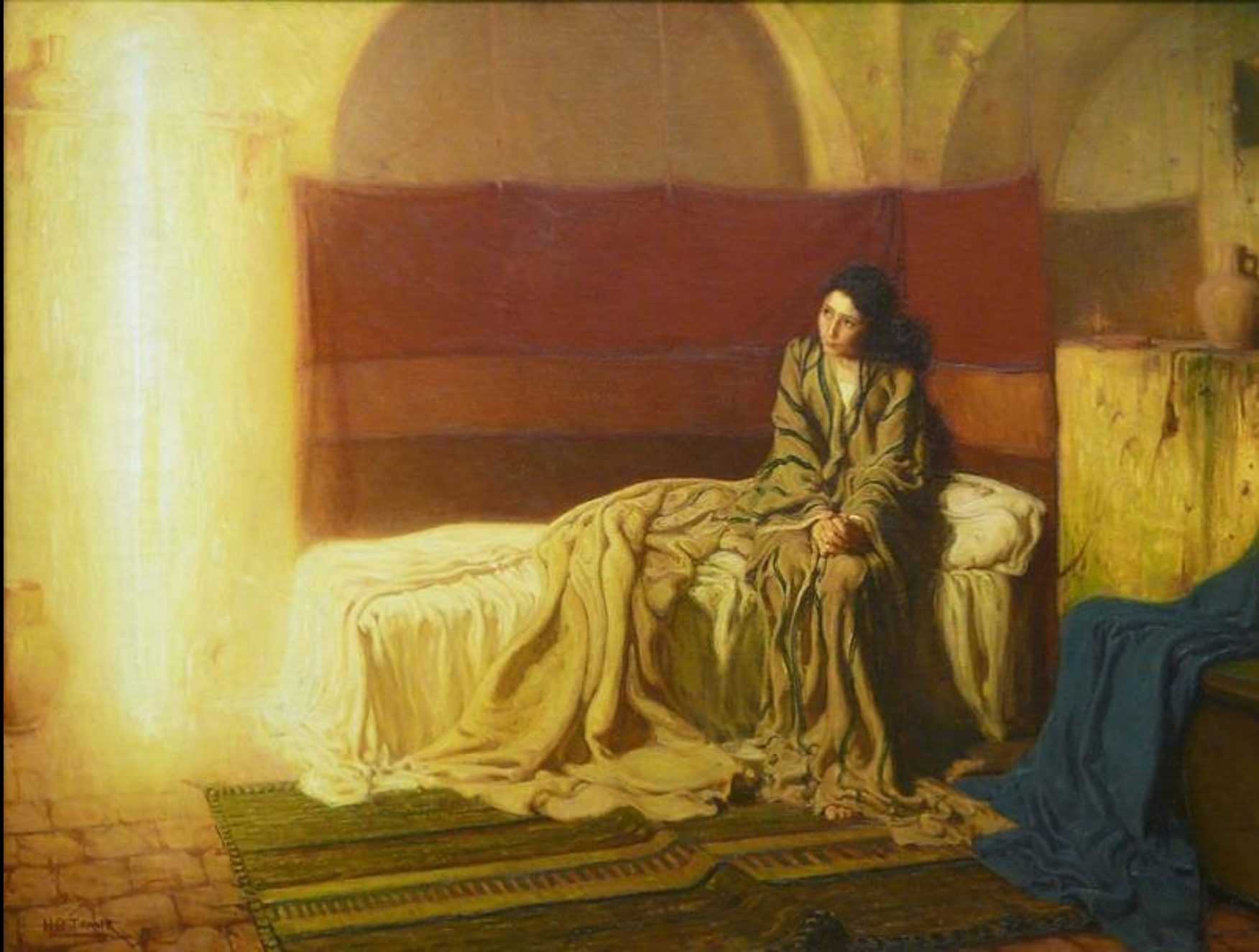
The Annunciation -- Henry Ossawa Tanner, Philadelphia Museum of Art, Philadelphia, PS