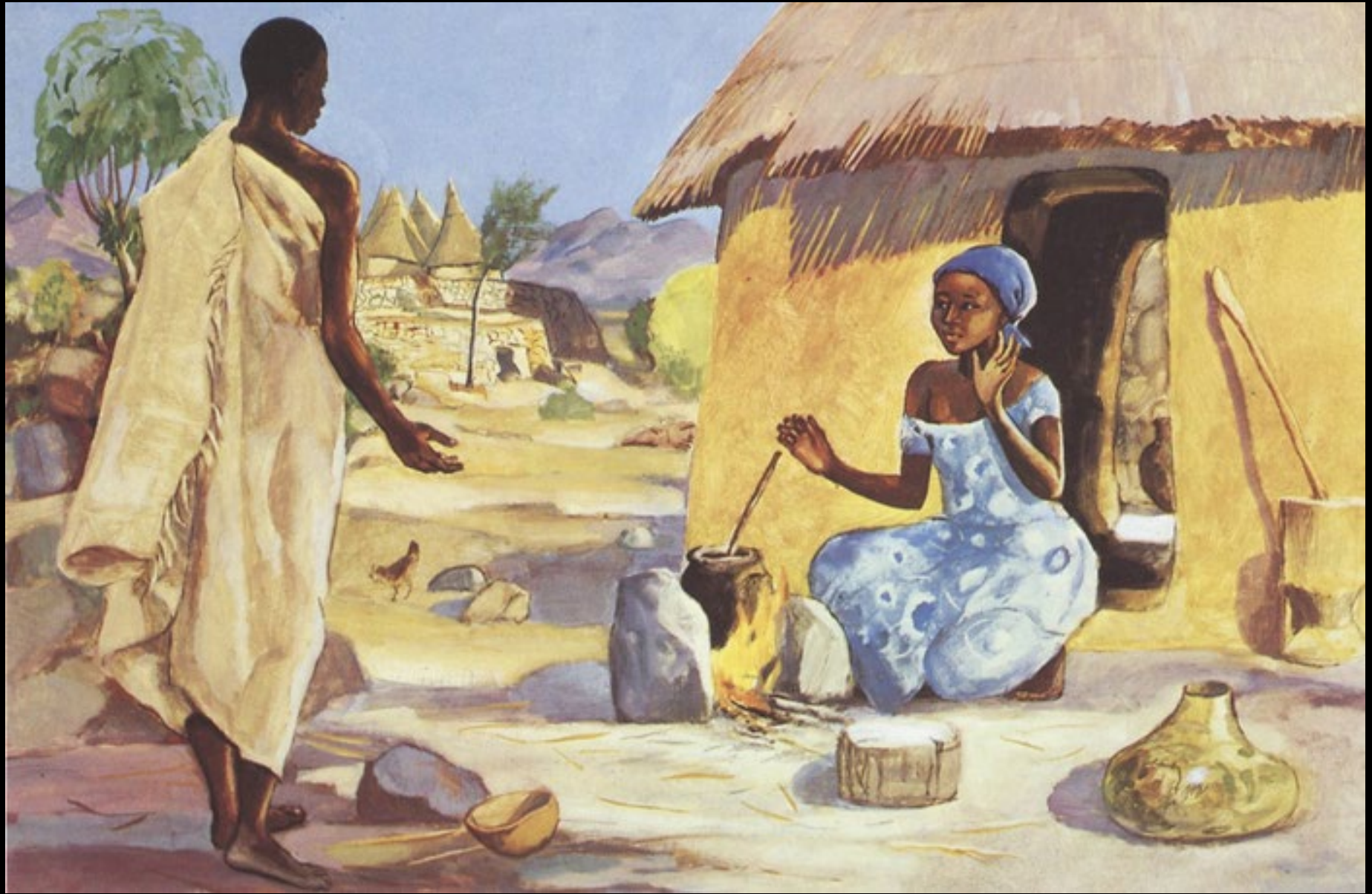
The Annunciation -- JESUS MAFA, Cameroon