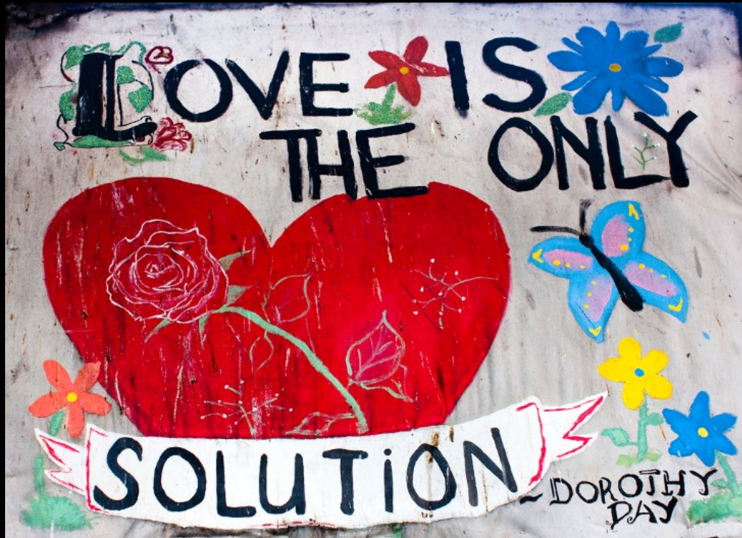
"Love is the Only Solution" - Dorothy Day -- Mural in San Francisco, CA