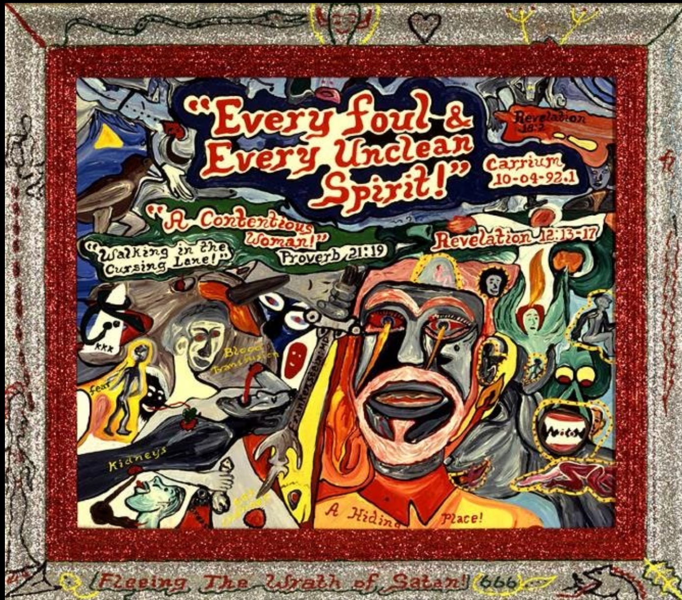
Every Foul and Every Unclean Spirit -- Xmeah ShaEla'ReEl, Smithsonian Museum of American Art, Washington, DC