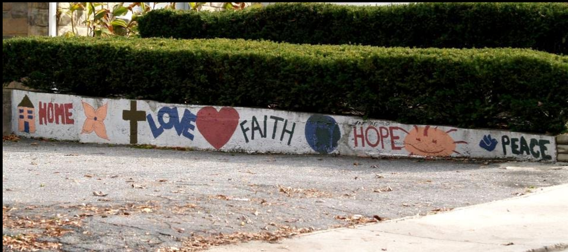
"Home, Love, Faith, Hope, Peace" Mural, Philadelphia Avenue, Takoma Park, MD