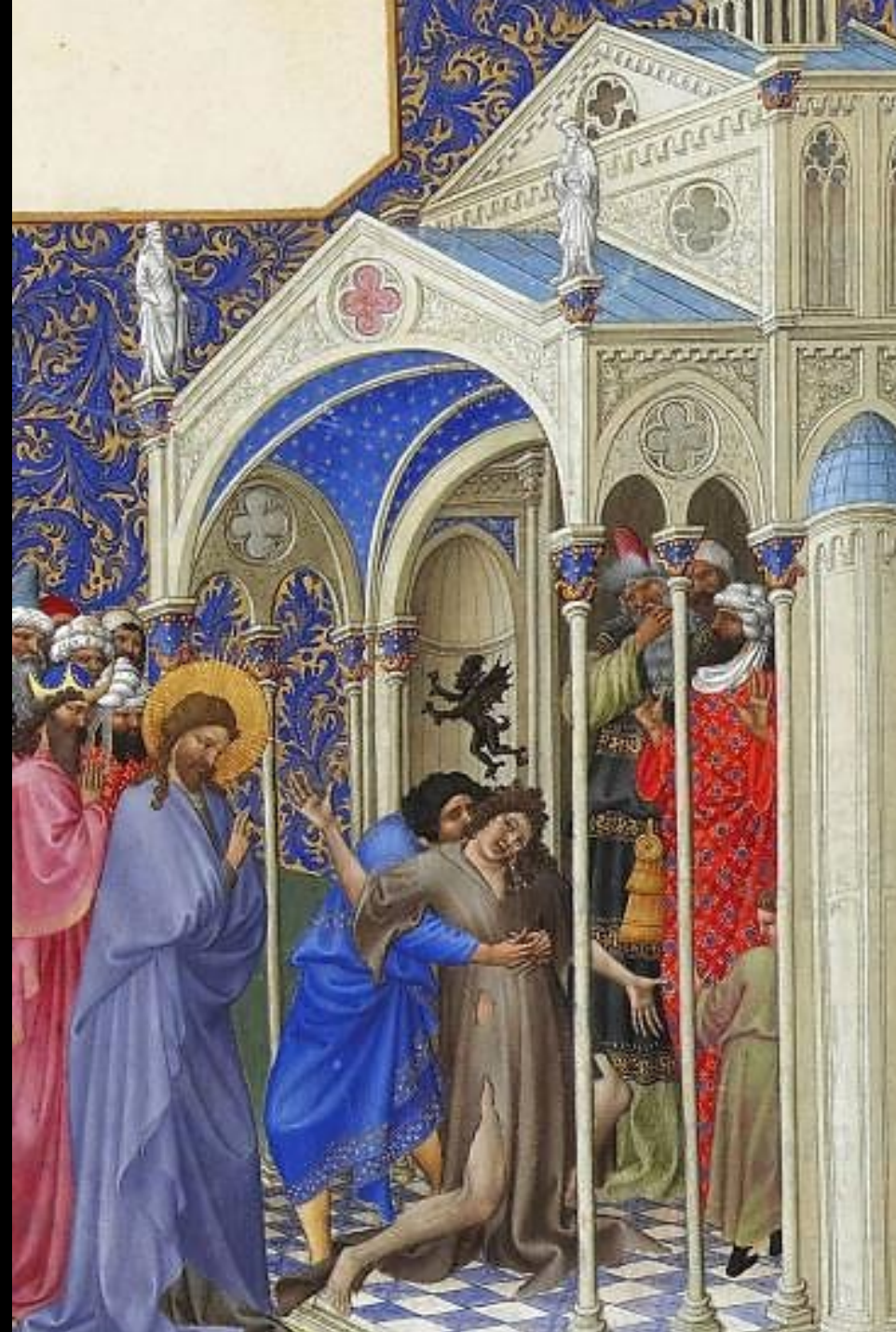
The Exorcism Les Très Riches Heures du duc de Berry Musée Condé Chantilly, France