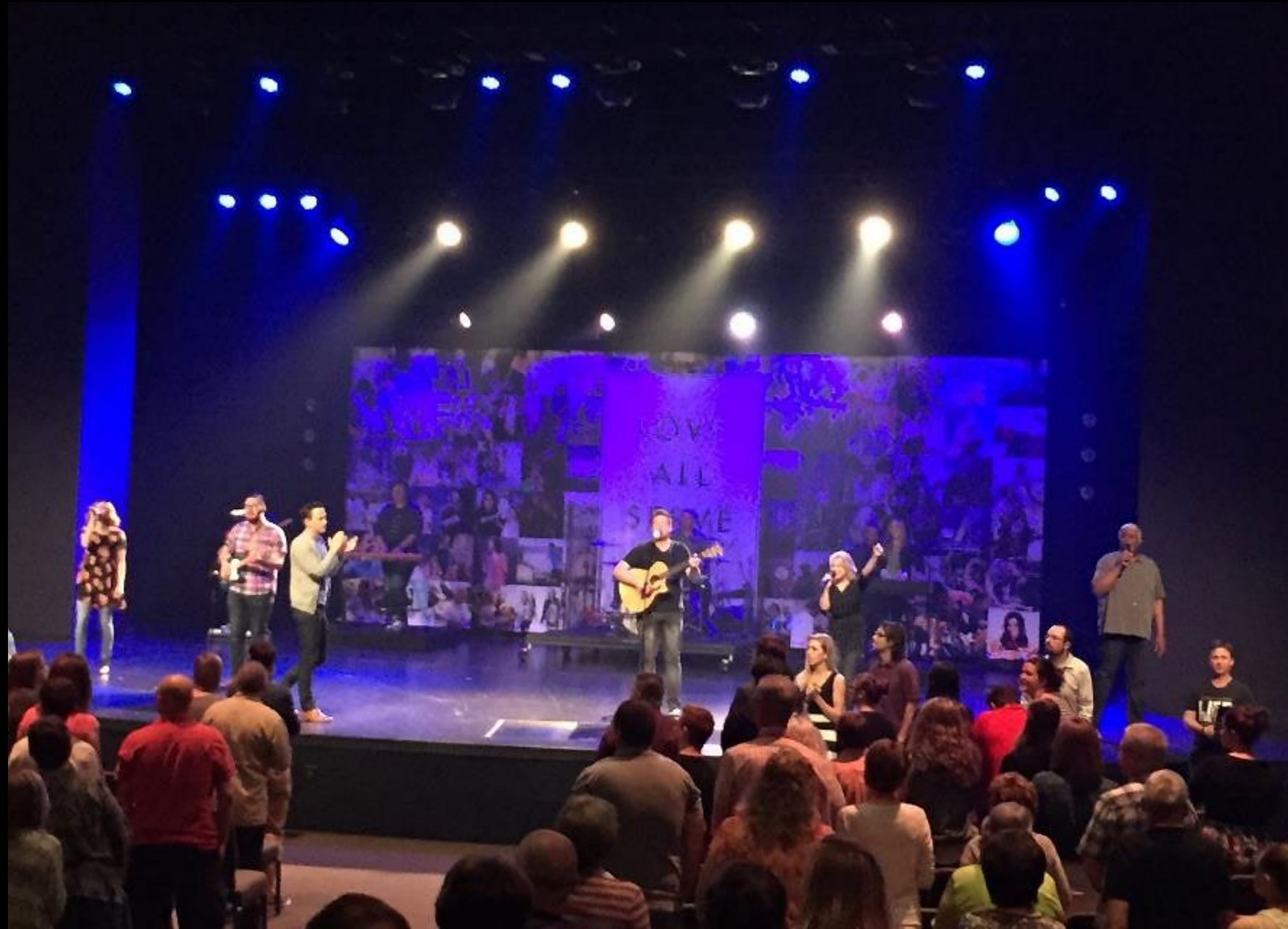
Praise Service -- James River Church, Springfield, MO