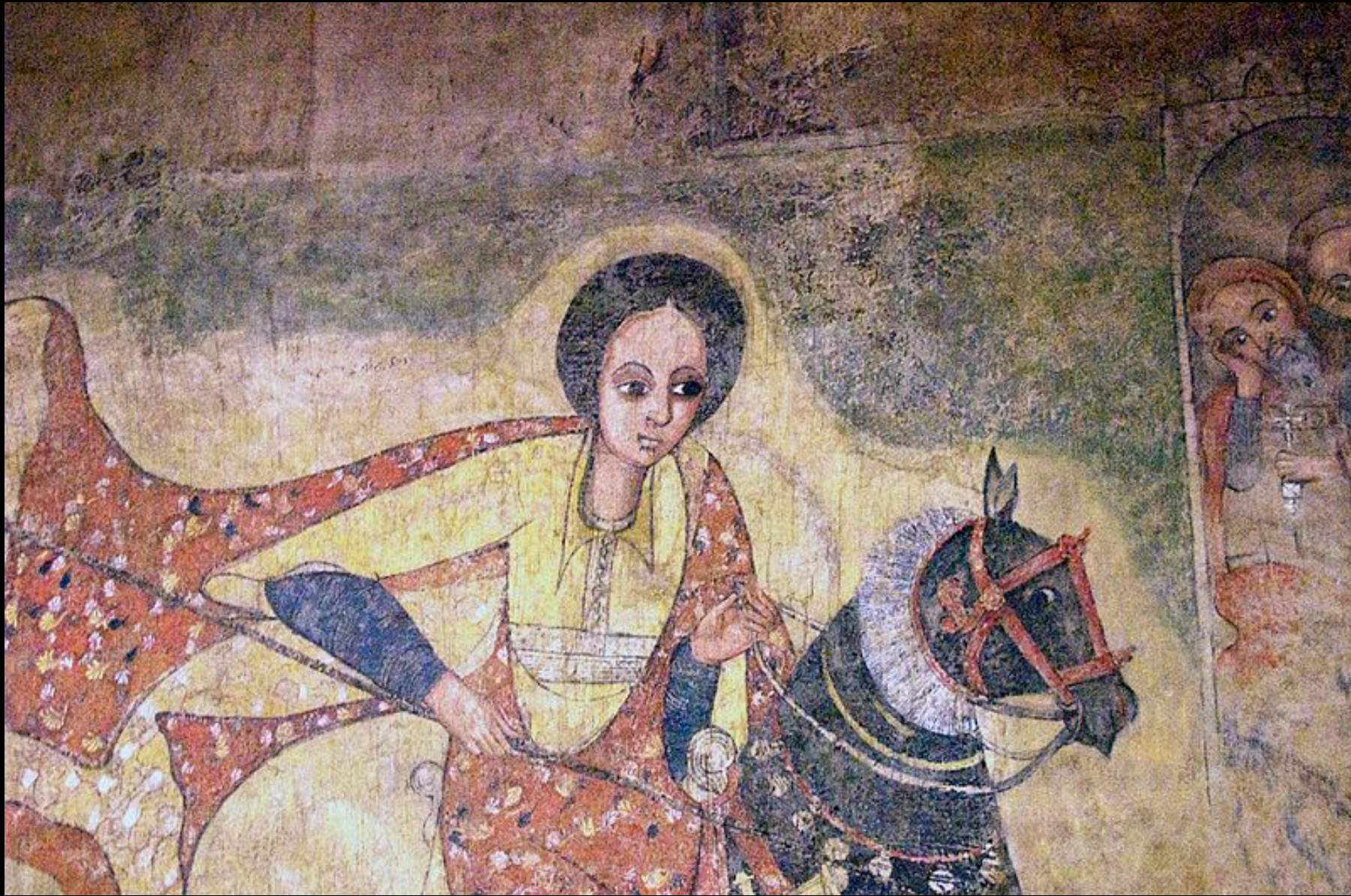
Queen of Sheba -- Lalibela Muralist, Addis Ababa National Museum, Addis Ababa, Ethiopia