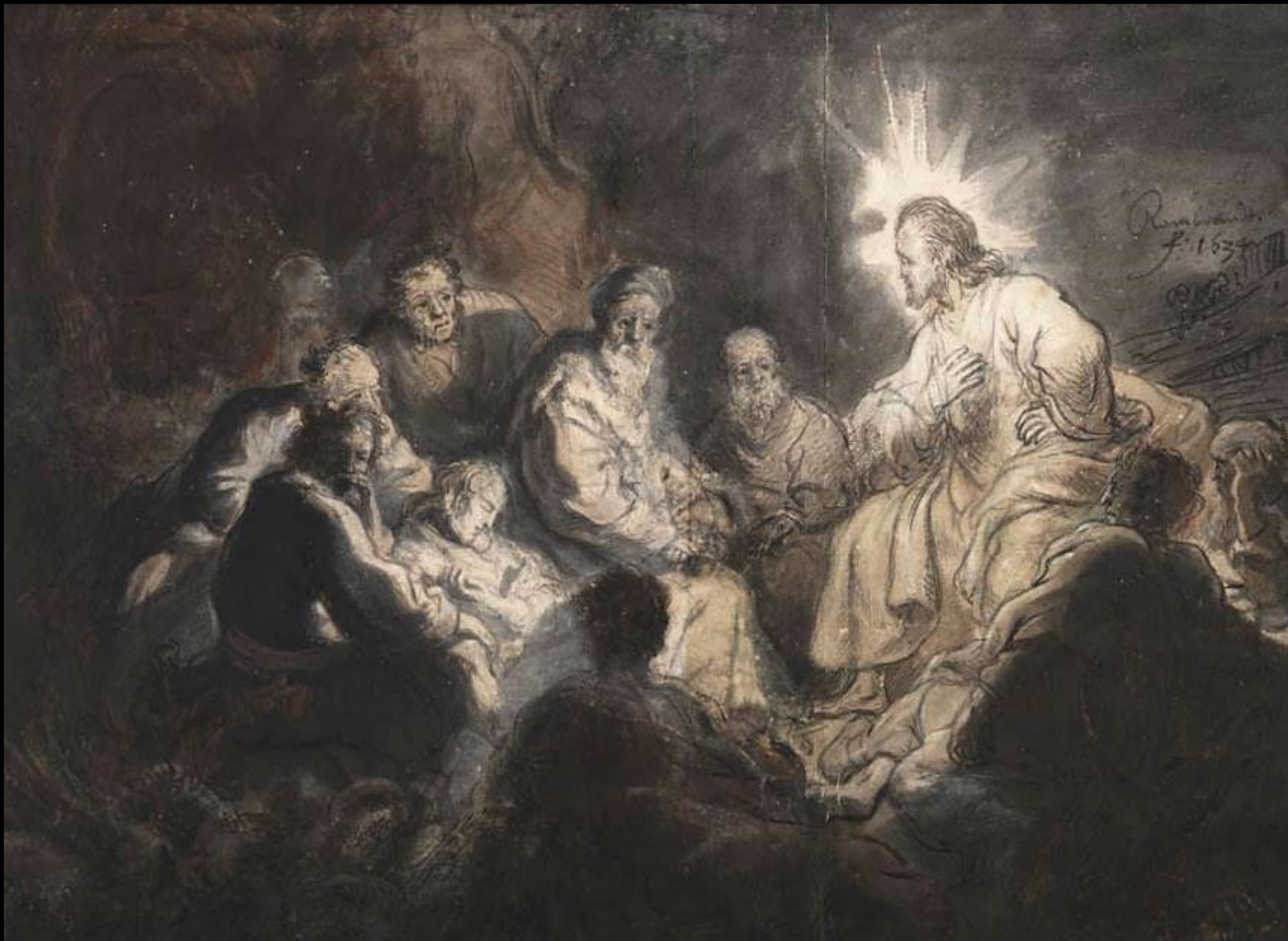
Jesus and His Disciples in Gethsemane -- Rembrandt, Teylers Museum, Haarlem, Netherlands