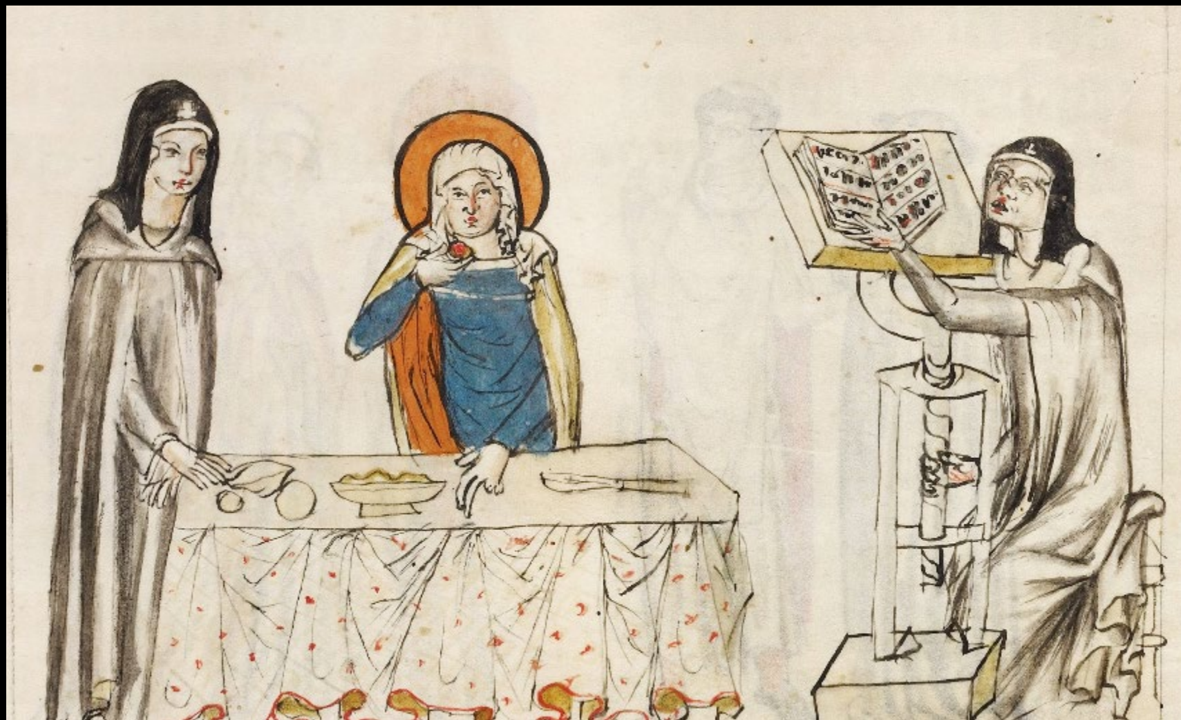
St. Hedwig of Silesia Listening to a Reading -- Getty Center, Los Angeles, CA