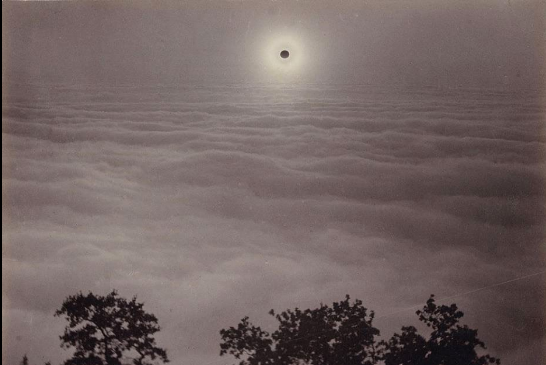
Solar Eclipse from Mount Santa Lucia -- Carleton Watkins, Getty Center, Los Angeles, CA