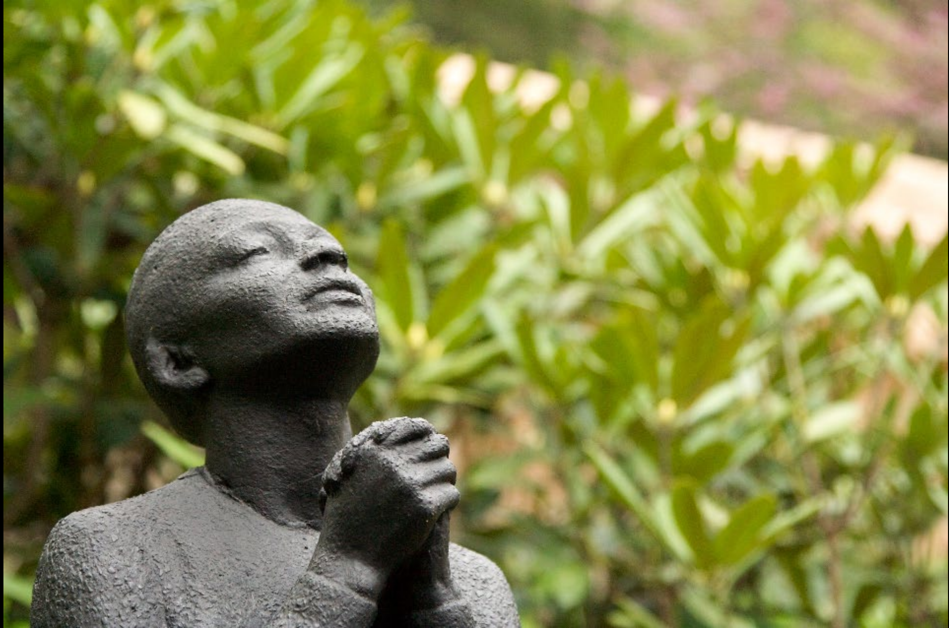
Rose McClendon in Prayer -- Richmond Barthe, Fallingwater, PA