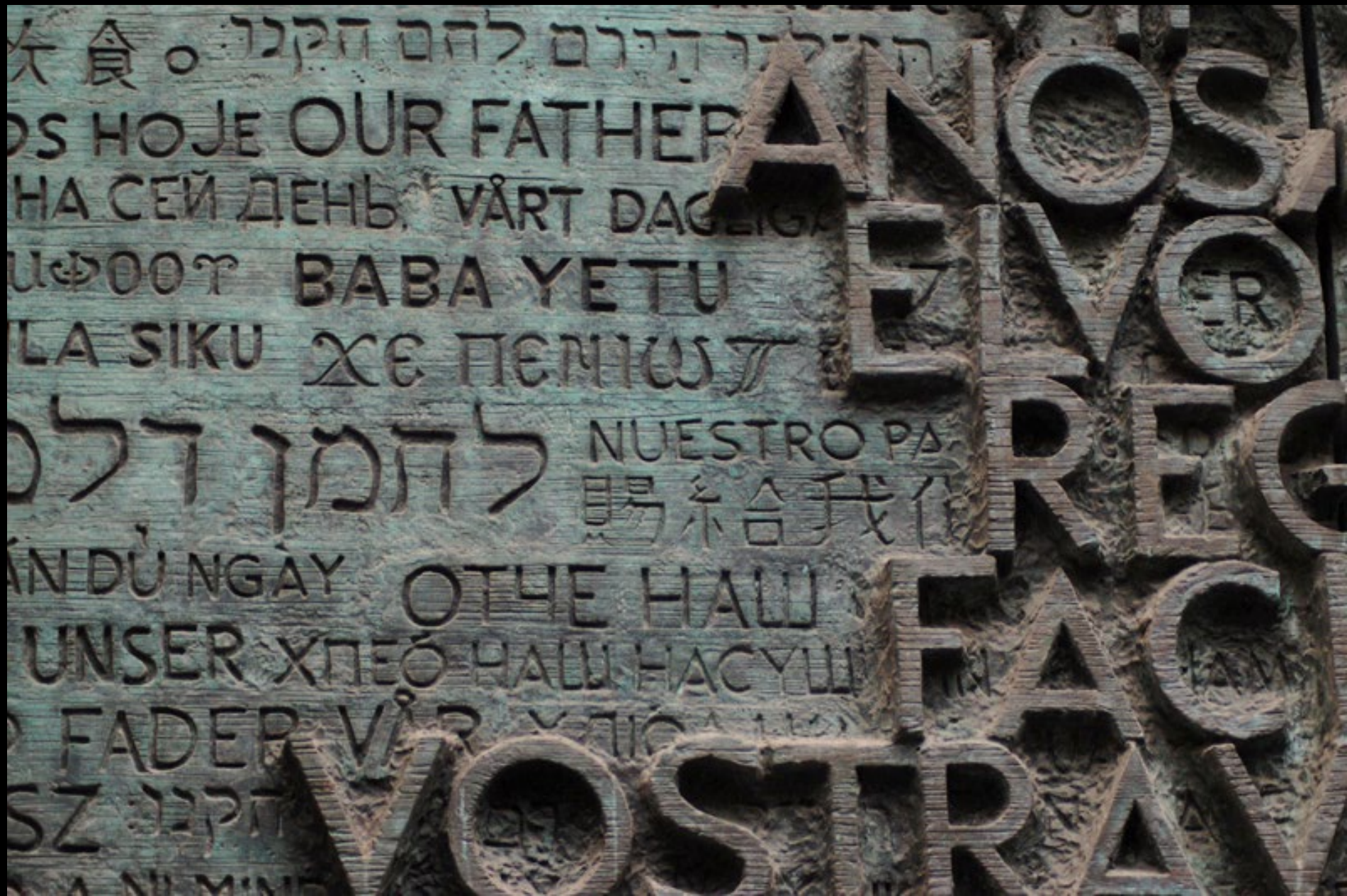
Eucharist Door with the Lord's Prayer -- Sagrada Familia, Barcelona, Spain