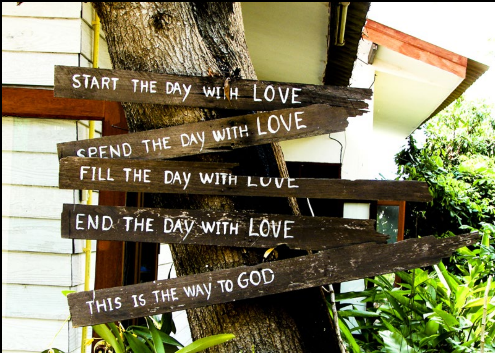
This is the Way to God -- Doi Inthanon National Park, Thailand