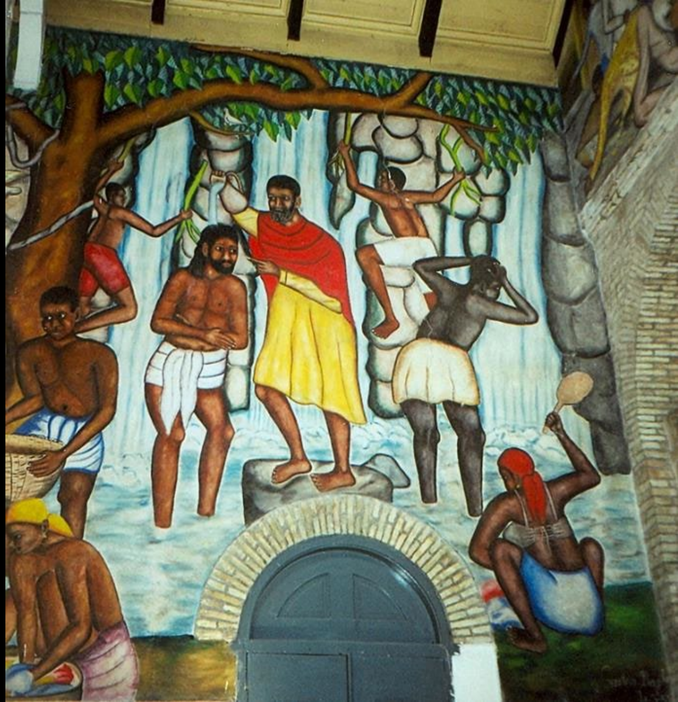
Baptism of Christ Castera Bazile Cathedral of the Holy Trinity Port-au-Prince, Haiti