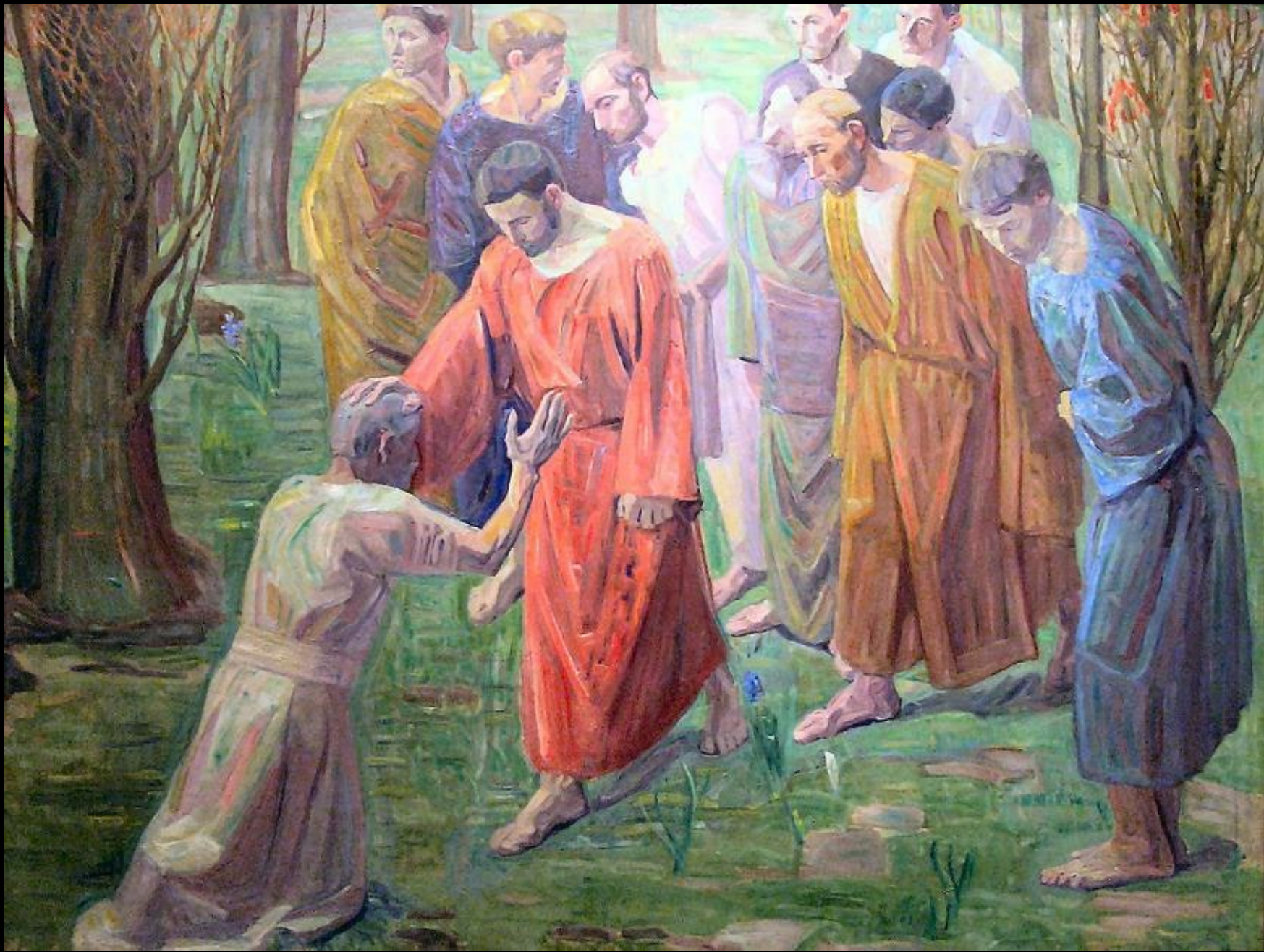
Healing of a Leper -- Niels Larsen Stevns, 1913