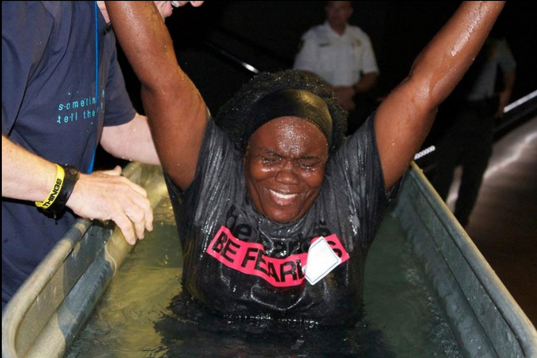
"She was Fearless and Joyful!" -- Church by the Glades, Coral Springs, FL