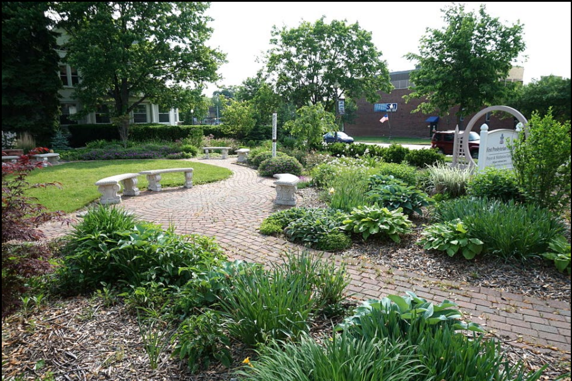
Meditation Garden -- First Presbyterian Church, Saline, MI