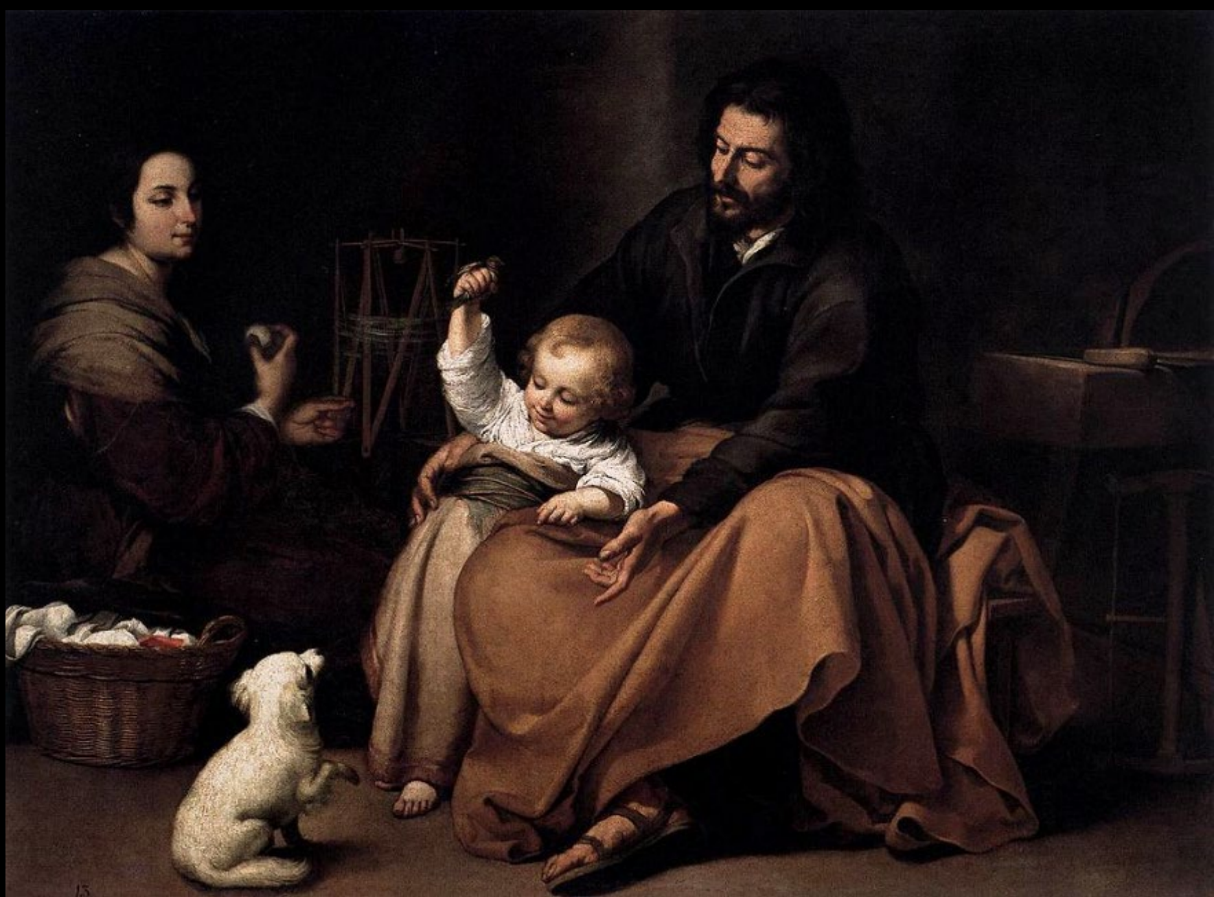
The Holy Family -- Esteban Murillo, Prado Museum, Madrid, Spain