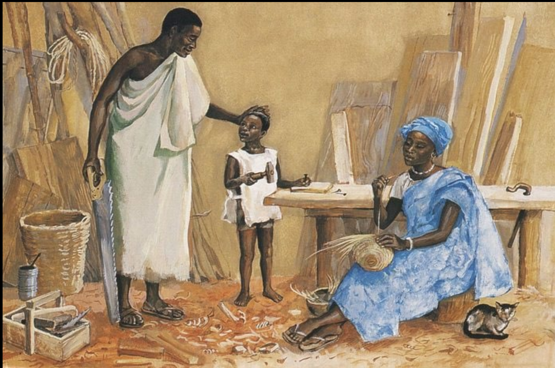
Joseph, Jesus and Mary in Nazareth -- JESUS MAFA