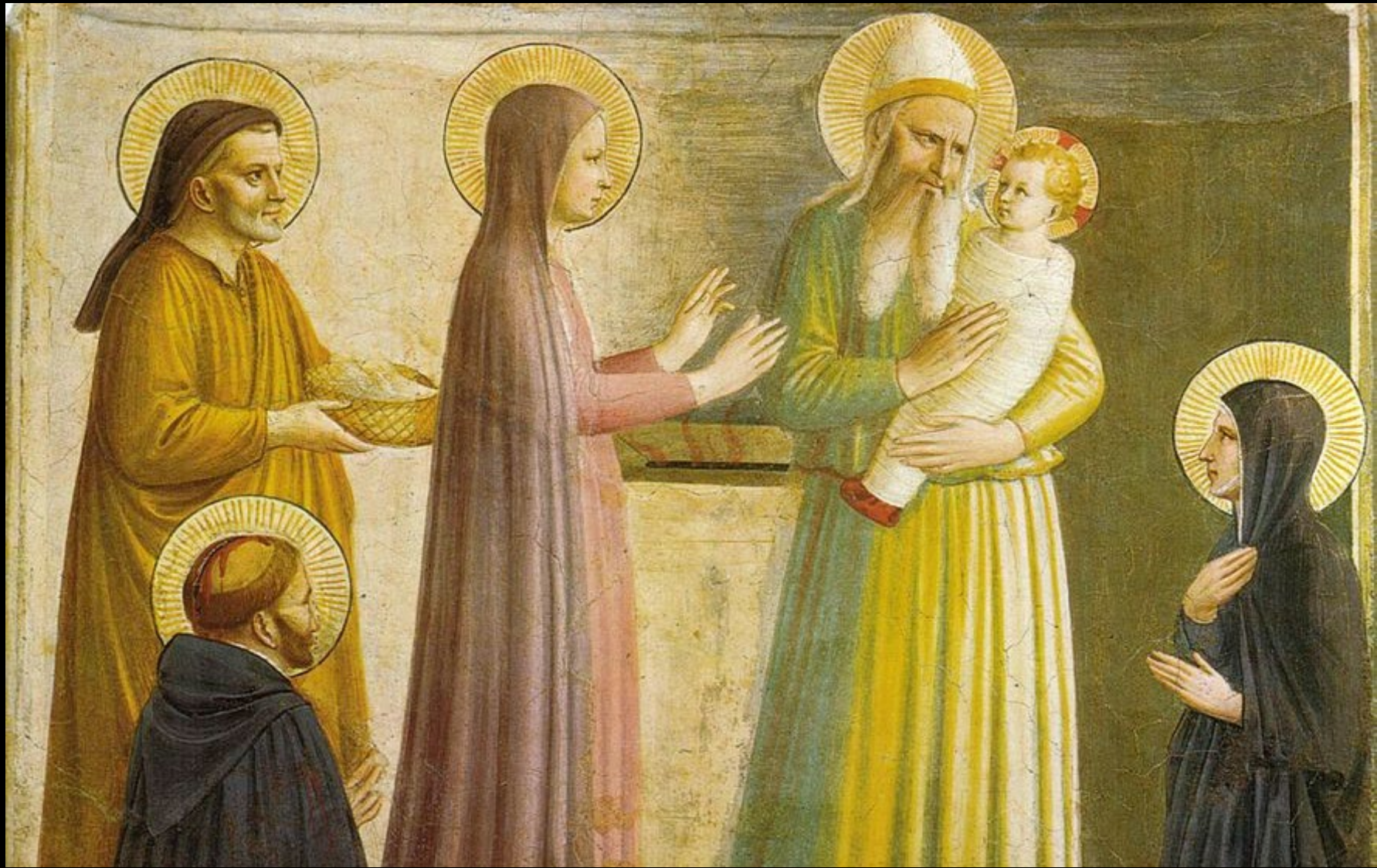
Presentation in the Temple -- Fra Angelico, San Marco, Florence, Italy