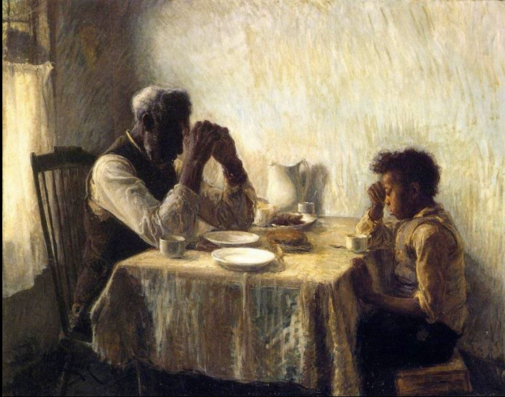
Thankful -- Henry Ossawa Tanner