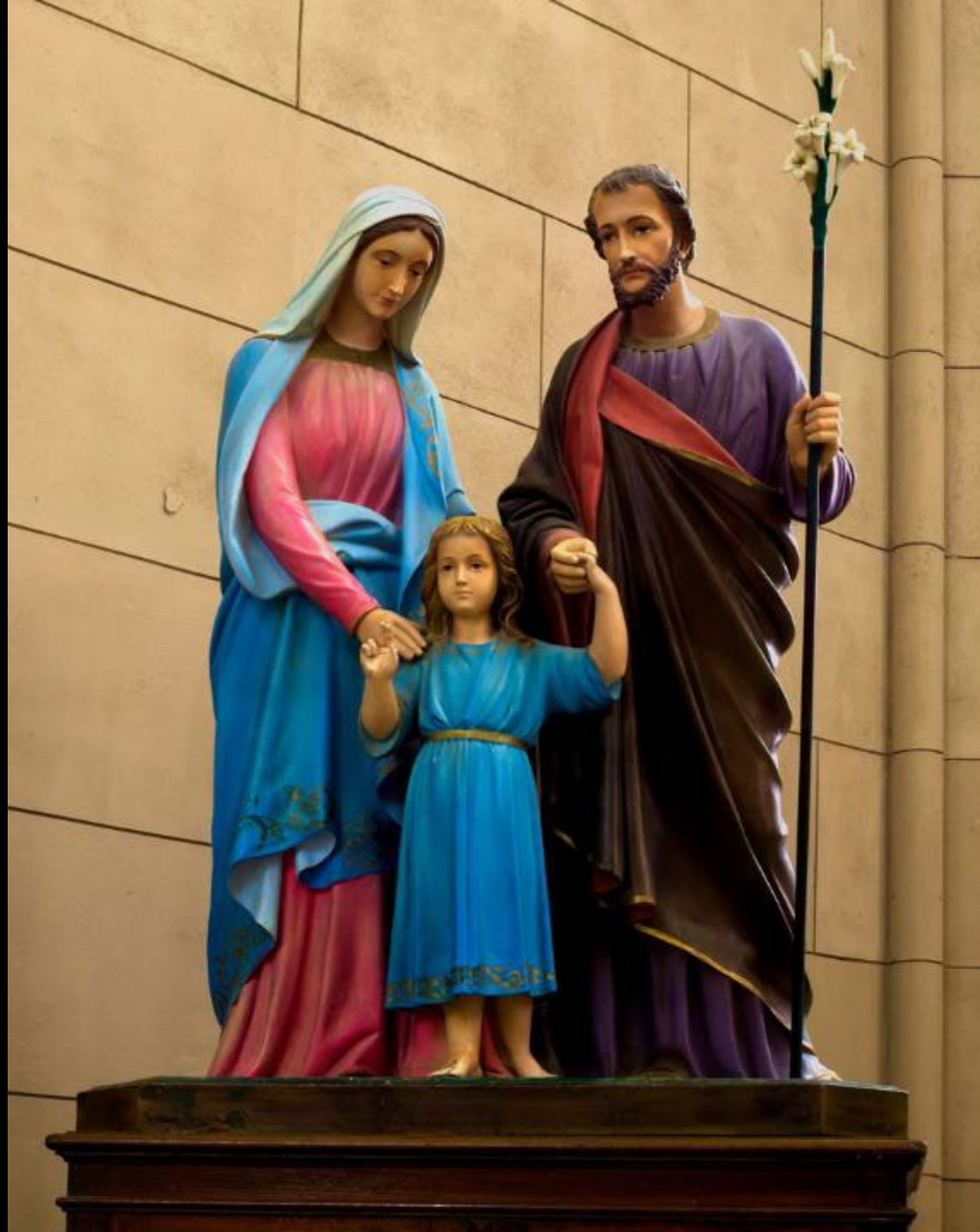
The Holy Family Basilica of Notre Dame Lujan, Philippines