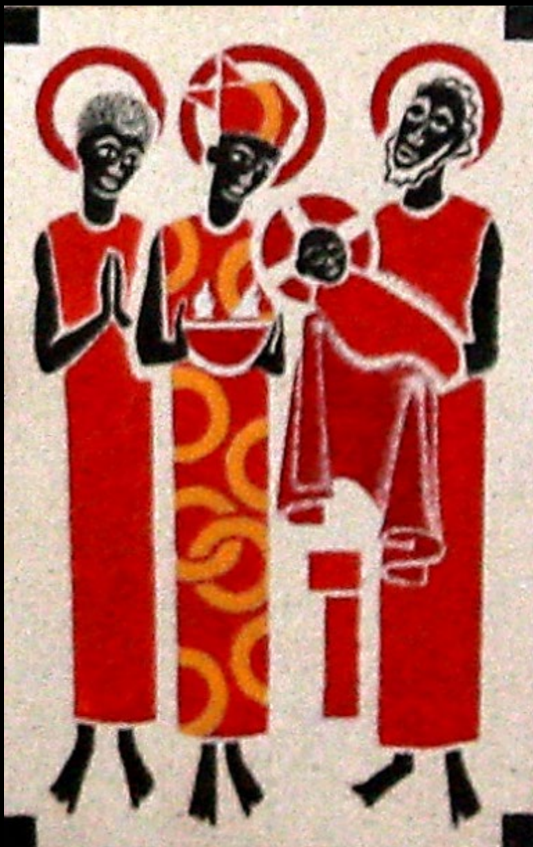
Presentation in the Temple Keur Moussa Abbey Keur Moussa, Senegal