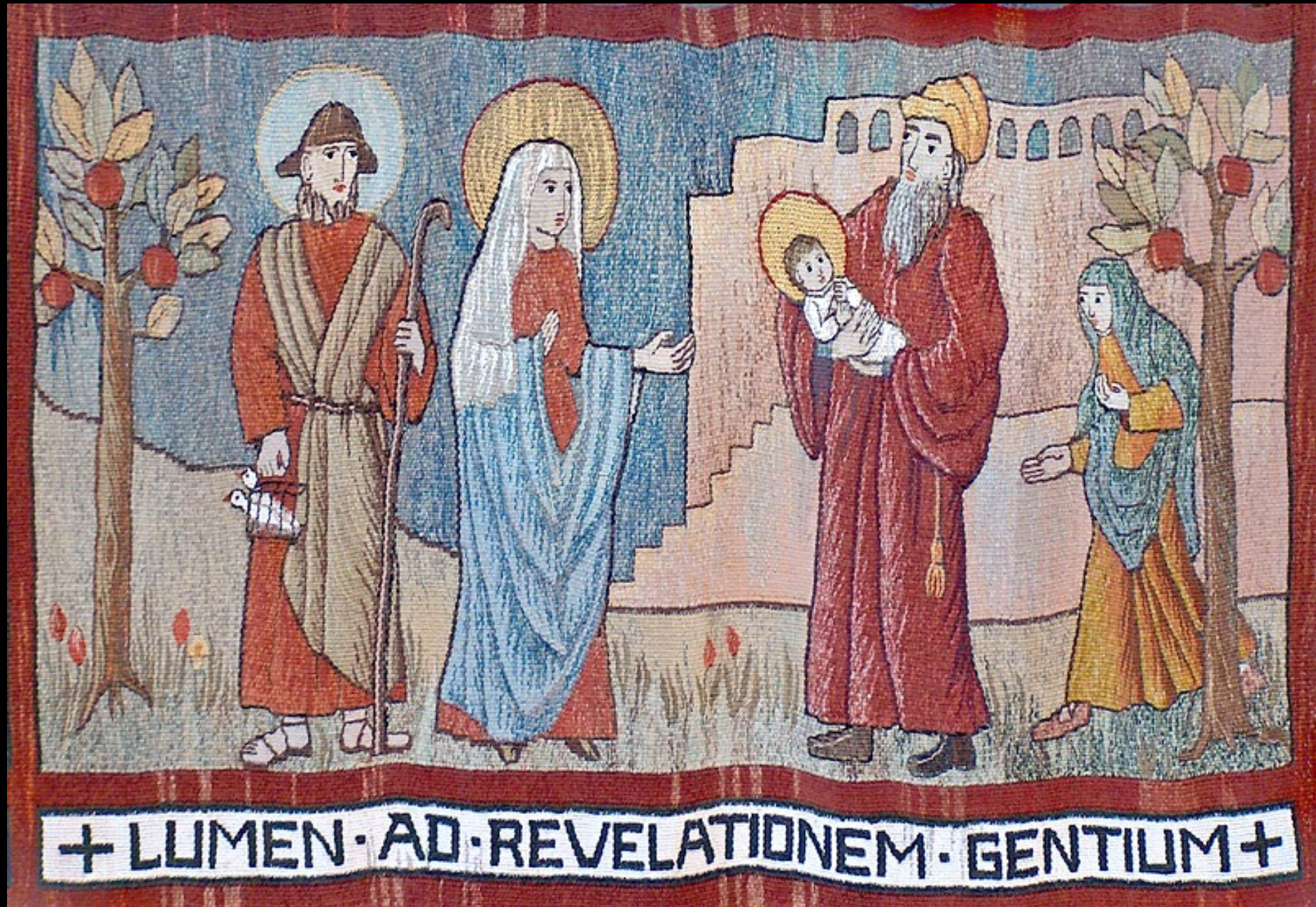
Presentation in the Temple Tapestry -- Abbey of St. Walburga, Virginia Dale, CO