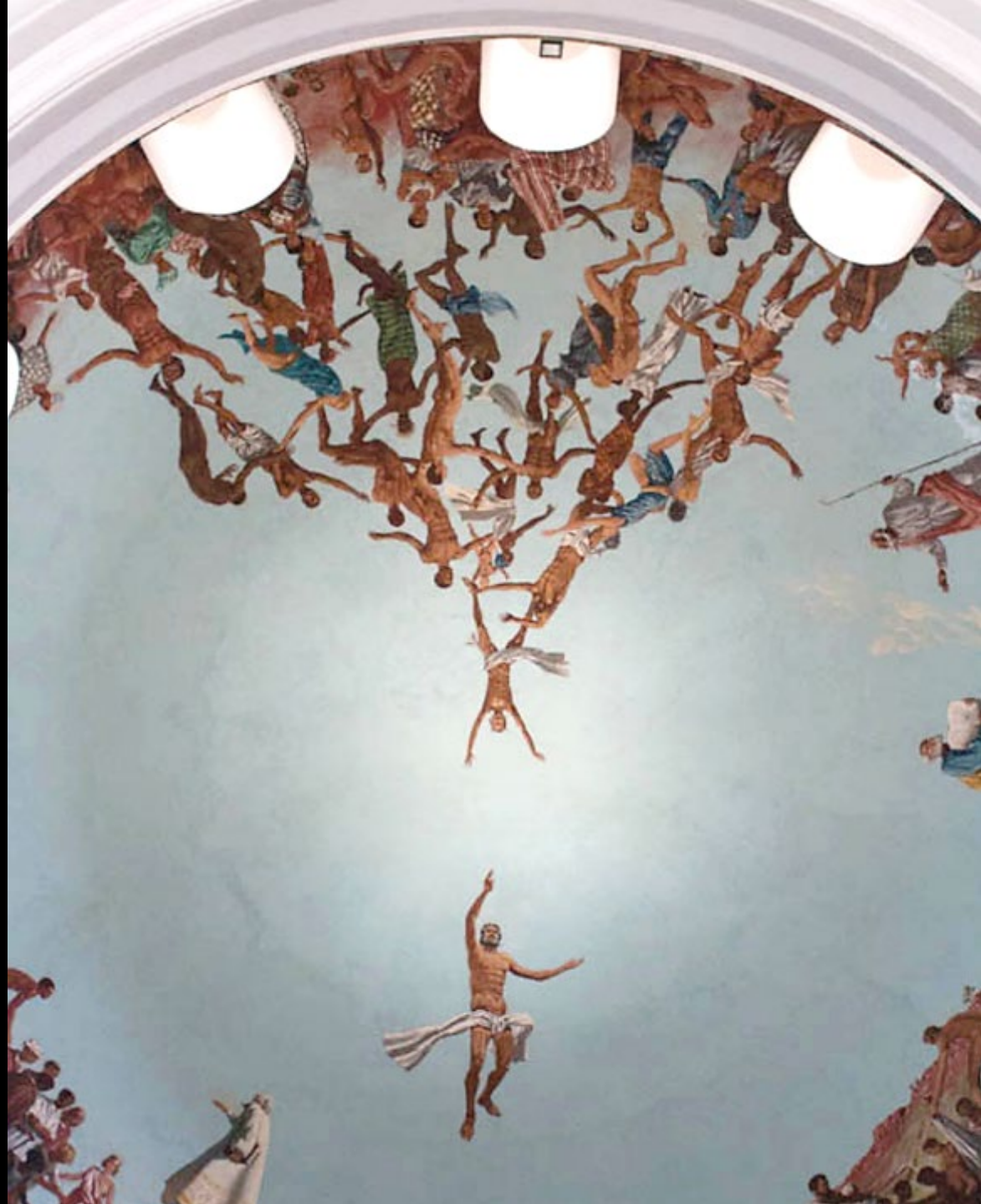
Coming to God Cathedral of Dakar Dakar, Senegal