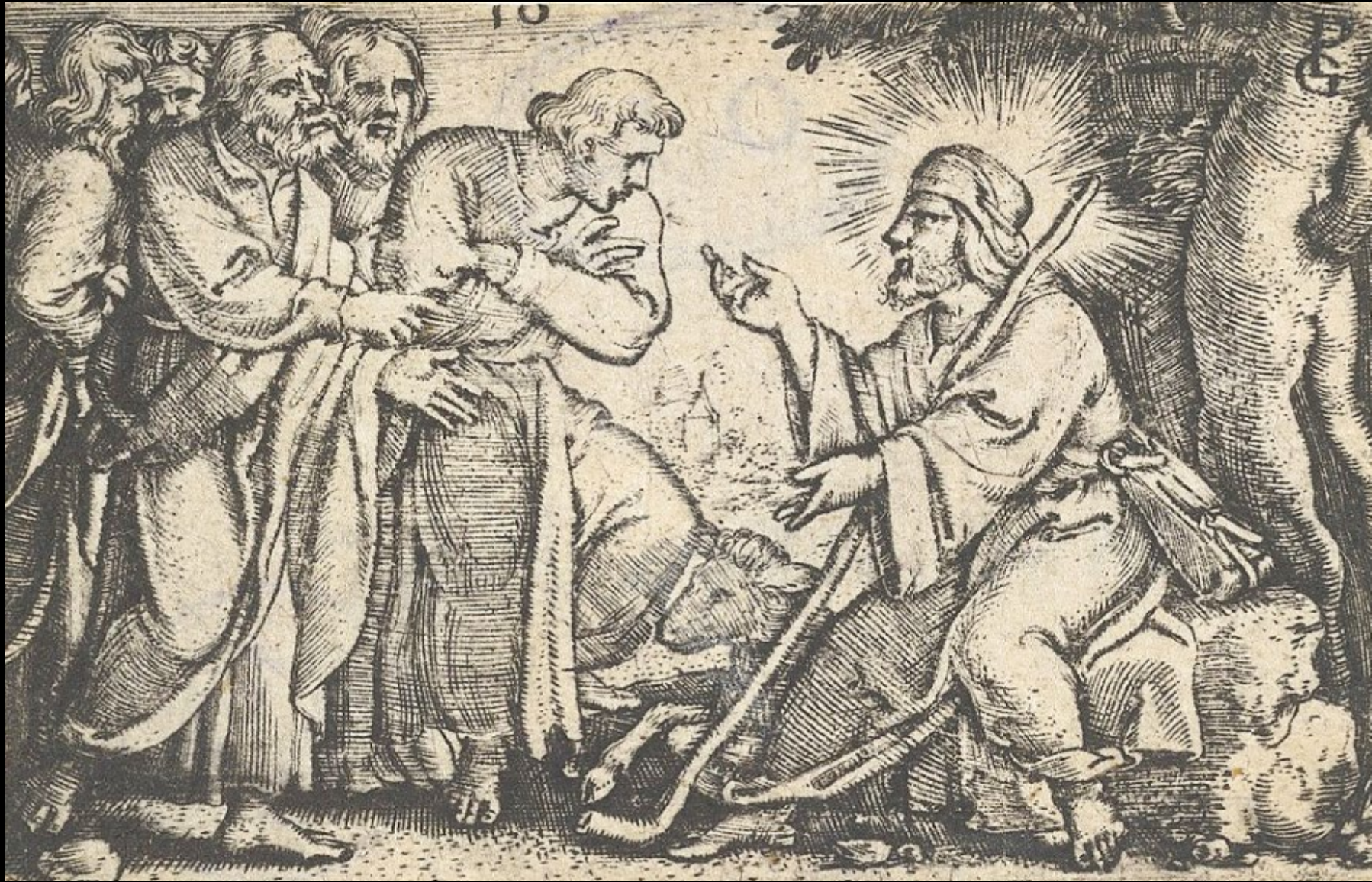
Christ Speaking to the Disciples -- Georg Pencz, Metropolitan Museum of Art, New York, NY