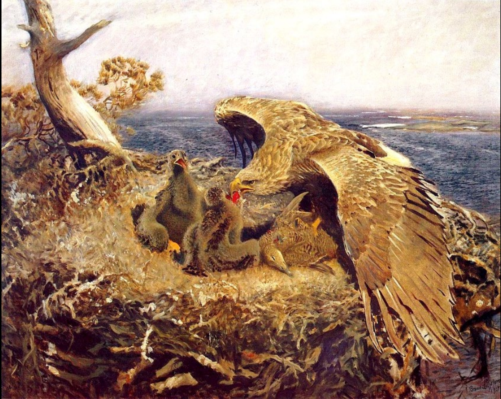
Sea Eagle's Nest -- Bruno Liljefors, National Museum, Stockholm, Sweden