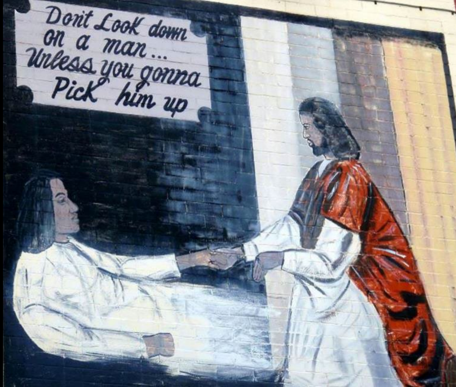
"Don't Look Down on a Man...Unless You Gonna Pick Him Up" -- Washington, DC