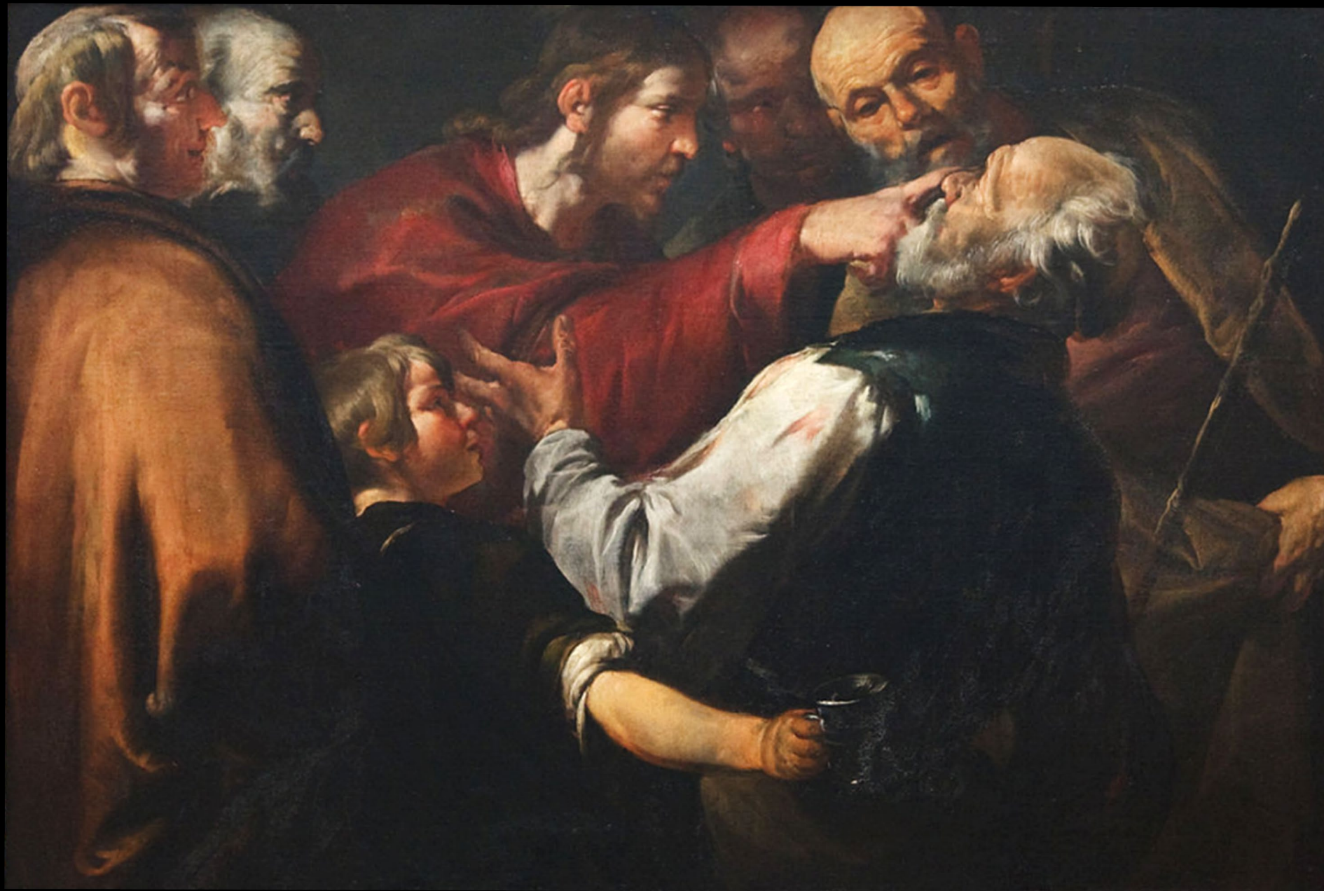
Christ Healing the Blind Man -- Gioacchino Assereto, Carnegie Museum of Art, Pittsburgh, PA