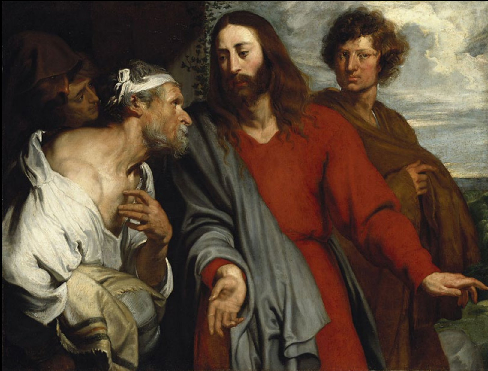
Healing of the Paralytic -- Anthony van Dyck, Staatsgalerie, Neuberg, Germany