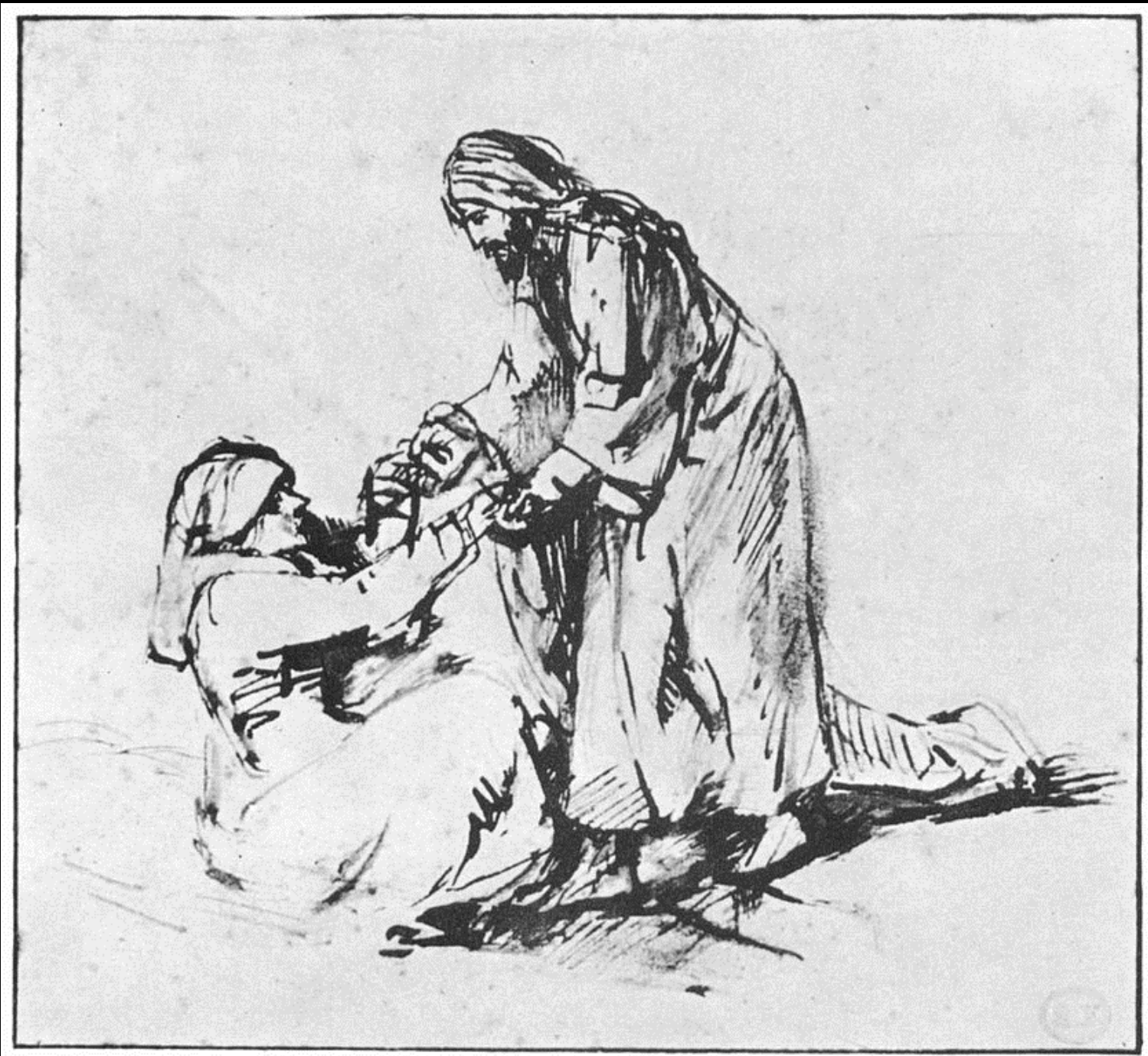
Healing Peter's Mother-in-Law

Rembrandt Fondation Custodia Amsterdam, Netherlands