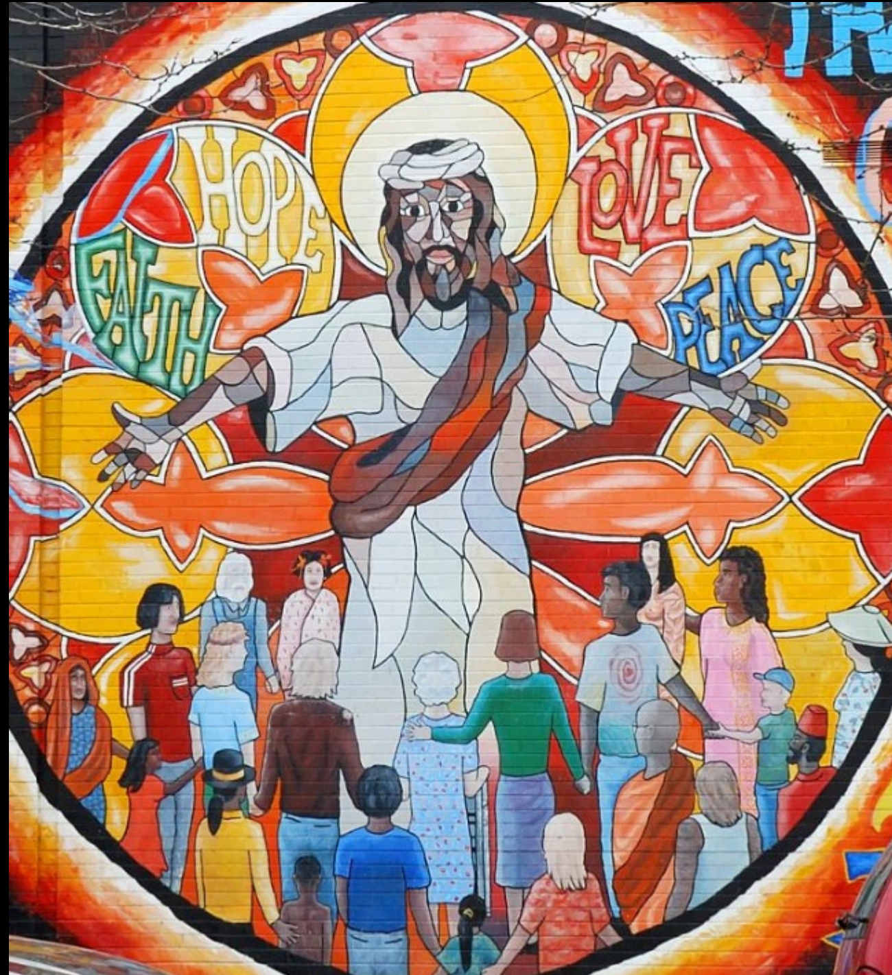
Message of Christ Mural