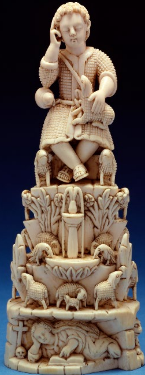
Christ Child as Good Shepherd

Goa, India Walters Art Museum Baltimore, MD