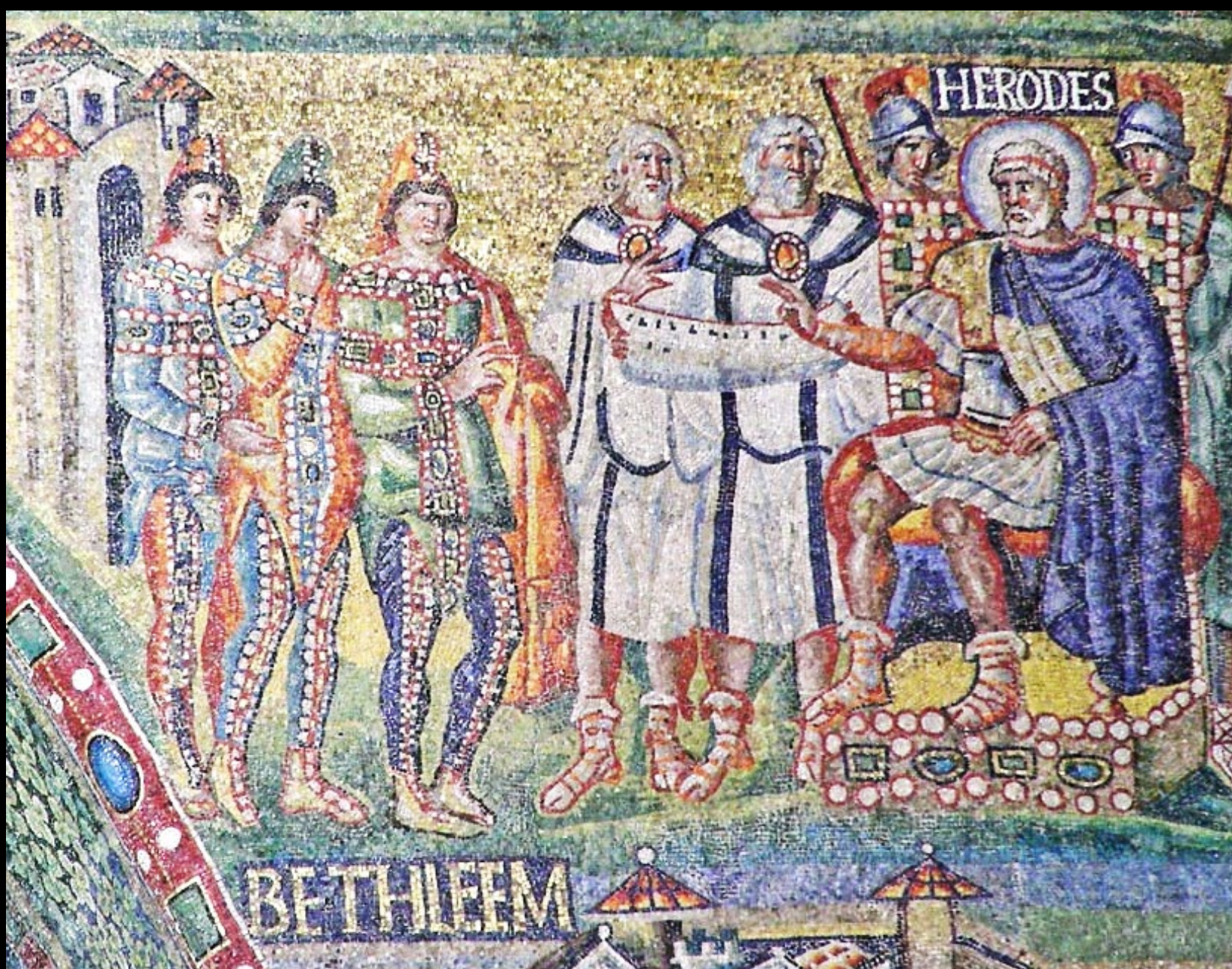
Herod Speaks with the Magi -- Mosaic, Santa Maria Maggiore, Rome, Italy