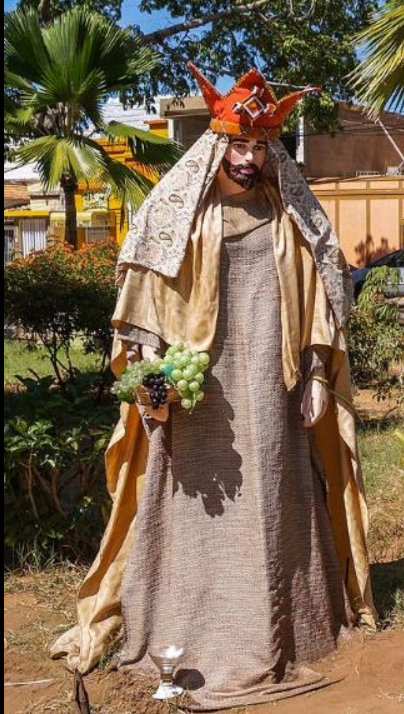
Figure of the Tres Reyes Magos Maracaibo, Venezuela