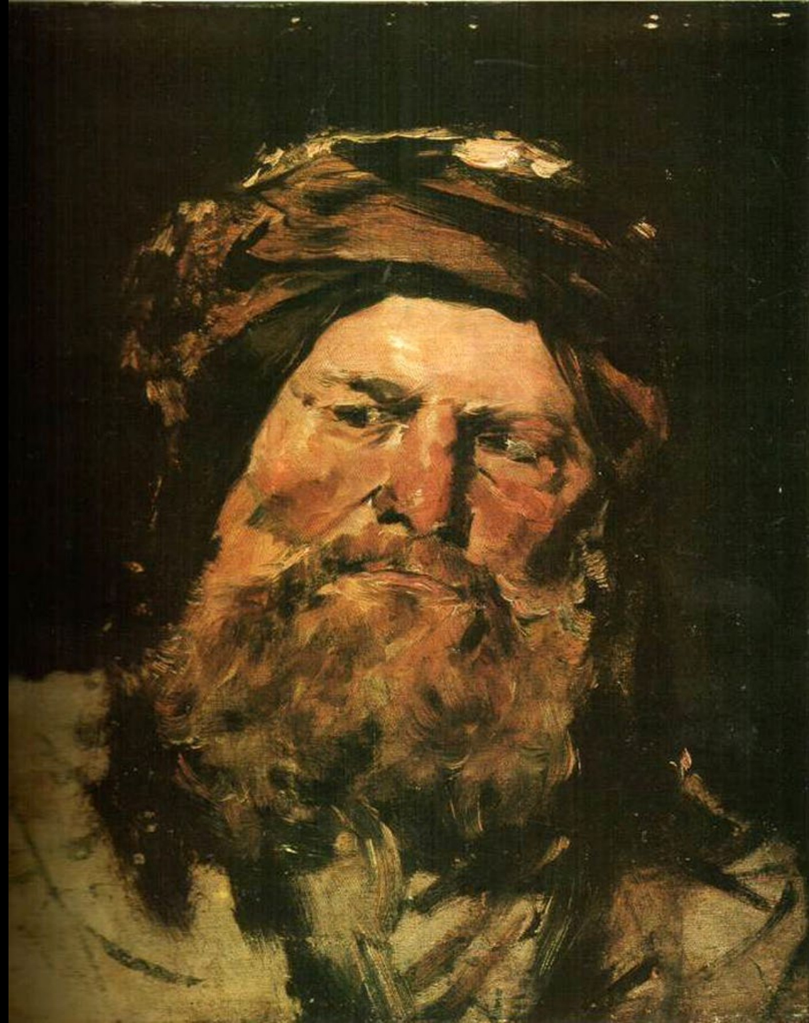
Head of a Pharisee Mihály Munkácsy, 1881