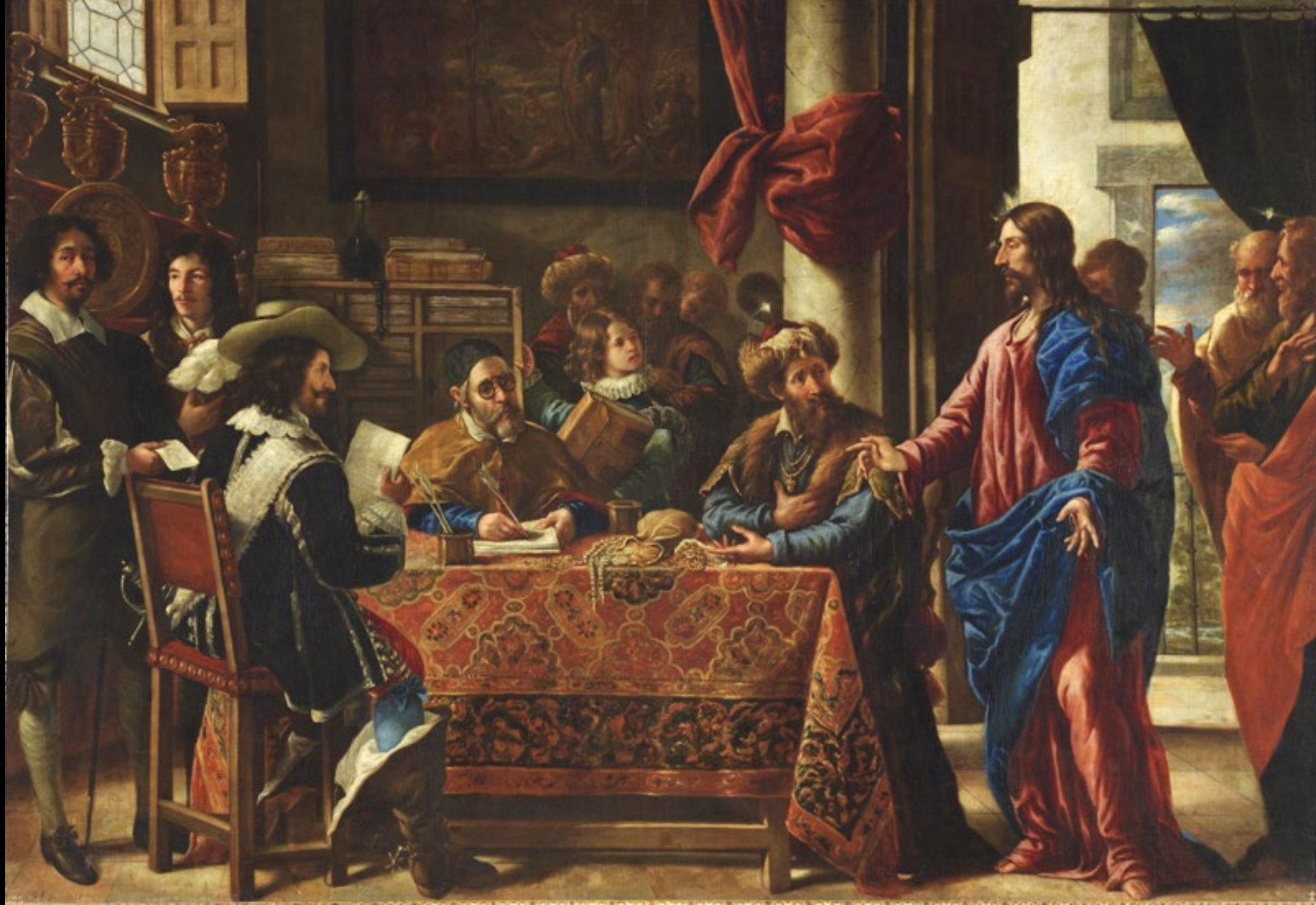
Vocation of Saint Matthew, Juan de Pareja, 1661