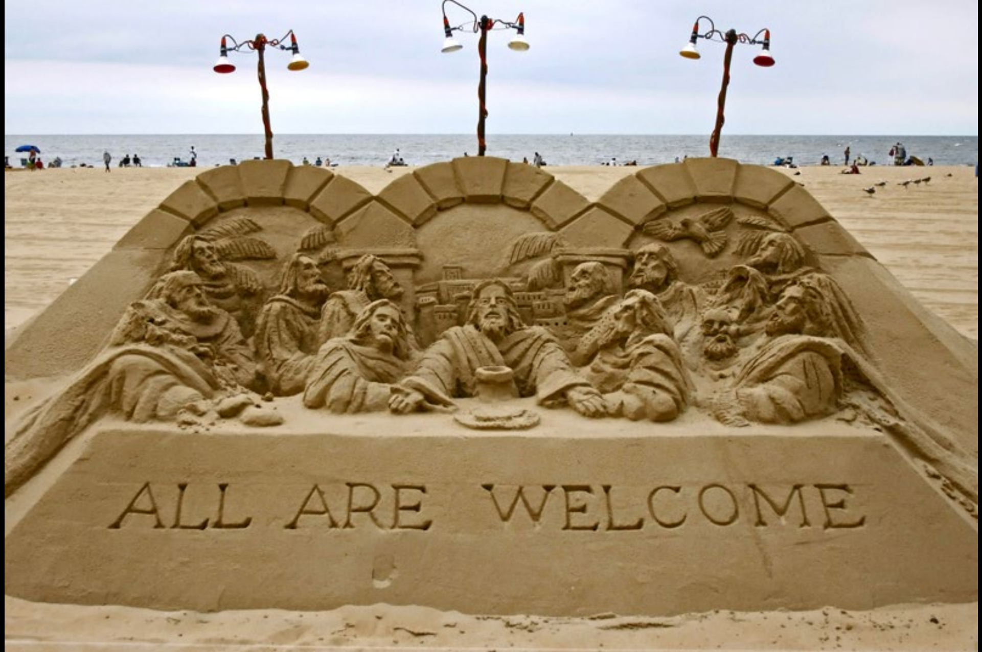
All Are Welcome in the Kingdom of God, Ocean City, Maryland, 2007