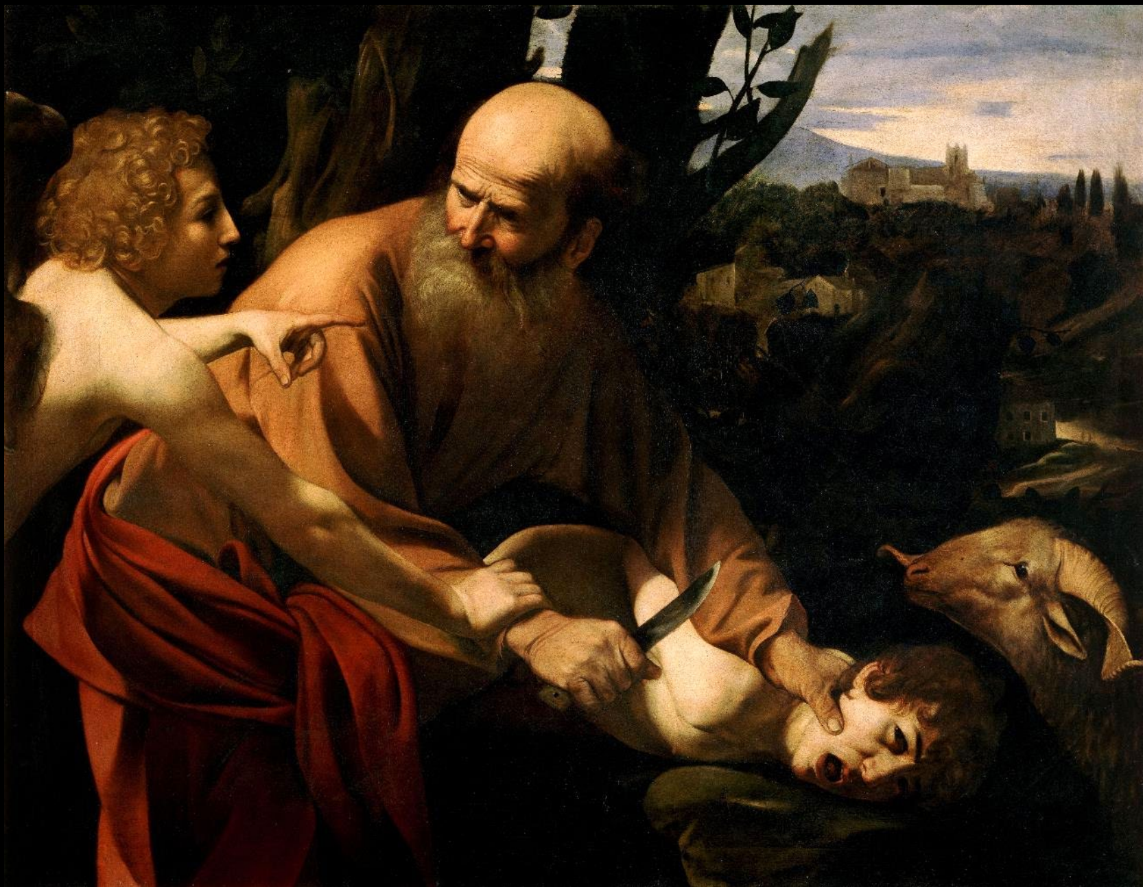
Sacrifice of Isaac – Caravaggio, Uffizi Gallery, Florence, Italy