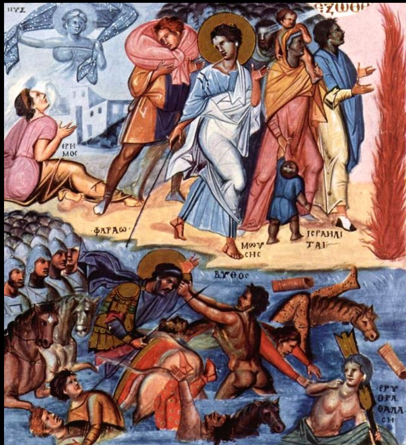
Crossing the Red Sea, Paris Psalter