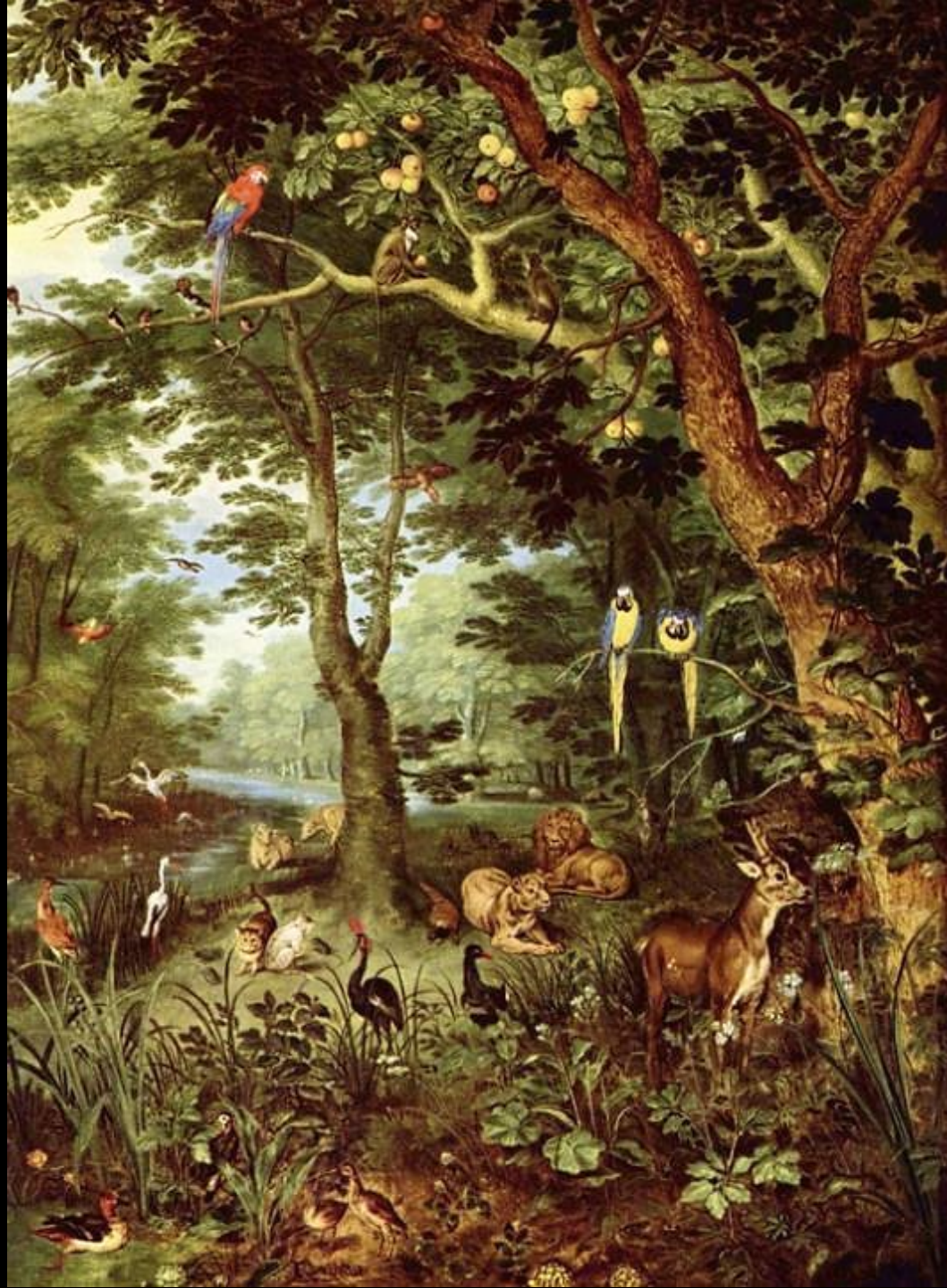
Paradise Jan Brueghel Gemaldegalerie Berlin, Germany