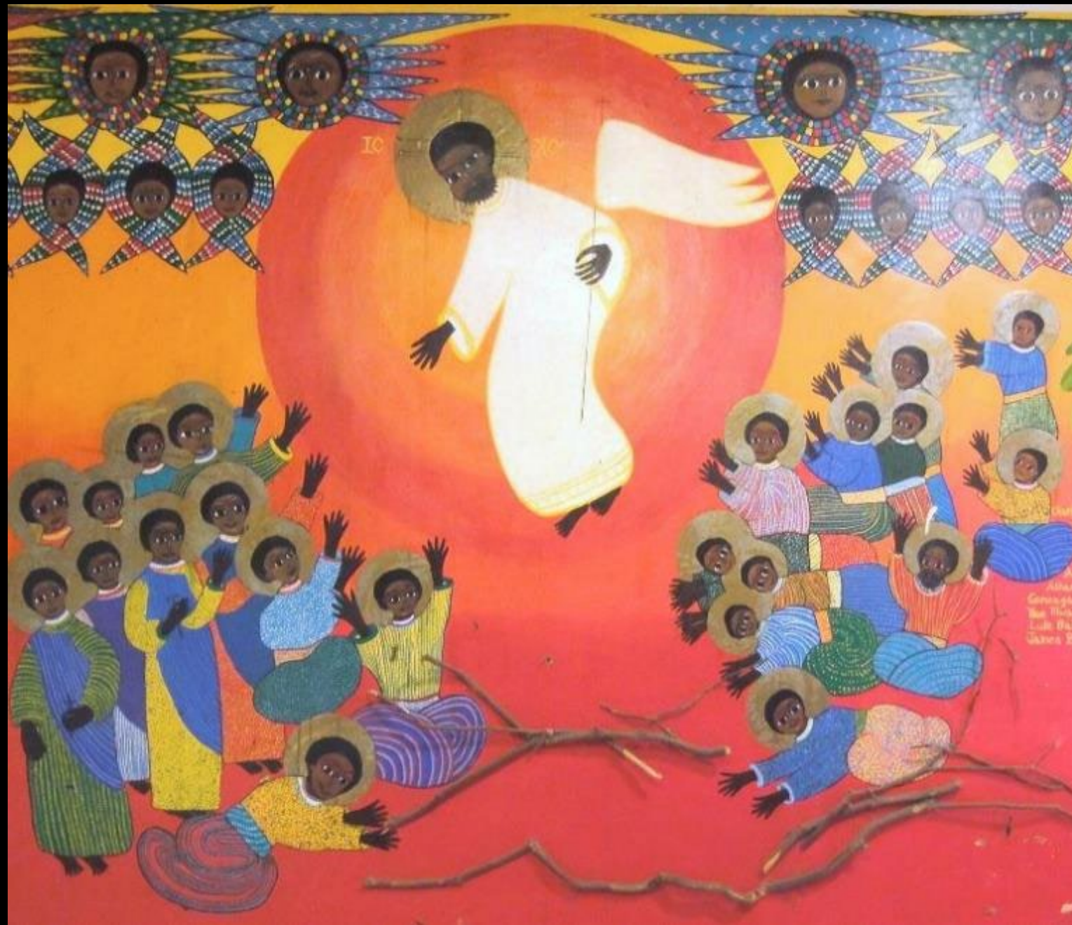
Emmaus House – Martyrs of Uganda, Kamapala, Uganda