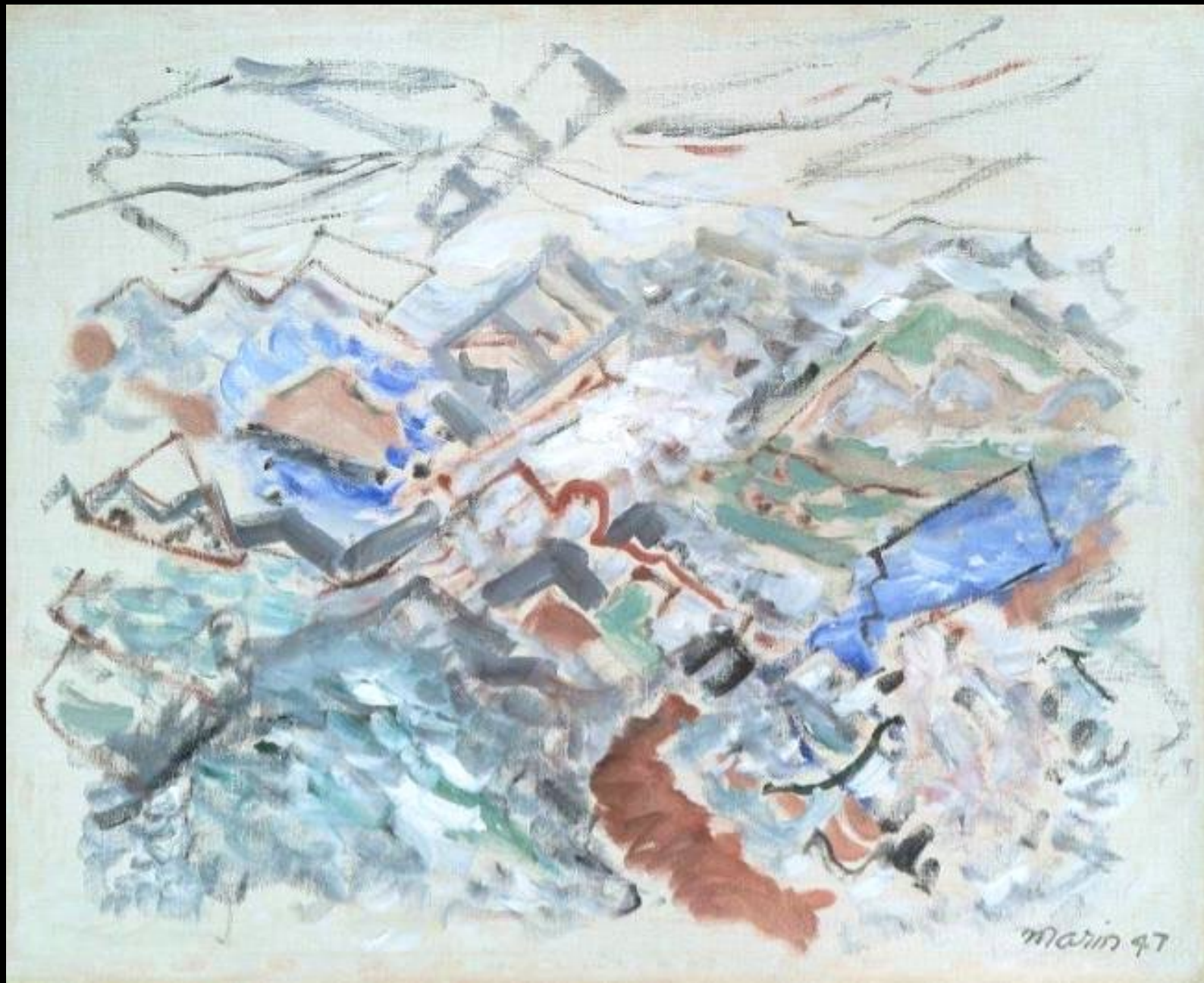
Movement – Sea or Mountain as You Will -- John Marin, Museum of Fine Arts, Boston, MA