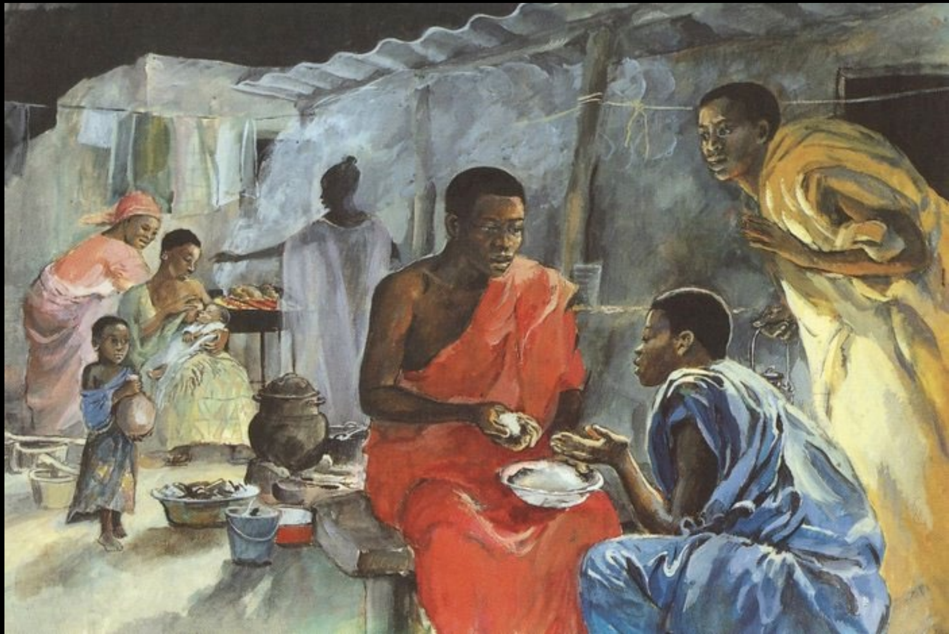
Jesus Appears at Emmaus -- JESUS MAFA, Cameroon