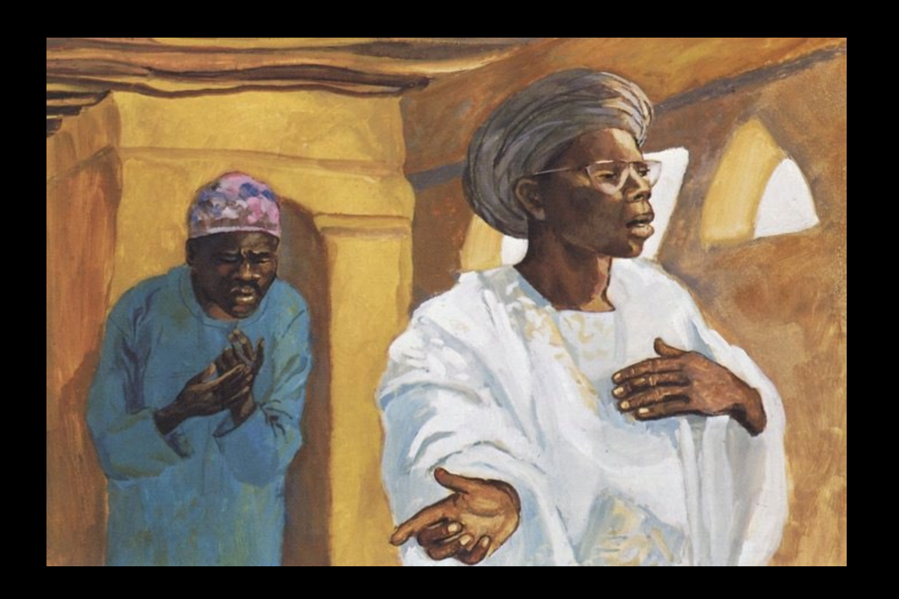
The Pharisee and the Publican -- JESUS MAFA, Cameroon