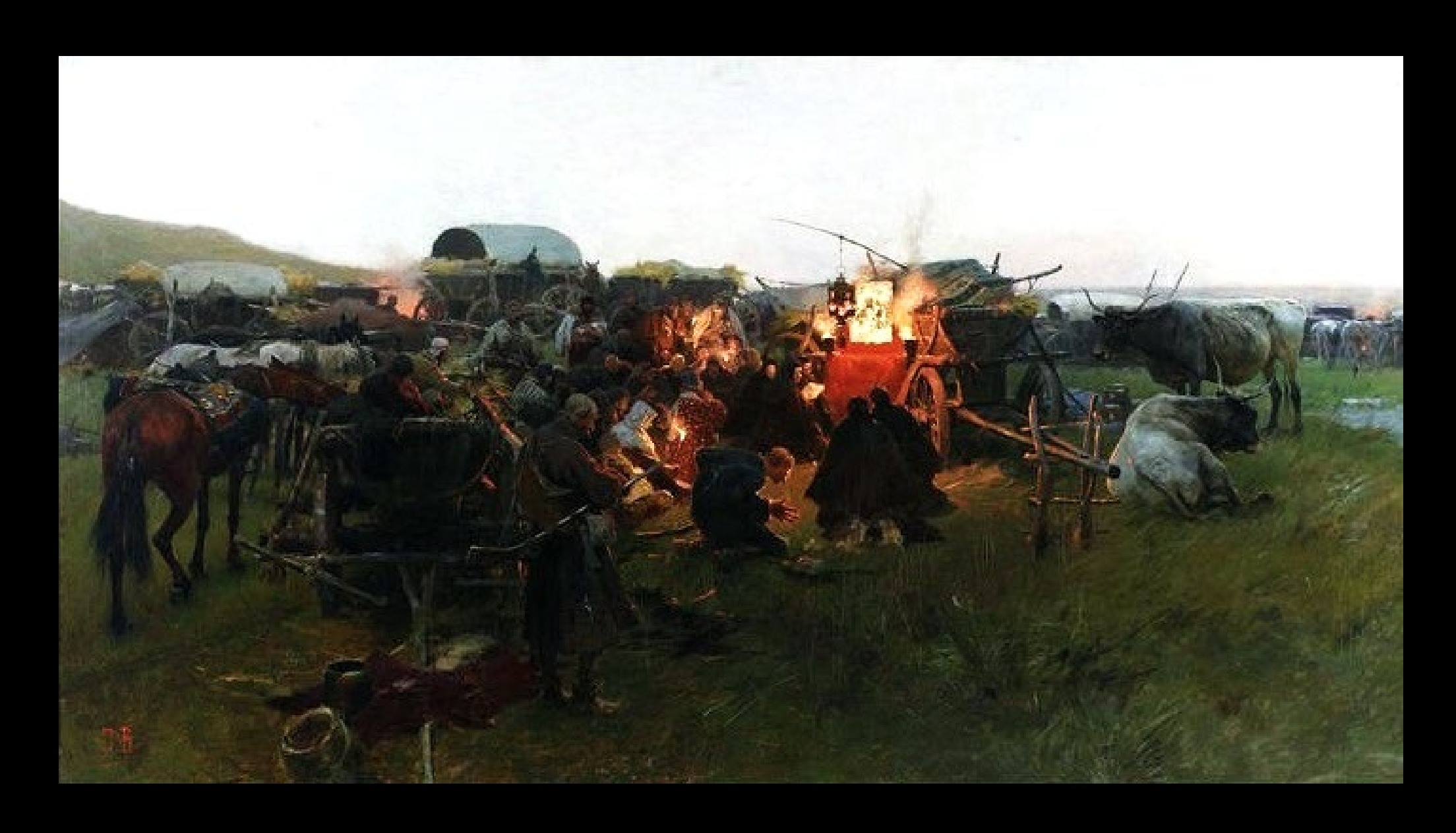
Prayer in the Steppe -- Jozef Brandt, National Museum, Warsaw, Poland