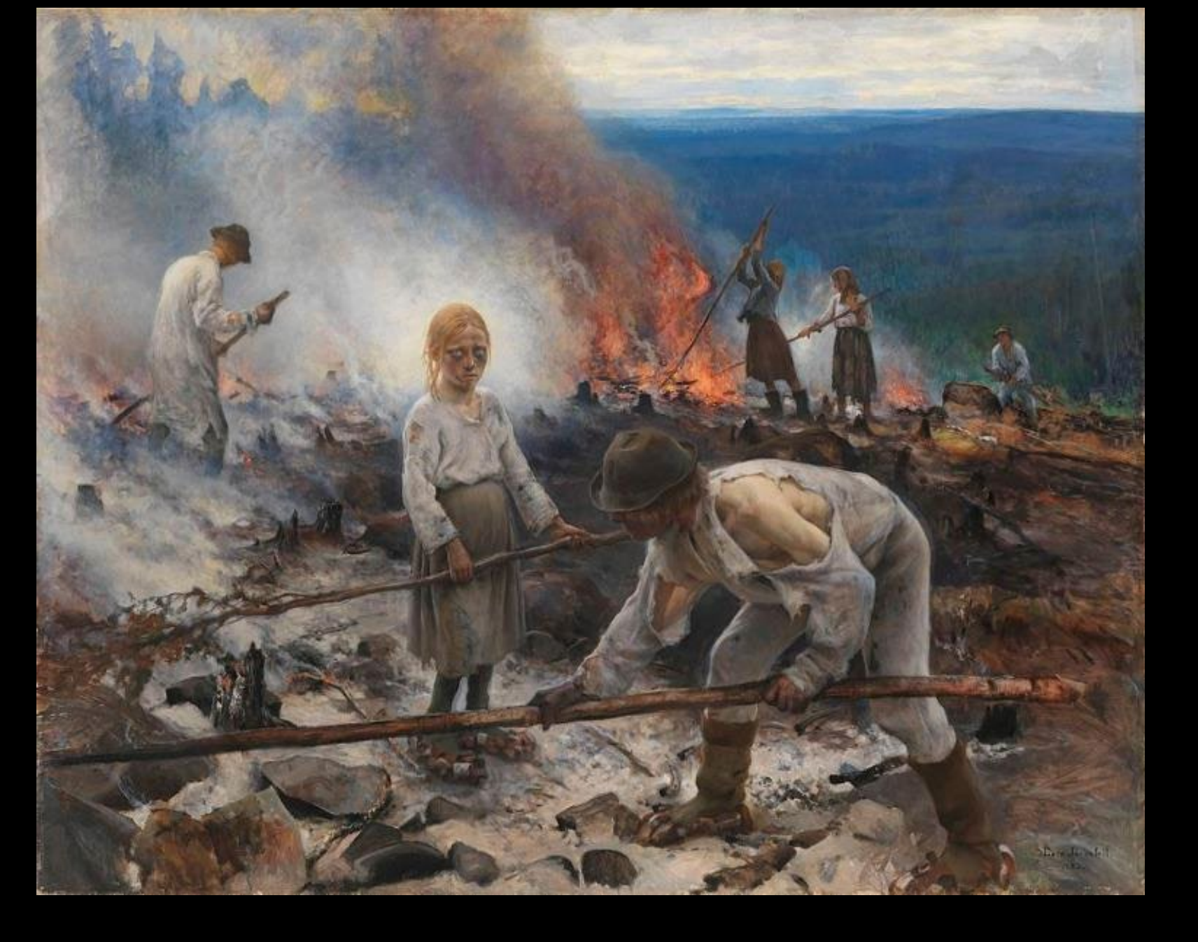
Under the Yoke -- Eero Jarnefelt, Finnish National Gallery, Helsinki, Finland