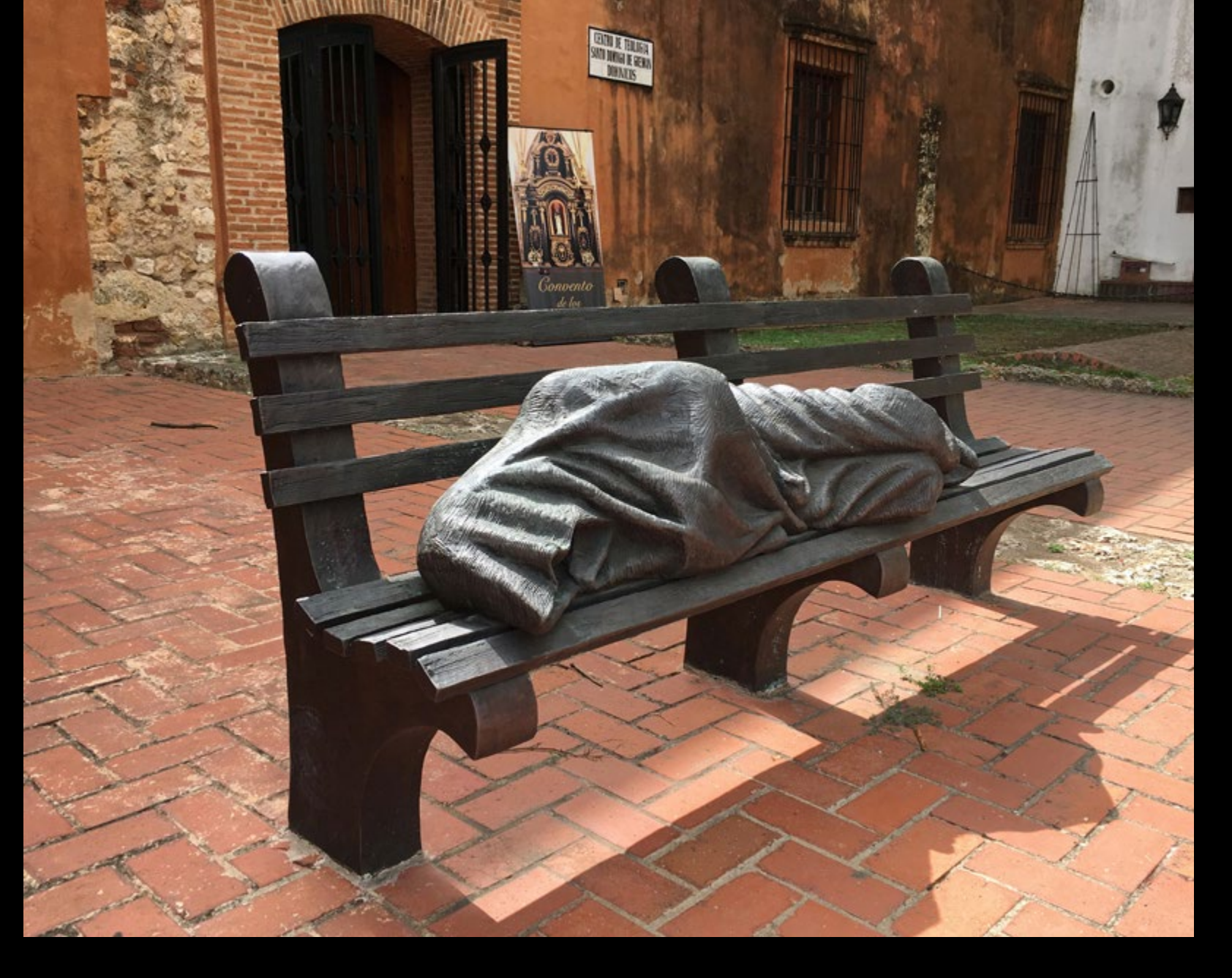
Homeless Jesus -- Timothy Schmalz, Dominican Convent, Santo Domingo, Dominican Republic