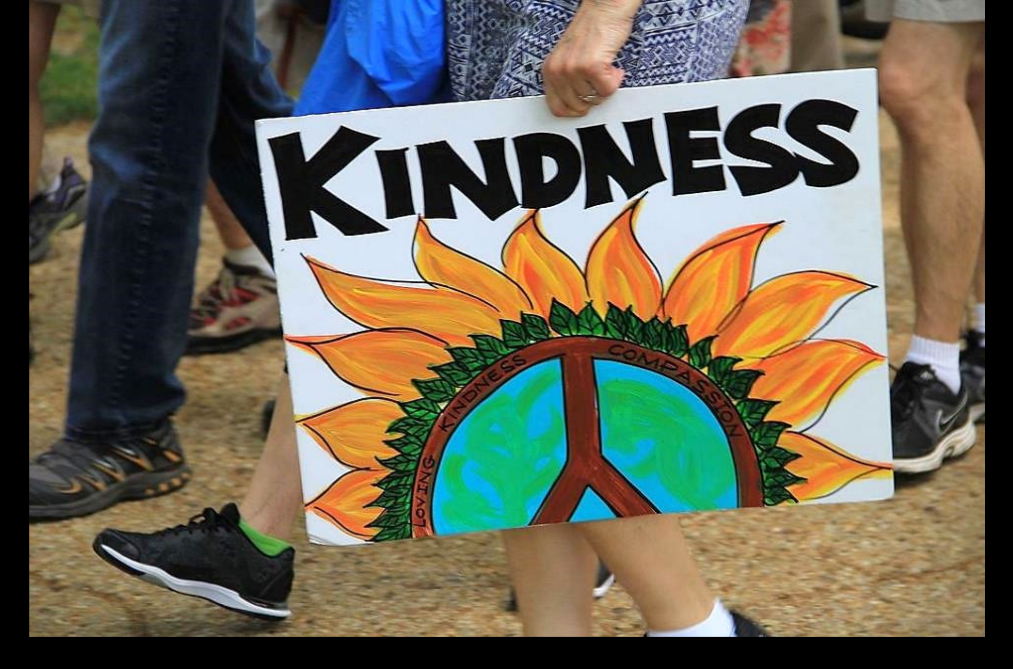
Kindness, Compassion, Peace -- People's Climate March, 2017