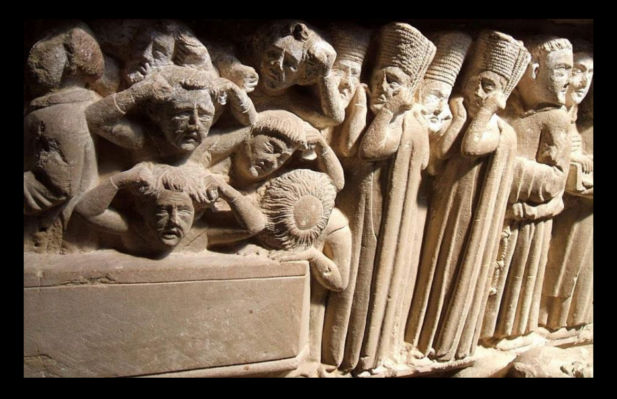
Sepulcher in Cistercian monastery -- Santa María del Salvador, Cañas, Spain