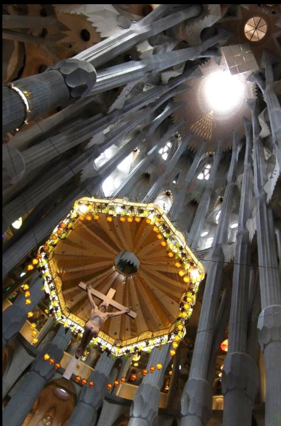
Ascension Bousure Sagrada Familia Barcelona, Spain