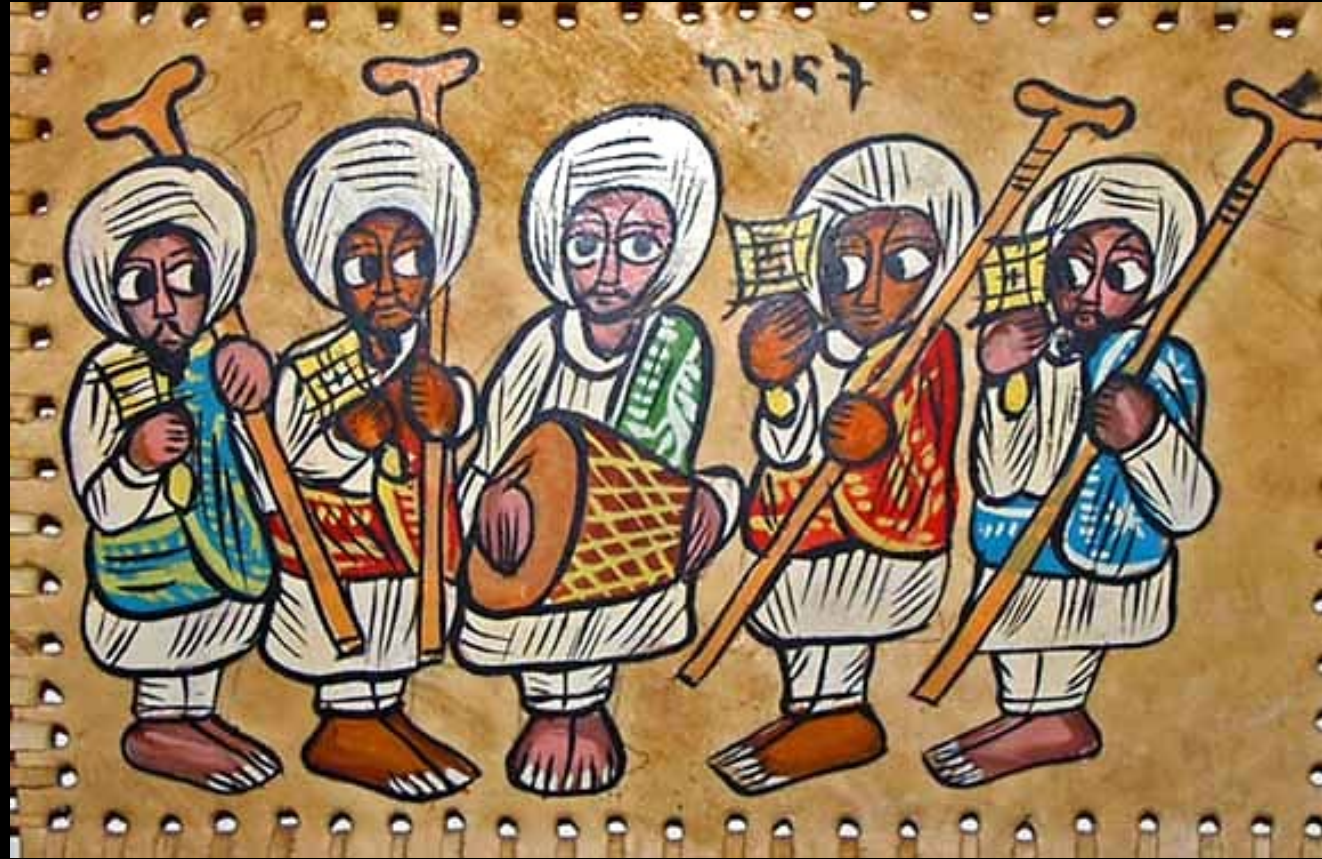
Ethiopian Orthodox Choir -- Paint on leather, 20 th century