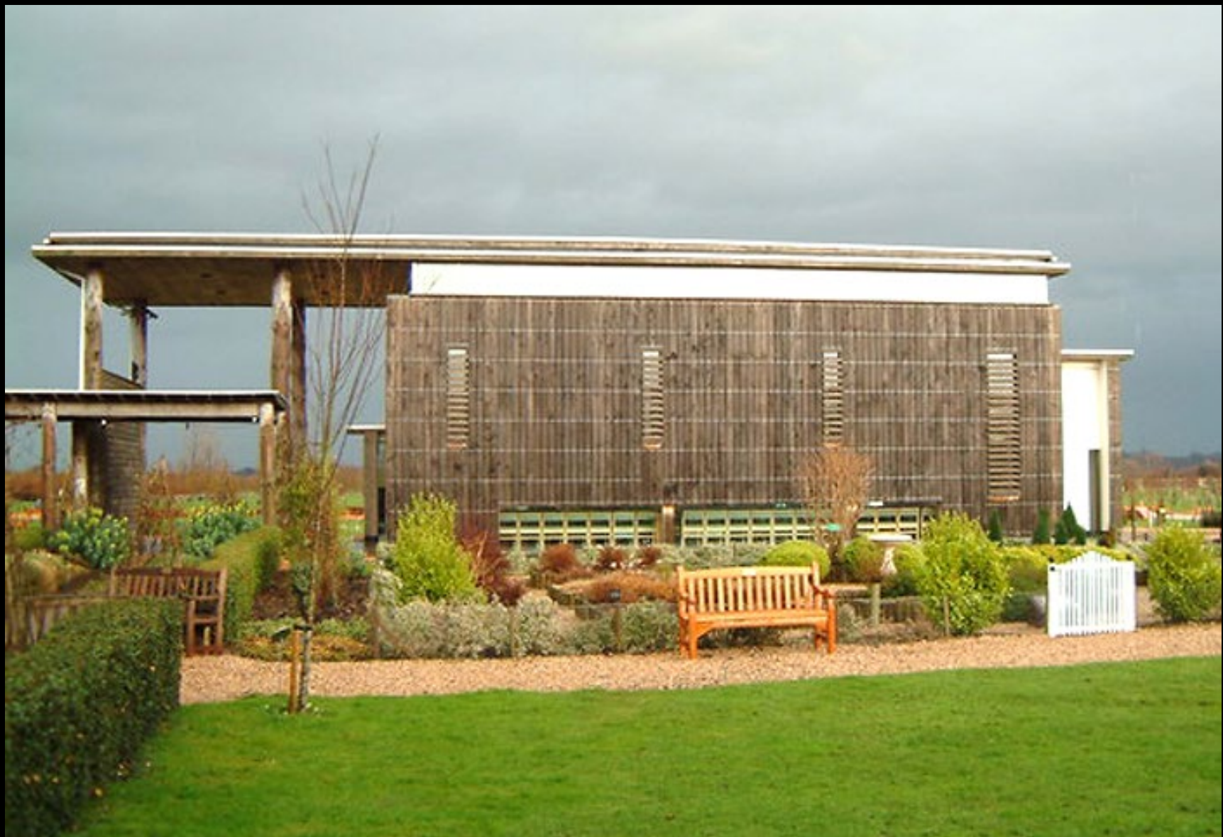
Millennium Chapel of Peace and Forgiveness, Alrewas, England