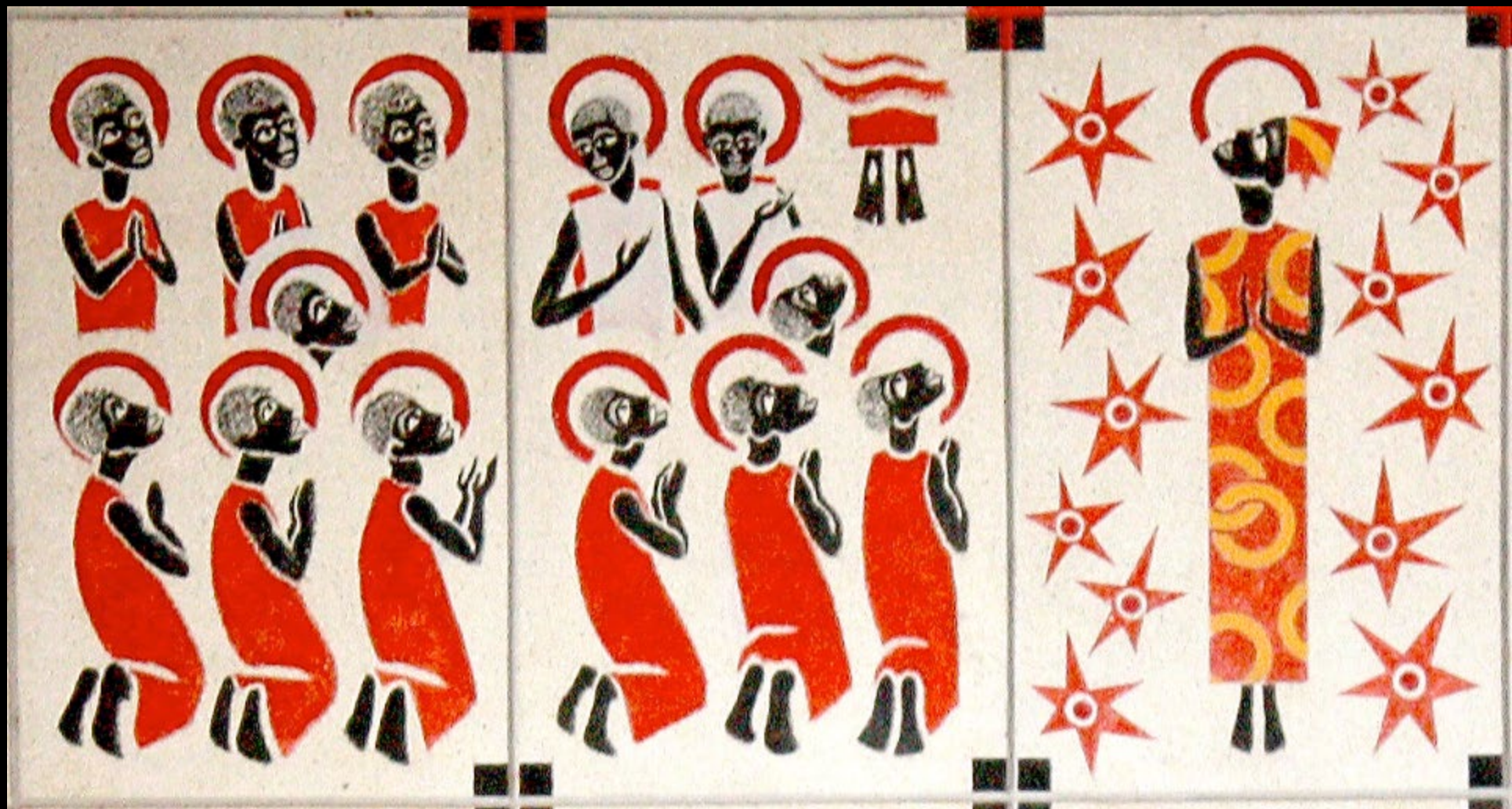
Ascension -- Keur Moussa Abbey, Keur Moussa, Senegal