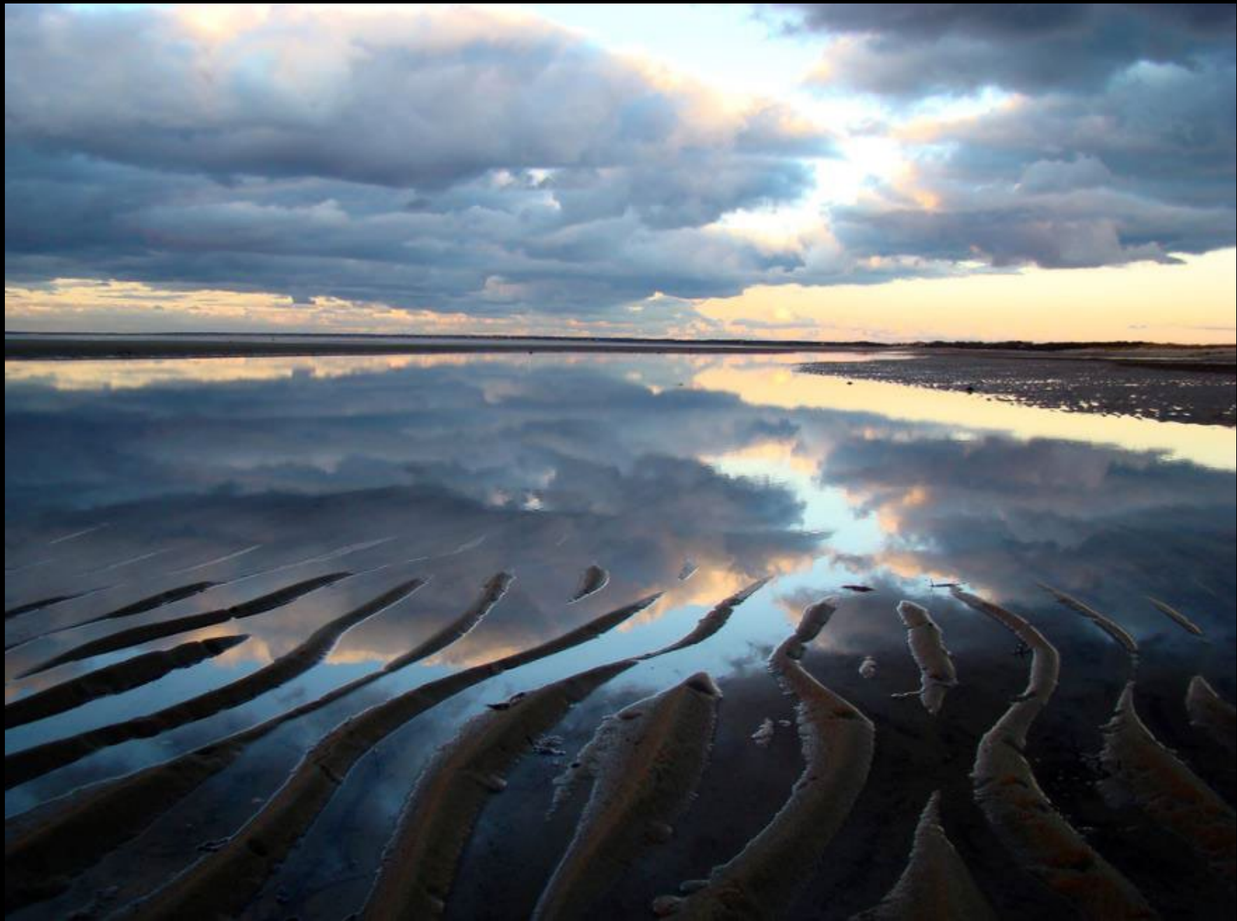
Ascension -- Joanna Vaughn, Cape Cod Bay