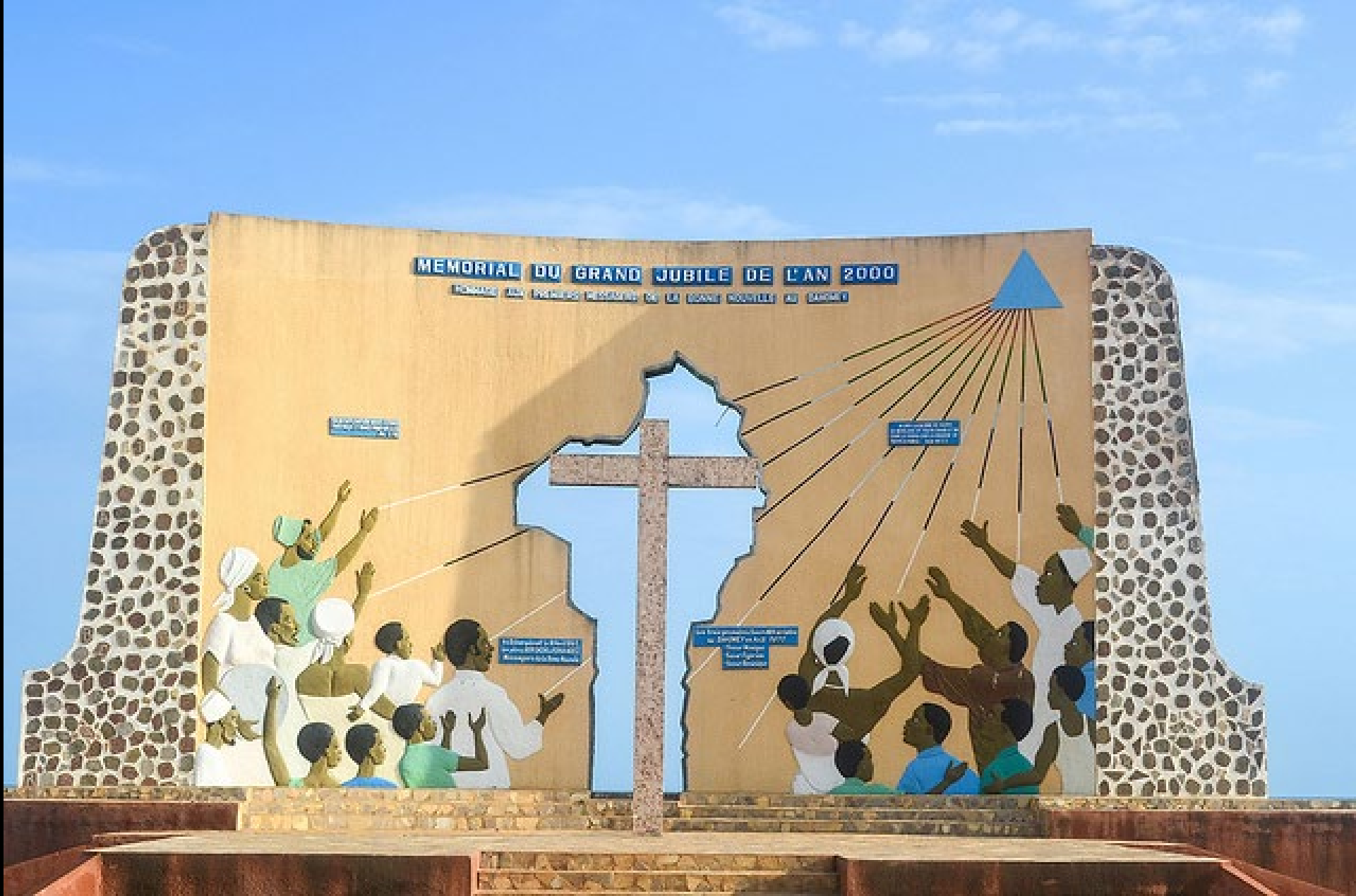
Jubilee Monument -- Ouidah, Benin