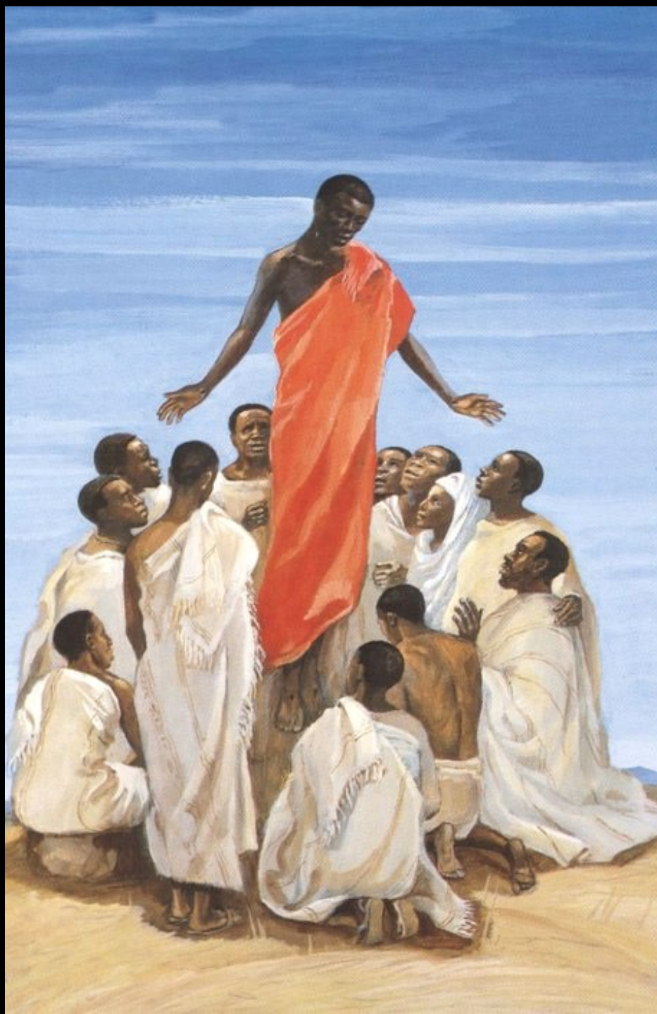
Ascension of Christ