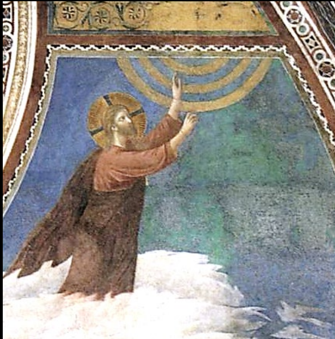
Ascension -- Giotto, Basilica of St. Francis, Assisi, Italy