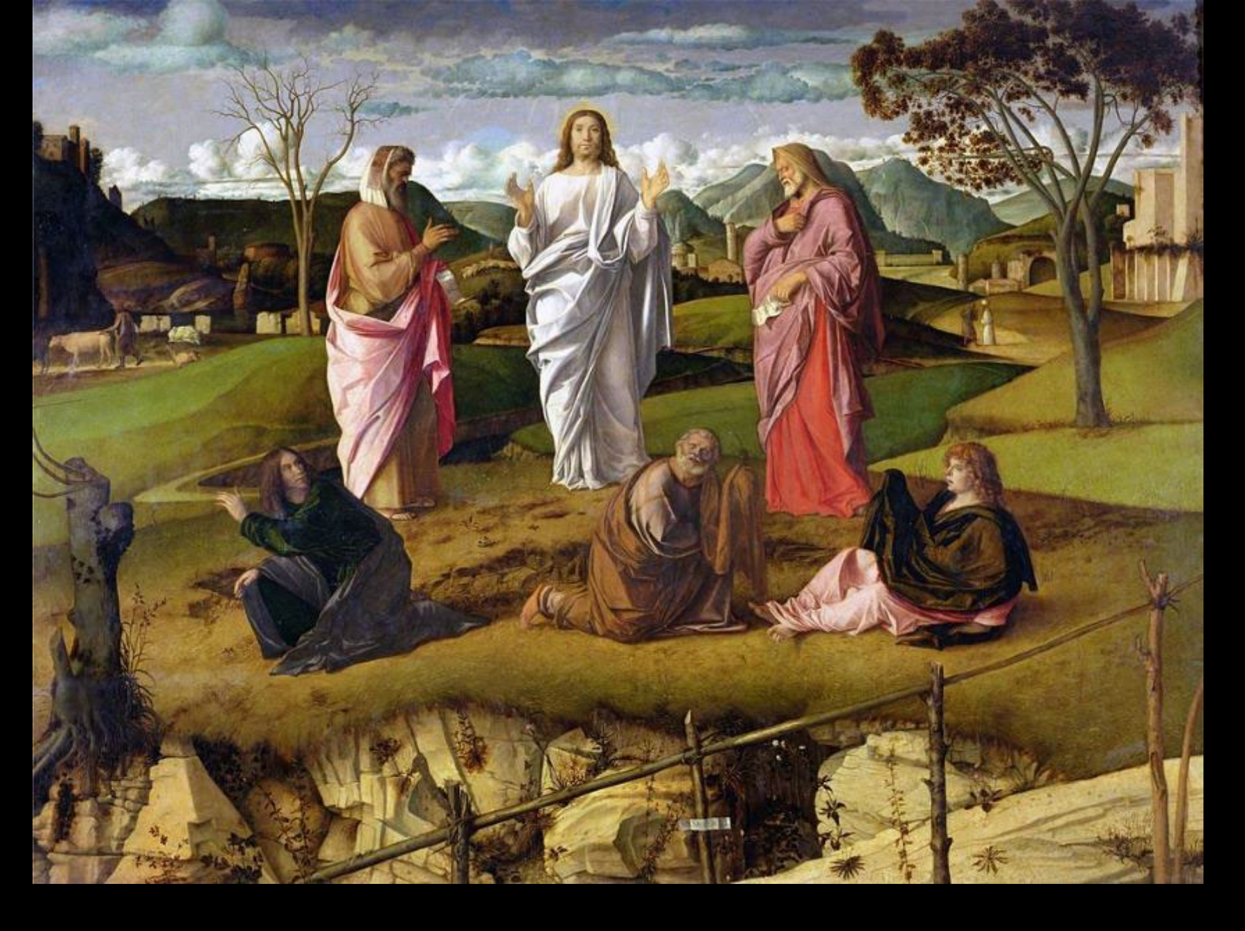
Transfiguration of Christ -- Giovanni Bellini, National Museum of Capiodimonte, Naples, Italy