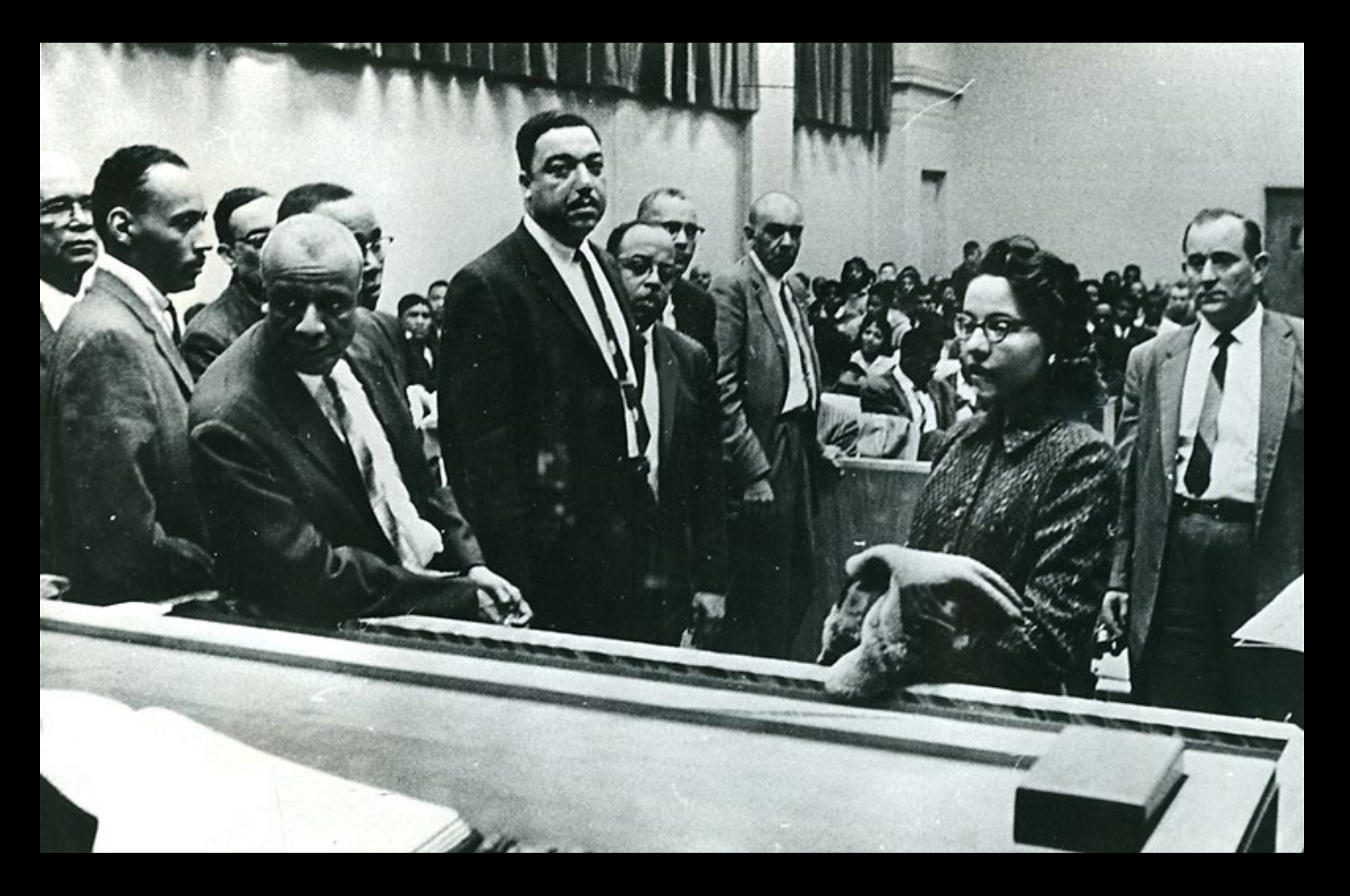
Courtroom Hearing, Civil Rights Protest, Nashville, TN