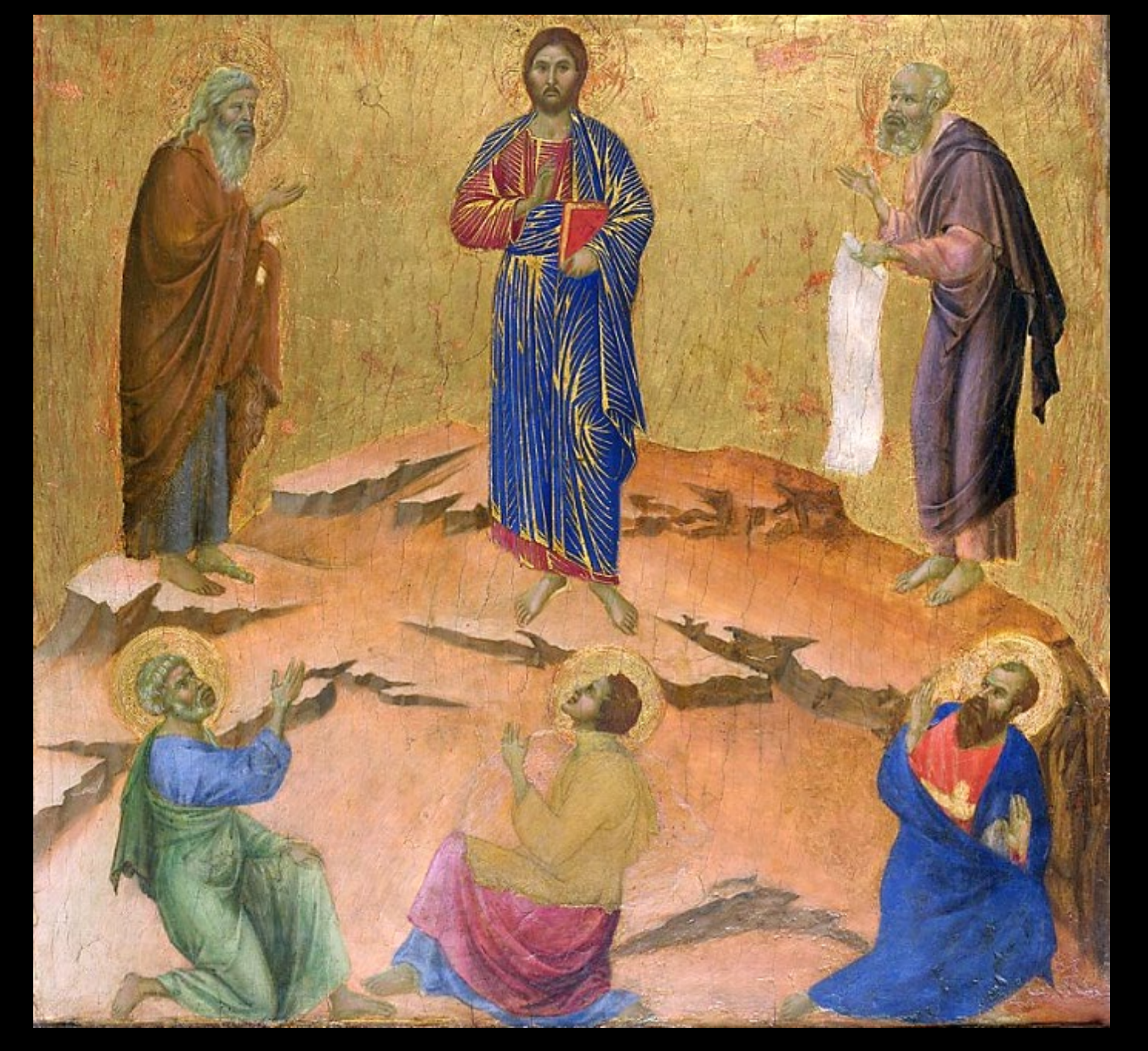
Transfiguration -- Duccio, National Gallery of Art, Washington, DC