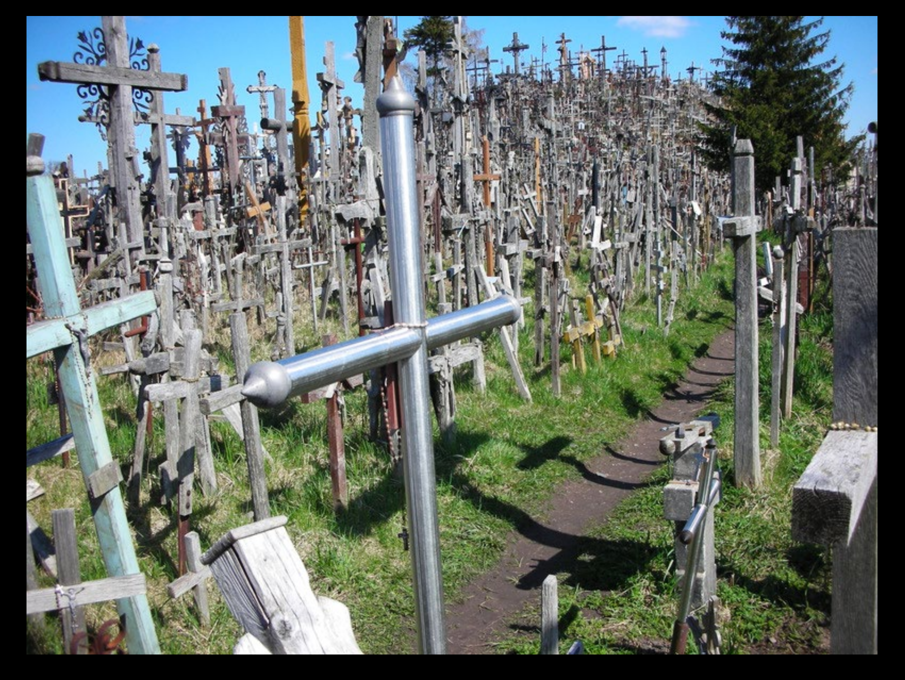
Hill of Crosses -- <u>Saiuilia</u>, Lithuania