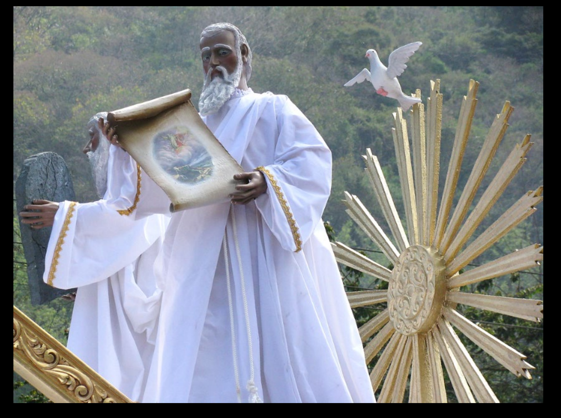
Moses, Procession of the Transfiguration, Mount Tabor, Antigua, Guatemala