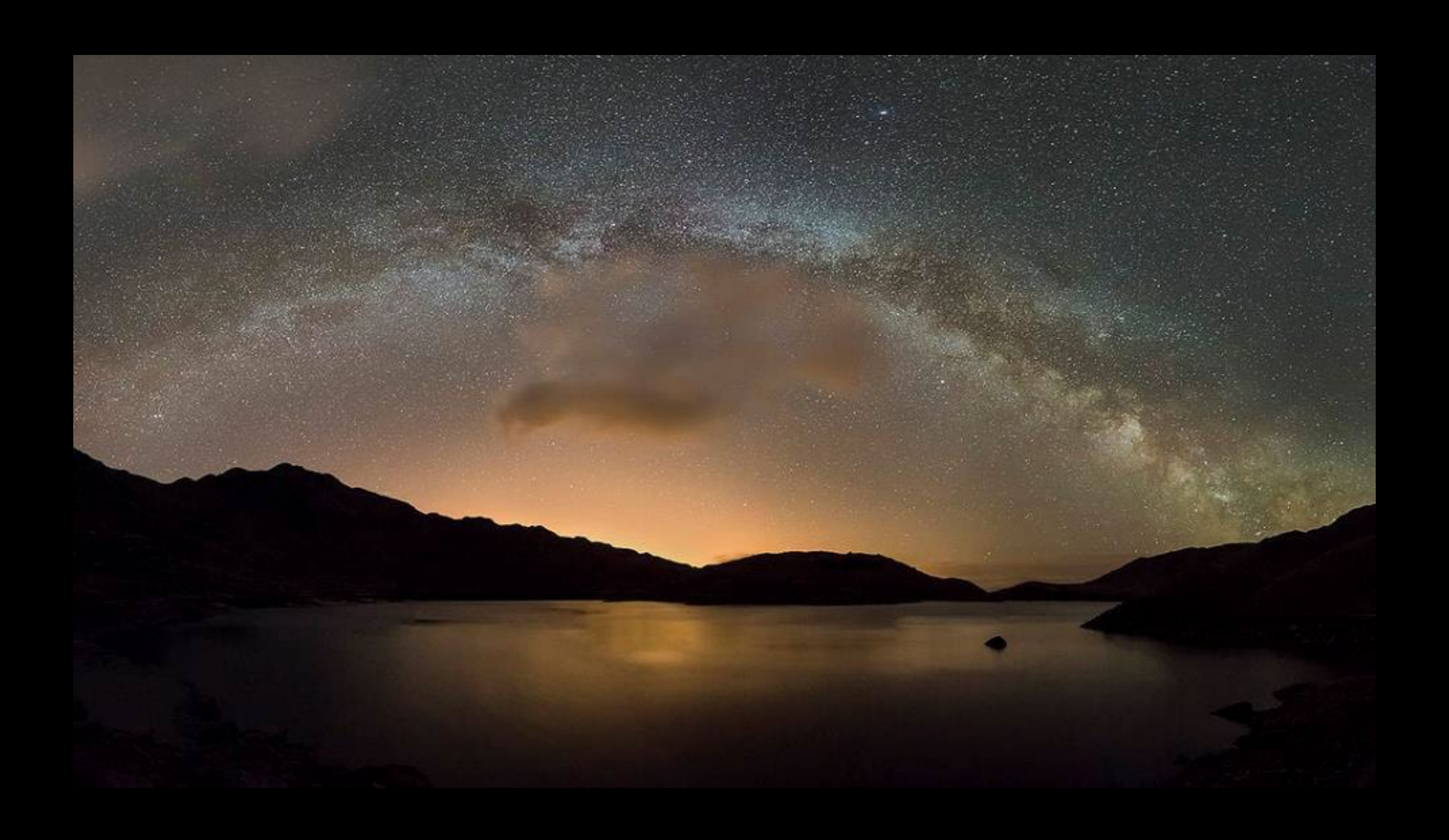
Spirit of the Lake (Milky Way between moon set and sun rise), Llyn Llydaw, Wales