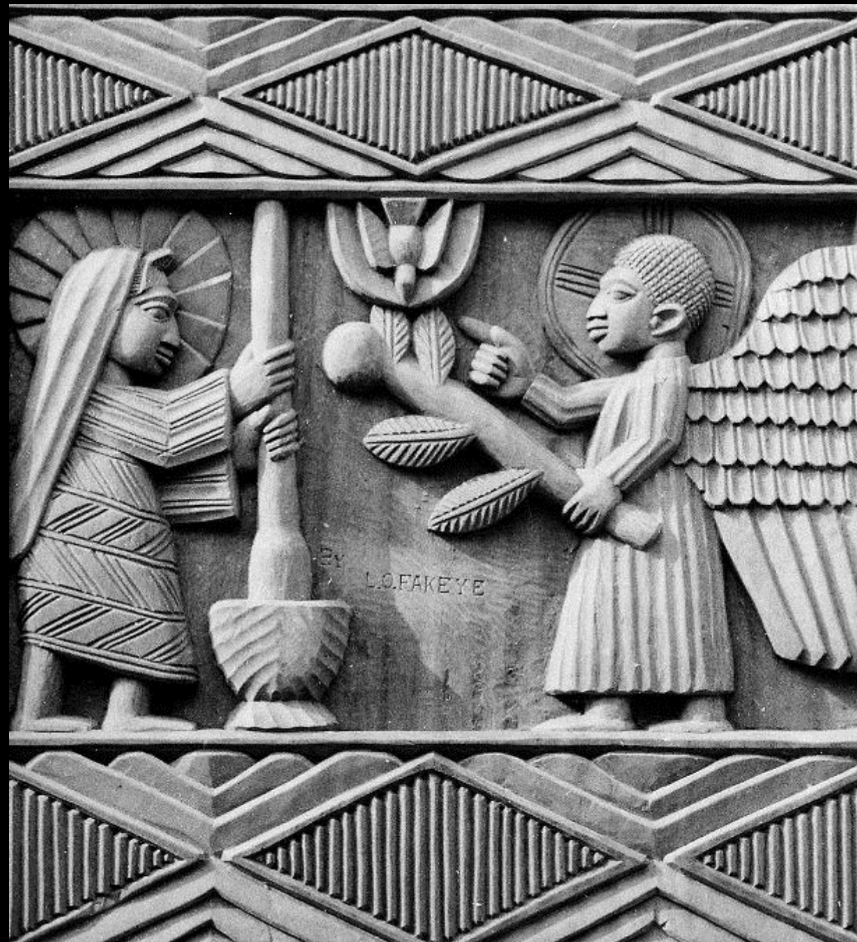
Annunciation to Mary