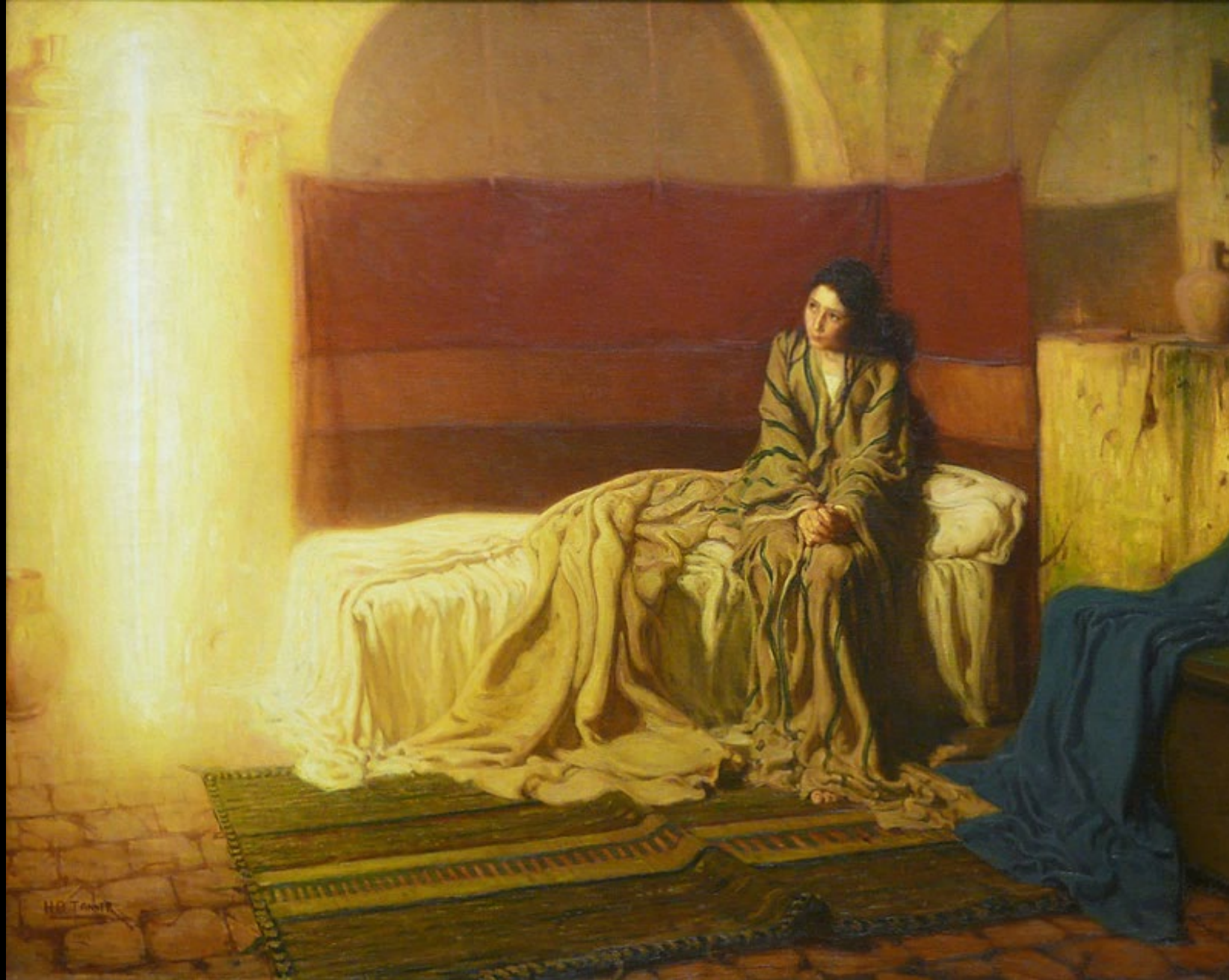
Annunciation -- Henry Ossawa Tanner, Philadelphia Museum of Art