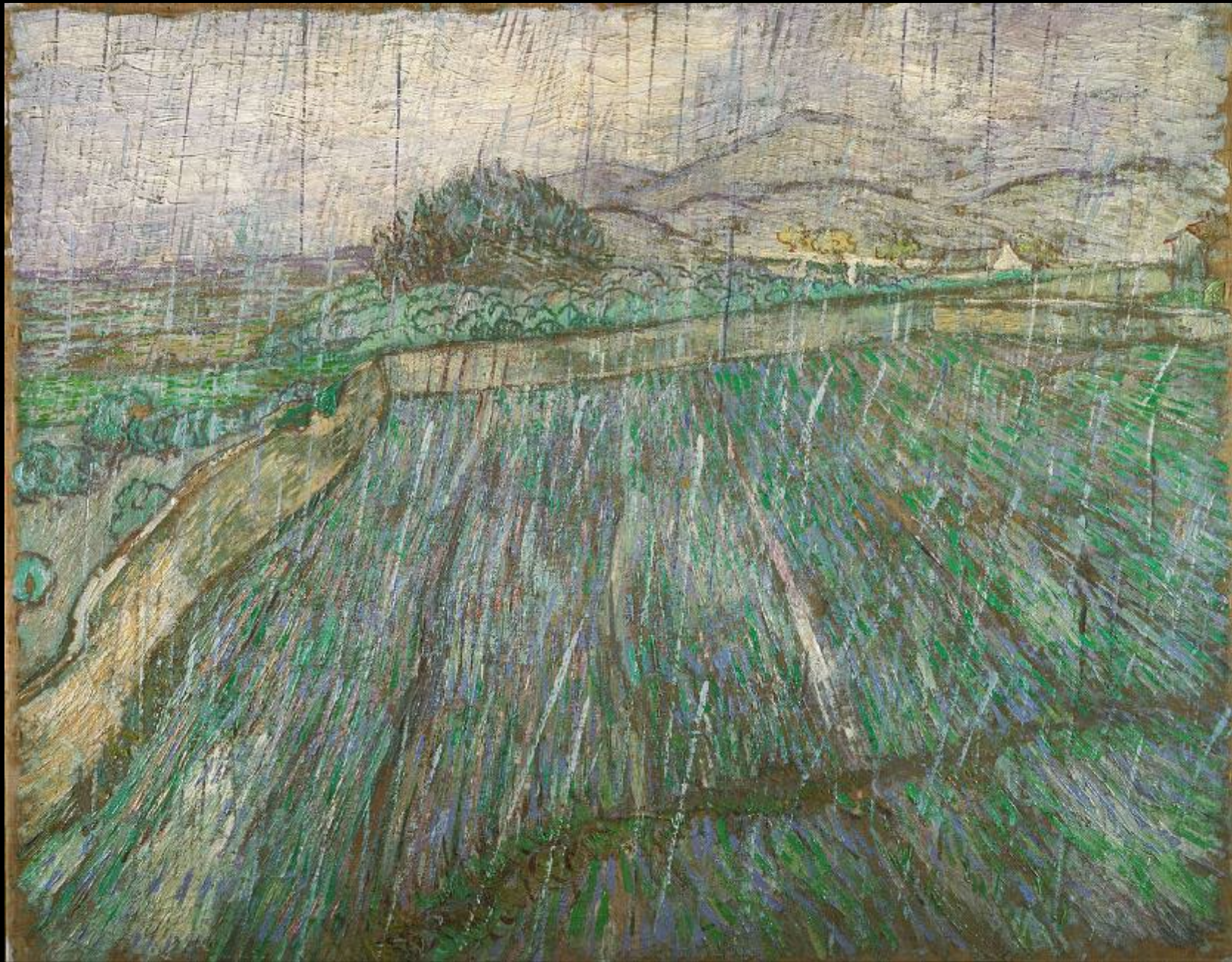
Wheat Field in Rain -- Vincent van Gogh, Philadelphia Museum of Art