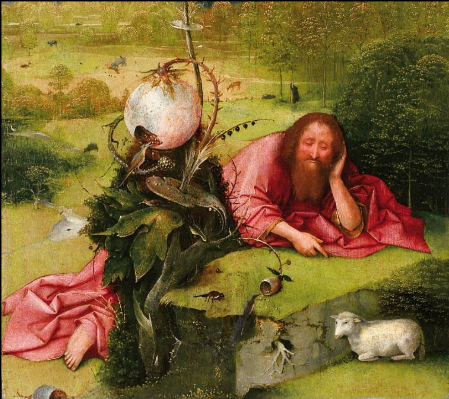
John the Baptist in the Wilderness

Hieronymus Bosch Museum of Lázaro Galdiano Madrid, Spain