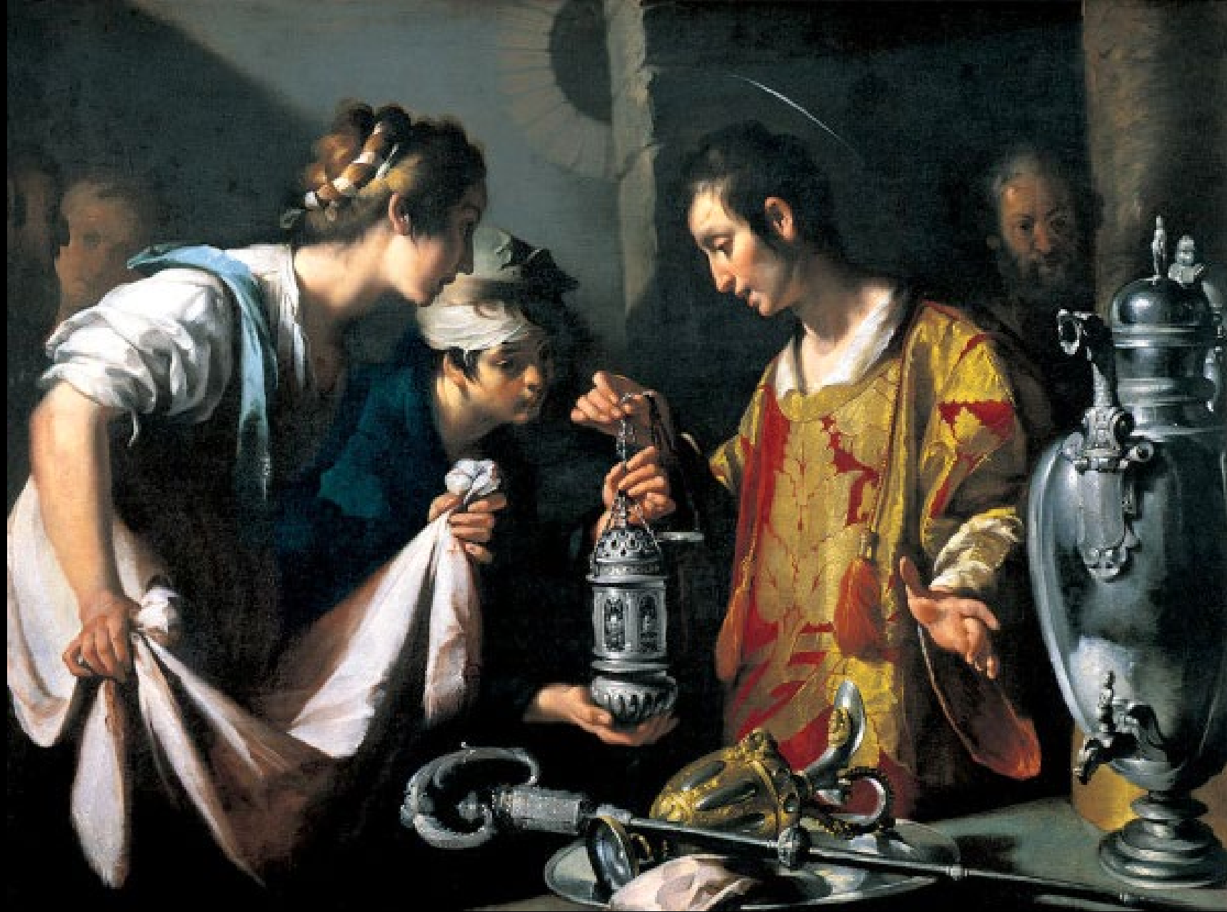
St. Lawrence Distributing the Riches of the Church -- Bernardo Strozzi, St. Louis Art Museum