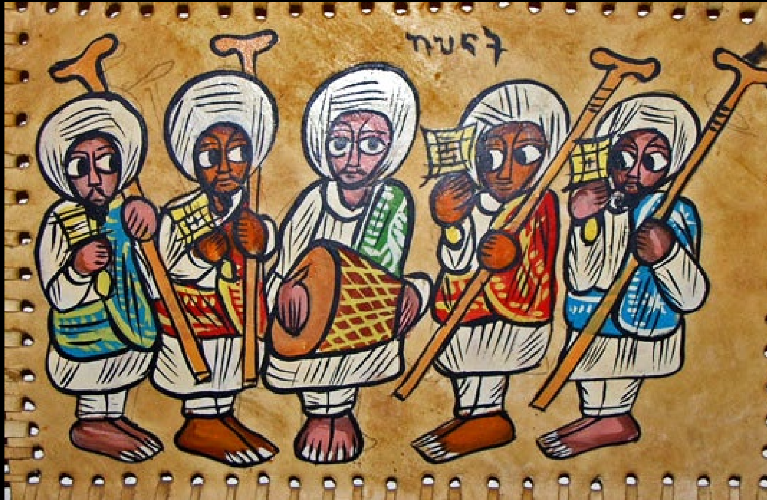
Ethiopian Orthodox Choir -- Paint on stretched leather