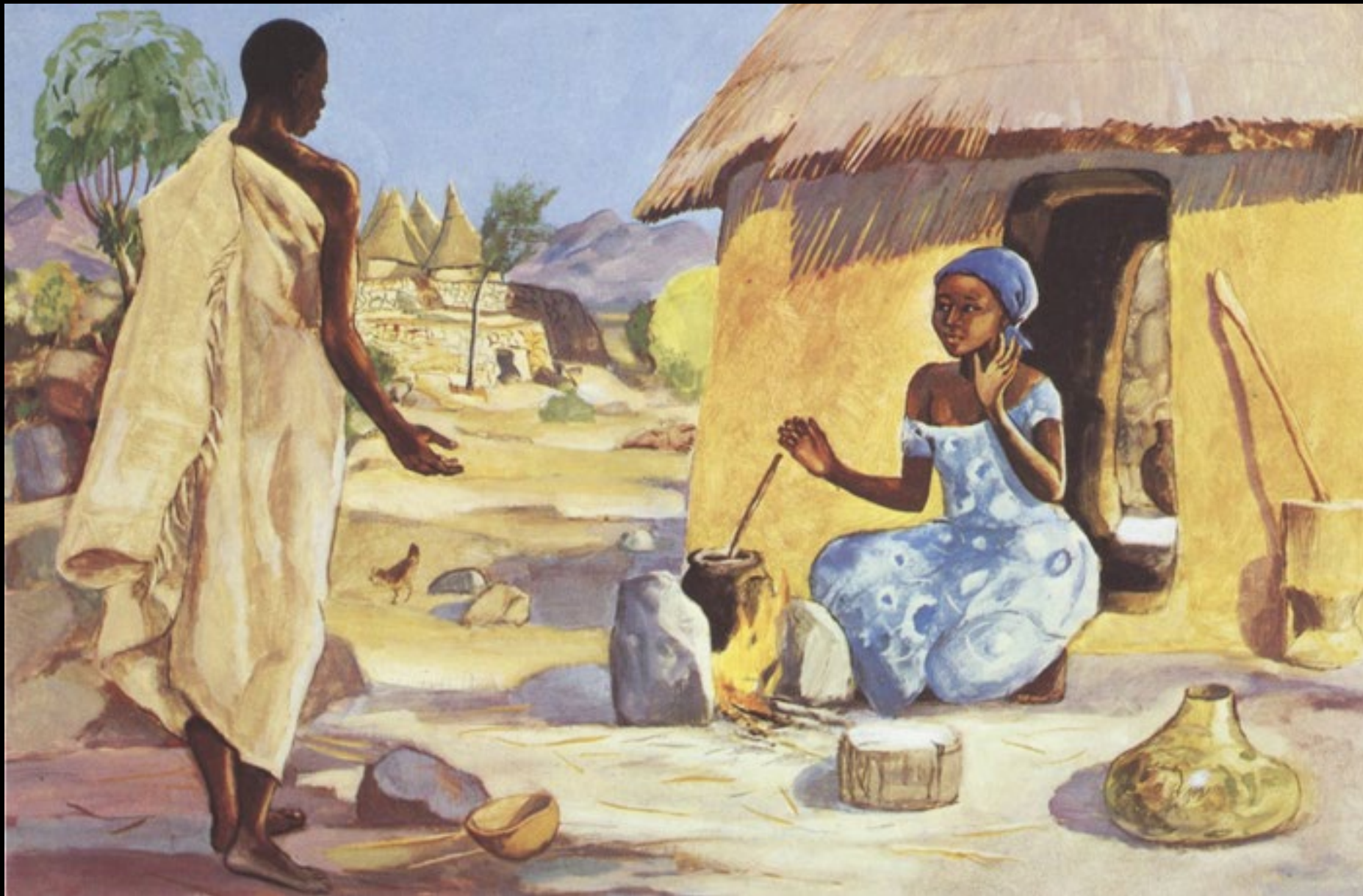
The Annunciation -- JESUS MAFA, Cameroon