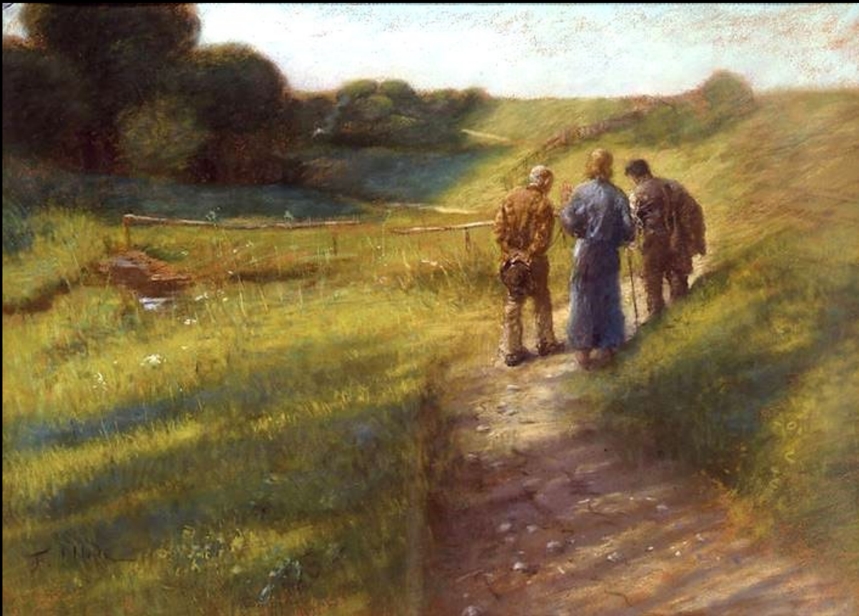
Road to Emmaus -- Fritz von Uhde, New Masters Gallery, Dresden, Germany