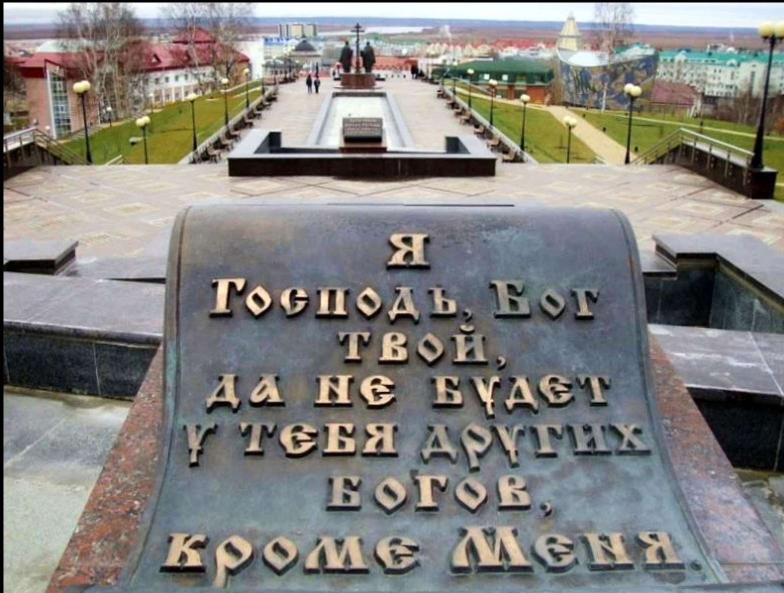
"I am the Lord Your God, You Shall Have No Other Gods Before Me." Khanty-Mansiysk, Russia