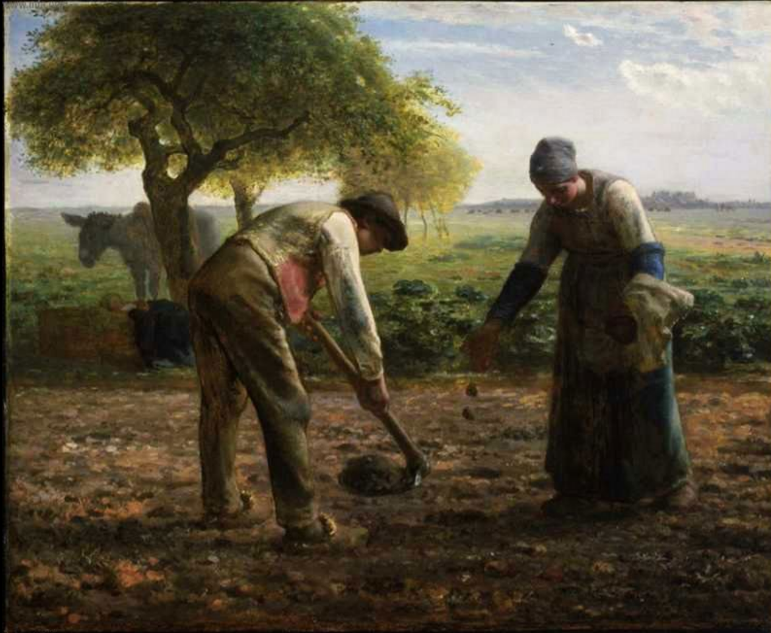
Potato Planters -- Jean Francois Millet, Museum of Fine Arts, Boston