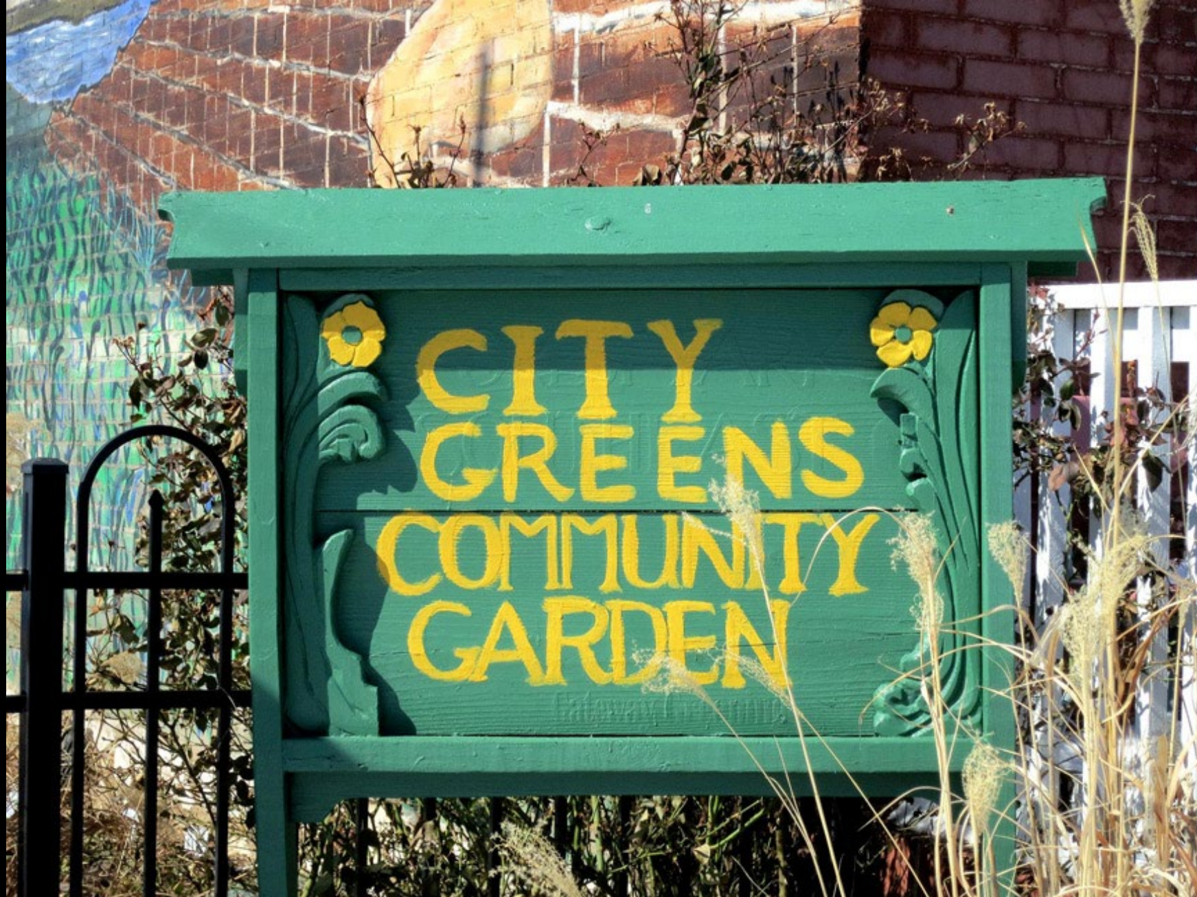
City Greens Community Garden -- City Greens, St. Louis, MO