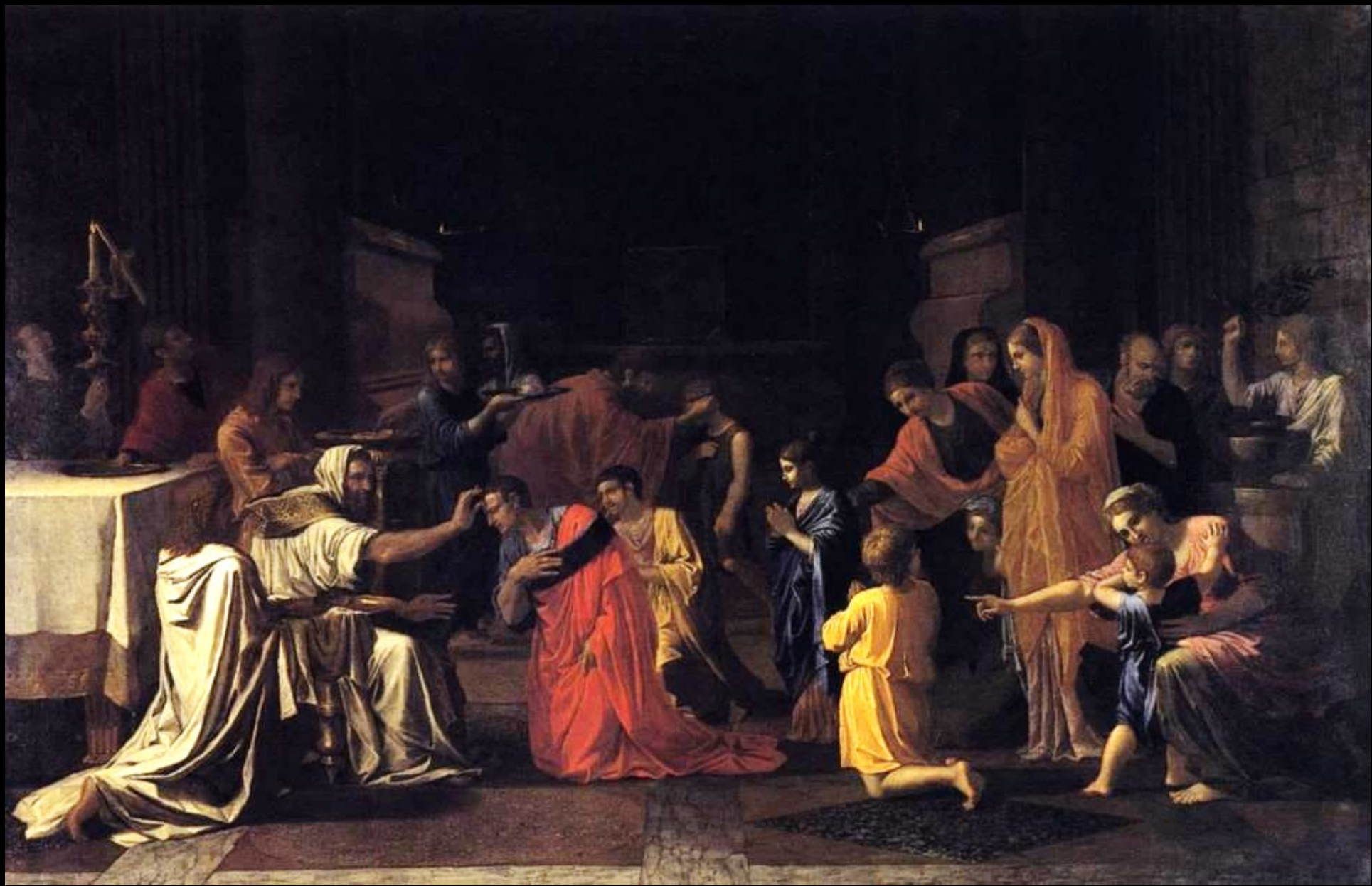
Confirmation -- Nicolas Poussin, Scottish National Gallery, Edinburgh, Scotland