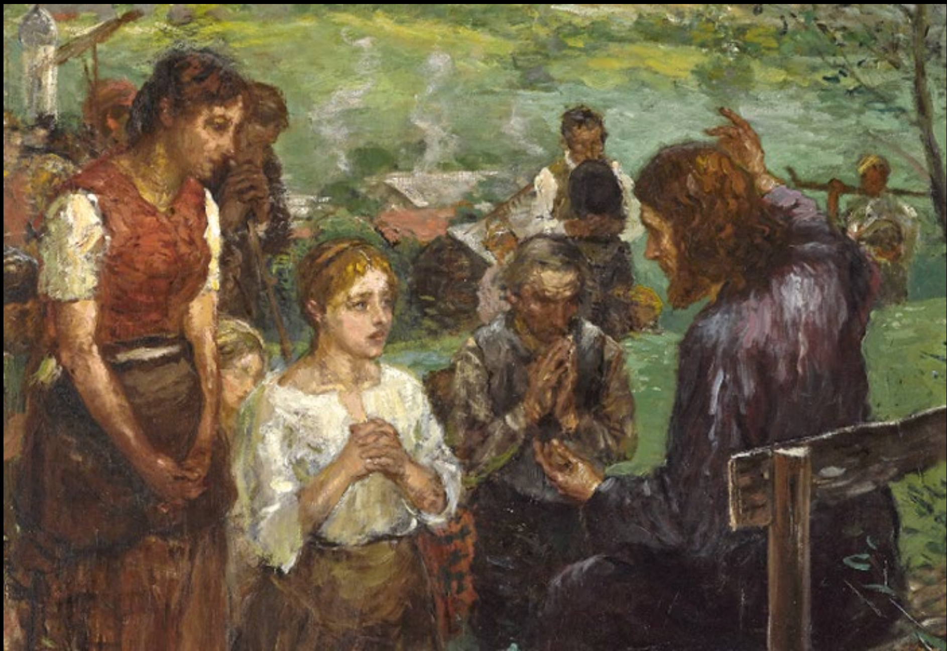
Christ Teaching -- Fritz von Uhde, Museum of Fine Arts, Budapest, Hungary