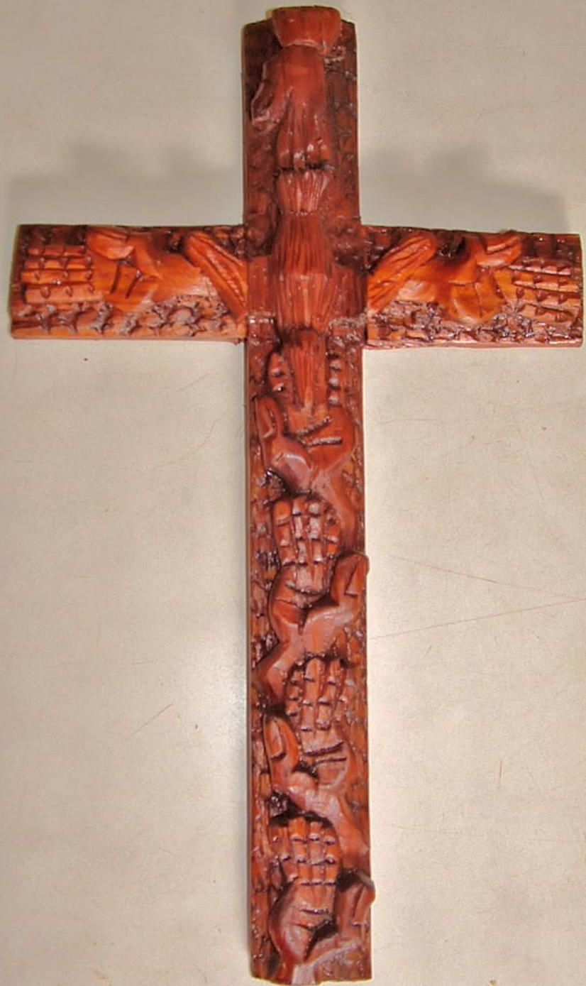
Cross of Hands

Mulungwishi Methodist Church Democratic Republic of Congo