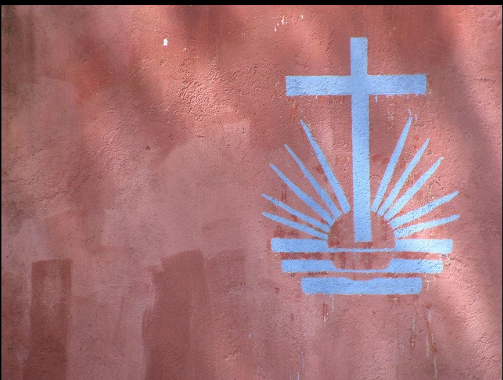
Church Mural, Manchewe, Malawi