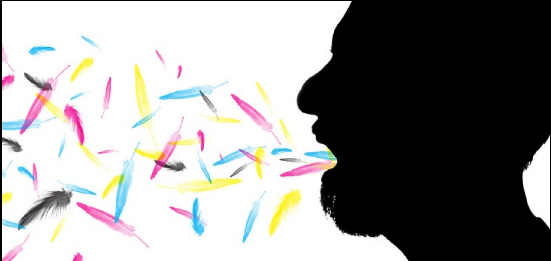
Guarding Words and Actions