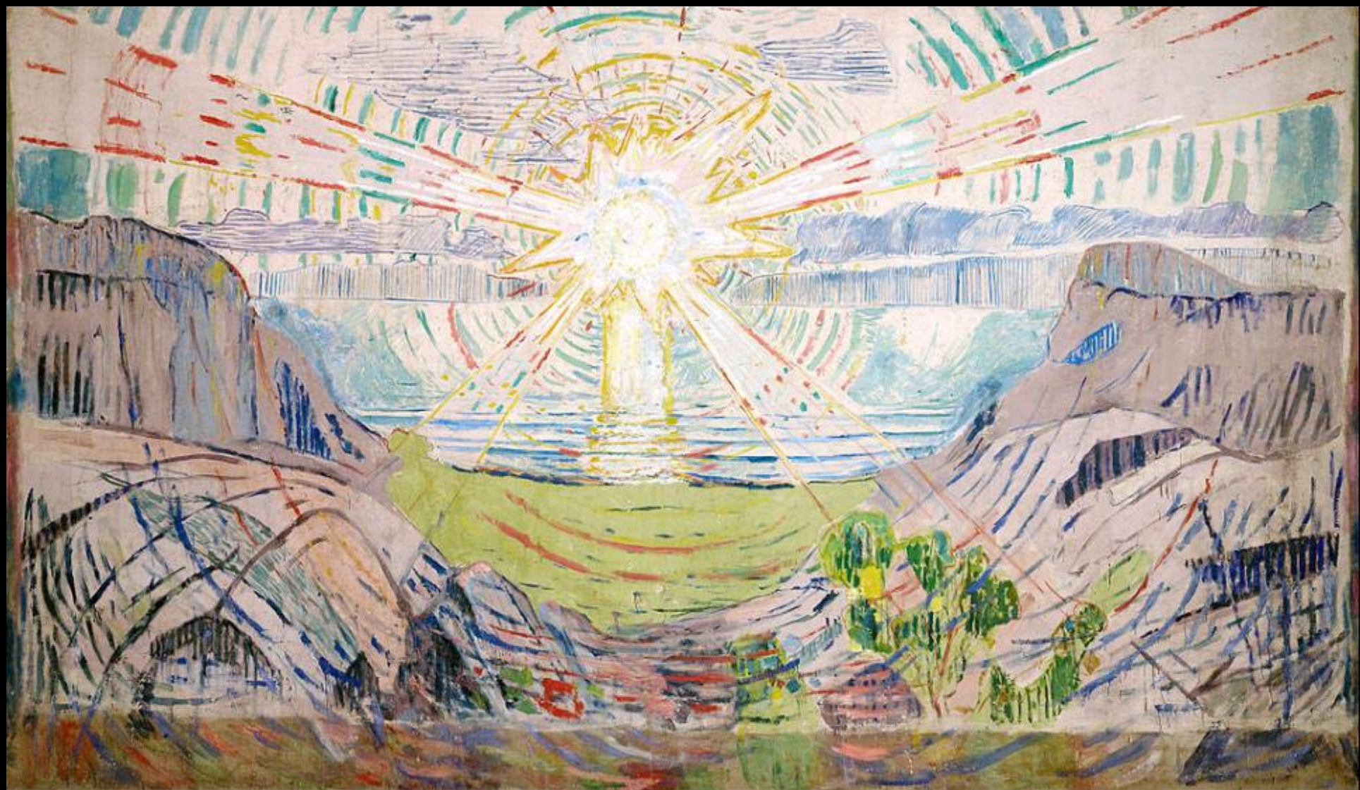
The Sun -- Edvard Munch, Munch Museum, Oslo, Norway