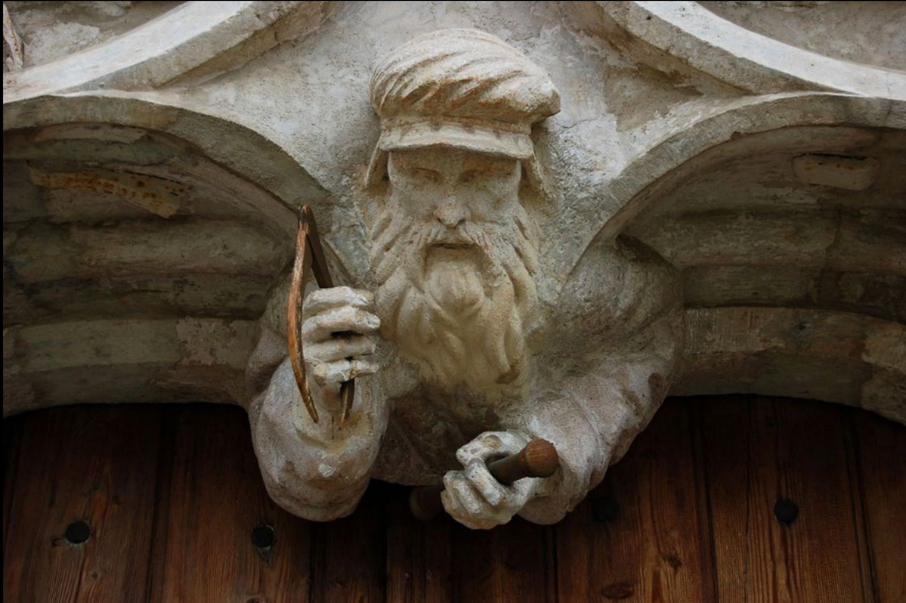
Master Builder -- Church of St. Peter, Aflenz Kurort, Austria