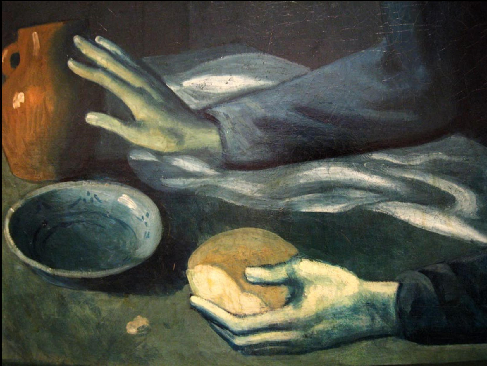
The Blind Man's Meal -- Pablo Picasso, Metropolitan Museum of Art, New York