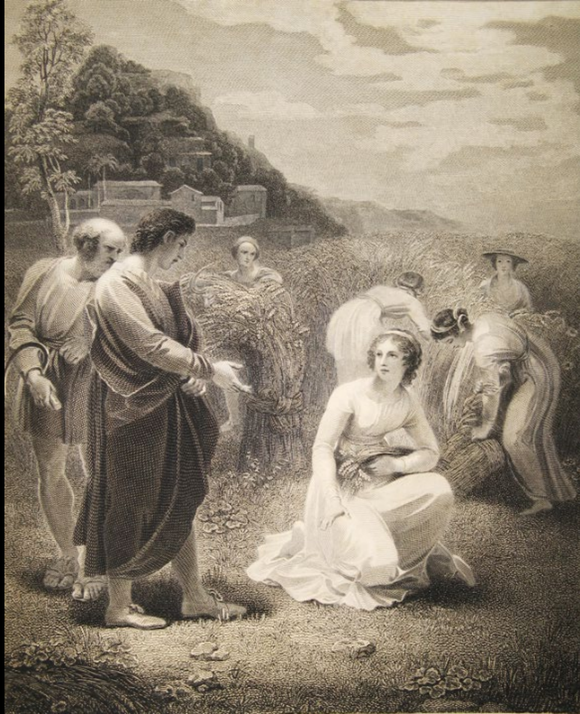
Ruth Gleaning in Boaz' Fields

Thomas Stothard, Macklin Bible Heard Library, Nashville, TN