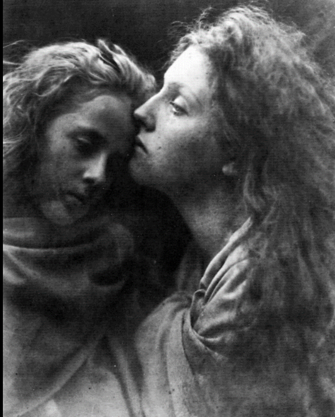
Kiss of Peace

Julia Margaret Cameron Royal Photographic Society Bath, UK