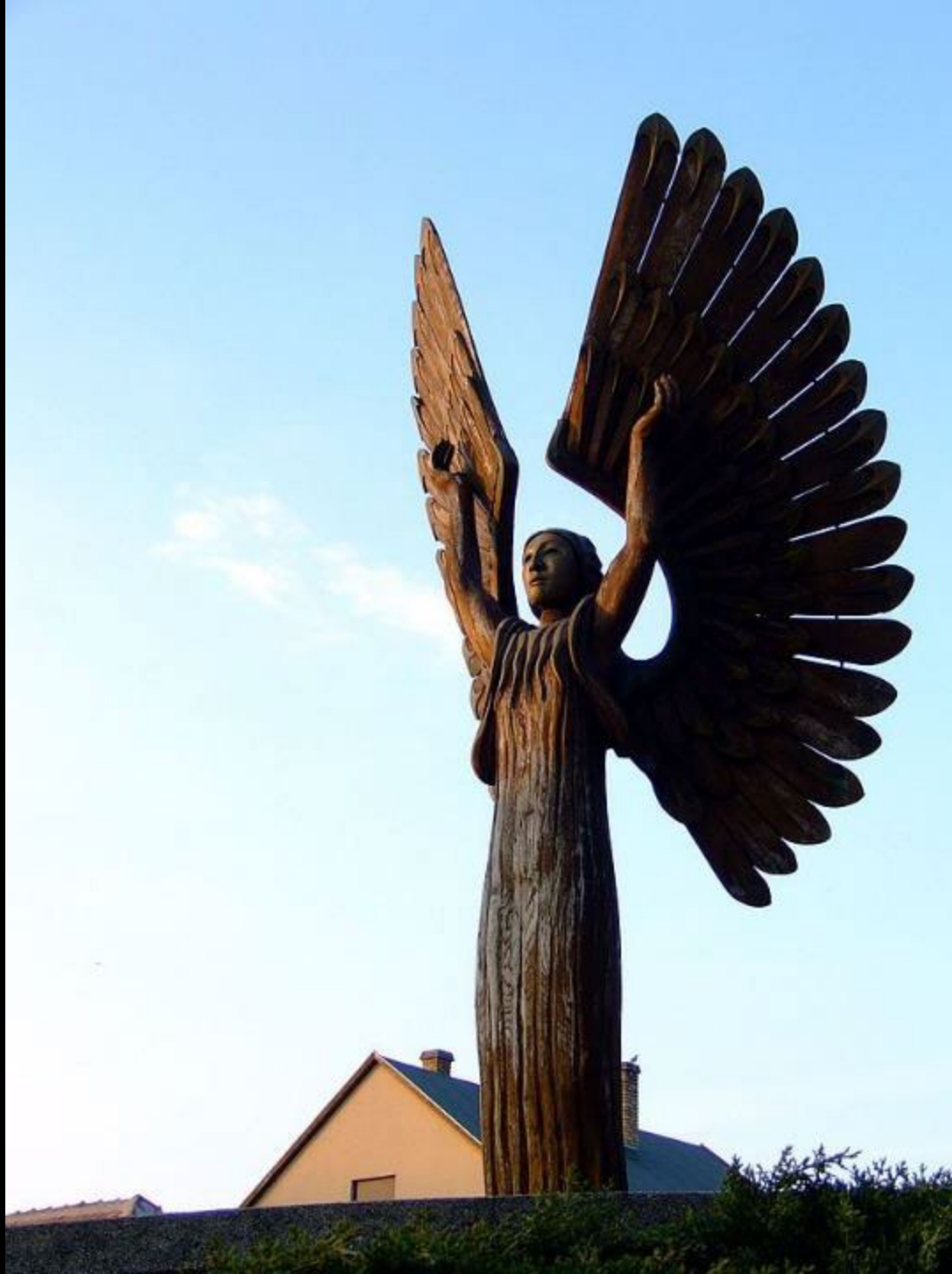
Holy Spirit Laszlo Peterfy Church of the Holy Spirit Paks, Hungary