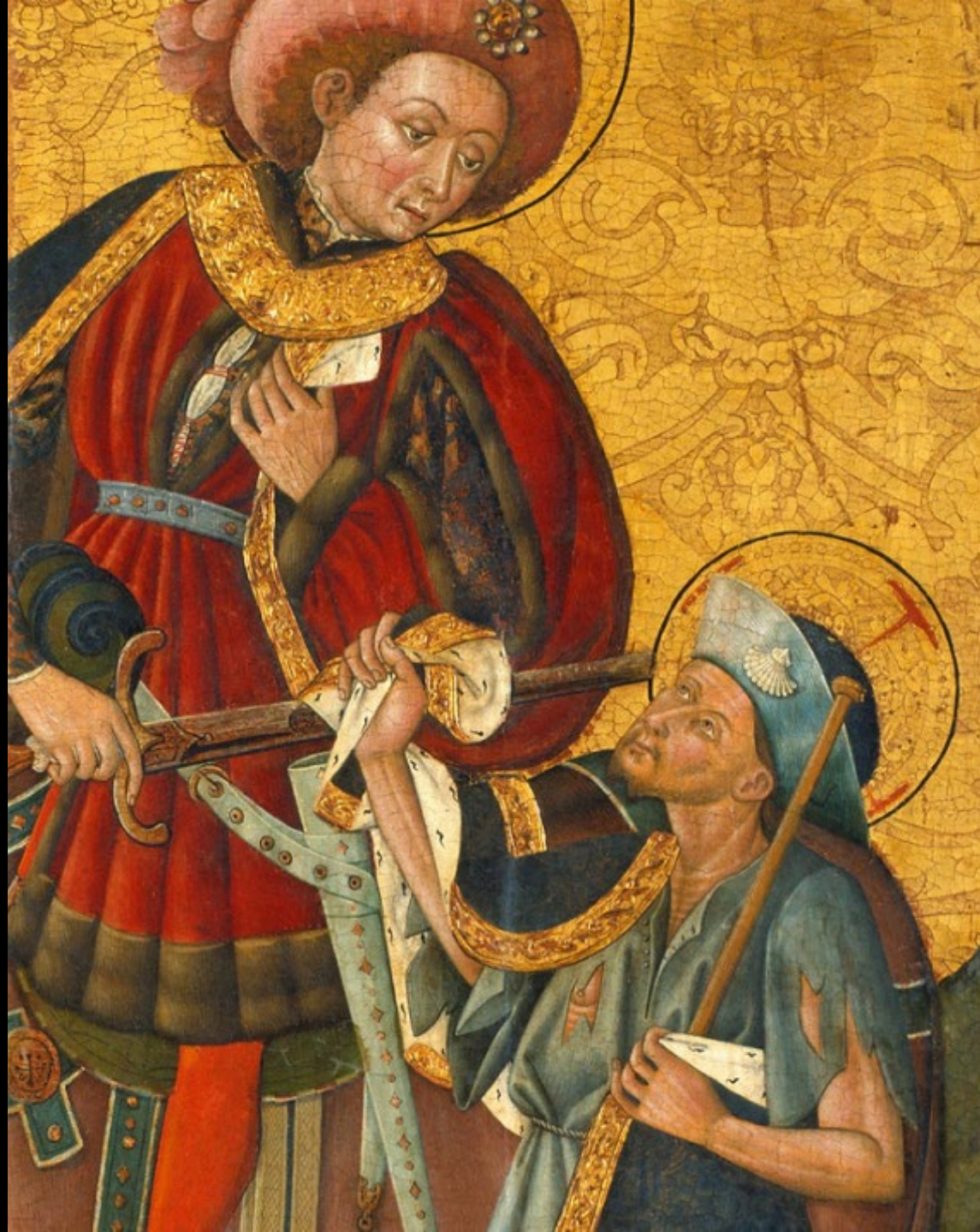
St. Martin Giving his Cloak to a Beggar

Blasco de Granen Museu Nacional d'Art de Catalunya Barcelona, Spain