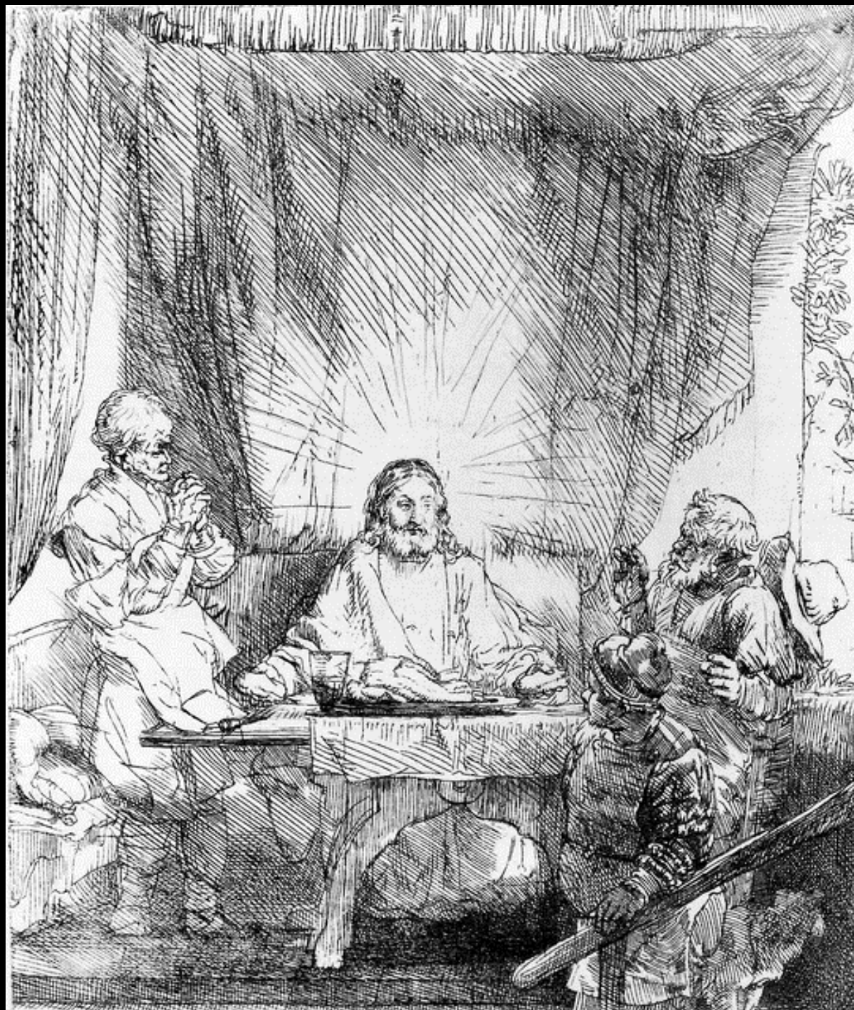
Supper at Emmaus