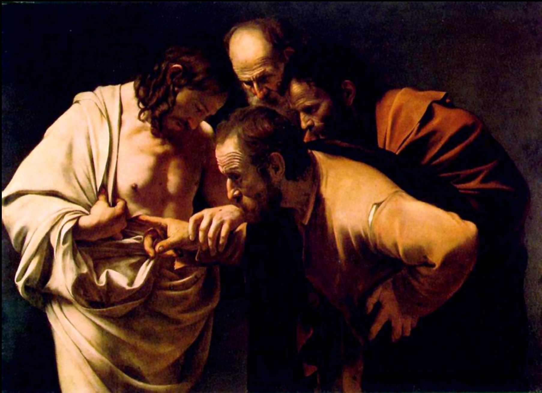
The Incredulity of Thomas -- Caravaggio, Sanssouci, Potsdam, Germany