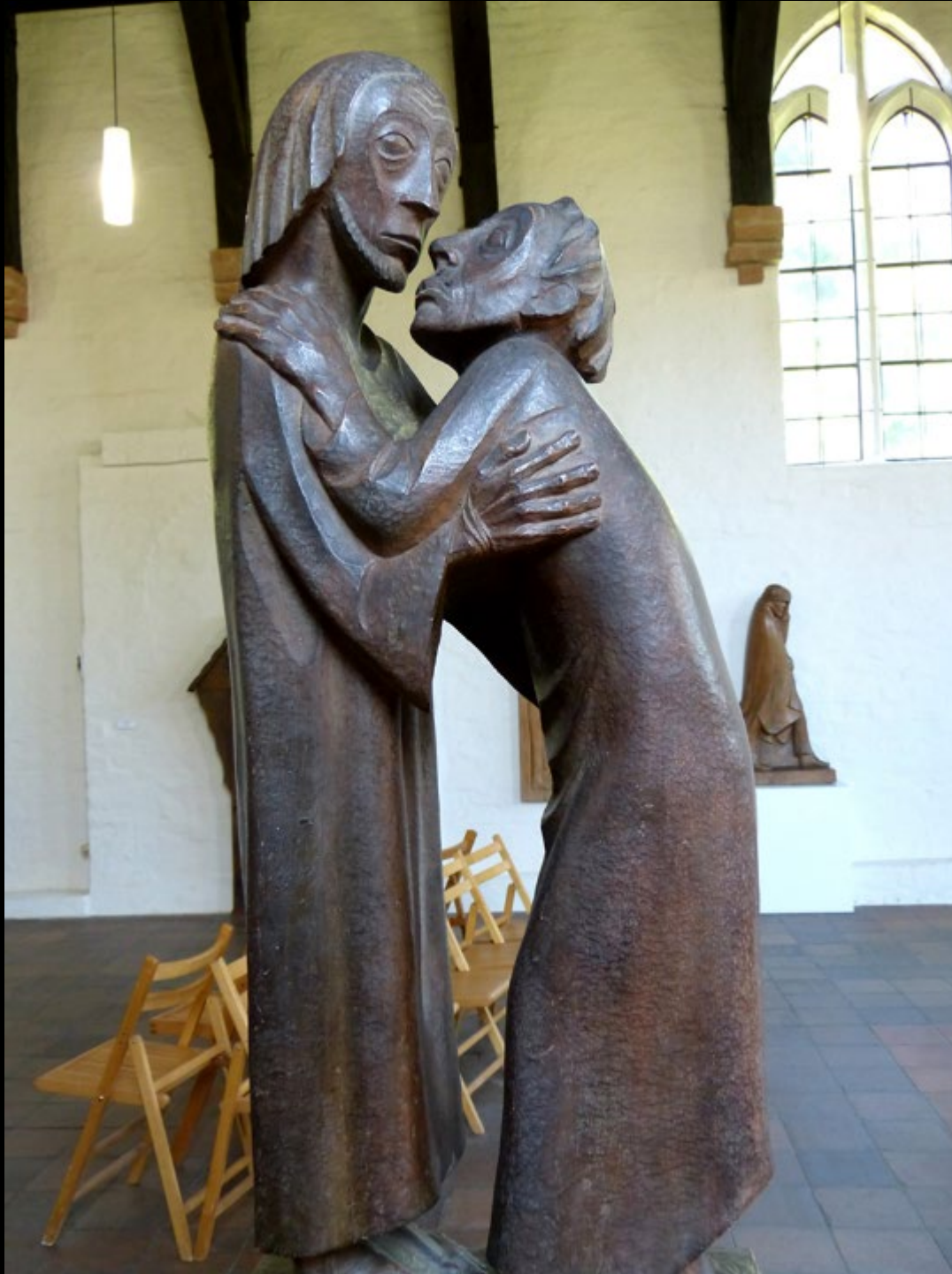
Reunion Ernst Barlach St. Gertrude's Chapel Gustrow, Germany