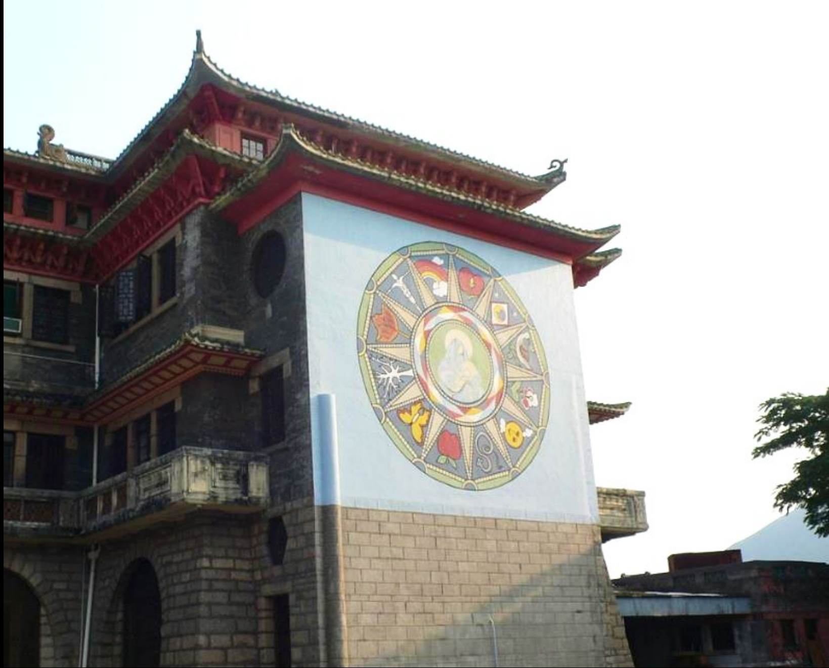
Holy Spirit Seminary -- Hong Kong, China