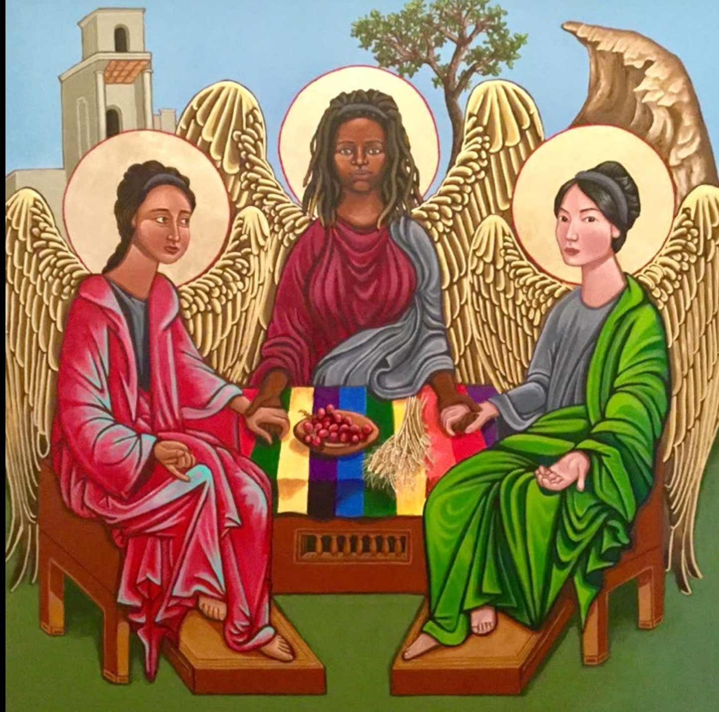
Holy Trinity (Eastern Orthodox)