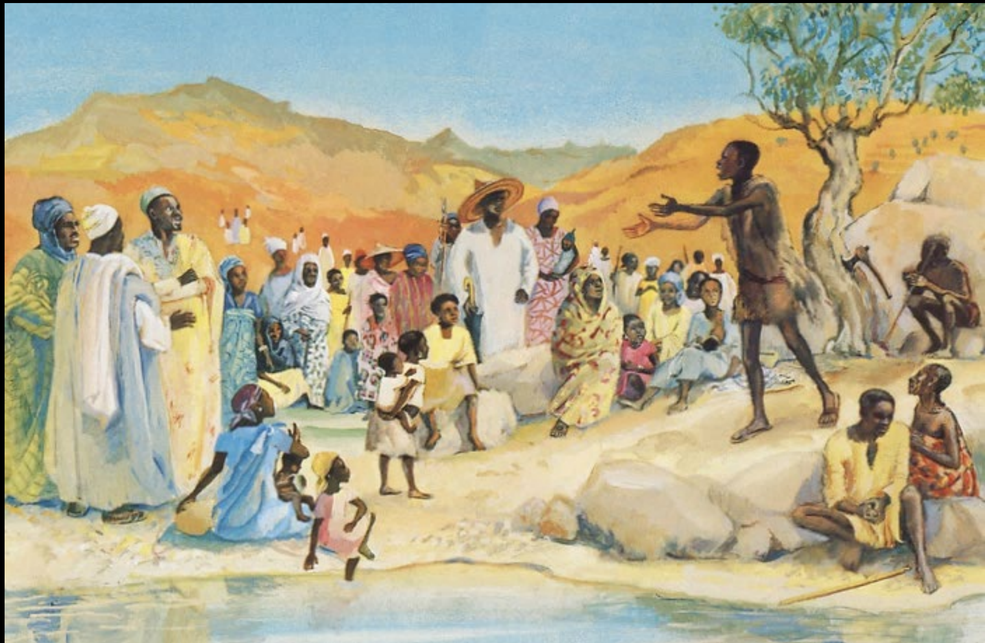
John the Baptist Preaching in the Desert – JESUS MAFA, Cameroon