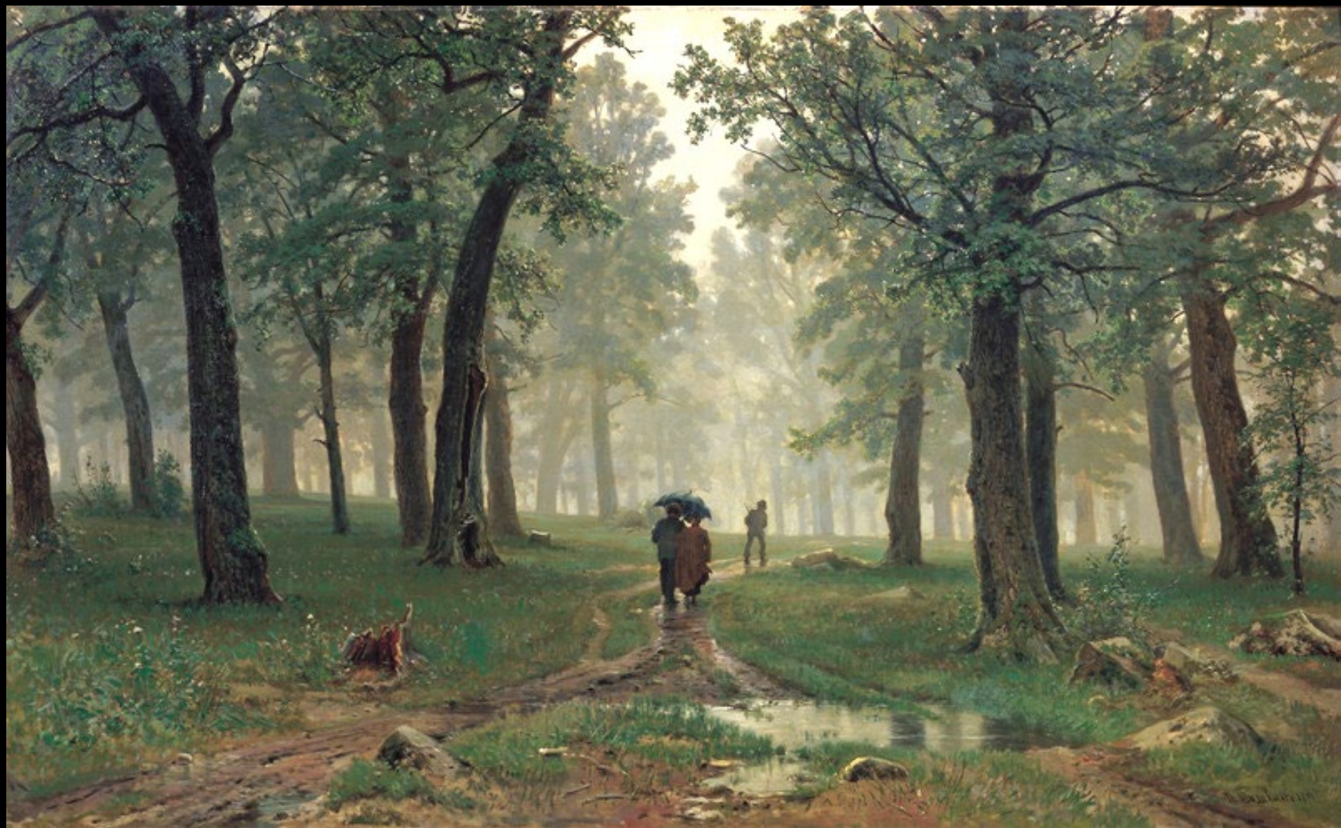
Rain in an Oak Forest -- Ivan Shishkin , Tretyakov Gallery, Moscow, Russia