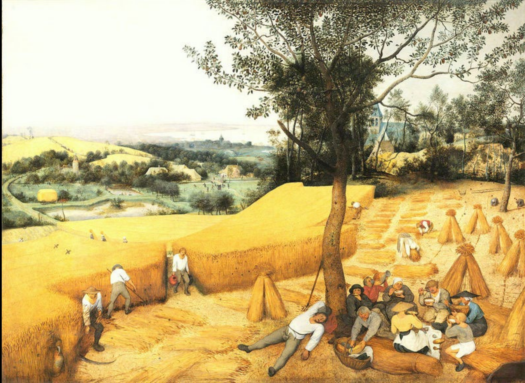
Harvesters -- Pieter Bruegel -- Metropolitan Museum of Art