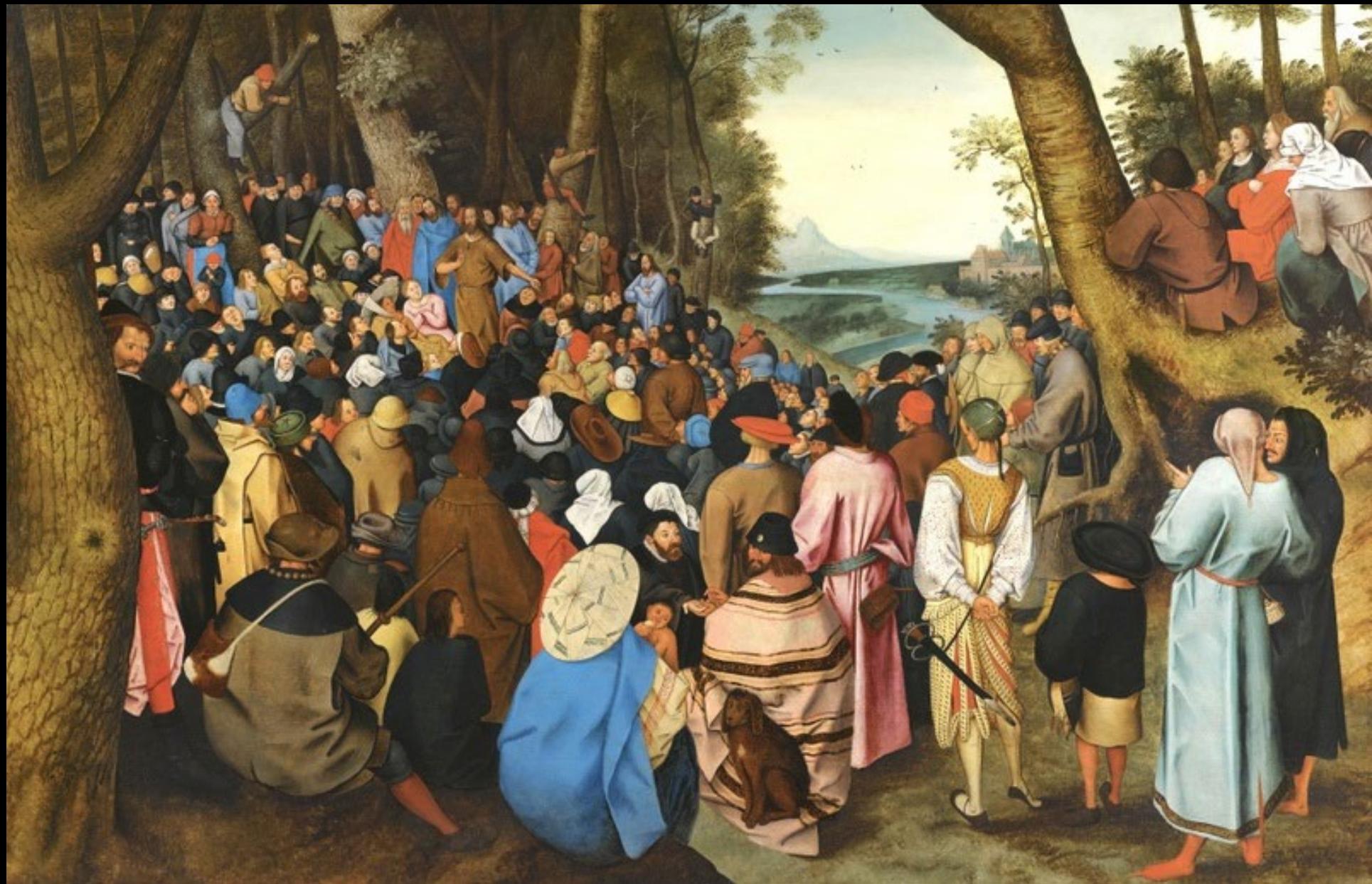
John the Baptist Preaching to the Masses – Pieter Bruegel the Younger