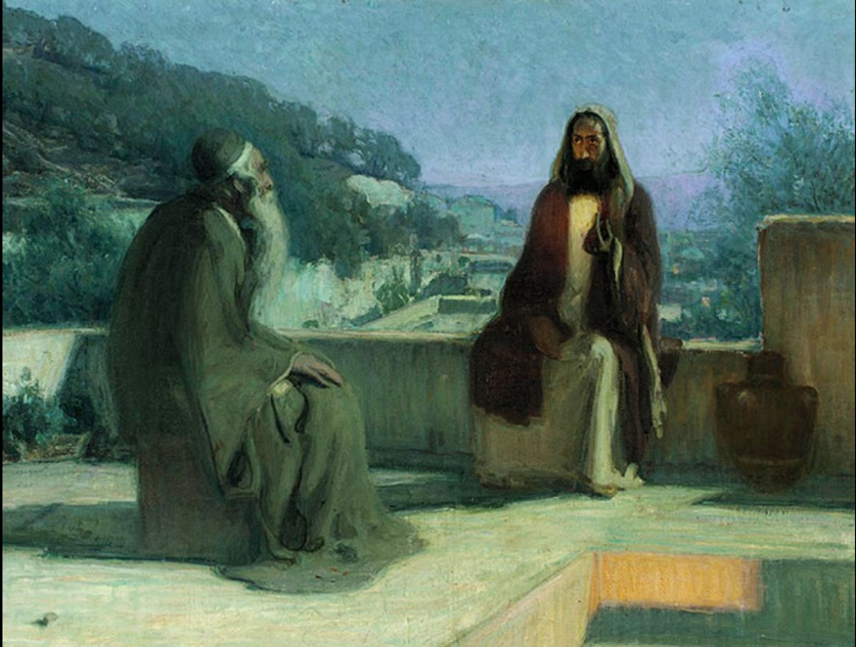
Nicodemus and Jesus on a Rooftop -- Henry Ossawa Tanner, Philadelphia Museum of Art