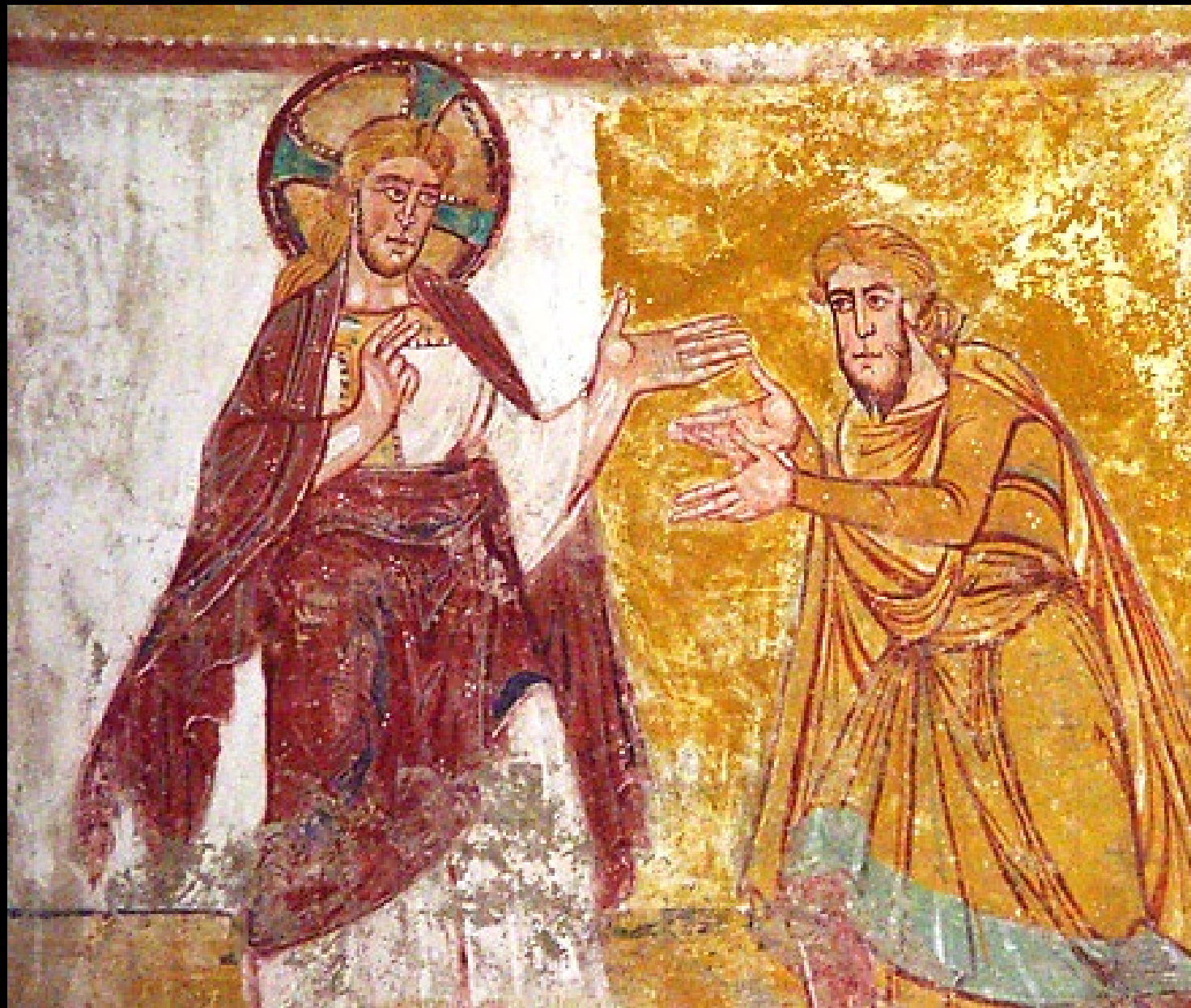
The Calling of Abraham -- Abbey of Saint-Savin, Vienne, France