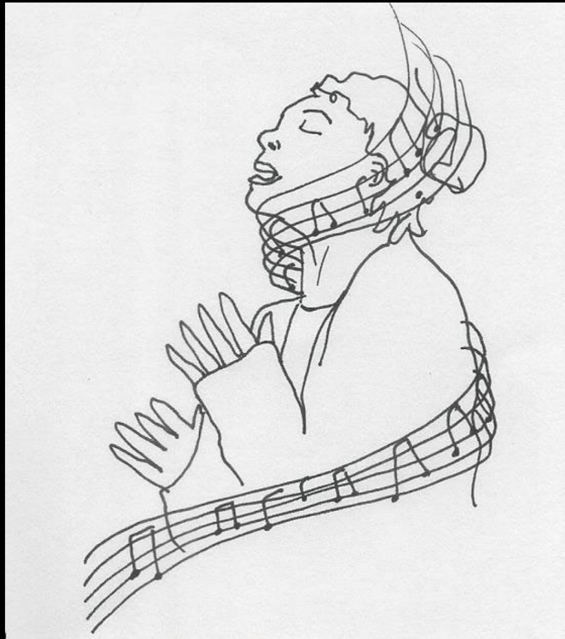
Praise -- Liz Valente