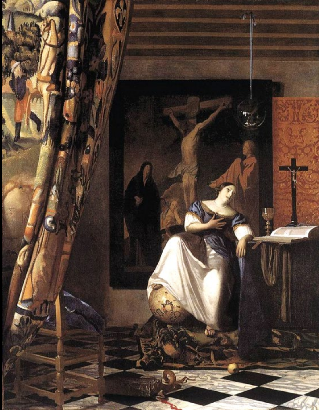
Allegory of Faith

Johannes Vermeer Metropolitan Museum of Art New York City