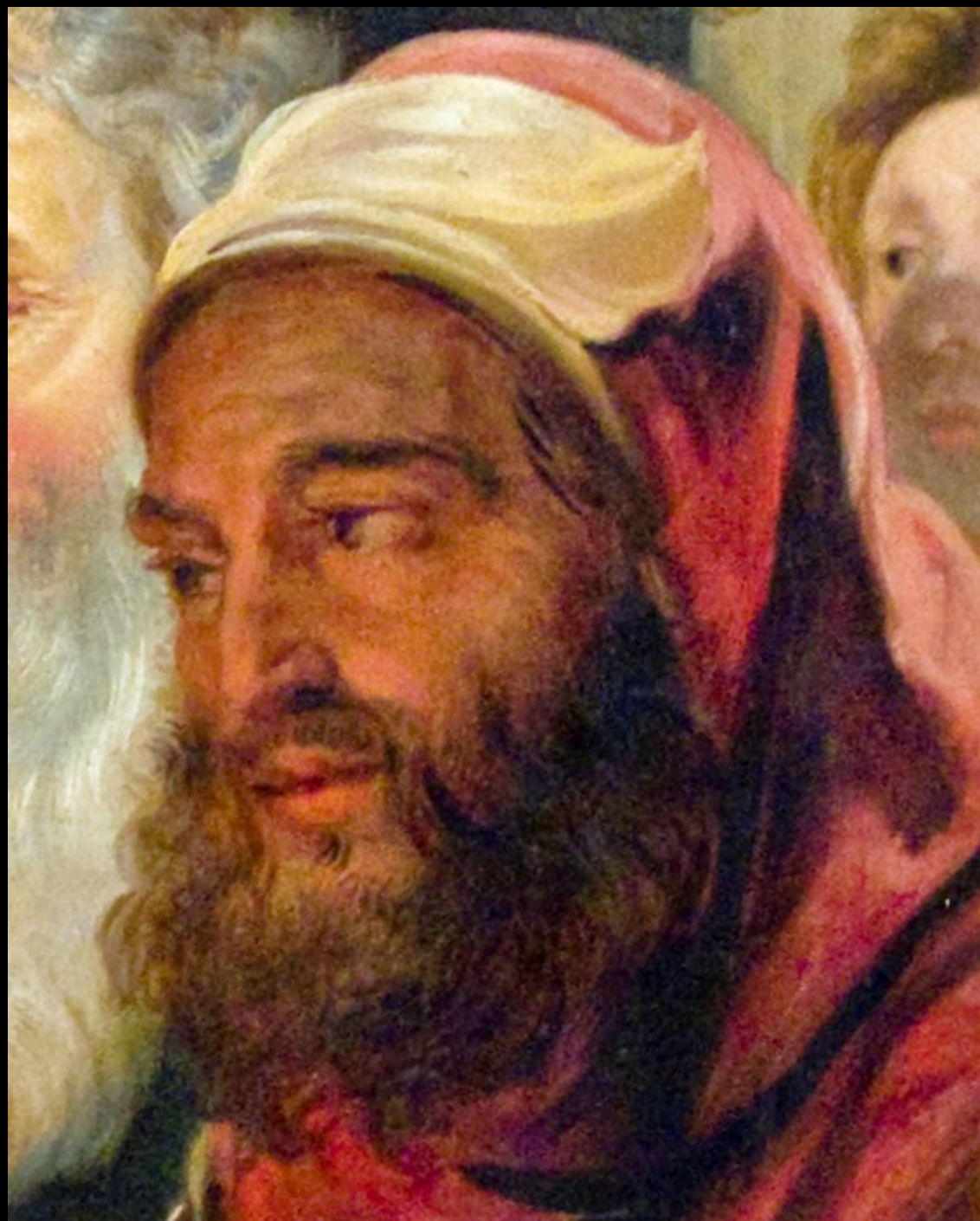
Christ Instructing Nicodemus (detail) Jacob Jordaens Royal Museum Brussels, Belgium