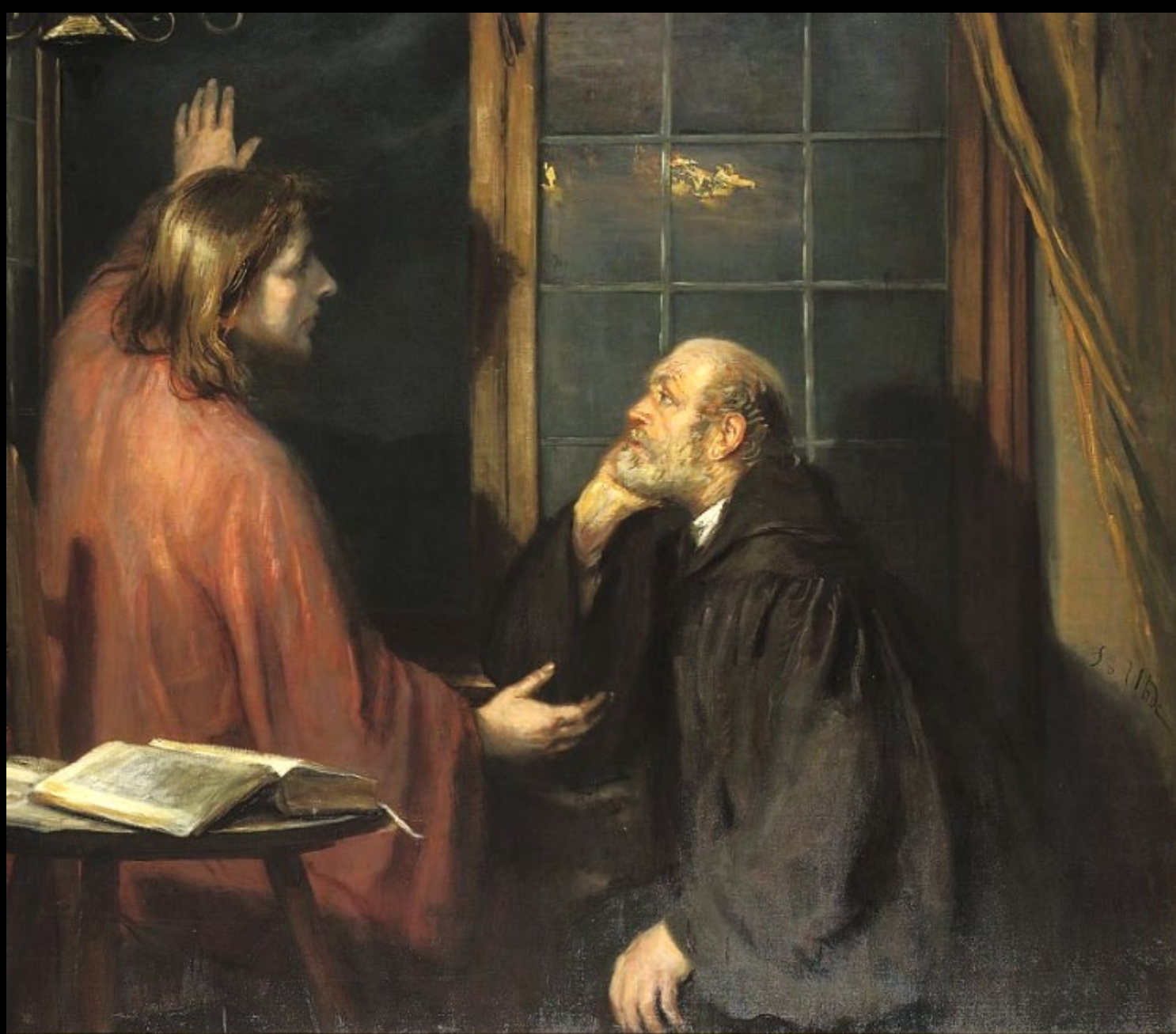
Nicodemus and Christ -- Fritz von Uhde