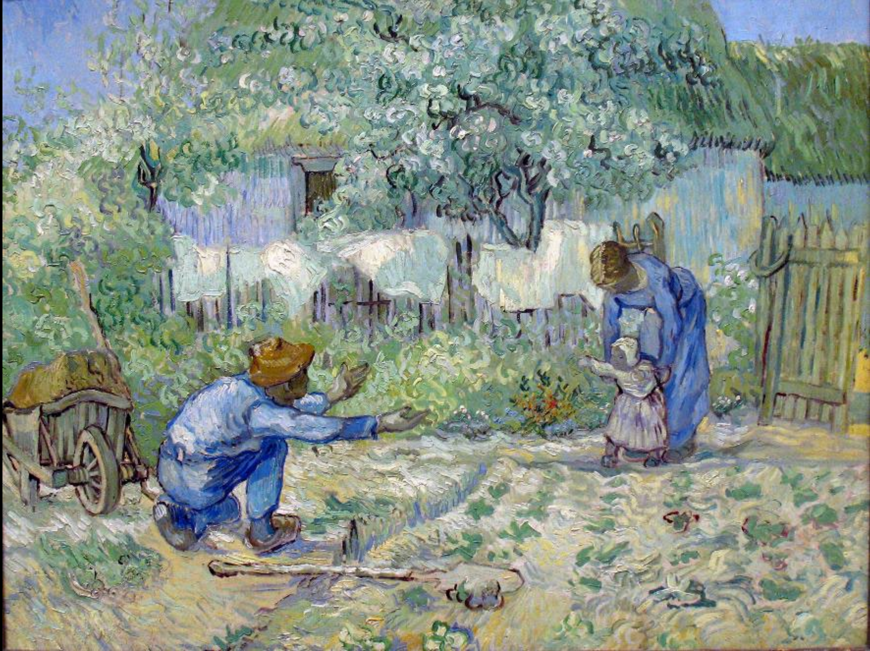
First Steps -- Vincent Van Gogh, Metropolitan Museum of Art, New York