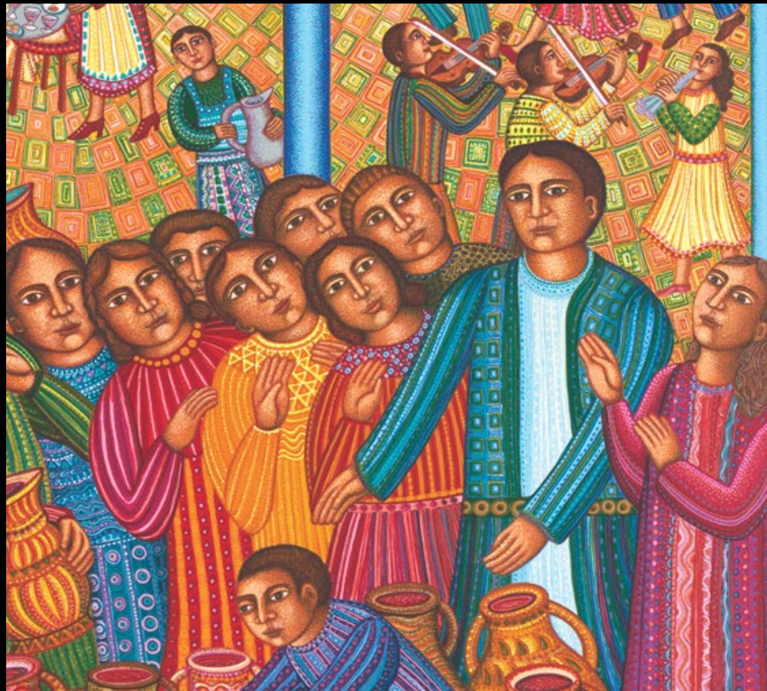
Wedding at Cana