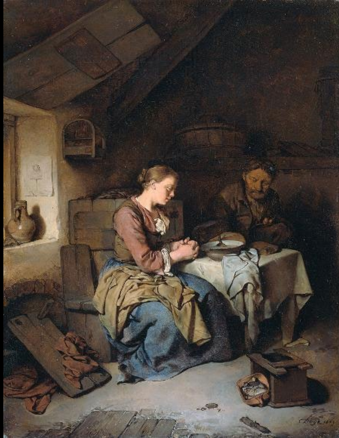
Saying Grace Cornelis Bega Rijksmuseum Amsterdam, Netherlands