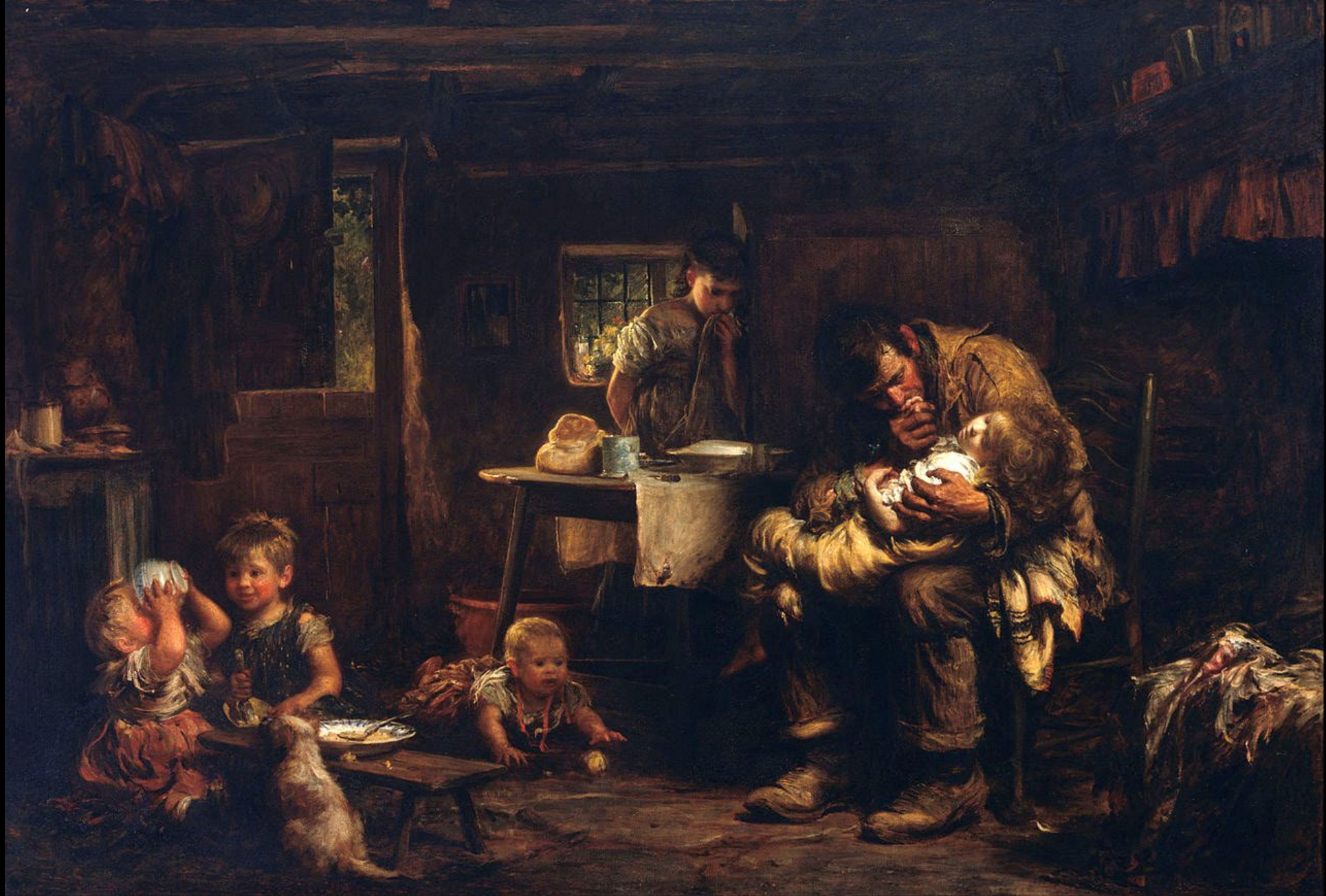
The Widower -- Luke Fildes, Art Gallery of New South Wales, Sydney, Australia