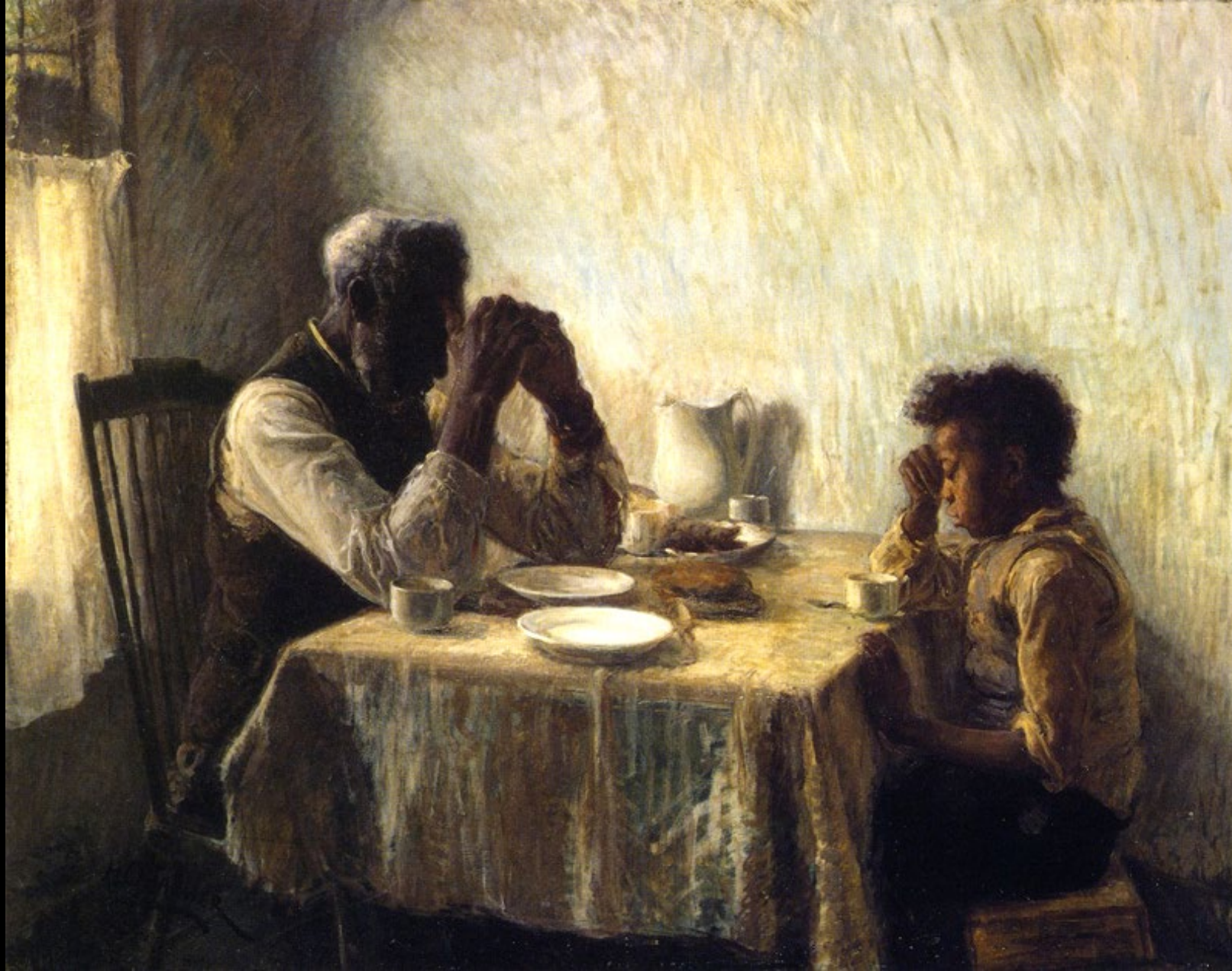
Thankful -- Henry Ossawa Tanner