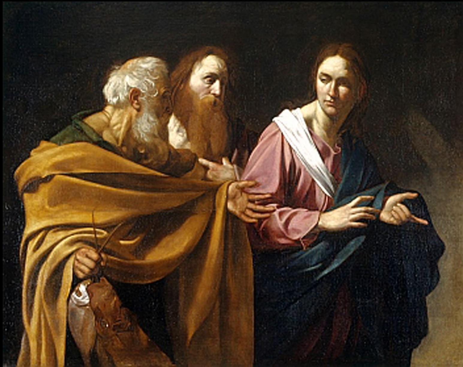
The Calling of Andrew and Simon Peter -- follower of Caravaggio, Buckingham Palace, London