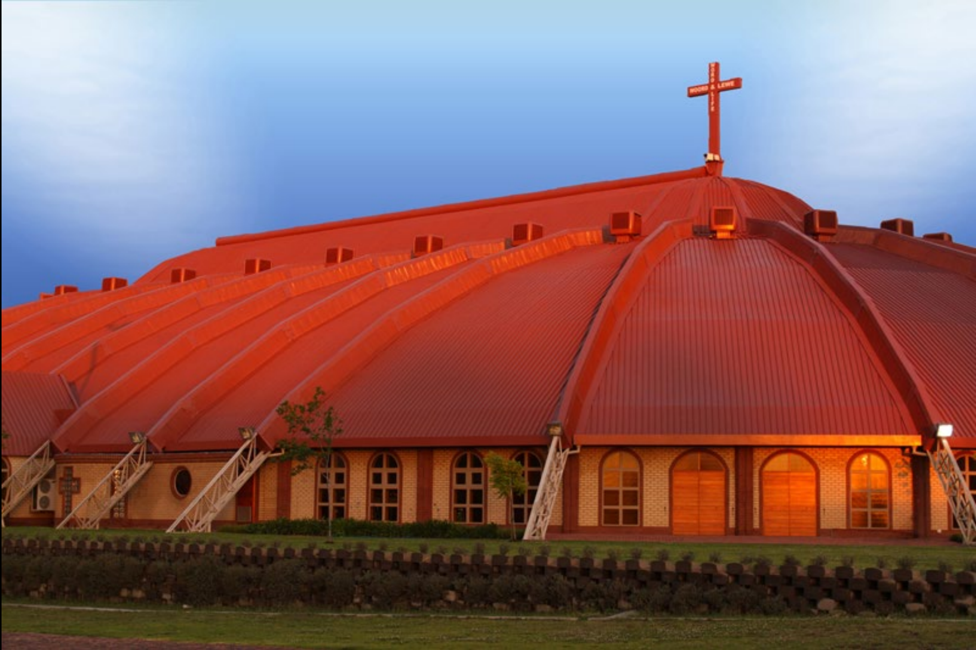
Apostolic Faith Mission Word and Life Church -- Boksburg, South Africa