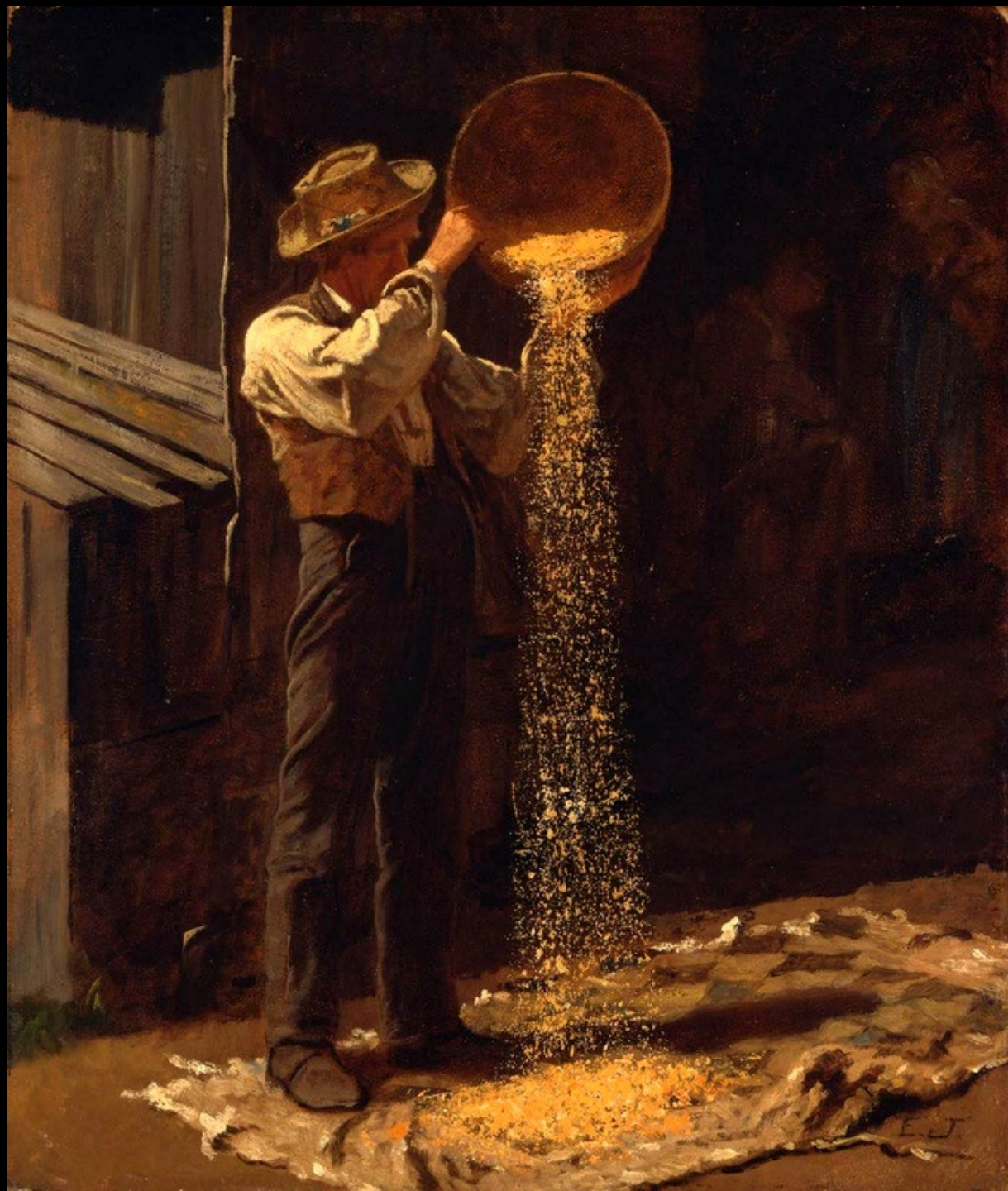
Winnowing Grain Eastman Johnson Museum of Fine Arts, Boston, MA