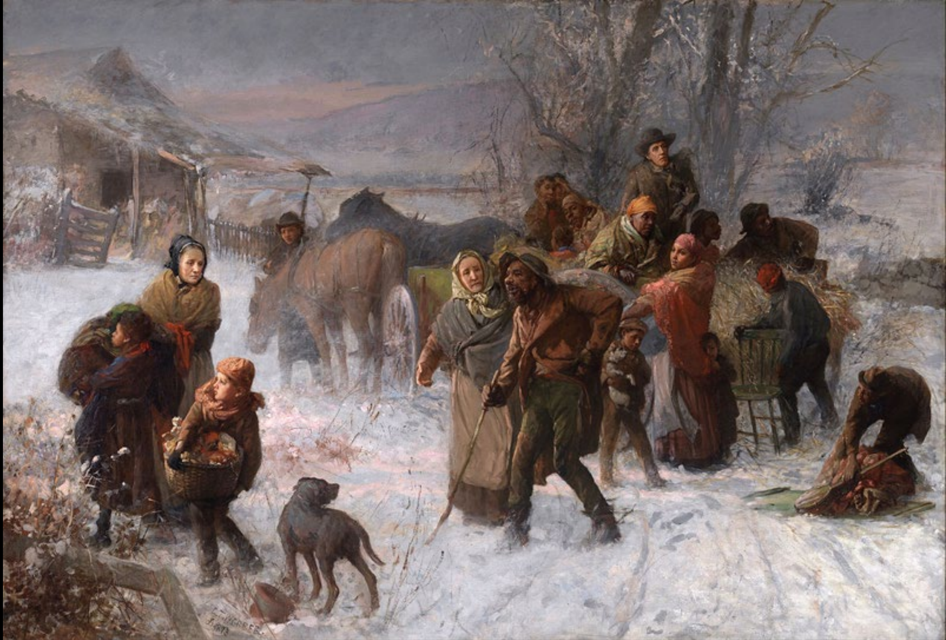
Underground Railroad -- Charles Webber, Cincinnati Art Museum, Cincinnati, OH