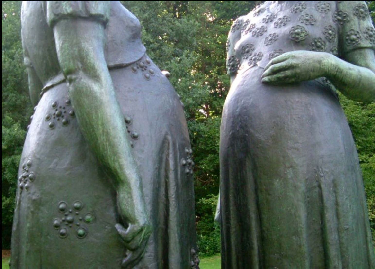
Two Women -- Charles LePlae, Openluchtmuseum, Antwerp, Belgium