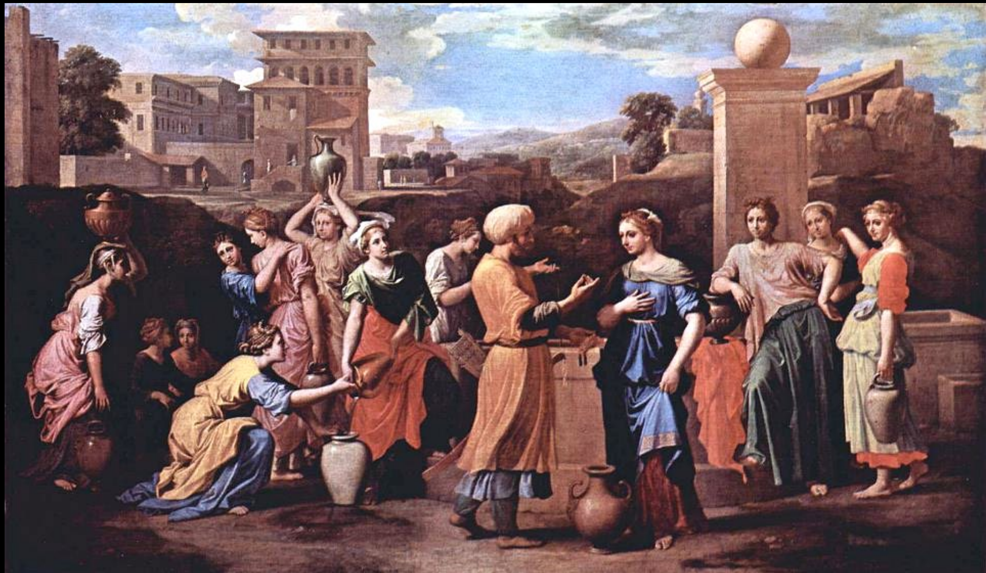
Rebecca at the Well -- Nicolas Poussin, Louvre Museum, Paris, France