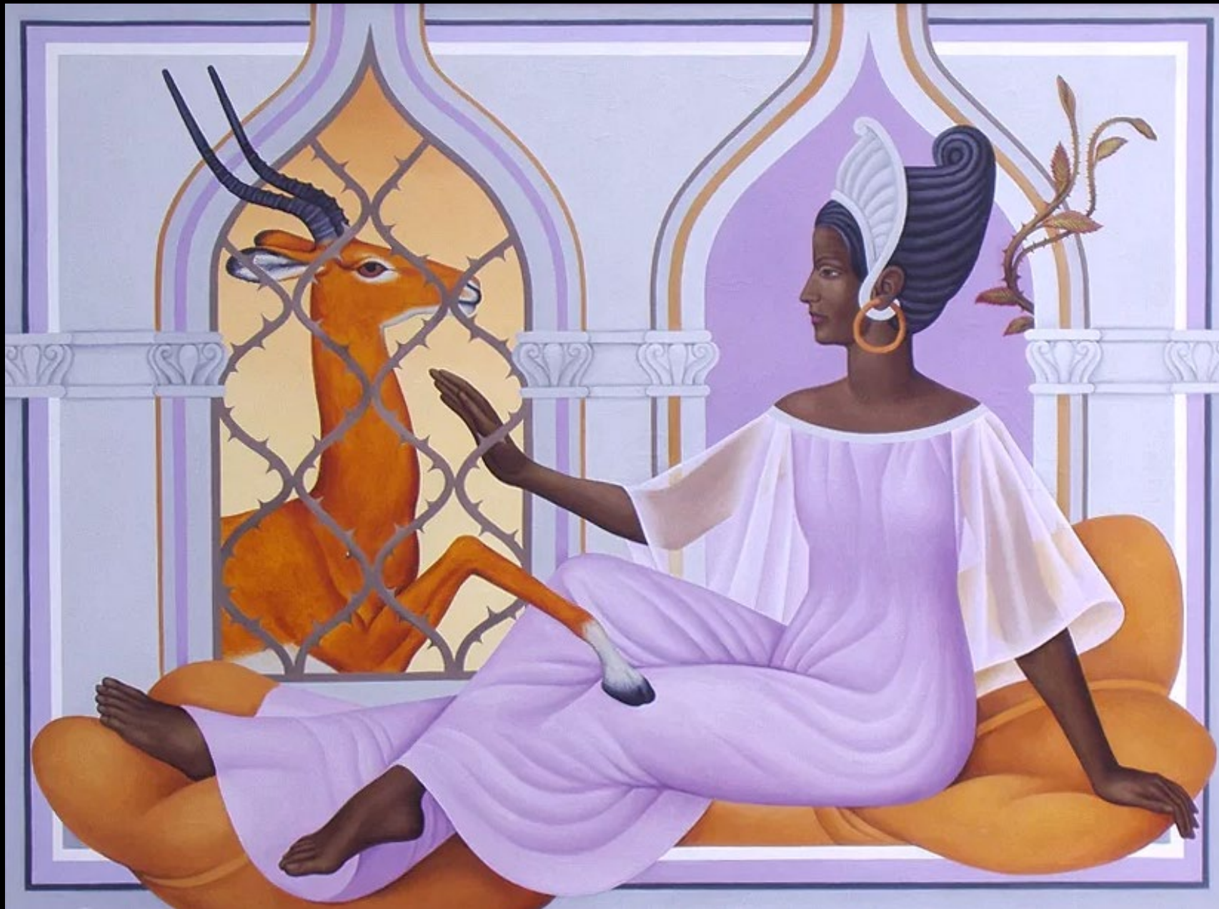
Lattice Window – Song of Solomon -- Peter Koenig