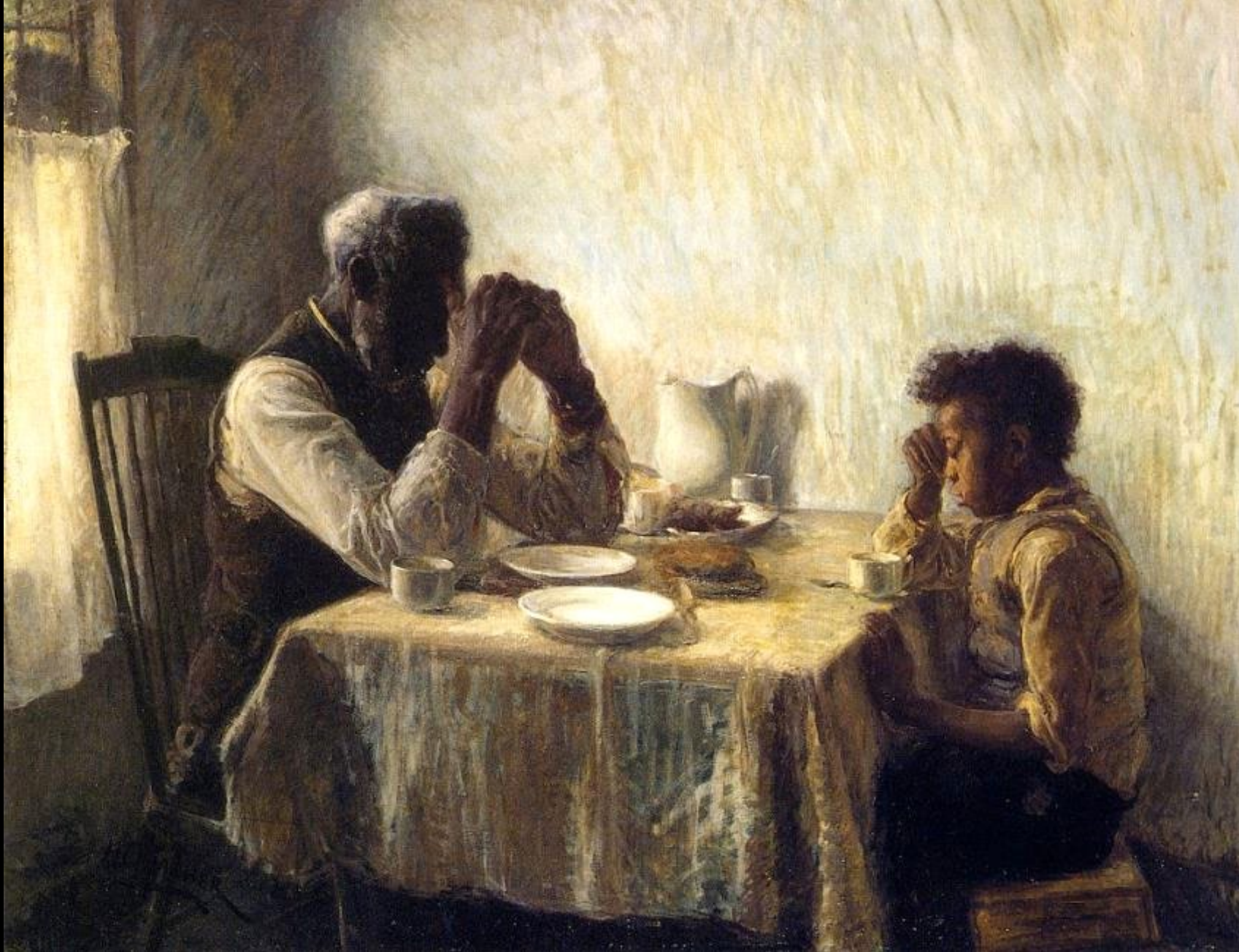
The Thankful Poor -- Henry Ossawa Tanner