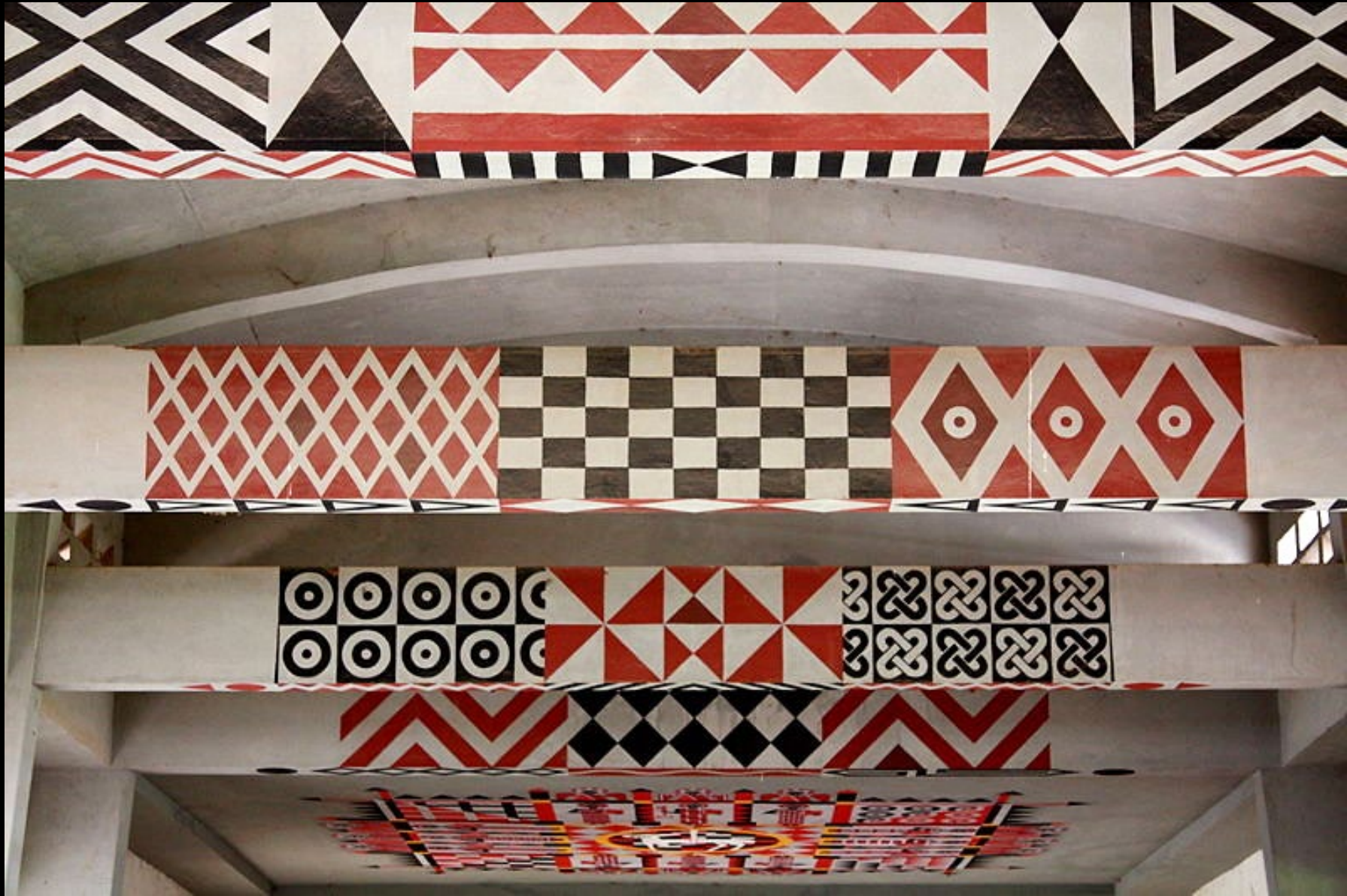
Ceiling of Keur Moussa Abbey, Senegal