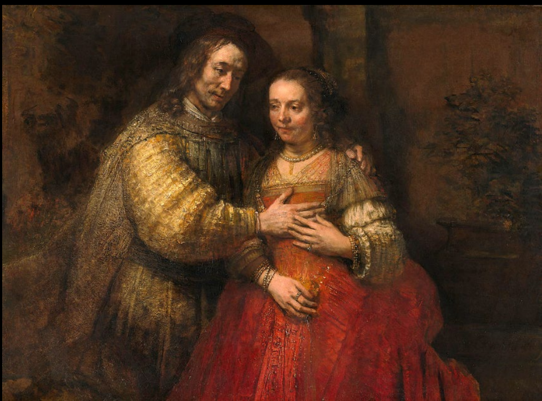
Isaac and Rebecca -- Rembrandt, Rijksmuseum, Amsterdam, Netherlands