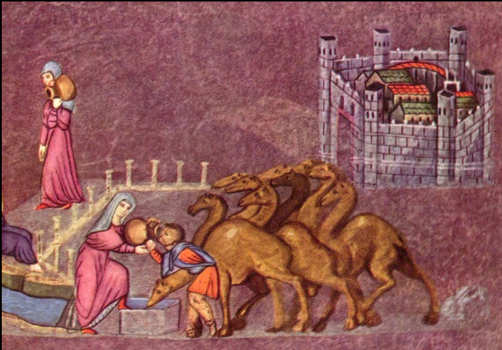
Rebecca at the Well -- Österreichische Nationalbibliothek, Vienna, Austria