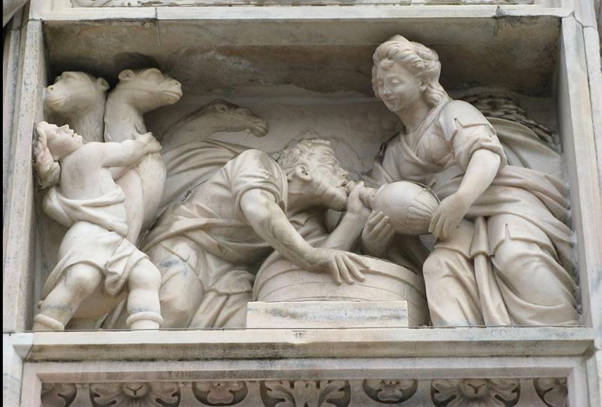
Isaac's Messenger Drinks from Rebecca's Jug -- Duomo, Milan, Italy